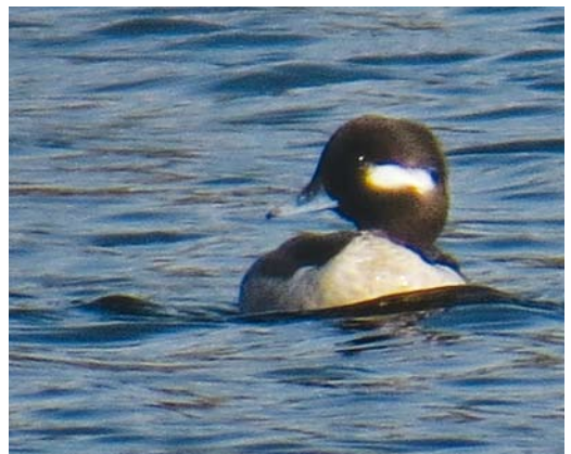
162 Hybrid Greater Spotted x Lesser Spotted Eagle / hybride Bastaardarend x Schreeuwarend Aquila clanga x pomarina , juvenile, La Janda, Cadíz, Spain, 20 December 2015 163 Rufous Turtle Dove / Meenatortel Streptopelia orientalis meena , Espeland, Bergen, Hordaland, Norway, 17 January 2016 164 Striped Crake / Afrikaans Porseleinhoen Aenigmatolimnas marginalis , Córdoba, Spain, 13 January 2016 165 Great Bustard / Grote Trap Otis tarda , Hayogev, Jizreel valley, Israel, 12 December 2015 166 Long-tailed Duck / IJseend Clangula hyemalis , female, Essaouira, Morocco, 4 January 2016 167 Bufflehead / Buffelkoepeend Bucephala albeola , female, Aldeia Nova, Altura, Algarve, Portugal, 10 January 2016