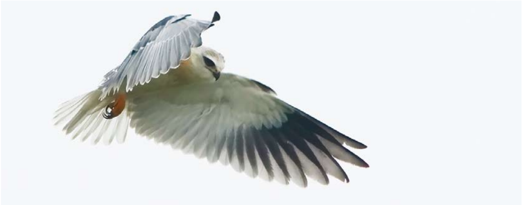
653 Black-winged Kite / Grijze Wouw Elanus caeruleus , juveniel, Maashorst, Noord-Brabant, 4 August 2015 (Michel Veldt)

ond calendar-year, photographed (M van Kleinwee). 2014 26 September, Strand Berkheide, Katwijk, Zuid-Holland, first calendar-year, wearing colour-ring, photographed (E Schouten via B van der Burg).