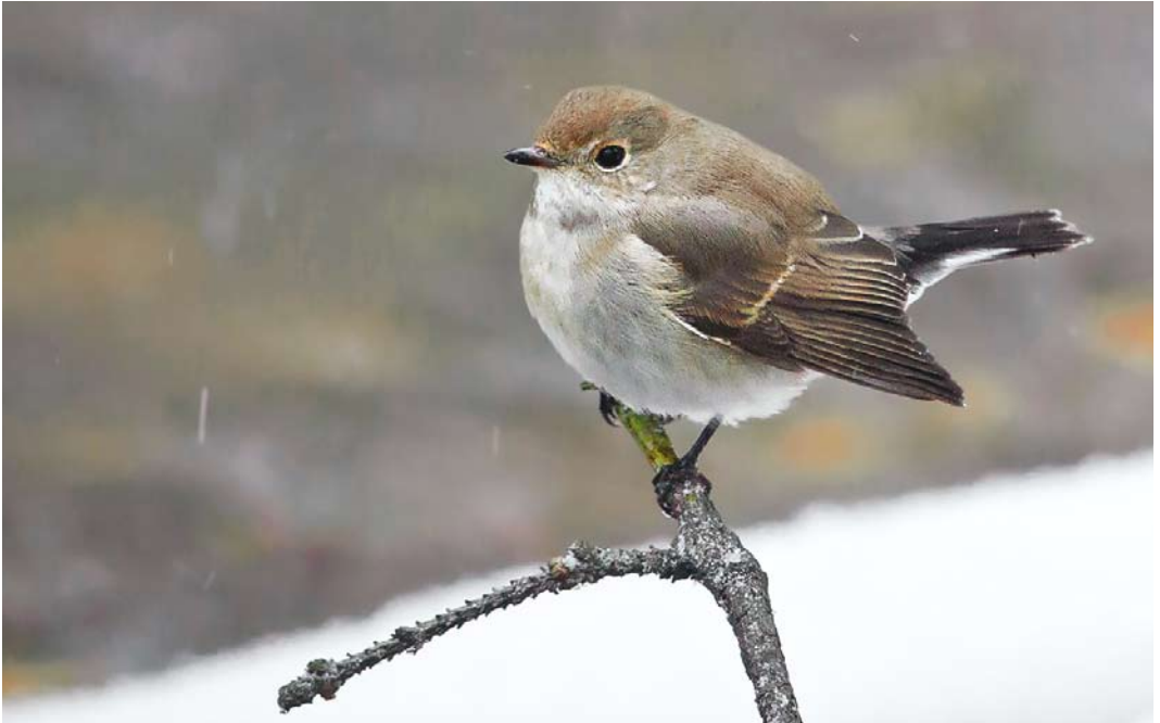
713 Taiga Flycatcher / Taigavliegenvanger Ficedula albicilla , first-winter, Seurasaari, Helsinki, Finland, 2 November 2016