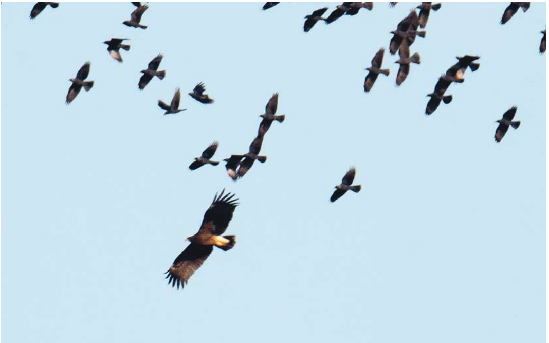
718 Bastaardarend / Greater Spotted Eagle Aquila clanga , juveniel, met Kauwen / Western Jackdaws Corvus monedula , De Hamert, Limburg, 16 oktober 2016 (Patrick Palmen)