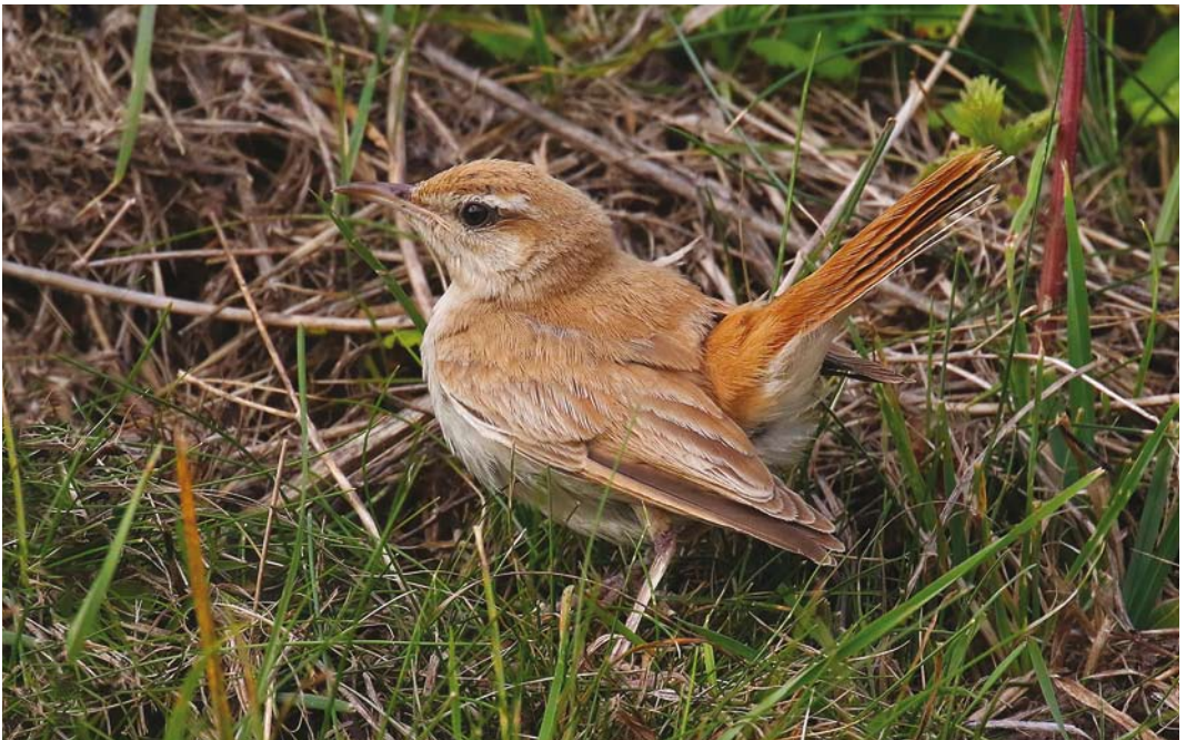
736 Rosse Waaiersstaart / Rufous-tailed Scrub Robin Cercotrichas galactotes , Maasvlakte, Zuid-Holland, 20 september 2016 (Wietze Janse)