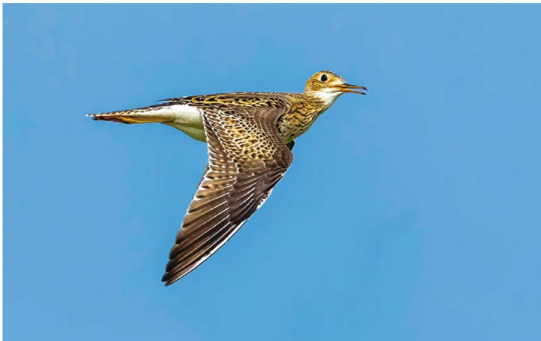
675 Upland Sandpiper / Bartrams Ruitter Bartramia longicauda , first-winter, Corvo, Azores, 11 October 2016 (Vincent Legrand)