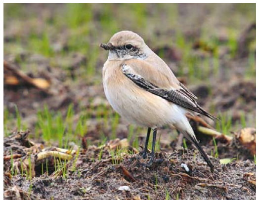
723 Raddes Boszanger / Radde's Warbler Phylloscopus schwarzi , Kobbeduinen, Schiermonnikoog, Friesland, 3 oktober 2016 (Alwin van Lübeck) 724 Kleine Spotvogel / Booted Warbler Iduna caligata , eerste-winter, Maasvlakte, Zuid-Holland, 6 september 2016 (Rob Half) 725 Alpengierzwaluw / Alpine Swift Apus melba , Hazenwater, Leusden, Utrecht, 1 oktober 2016 (Marc Dijksterhuis) 726 Vermoedelijke Stejnegers Roodborstapuit / presumed Stejneger's Stonechat Saxicola stejnegeri , eerste-winter mannetje, Kroonspolders, Vlieland, Friesland, 9 oktober 2016 (Merel Zweemer) 727 Daurische Klauwier / Daurian Shrike Lanius isabellinus , eerste-winter, Everdingen, Utrecht, 22 oktober 2016 (Alex Bos) 728 Woestijntapuit / Desert Wheatear Oenanthe deserti , eerste-winter mannetje, Oorsprongweg, Texel, Noord-Holland, 15 oktober 2016 (Eric Menkveld)