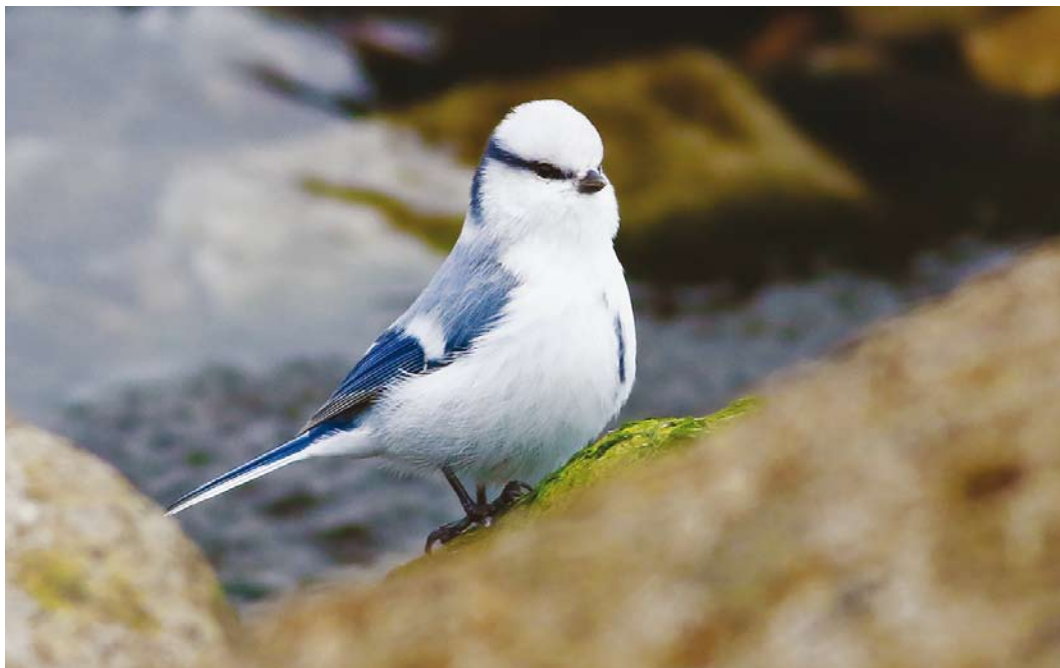
711 Azure Tit / Azuurmees Cyanistes cyanus , Grönhögen, Mörbylånga, Öland, Sweden, 13 October 2016 (Jonas Bonnedahl)