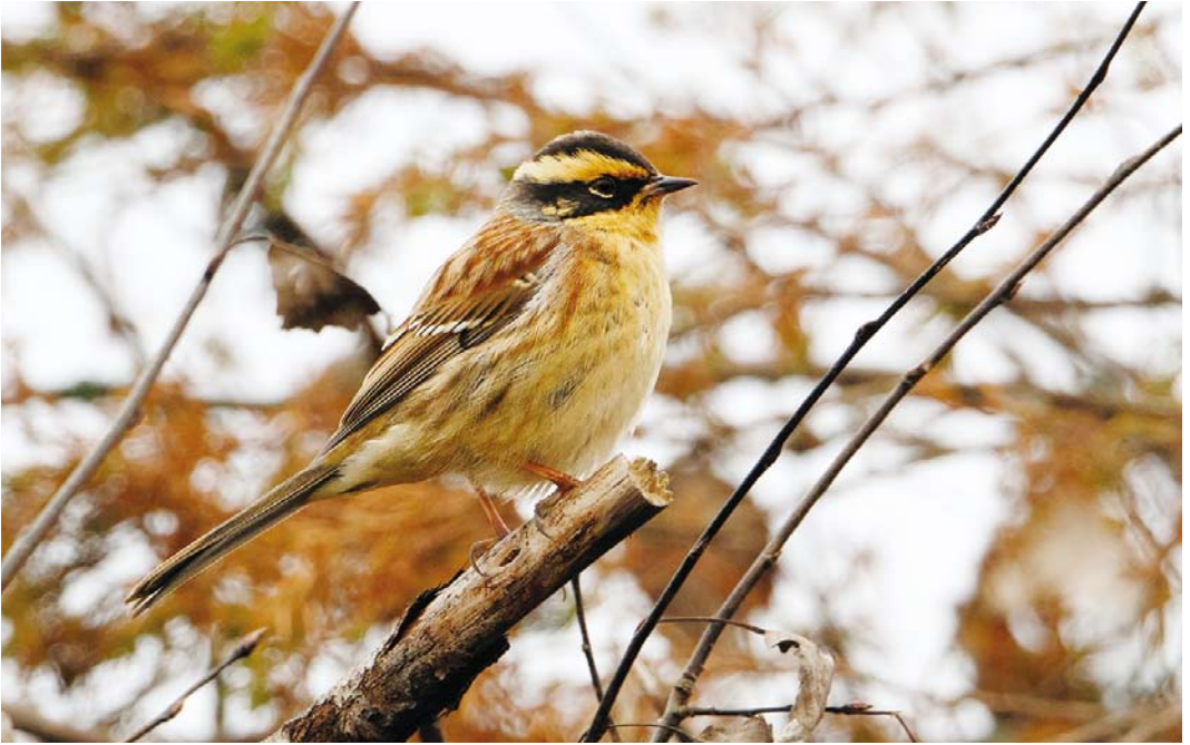
699 Siberian Accentor / Bergheggenmus Prunella montanella , Inkoo, Finland, 16 October 2016 (Petteri Hytönen)