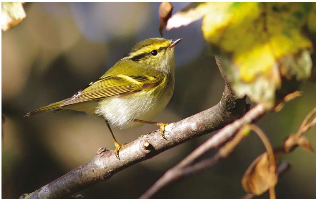
729 Pallas' Boszanger / Pallas's Leaf Warbler Phylloscopus proregulus , Noordwijkerhout, Zuid-Holland, 31 oktober 2016 )