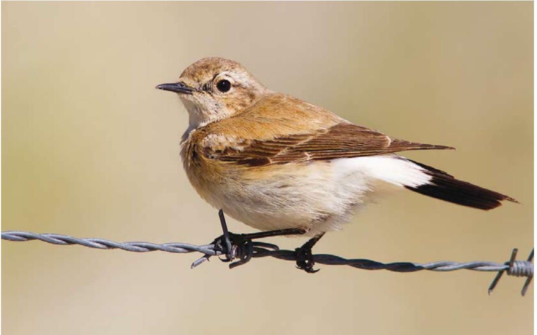
661 Desert Wheatear / Woestijntapuit Oenanthe deserti , female, IJmuiden, Noord-Holland, 27 April 2015 (Julian Bosch)