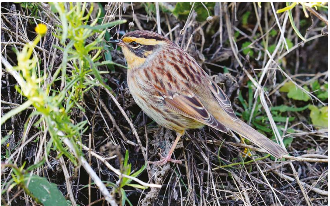
741 Bergheggenmus / Siberian Accentor Prunella montanella , Maasvlakte, Zuid-Holland, 21 oktober 2016 (René van Rossum)