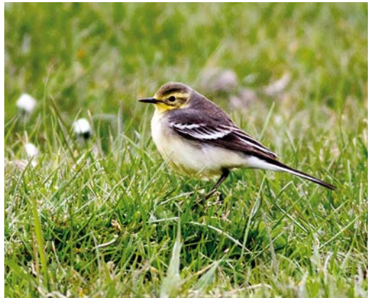
663 Blyth's Pipit / Mongoolse Pieper Anthus godlewskii , Crezéepolder, Ridderkerk, Zuid-Holland, 1 November 2015 (Karel Hoogteyling) 664 Eastern Black-eared Wheatear / Oostelijke Blonde Tapuit Oenanthe melanoleuca , male, Coepelduynen, Noordwijk, 10 June 2015 (René van Rossum) 665 Black-throated Thrush / Zwartkeellijster Turdus atrogularis , female, Loodsmansduin, Texel, Noord-Holland, 17 October 2015 (Debby Doodeman) 666 Citrine Wagtail / Citroenkwikstaart Motacilla citreola , female, Noordervroon, Westkapelle, Zeeland, 19 April 2015 (Thomas Luiten)

Holland, adult, ringed, photographed (R van der Vliet, J Valkenburg); 4 November, Kobbbeduinen, Schiermonnikoog, Friesland, photographed (W M van der Schot, F Padmos).