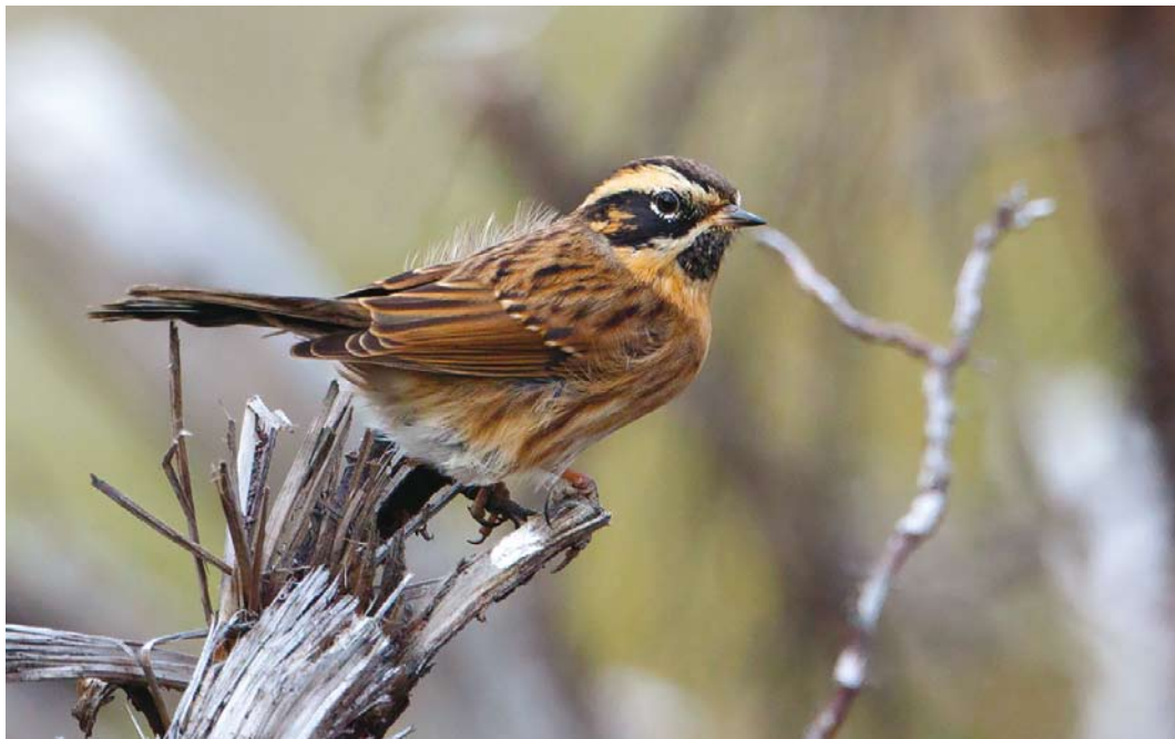
697 Black-throated Accentor / Zwartkeelheggenmus Prunella atrogularis , Vuosaari, Helsinki, Finland, 23 October 2016 (Petteri Hytönen)