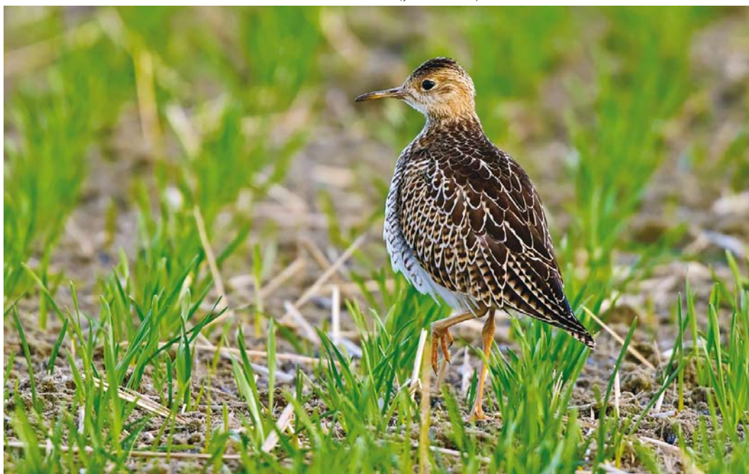
676 Upland Sandpiper / Bartrams Ruitter Bartramia longicauda , first-winter, Leistikälvi, Nakkila, Finland, 3 November 2016