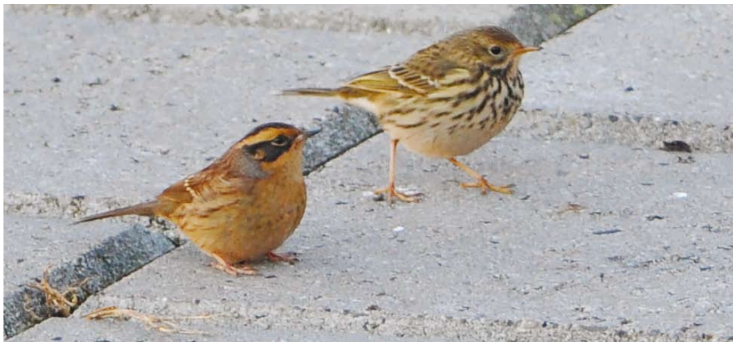
716 Siberian Accentor / Bergheggenmus Prunella montanella , with Meadow Pipit / Graspieper Anthus pratensis , Helgoland, Schleswig-Holstein, Germany, 5 November 2016 (Martin Gottschling)

morphological features supported Magnolia as its father. Up to now, at least 73 known hybrid pairings in American warblers Parulidae have been documented, ie, involving most species (Burrell et al in Wilson J Ornithol 128: 624-628, 2016). In Iceland, Myrtle Warblers S coronata were photographed at Kópavogur, Reykjavík, on 26 September and at Stöðvarfjörður on 5-7 November. A first-winter male Canada Warbler Cardelina canadensis on Corvo on 7 October was the fourth for the WP (previous ones were in Iceland in September 1973, in Ireland in October 2006 and on Corvo in October 2009).