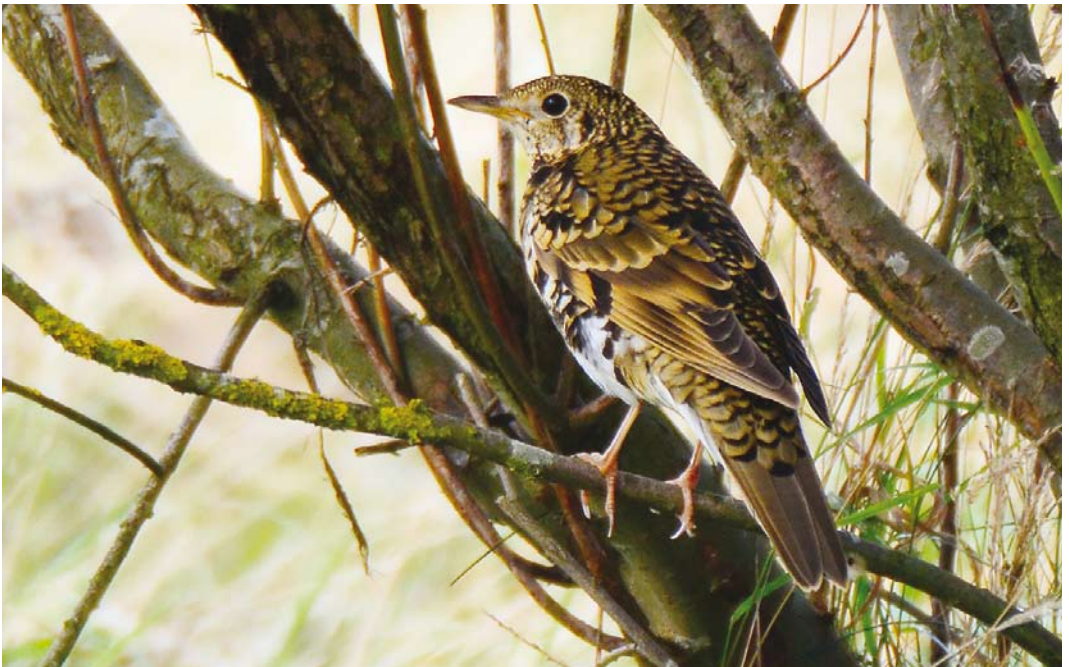
706 White's Thrush / Goudlijster Zoothera aurea , Holy Island, Northumberland, England, 5 October 2016 ( Tim Dean )