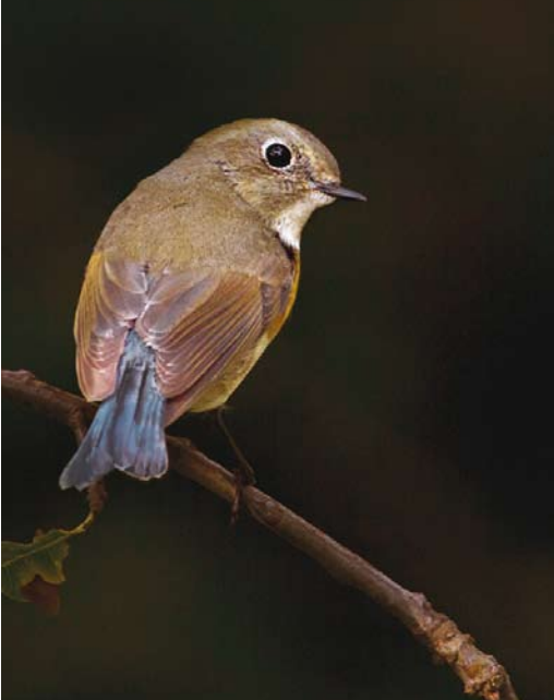
737 Blauwstaart / Red-flanked Bluetail Tarsiger cyanurus , Staatsbossen, De Koog, Texel, Noord-Holland, 16 oktober 2016 (Julian Bosch)