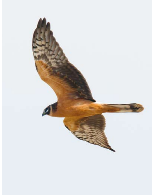
720 Kuifaalscholver / European Shag Phalacrocorax aristotelis , juveniel, Nijmegen, Gelderland, 30 oktober 2016 721 Steppiekiekendief / Pallid Harrier Circus macrourus , juveniel, Maasvlakte, Zuid-Holland, 20 september 2016 722 Oosterse Tortel / Oriental Turtle Dove Streptopelia orientalis , eerstejaars, Kroonspolders, Vlieland, Friesland, 30 oktober 2016