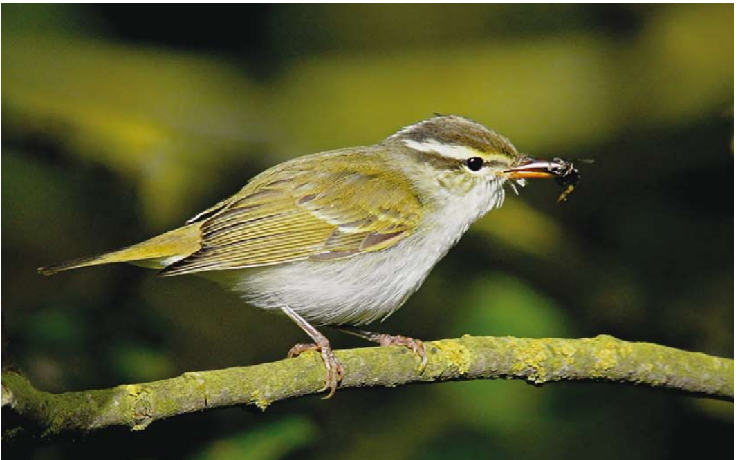
702 Eastern Crowned Warbler / Kroonboszanger Phylloscopus coronatus , Bempton Cliffs, Yorkshire, England, 6 October 2016 ( Steve Nuttall )