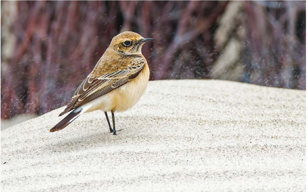
709 Pied Wheatear / Bonte Tapuit Oenanthe pleschanka , first-winter male, Düne, Helgoland, Schleswig-Holstein, Germany, 14 October