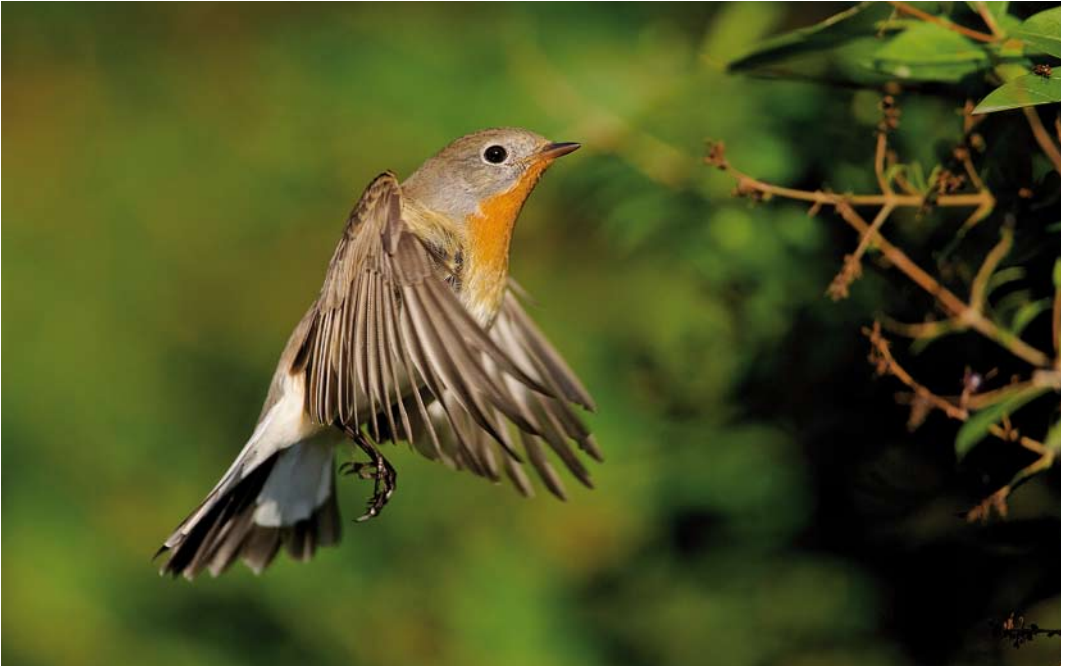
701 Red-breasted Flycatcher / Kleine Vliegenvanger Ficedula parva , adult male, Oostende, West-Vlaanderen, Belgium, 17 October 2016 ( Martin van der Schalk )