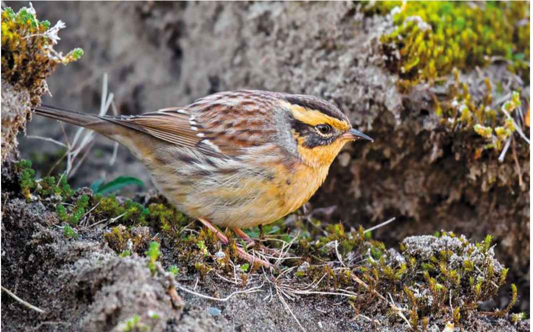
740 Bergheggenmus / Siberian Accentor Prunella montanella , Maasvlakte, Zuid-Holland, 21 oktober 2016 (Frank Dröge)