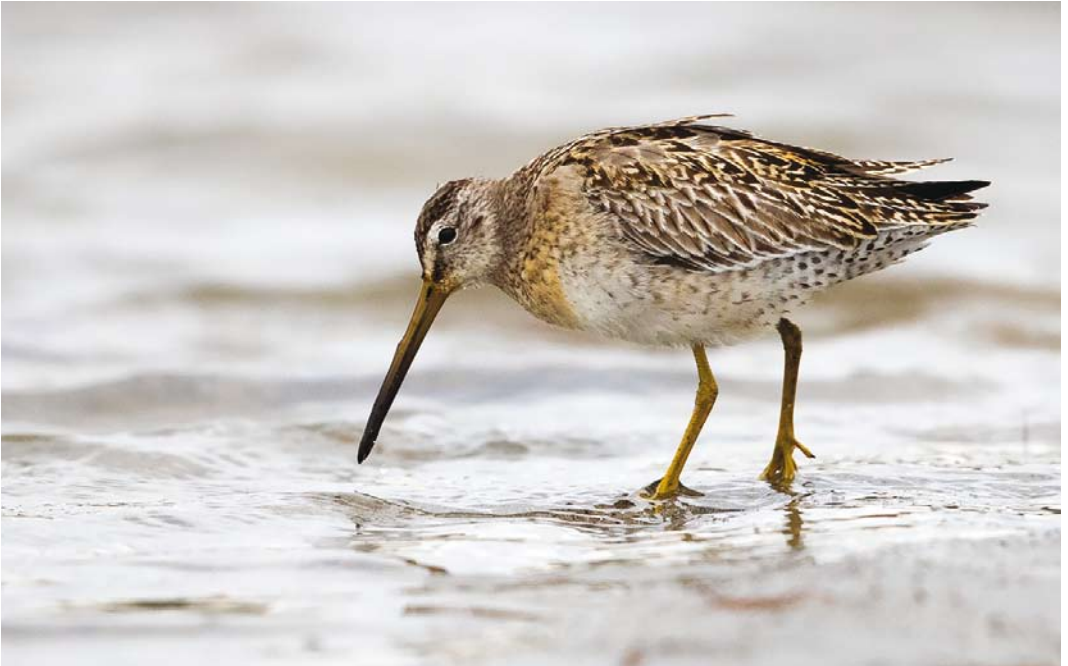
682 Short-billed Dowitcher / Kleine Grijsze Snip Limnodromus griseus , juvenile, Børaunen, Rogaland, Norway, 14 October 2016