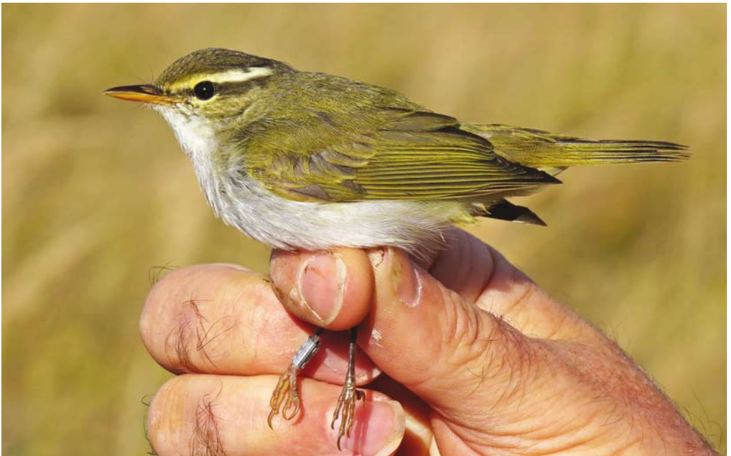
732 Kroonboszanger / Eastern Crowned Warbler Phylloscopus coronatus , Noordhollands Duinreservaat, Castricum, Noord-Holland, 21 oktober 2016