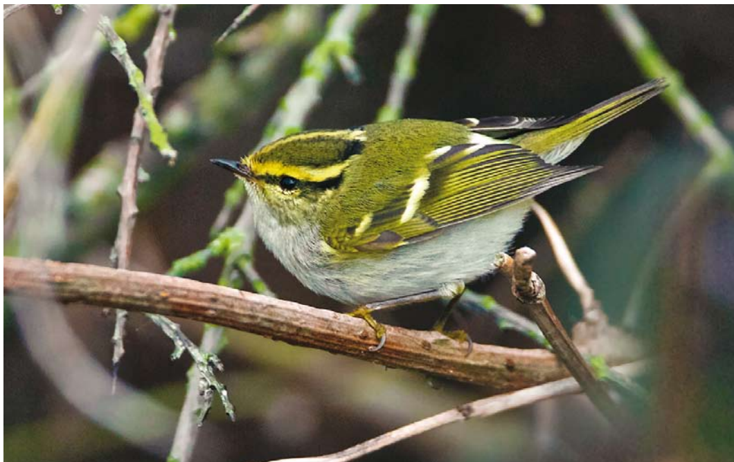
733 Pallas' Boszanger / Pallas's Leaf Warbler Phylloscopus proregulus , Maasvlakte, Zuid-Holland, 28 oktober 2016 (Martin van der Schalk)