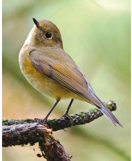
738 Blauwstaart / Red-flanked Bluetail Tarsiger cyanurus , Staatsbossen, De Koog, Texel, Noord-Holland, 15 oktober 2016

bij Groesbeek, Gelderland. Daarnaast werden vogels waargenomen van 12 tot 26 september in de Engbertsdijkvenen, Overijssel; op 20 september bij Castelree, Noord-Brabant; en op 1 oktober bij Ridderkerk, Zuid-Holland.