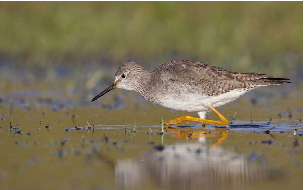
648 Lesser Yellowlegs / Kleine Geelpootruiter Tringa flavipes , Schokland, Flevoland, 27 February 2015