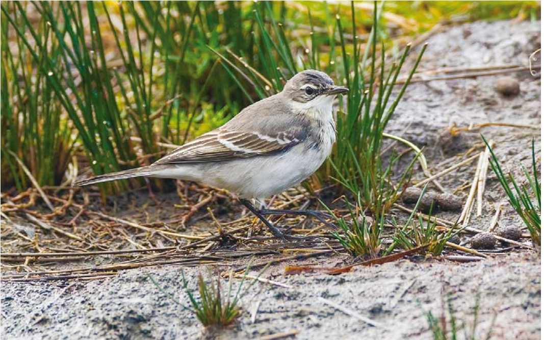
707 Alaskan/Siberian Yellow Wagtail / Alskakwikstaart/Siberische Kwikstaart Motacilla tschutschensis/plexa , first-winter, St Mary's, Scilly, England, 16 October 2016 ( Richard Stonier )