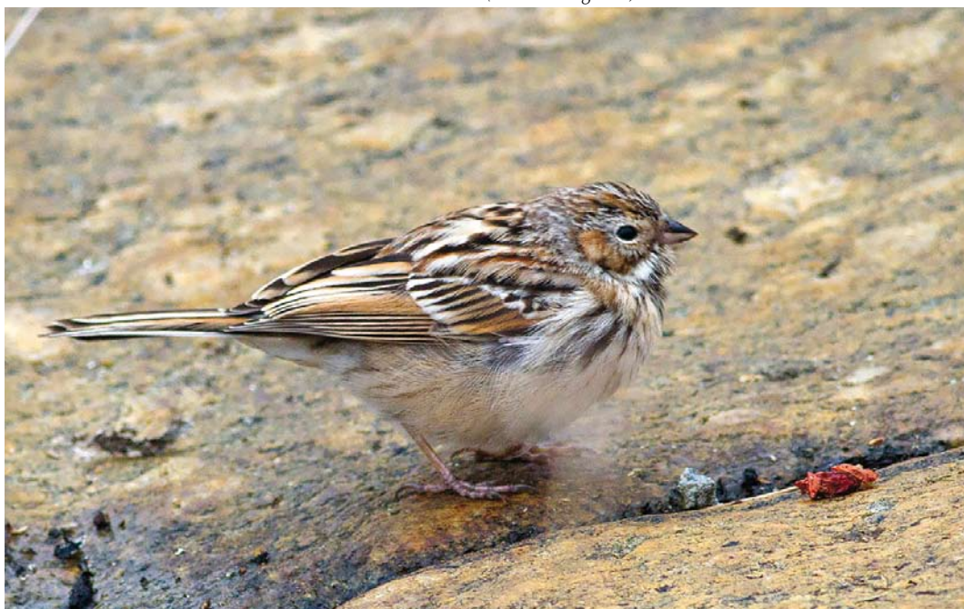
712 Pallas's Reed Bunting / Pallas' Rietgors Emberiza pallasi , first-winter, Horssten, Uppland, Sweden, 15 October 2016 (Anders Haglund)