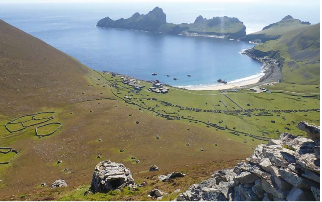
670-671 Hirta, St Kilda, Scotland, 26 August 2014 ( Peter de Vries ). St Kilda Wren Troglodytes troglodytes hirtensis breeds between the remains of the former village.