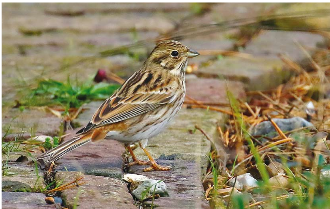
734 Witkopgors / Pine Bunting Emberiza leucocephalos , Oost-Vlieland, Vlieland, Friesland, 21 oktober 2016