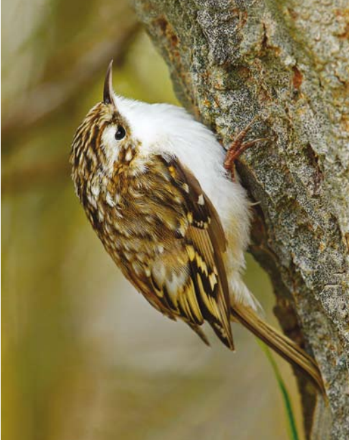
739 Taigaboomkruiper / Eurasian Treecreeper Certhia familiaris , Robbenjager, Texel, Noord-Holland, 21 oktober 2016 (Eric Menkveld)

Europa en daarmee mochten we ons uiteindelijk nog gelukkig prijzen met een enkel geval van de soort.