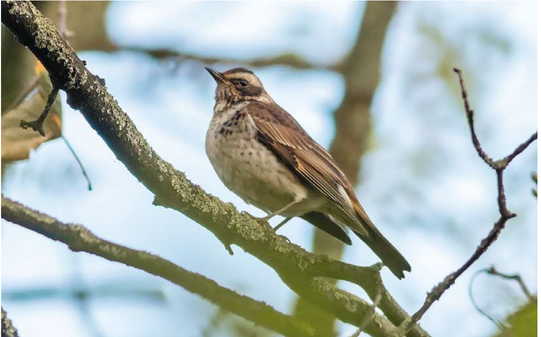
742-743 Vermoedelijke Bruine Lijster / presumed Dusky Thrush Turdus eunomus , eerstejaars vrouwtje, Beijum, Groningen, Groningen, 8 november 2016