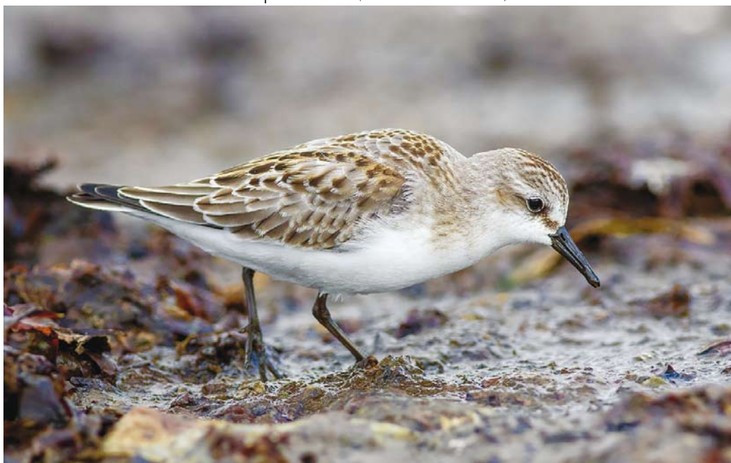
681 Red-necked Stint / Roodkeelstrandloper Calidris ruficollis , first-winter, Håstrand, Rogaland, Norway, 23 September 2016 (Trond Ove Stakkeland)