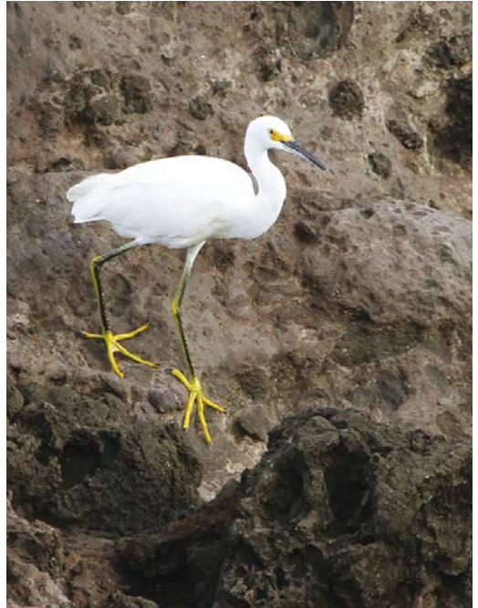
677 Levant Sparrowhawk / Balkansperwer Accipiter brevipes , juvenile, Buskett, Malta, 27 September 2016 ( Raymond Galea ) 678 Snowy Egret / Amerikaanse Kleine Zilverreiger Egretta thula , Santa Cruz da Flores, Flores, Azores, 19 October 2016 ( Zbigniew Kajzer ) 679 Thick-billed Murre / Kortbekzeekoet Uria lomvia , Anstruther, Fife, Scotland, 26 September 2016 ( John Anderson )