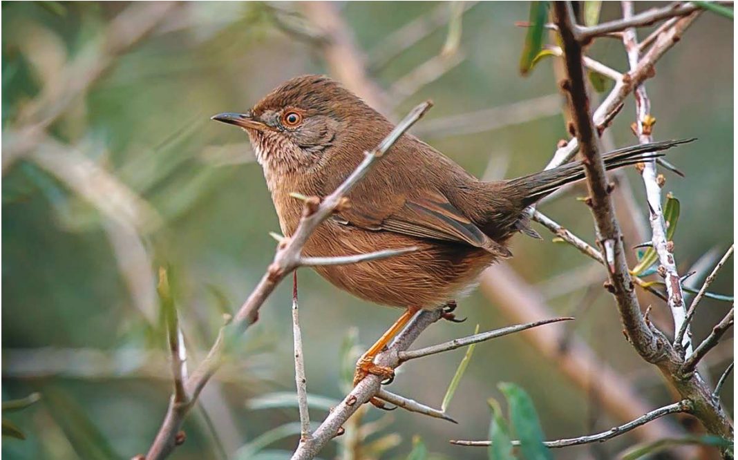
735 Provençaalse Grasmus / Dartford Warbler Sylvia undata , Tweede Maasvlakte, Zuid-Holland, 26 oktober 2016 (Toy Janssen)