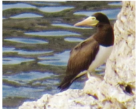
684 Pygmy Cormorant / Dwergaalscholver Phalacrocorax pygmeus , first-winter, De Blankaart, Diksmuide, West-Vlaanderen, Belgium, 20 September 2016 cf Dutch Birding 38: 401, 2016 685 Steppe Eagle / Stepparend Aquila nipalensis , subadult, La Janda, Cádiz, Spain, 17 October 2016 686 Sora Rail / Soraral Porzana carolina , first-winter, Tresco, Scilly, England, 8 October 2016 687 Brown Booby / Bruine Gent Sula leucogaster , adult female, Cabo de Ares, Sesimbra, Setúbal, Portugal, 25 September 2016

tween 23 September and 2 November. In Portugal, an adult female Brown Booby Sula leucogaster at Sesimbra, Setúbal, remained from 23 July to 5 October and one flew off Peniche on 12 November. In Britain, long-term population changes in 2000-15 included an increase of Northern Gannet Morus bassanus (+34%) and a decline of European Shag Phalacrocorax aristotelis (-34%).