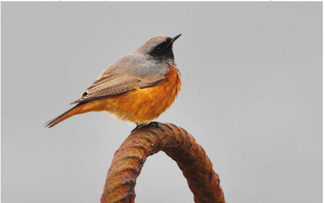
710 Eastern Black Redstart / Oosterse Zwarte Roodstaart Phoenicurus ochruros phoenicuroides , first-winter male, Helgoland, Schleswig-Holstein, Germany, 6 November 2016 ( Martin Gottschling )