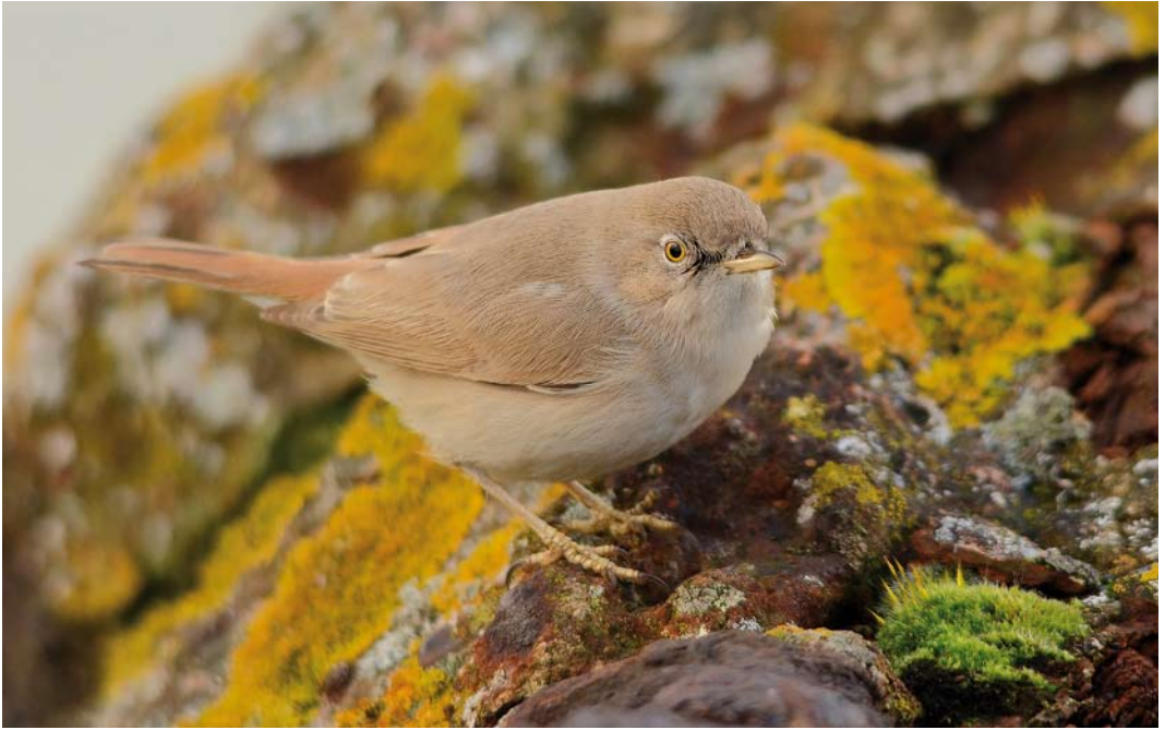
655 Asian Desert Warbler / Woestijngrasmus Sylvia nana , West-Terschelling, Terschelling, Friesland, 16 November 2015 656 Red-tailed Shrike / Turkestaanse Klauwier Lanius phoenicuroides , first-year, Noordhollands Duinreservaat, Castricum, Noord-Holland, 13 November 2014 657 Kleine Spotvogel / Booted Warbler Iduna caligata , first-year, Noordhollands Duinreservaat, Castricum, Noord-Holland, 23 August 2015