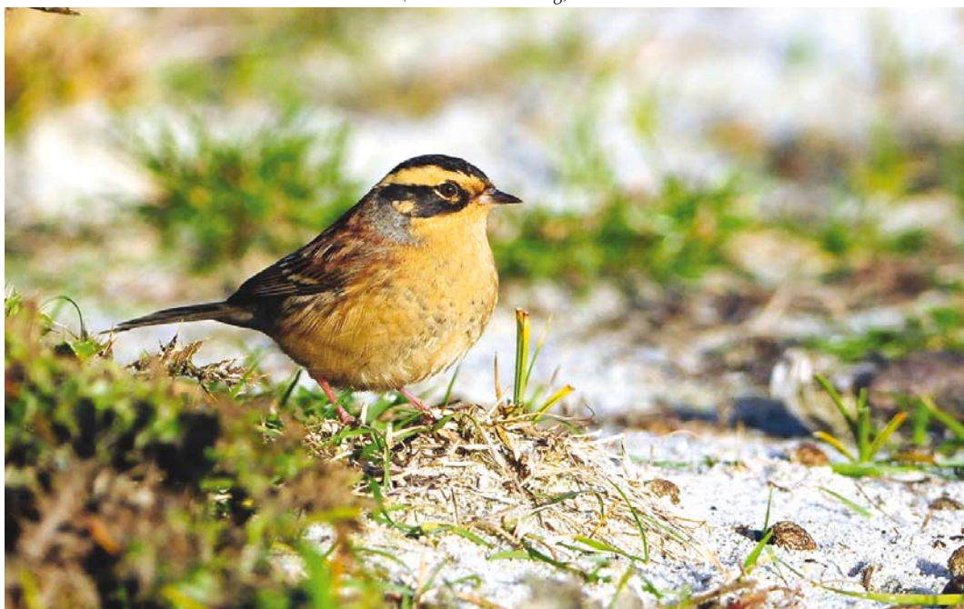
698 Siberian Accentor / Bergheggenmus Prunella montanella , Sylt, Schleswig-Holstein, Germany, 29 October 2016 (Martin Gottschling)