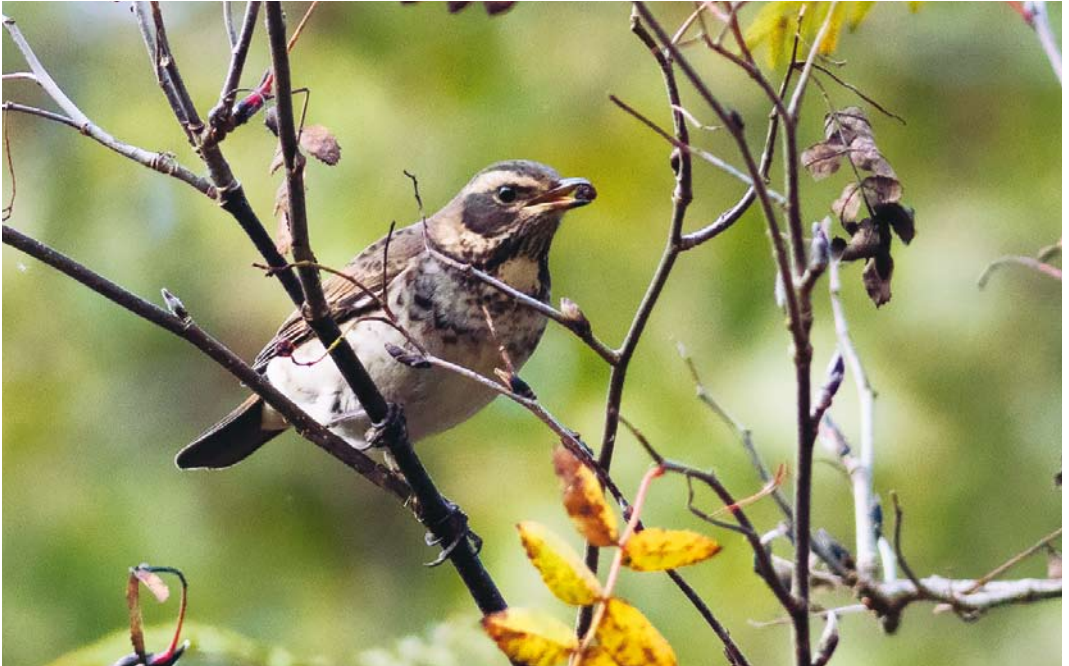
705 Presumed Dusky Thrush / vermoedelijke Bruine Lijster Turdus eunomus , first-winter, Beijum, Groningen, Groningen, Netherlands, 8 November 2016 ( Jos Welbedacht )