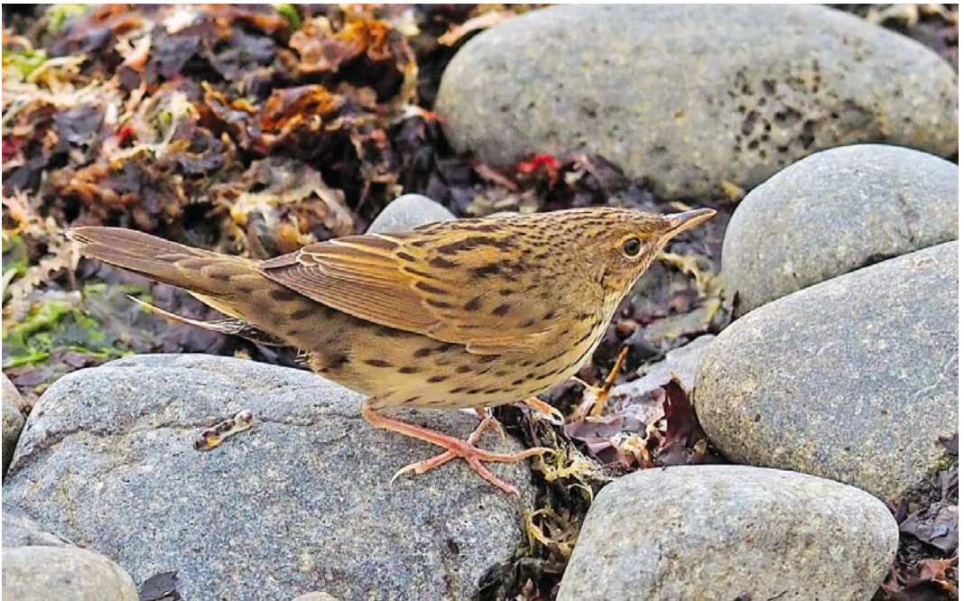
714 Lanceolated Warbler / Kleine Sprinkhaanzanger Locustella lanceolata , Famjin, Suðuroy, Faeroes, 1 October 2016