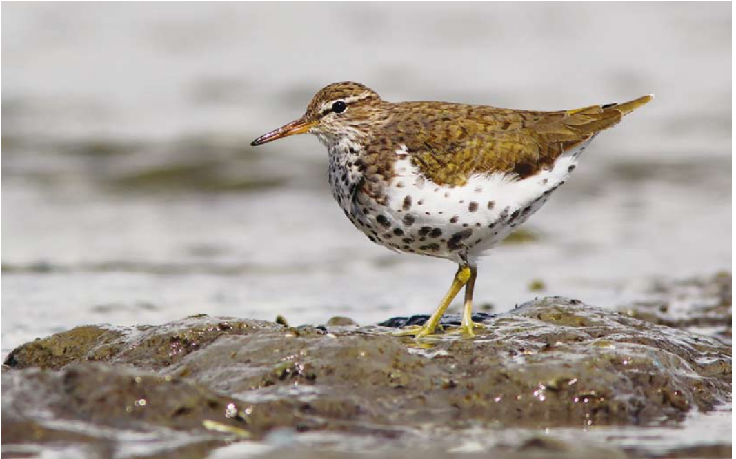
647 Spotted Sandpiper / Amerikaanse Oeverloper Actitis macularia , second calendar-year, Medemblik, Noord-Holland, 28 April 2015