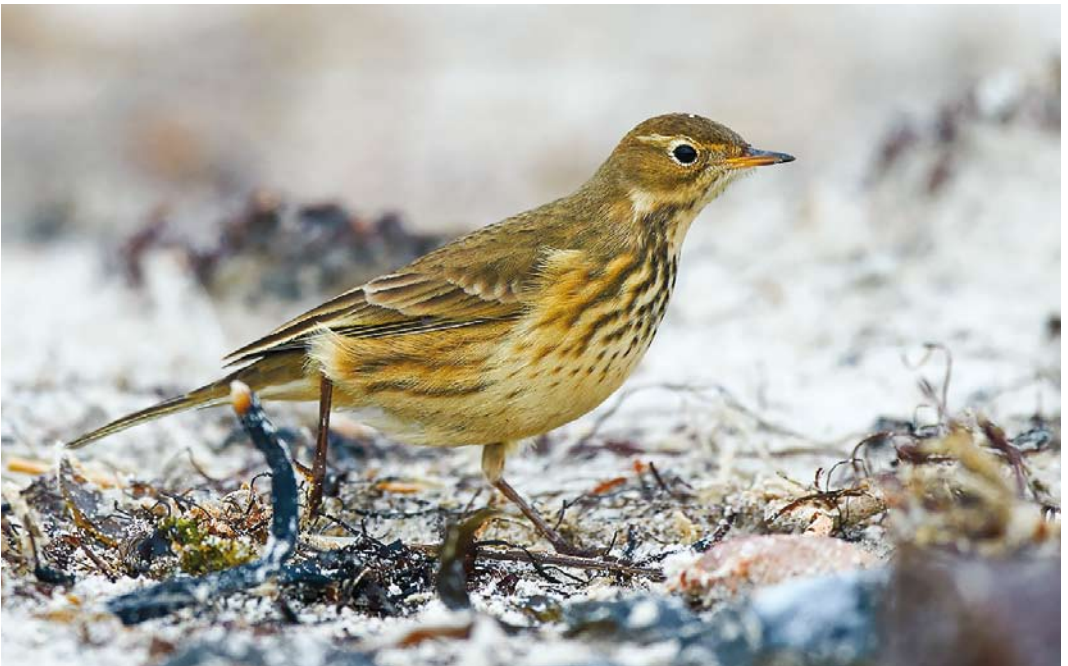
683 American Buff-bellied Pipit / Amerikaanse Waterpieper Anthus rubescens rubescens , Helgoland, Schleswig-Holstein, Germany, 6 November 2016