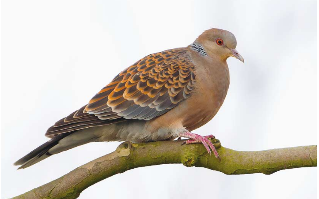
644 Oriental Turtle Dove / Oosterse Tortel Streptopelia orientalis , Vlaardingen, Zuid-Holland, 5 January 2015 (Co van der Wardt) 645 Pallid Swift / Vale Gierzwaluw Apud pallidus , first-year, IJmuiden, Noord-Holland, 8 November 2015 (Jan den Hertog) 646 Great Snipe / Poelsnip Callinago media , Broekhuizen, Limburg, 25 April 2015 (Mariet Verbeek)