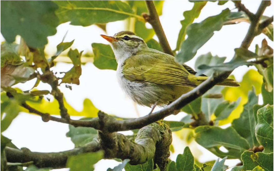
731 Kroonboszanger / Eastern Crowned Warbler Phylloscopus coronatus , Noordhollands Duinreservaat, Castricum, Noord-Holland, 23 oktober 2016 ( Jaap Denee )