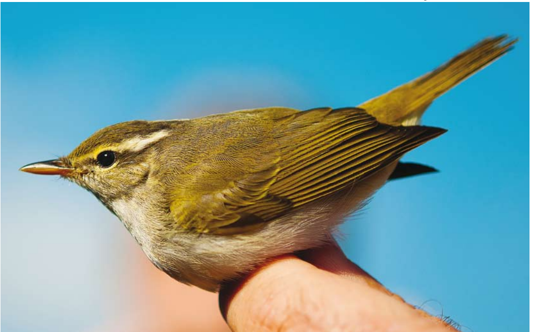
704 Eastern Crowned Warbler / Kroonboszanger Phylloscopus coronatus , Noordhollands Duinreservaat, Castricum, Noord-Holland, Netherlands, 22 October 2016