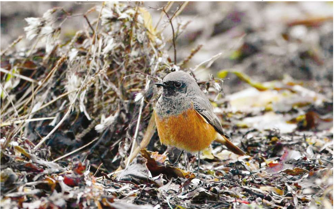
708 Eastern Black Redstart / Oosterse Zwarte Roodstaart Phoenicurus ochruros phoenicuroides , male, Bønnerup Strand, Midtjylland, Denmark, 7 November 2016