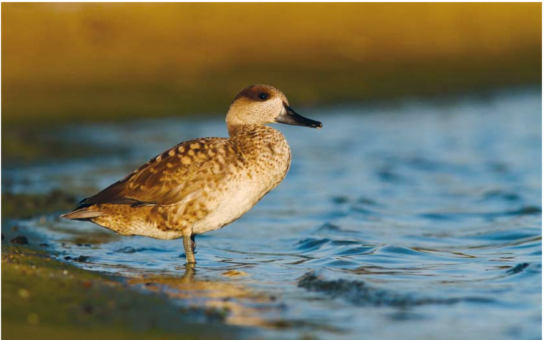
719 Marmereend / Marbled Duck Marmaronetta angustirostris , Huis ter Heide, Noord-Brabant, 24 september 2016 (Marten Miske)