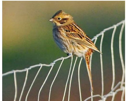
688 Brown Shrike / Bruine Klauwier Lanius cristatus , first-winter, Kilnsea, East Yorkshire, England, 31 October 2016 689 Northern Flicker / Gouden Grondspecht Colaptes auratus , Corvo, Azores, 19 October 2016 690 Siberian Thrush / Siberische Lijster Geokichla sibirica , first-winter male, Uyeasound, Unst, Shetland, Scotland, 6 October 2016 691 Pine Bunting / Witkopgors Emberiza leucocephalos , female, Spiekeroog, Niedersachsen, Germany, 25 October 2016

Fair Isle in August 1994). The first for Iceland, also a juvenile, was present at Bakkatjörn, Seltjarnarnes, on 13-20 October. A first-winter stayed at Vejbystrand, Skåne, Sweden, from 13 to at least 18 November. Clark et al (2016) in Oryx estimated the global population of the critically endangered Spoon-billed Sandpiper C pygmaea in 2014 at 210-228 breeding pairs, with a post-breeding population of 661-718 individuals. The species' population was estimated at 2000-2800 pairs in the 1970s, falling to 1000 pairs in 2000, and to only 120-200 pairs in 2009 (cf Dutch Birding 38: 328, 2016). A Baird's Sandpiper C bairdii photographed at Khemis Zemamra near Oualidia on 28 October was the first for Morocco. In France, Western Sandpipers C mauri were reported at Grand-Lieu, Loire-Atlantique, on 18 September and in Finistère first at Ploudalmézeau on 6-7 October and then probably the same individual at Guissény on 23-25 October. The first Spotted Redshank Tringa