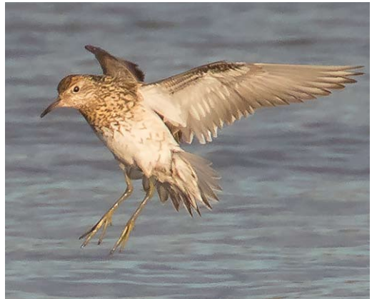
649 American Golden Plover / Amerikaanse Goudplevier Pluvialis dominica , Polder Breebaart, Groningen, 16 May 2015 ( Dušan M Brinkhuizen ) 650 Little Bustard / Kleine Trap Tetrax tetrax , first-winter, Polder Arkemheen, Nijkerk, Gelderland, 24 January 2015 ( Alex Bos ) 651 Thayer's Gull / Thayers Meeuw Larus thayeri , second calendar-year, Egmond aan Zee, Noord-Holland, 12 April 2015 ( Jan van der Laan ) 652 Sharp-tailed Sandpiper / Siberische Strandloper Calidris acuminata , adult, Camperduin, Noord-Holland, 7 September 2015 ( Mattias Hofstede )