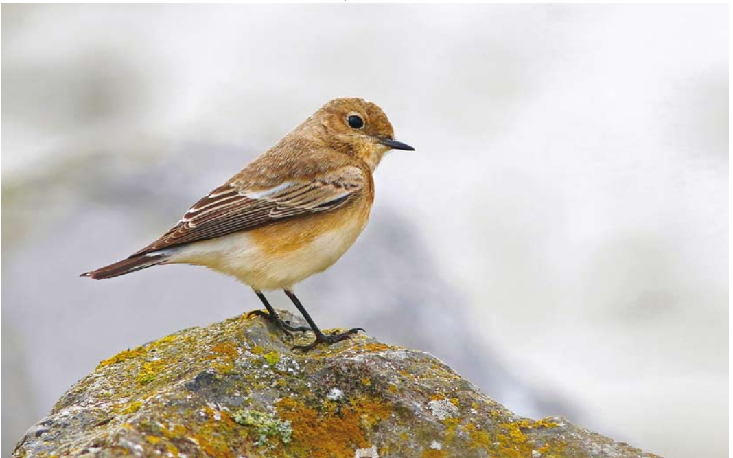
662 Pied Wheatear / Bonte Tapuit Oenanthe pleschanka , female, Schiermonnikoog, Friesland, 23 October 2015 (Thijs Glastra)