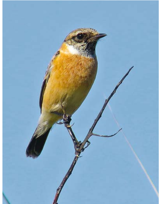
658 Arctic Warbler / Noordse Boszanger Phylloscopus borealis , Franeker, Friesland, 29 October 2015 659 Siberian Stonechat / Aziatische Roodborsttapuit Saxicola maurus maurus , first-year male, Tweede Maasvlakte, Zuid-Holland, 26 September 2015 660 Red-flanked Bluetail / Blauwstaart Tarsiger cyanurus , Coepelduynen, Noordwijk, Zuid-Holland, 10 April 2015