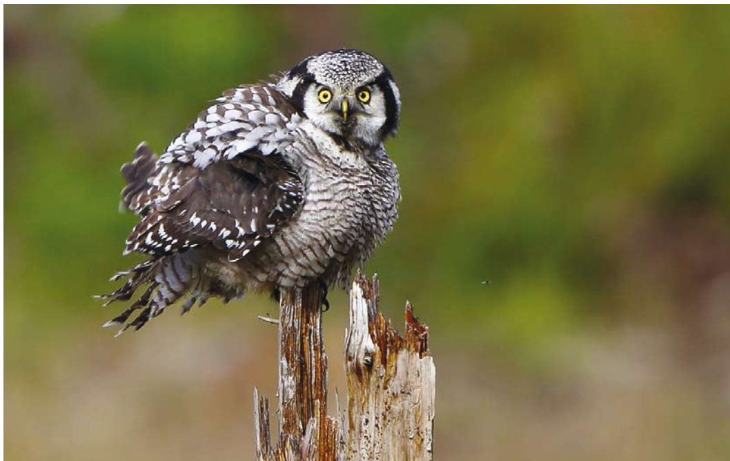
680 Northern Hawk-Owl / Sperweruil Surnia ulula , Gribskov, Nordsjælland, Denmark, 3 October 2016