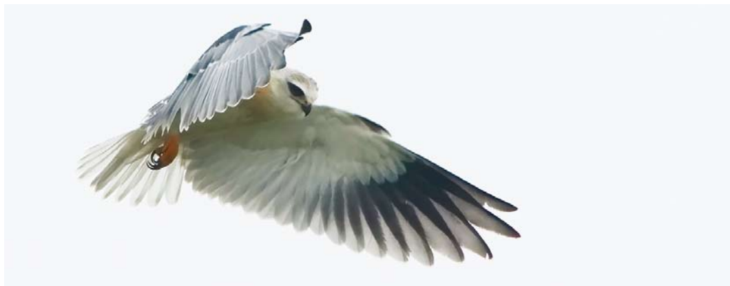
653 Black-winged Kite / Grijze Wouw Elanus caeruleus , juveniel, Maashorst, Noord-Brabant, 4 August 2015 (Michel Veldt)

ond calendar-year, photographed (M van Kleinwee). 2014 26 September, Strand Berkheide, Katwijk, Zuid-Holland, first calendar-year, wearing colour-ring, photographed (E Schouten via B van der Burg).