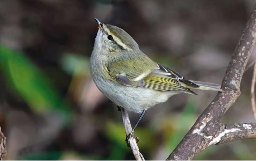
703 Hume's Leaf Warbler / Humes Bladkoning Phylloscopus humei , Blankenberge, West-Vlaanderen, Belgium, 25 October 2016