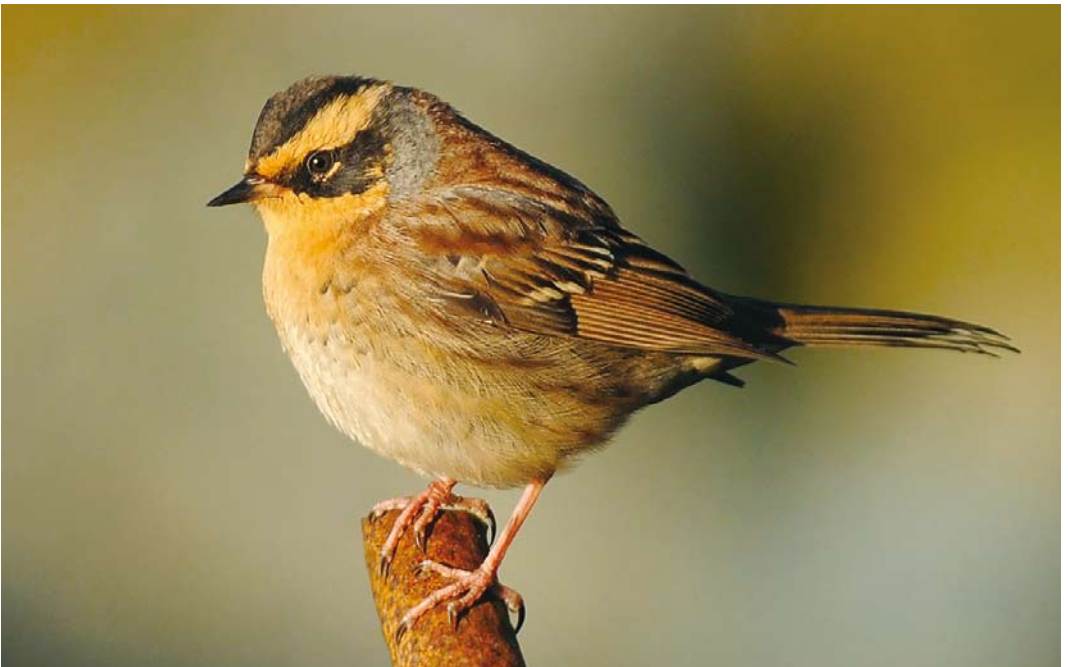
700 Siberian Accentor / Bergheggenmus Prunella montanella , Scousburgh, Mainland, Shetland, Scotland, 10 October 2016 (Rebecca Nason)