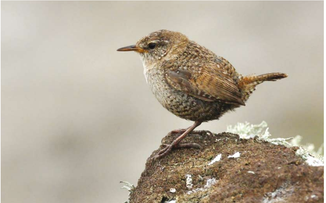
672-673 St Kilda Wren / St-Kildawinterkoning Troglodytes troglodytes hirtensis , Hirta, St Kilda, Scotland, 30 May 2014