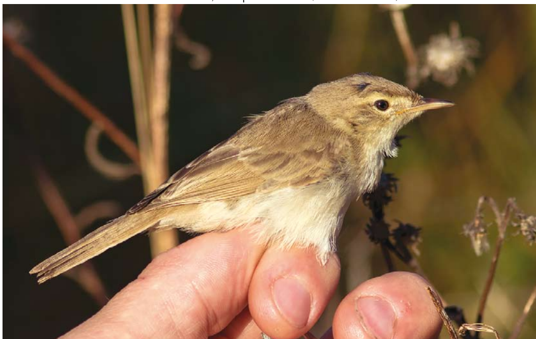
730 Kleine Spotvogel / Booted Warbler Iduna caligata , eerste-winter, Noordhollands Duinreservaat, Castricum, Noord-Holland, 10 september 2016