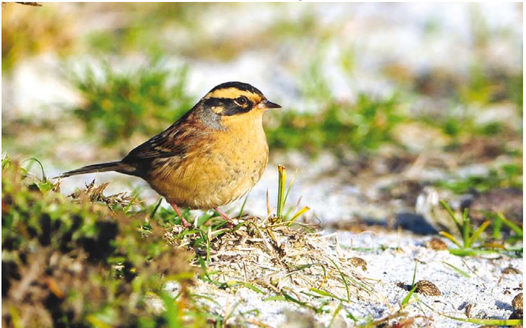
698 Siberian Accentor / Bergheggenmus Prunella montanella , Sylt, Schleswig-Holstein, Germany, 29 October 2016 (Martin Gottschling)