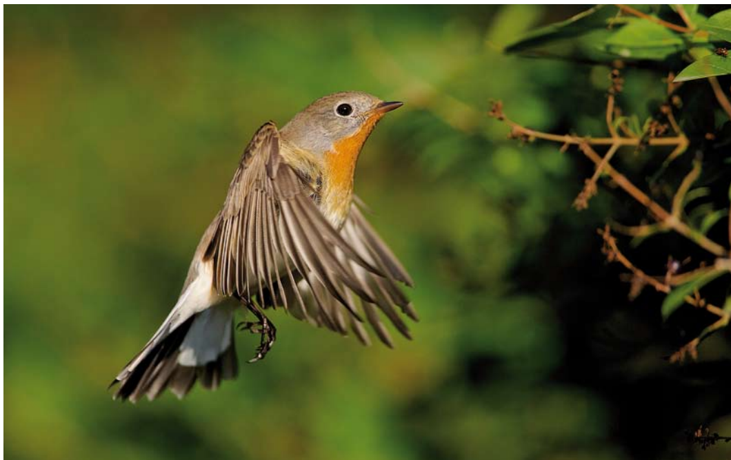
701 Red-breasted Flycatcher / Kleine Vliegenvanger Ficedula parva , adult male, Oostende, West-Vlaanderen, Belgium, 17 October 2016