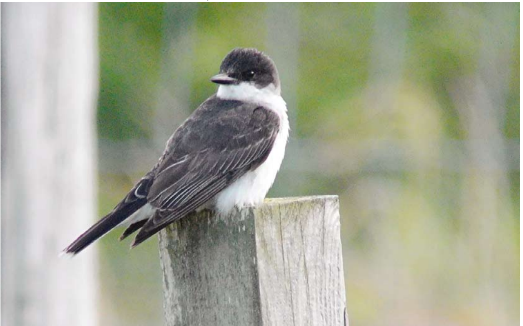
693 Eastern Kingbird / Koningstiran Tyrannus tyrannus , first-winter, Barra, Outer Hebrides, Scotland, 30 September 2016 ( Steve Nuttall )