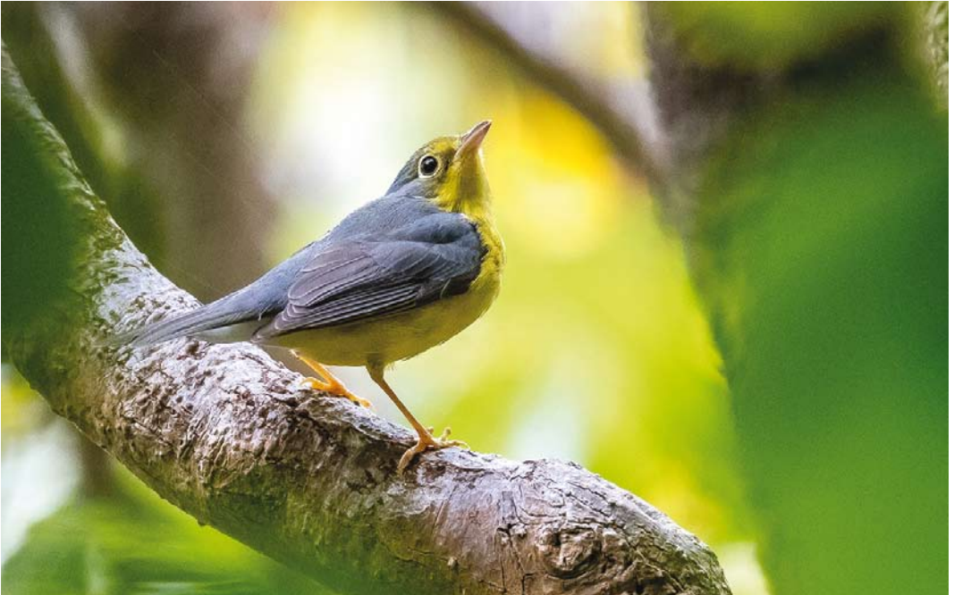
692 Canada Warbler / Canadazanger Cardellina canadensis , first-winter male, Corvo, Azores, 7 October 2016 ( Vincent Legrand )