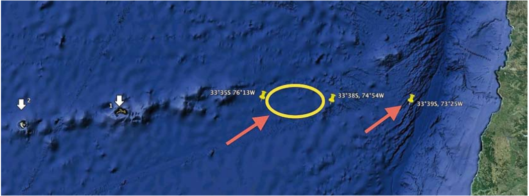
FIGURE 4 Juan Fernández archipelago, with Robinson Crusoe Island (1) and Masafuera (2). Main feeding grounds of petrels (yellow circle) stretch for almost 100 km (at roughly 400-500 km east from Masafuera); another one was located around western edge of Continental Shelf (right red arrow; see main text)

We were surprised to see this species feeding far east over the Humboldt Current. The crossings over the Humboldt waters produced in total 531 birds, with most around the Continental Shelf (110-165 km off the coast; see figure 4). This total includes 31 birds recorded as far east as 63 and 80 km off the coast on 3 March.