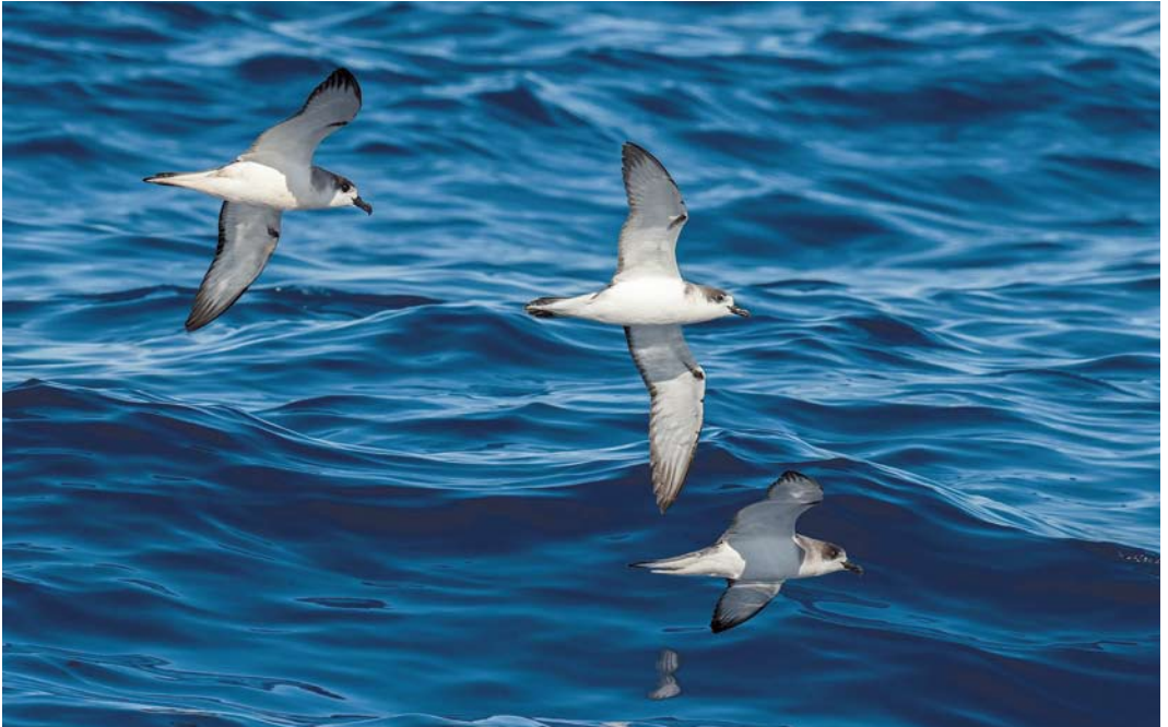
17 Juan Fernández Petrels / Witnekstormvogels Pterodroma externa, off Masafuera, Chile, 8 March 2013 18 Juan Fernández Petrel / Witnekstormvogel Pterodroma externa, off Masafuera, Chile, 12 March 2013 19 Stejneger's Petrel / Stejnegers Stormvogel Pterodroma longirostris (above) and Juan Fernández Petrel / Witnekstormvogel P externa (below), off Masafuera, Chile, 12 March 2013. The two gadfly petrels endemic to Juan Fernández archipelago.