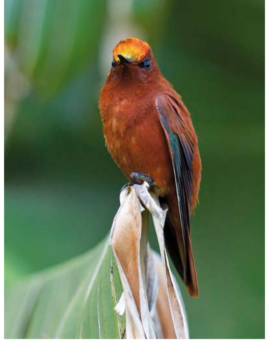
4 Juan Fernández Firecrown / Juan-Fernándezkolibri Sephanooides fernandensis, male, Robinson Crusoe Island, Chile, 7 March 2013.

Masafuera is one of the most important sites for breeding petrels in the eastern Pacific and, despite being a World Heritage Site, we have little hope for the two endemic petrels without eradication of the introduced fauna (rats, mice, cats and goats) from the island. Furthermore, permanent or regular monitoring of the populations is lacking.