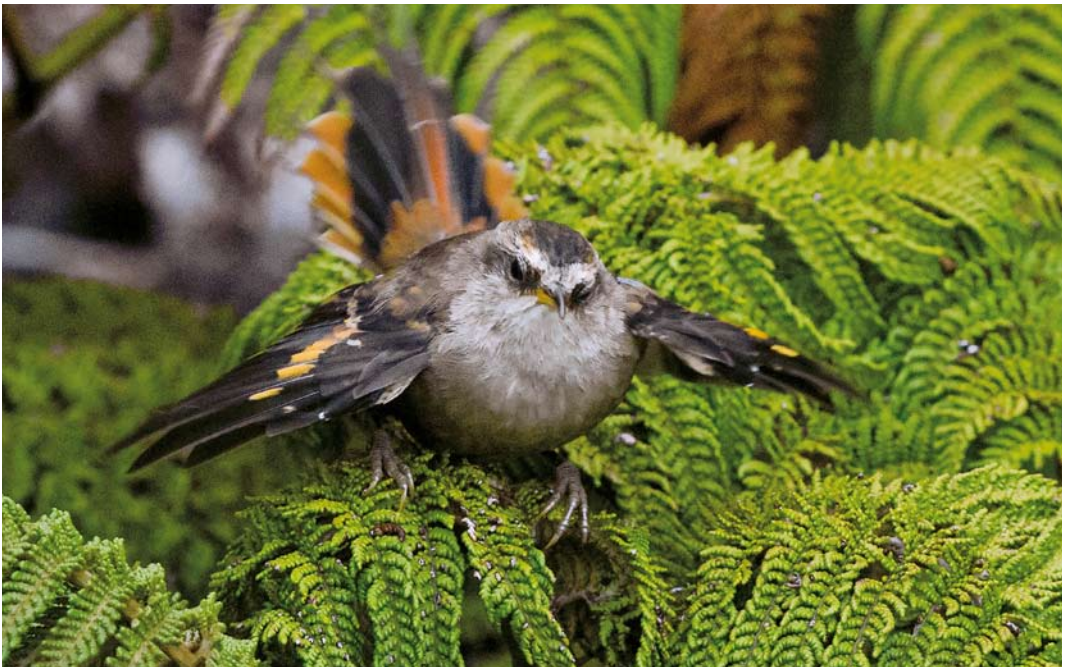
10 Masafuera Rayadito / Masafuerarayadito Aphrastura masafuerae, Masafuera, Chile, 11 March 2013