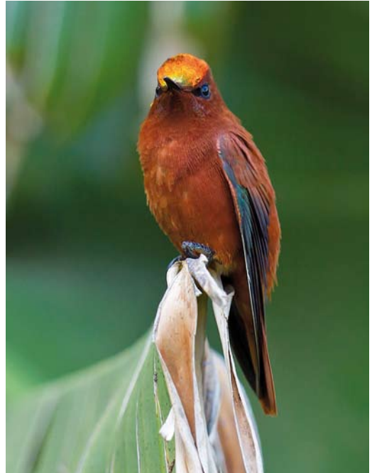
4 Juan Fernández Firecrown / Juan-Fernándezkolibri Sephanooides fernandensis, male, Robinson Crusoe Island, Chile, 7 March 2013.

Masafuera is one of the most important sites for breeding petrels in the eastern Pacific and, despite being a World Heritage Site, we have little hope for the two endemic petrels without eradication of the introduced fauna (rats, mice, cats and goats) from the island. Furthermore, permanent or regular monitoring of the populations is lacking.