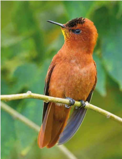
5 Juan Fernández Firecrown / Juan-Fernándezkolibrie Sephanoides fernandensis , male, Robinson Crusoe Island, Chile, 7 March 2013 ( Hadoram Shirihai /© Tubenoses Project ) 6 Juan Fernández Firecrown / Juan-Fernándezkolibrie Sephanoides fernandensis , female, Robinson Crusoe Island, Chile, 7 March 2013 ( Hadoram Shirihai /© Tubenoses Project ). Note that high degree of sexual dimorphism, although with still distinctly attractive and colorful female plumage in its own way, is reason why this species was initially mistakenly described as two species!

Juan Fernandez Firecrown shows extreme sexual dimorphism, which even resulted in both sexes being described as separate species (Colwell 1989, Roy et al 1998). The species shares or competes for resources with the non-endemic Green-backed Firecrown S. sephanioides that is a relative newcomer to the islands (Colwell 1989, Roy et al 1998). Both species compete mainly for the nectar of introduced species like Abutilon or Eucalyptus which abound in the surroundings of the village. Although the flowers of at least 12 endemic plant species are equally suitable, most of these, like Dendroseris litoralis , Raphithamnus venustus and Sophora fernandeziana , are now endangered (Colwell 1989).