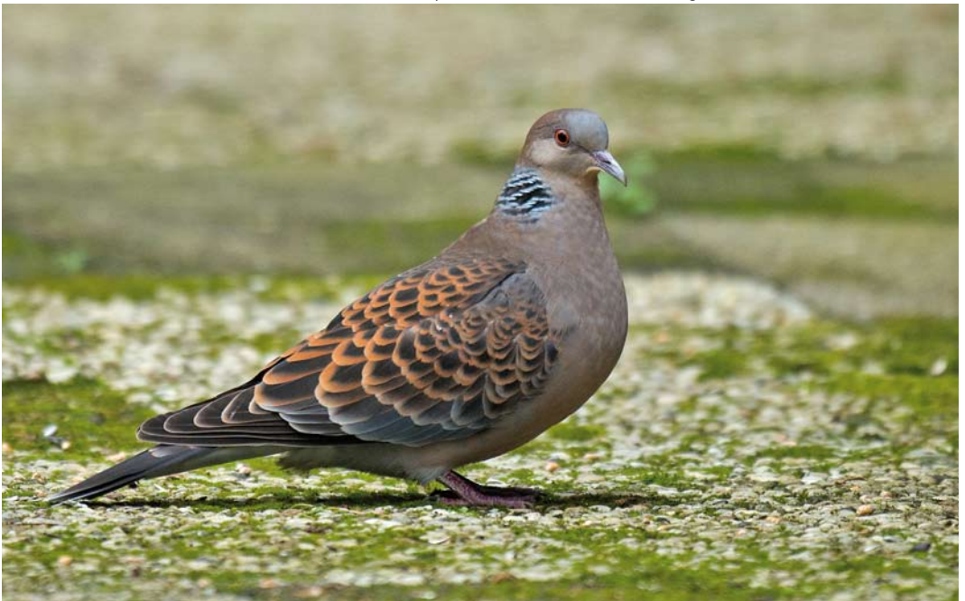
50 Oriental Turtle Dove / Oosterse Tortel Streptopelia orientalis , first-winter, Vlaardingen, Zuid-Holland, Netherlands, 5 January 2015