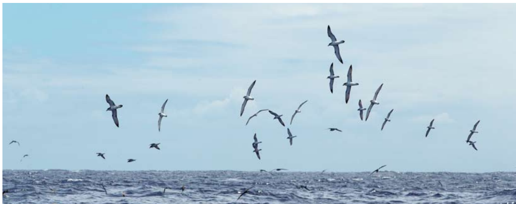
16 Juan Fernández Petrels / Witnekstormvogels Pterodroma externa , off Masafuera, Chile, 12 March 2013 (Hadoram Shirihai/©Tubenoses Project). Feeding flock during chumming session.

composed of large pieces, they often rest on the surface for a few seconds (at most 50) with open wings and peck at it. They often formed feeding frenzies and dropped down to the frozen chum blocks to eat from them, or to collect small pieces while in flight, mainly when a shark was scavenging from the chum block and breaking it into small pieces. Again, Juan Fernández Petrel feeding behaviour is thus in association with larger predator fish. Diving or other means of collecting food below the surface was not recorded.