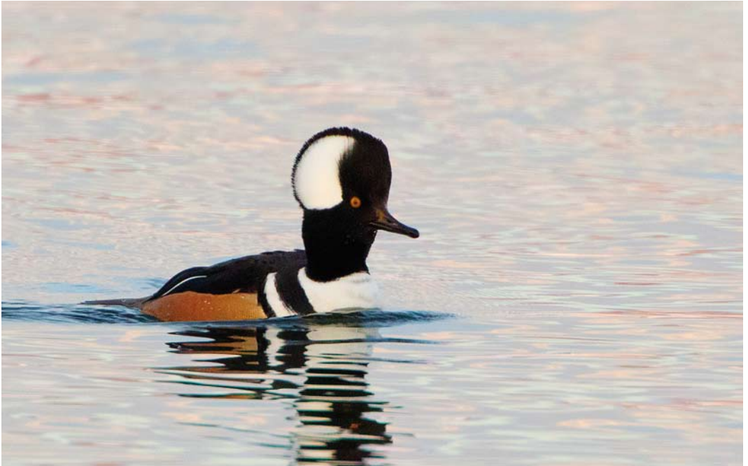
49 Hooded Merganser / Kokardezaagbek Lophodytes cucullatus , adult male, Helluvatn, Reykjavik, Iceland, 19 December 2014 ( David Monticelli )