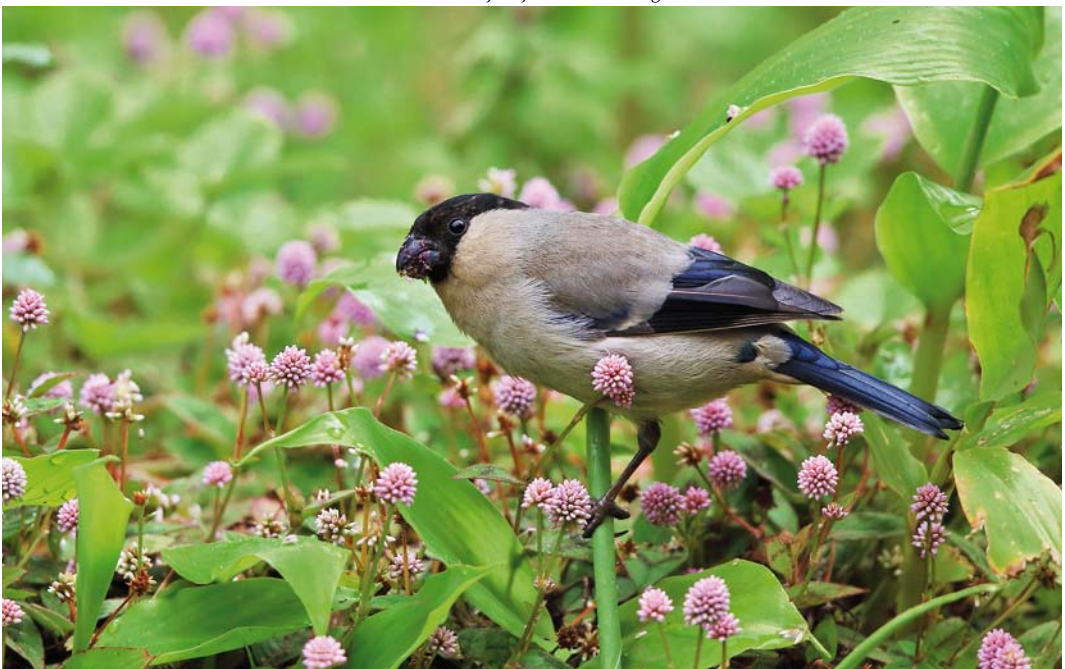
44 Azores Bulfinch / Azorengoudvink Pyrrhula murina , São Miguel, Azores, 14 June 2014