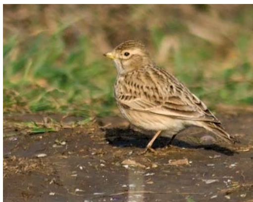
64 Ashy Drongo / Grijsze Drongo Dicrurus leucophaeus , Gan Shmuel, Hefer valley, Israel, 15 December 2014 ( Rony Livne ) 65 Asian Nuthatch / Aziatische Boomklever Sitta europaea asiatica , Marjaniemi, Hailuoto, Finland, 19 December 2014 ( Martin Gottschling ) 66 Black-throated Accentor / Zwartkeelheggenmus Prunella atrogularis , Marjaniemi, Hailuoto, Finland, 19 December 2014 ( Martin Gottschling ) 67 Eastern Black Redstart / Oosterse Zwarte Roodstaart Phoenicurus ochruros semirufus/phoenicuroides , first-year male, Scalby, North Yorkshire, England, 2 December 2014 ( David Aitken ) 68 North African Reed Warbler / Kortvleugelkarekiet Acrocephalus baeticatus , Douz, Tunisia, 8 January 2015 ( Michele Viganò ) 69 Lesser Short-toed Lark / Kleine Kortteenleeuwerik Alaudala rufescens , Costinesti, Constanta, Romania, 12 December 2014 ( Zoltán Baczó )