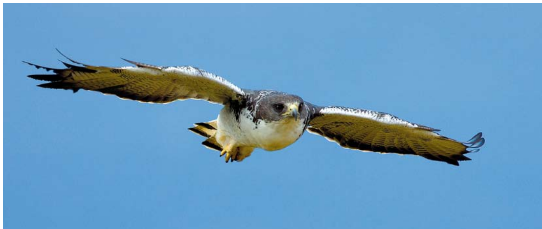
15 Red-backed Hawk / Roodrugbuiserz Buteo polyosoma exsul, Masafuera, Chile, 11 March 2013