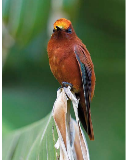
4 Juan Fernández Firecrown / Juan-Fernándezkolibri Sephanooides fernandensis, male, Robinson Crusoe Island, Chile, 7 March 2013.

Masafuera is one of the most important sites for breeding petrels in the eastern Pacific and, despite being a World Heritage Site, we have little hope for the two endemic petrels without eradication of the introduced fauna (rats, mice, cats and goats) from the island. Furthermore, permanent or regular monitoring of the populations is lacking.