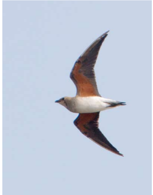
571 White-tailed Lapwing / Witstaartkievit Vanellus leucurus , De Nollen, Den Helder, Noord-Holland, 28 April 2014 572 Oriental Pratincole / Oosterse Vorkstaartplevier Glareola maldivarum , adult, Stinkgat, Sint Philipsland, Zeeland, 8 September 2014 573 Lesser Yellowlegs / Kleine Geelpootruiter Tringa flavipes , Vatroop, Noord-Holland, 14 January 2014