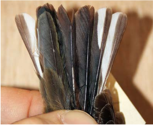
609 Common Chaffinch / Vink Fringilla coelebs sarda , adult female (collected at Lanusei, Sardegna, Italy, on 10 February 1926), Muséum National d'Histoire Naturelle, Paris, France, 18 February 2015.