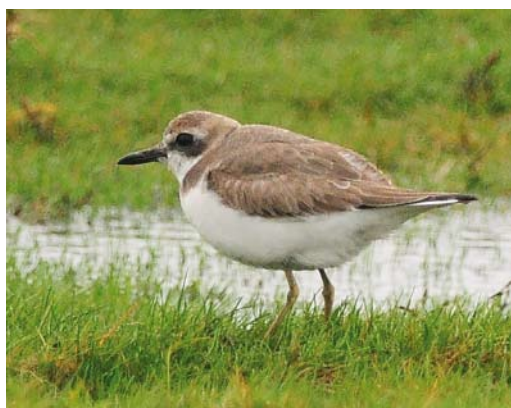
627 Northern Harrier / Amerikaanse Blauwe Kiekendief Circus hudsonius , male, North Ronaldsay, Orkney, Scotland, 27 September 2015 (George Gay) 628 American Golden Plover / Amerikaanse Goudplevier Pluvialis dominica , adult, Hohenau, Niederösterreich, Austria, 9 October 2015 (Wolfgang Trimmel) 629 Upland Sandpiper / Bartrams Ruiters Bartramia longicauda , first-year, Værnengene, Midtjylland, Denmark, 8 November 2015 (Birthe Lindholm Pedersen) 630 Greater Sand Plover / Woestijnplevier Charadrius leschenaultii , Vorland Hedwigenkoog-Hillgroven, Schleswig-Holstein, Germany, 10 November 2015 (Martin Gottschling)

(the first was in 1920). The report of one in Mauritania on 5 September was erroneous (cf Dutch Birding 37: 343, 2015). In England, a juvenile Hudsonian Whimbrel Numenius hudsonicus stayed on Tresco, Scilly, on 15-20 October and possibly the same one was seen at Marazion, Cornwall, from 30 October to 8 November. The long-staying individual in the Azores was present on Faial from 23 September to 9 October. The Yalu Jiang coastal wetland in the northern Yellow Sea, on the boundary between China and North Korea, has been described as the most important staging site for Great Knot Calidris tenuirostris , supporting on average 44 000 birds during the migration period in 2010-12; this is at least 22% of the population using the East Asian-Australian flyway, which has declined by 18% since 1999 (Chi-Yeung Choi et al in Bird Conserv Int 25: 53-70, 2015). A Baird's Sandpiper C bairdii at Anzio, Lazio, on 12 October was the third or fourth for Italy. The juve-