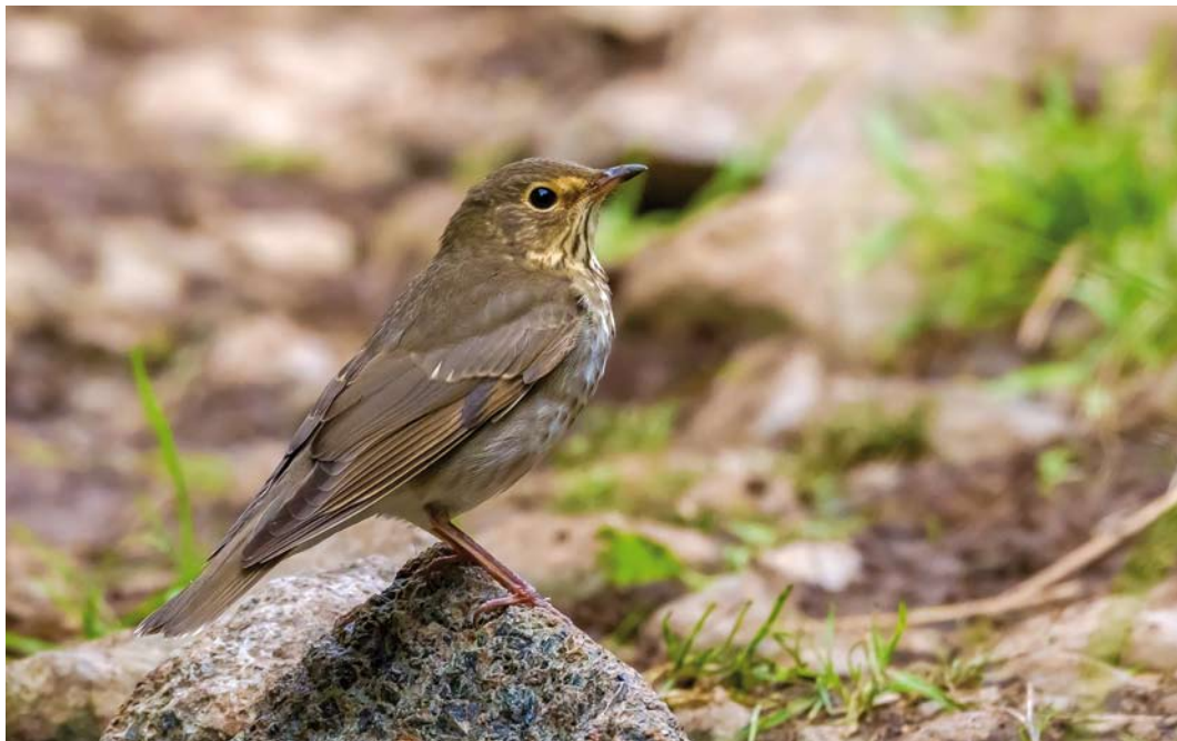
641 Swainson's Thrush / Dwerglijster Catharus ustulatus , first-year, Corvo, Azores, 20 October 2015 (Vincent Legrand)