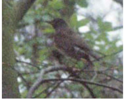
592 Eyebrowed Thrush / Vale Lijster Turdus obscurus , male, Amsterdamse Bos, Amstelveen, Noord-Holland, 24 April 1977

cies is no longer considered since 1 January 1993 but the CDNA still welcomes reports from before this date.