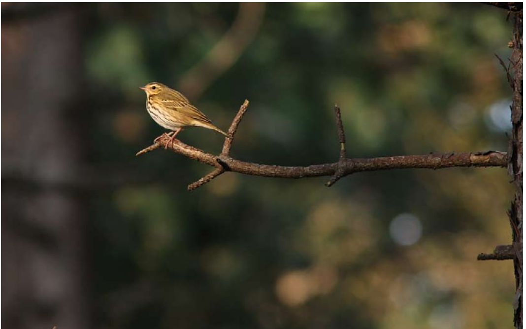
590 Olive-backed Pipit / Siberische Boompieper Anthus hodgsoni , Vlieland, Friesland, 4 October 2014 (Rob Half)