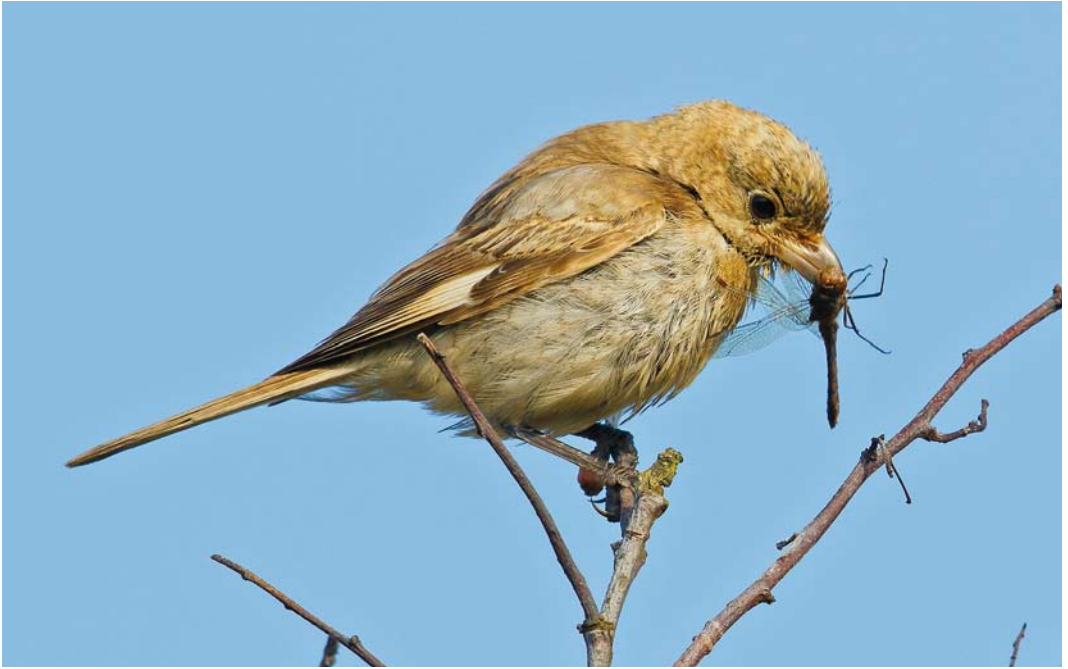
657 Roodkopklauwier / Woodchat Shrike Lanius senator , juveniel, Noordhollands Duinreservaat, Noord-Holland, 26 oktober 2015