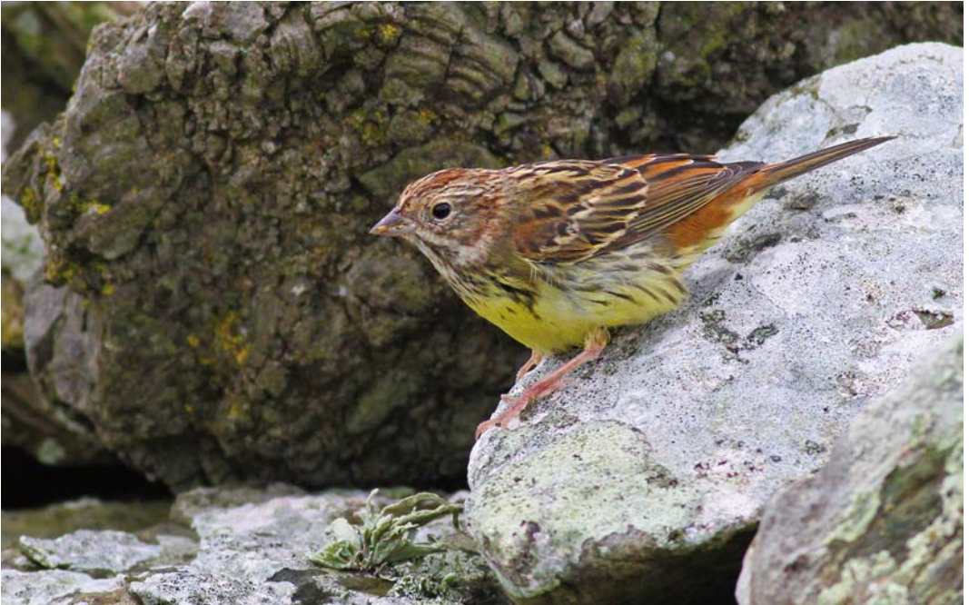
637 Chestnut Bunting / Rosse Gors Emberiza rutila , first-year, Papa Westray, Orkney, Scotland, 25 October 2015 (Stuart Piner)