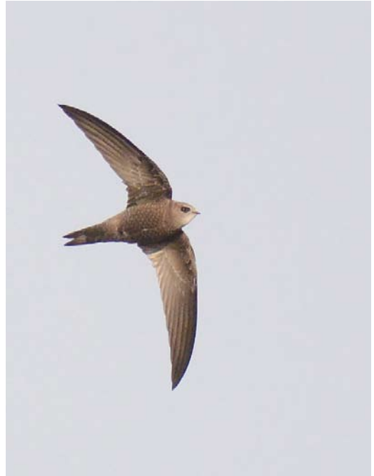
621 Hudsonian Whimbrel / Amerikaanse Regenwulp Numenius hudsonicus , juvenile, Tresco, Scilly, England, 17 October 2015 ( Richard Stonier ) 622 Pallid Swift / Vale Gierzwaluw Apus pallidus , Kennemermeer, IJmuiden, Noord-Holland, Netherlands, 8 November 2015 ( Edial Dekker ) 623 Pin-tailed Snipe / Stekelstaartsnip Callinago stenura (left), with Common Snipe / Watersnip G. gallinago , Kfar Ruppim, Israel, 15 October 2015 ( Meir Levy )