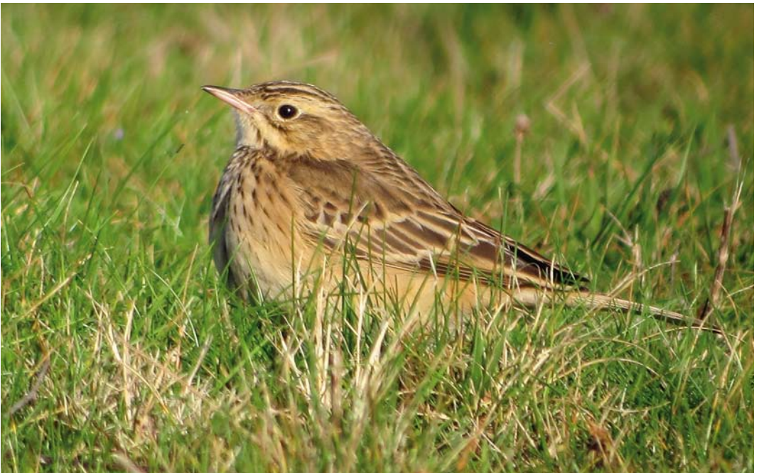
640 Blyth's Pipit / Mongoolse Pieper Anthus godlewskii , St Mary's, Scilly, England, 24 October 2015