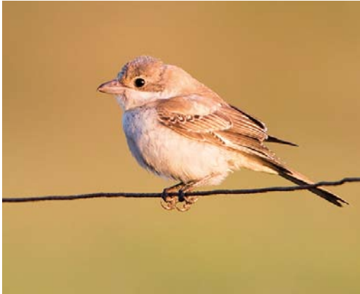
667 Roodkopklauwier / Woodchat Shrike Lanius senator , eerstejaars, Ballumermieden, Ameland, Friesland, 10 oktober 2015 (Alex Bos)