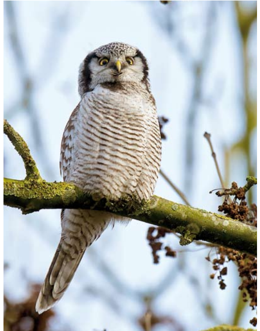
574 Eurasian Pygmy Owl / Derguil Glaucidium passerinum , Oostermaet, Lettele, Overijssel, 17 January 2014 (Arnaud B van den Berg) 575 Northern Hawk-Owl / Sperweruil Surnia ulula , Zwolle, Overijssel, 6 February 2014 (Arnaud B van den Berg) 576 Snowy Owl / Sneeuwuil Bubo scandiacus , first-winter female, Vlieland, Friesland, 2 February 2014 (Martin van der Schalk)