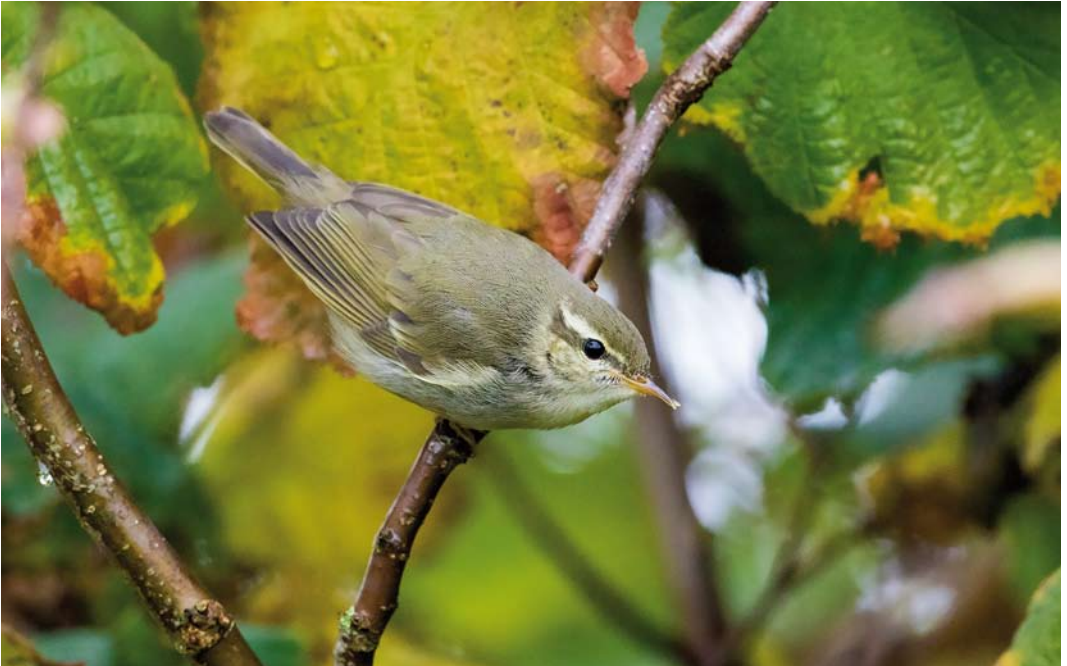
652 Noordse Boszanger / Arctic Warbler Phylloscopus borealis , Bloemketerp, Franeker, Friesland, 29 oktober 2015 (Alex Bos)