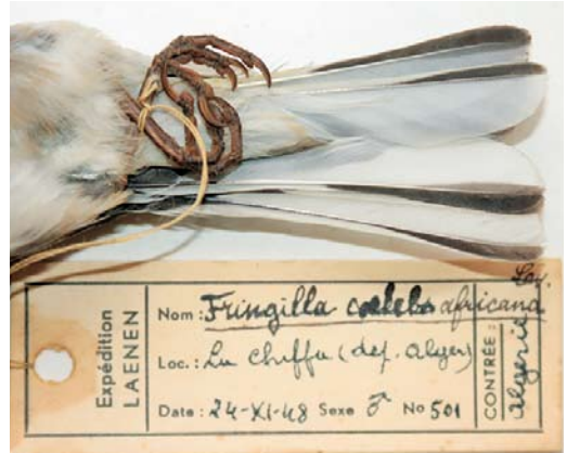
FIGURE 3 Common Chaffinch / Vink Fringilla coelebs , typical adult male (upper left), compared with Afrikaanse Vink F c spodiogenys/africana , adult male (lower) (Lorenzo Starnini). Note 'half dark, half white' tail and more extensive and more pure white on wing of spodiogenys/africana . 594 Atlas Chaffinch / Atlasvink Fringilla coelebs africana , adult male, Taroudant, Morocco, 25 March 2013 (Michele Viganò/MISC). Note striking half white tail with round white drop also on t3. Note also very pale grey lesser coverts (usually darker, often blackish tinged, in Common Chaffinch F coelebs ) with white extending onto median coverts too, making white wing-patch very broad. 595 Atlas Chaffinch / Atlasvink Fringilla coelebs africana , adult male (collected at Ouarsenis, Algeria, on 6 April 1925), Muséum National d'Histoire Naturelle, Paris, France, 20 February 2015 (Andrea Corso/©MNH). Typical outer tail pattern of African Chaffinch F c spodiogenys/africana , showing extensive white on t4-6. 596 Atlas Chaffinch / Atlasvink Fringilla coelebs africana , adult male (collected at Djebel Cheffa, Algeria, on 24 November 1948), Muséum National d'Histoire Naturelle, Paris, France, 18 February 2015 (Andrea Corso/©MNH). Same bird as in plate 601. Tail from below, showing how tail can appear almost fully white in some views.