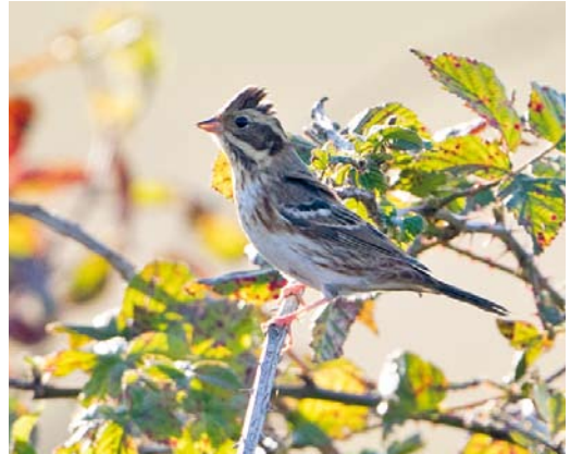
668 Bosgors / Rustic Bunting Emberiza rustica , Klein Vaarwaterweg, Ameland, Friesland, 11 oktober 2015 (Alex Bos)

Pieper). De vogel was de volgende dag nog aanwezig; het betrof het derde twitchbare geval, na die van 25 tot 28 oktober 1996 op de Maasvlakte en van 20 januari tot 7 februari 2007 bij Woerden, Zuid-Holland. Al op 26 september werd vanaf De Vulkaan bij Den Haag het geluid van een overvliegende Siberische Boompieper A hodgsoni opgenomen. Over de gehele periode meldten trektellers ook eens zeven 'zekere' vogels. Daarnaast waren er ten minste negen andere veldwaarnemingen, waaronder twee op 4 oktober op Schiermonnikoog en van 19 tot 25 oktober maar liefst drie in en rond het Krimbos op Texel. Op 20 oktober waren er ook nog eens vangsten bij Castricum en op Schiermonnikoog. Dat het voor zichtbare trek een zeer matig najaar was, maakt het aantal Vinken Fringilla coelebs goed inzichtelijk. Werden er vorig jaar in september-oktober door trektellers bijna vijf miljoen genoteerd, dit jaar bleef het aantal steken op een dikke miljoen. Er waren twee waarnemingen van eerste-kalenderjaar Roodmussen Erythrura erythrina : op 9 september op de Maasvlakte en op 13 september in de