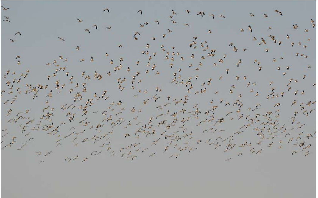
624 Sociable Lapwings / Steppiekieviten Vanellus gregarius , Talimarjan, Uzbekistan, 25 September 2015 (Valentin Soldatov) 625 Gyr Falcon / Giervalk Falco rusticolus , first-year, Rickelsbüller Koog, Schleswig-Holstein, Germany, 31 October 2015 (Martin Gottschling) 626 Black-winged Kite / Grijsze Wouw Elanus caeruleus , Kootwijkerveld, Gelderland, Netherlands, 14 November 2015 (Martin van der Schalk)