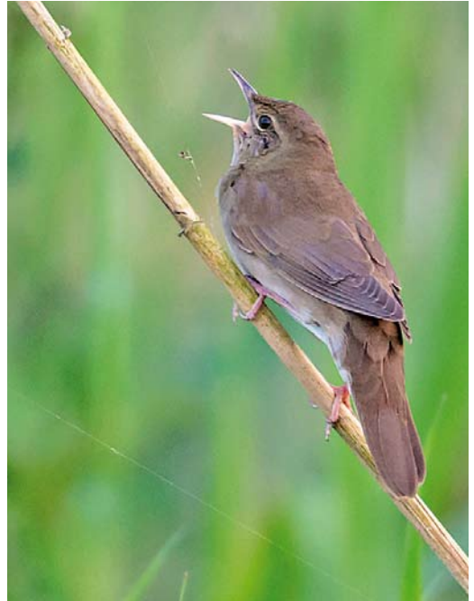
583 Booted Warbler / Kleine Spotvogel Iduna caligata , Nieuwe Stuifdijk, Maasvlakte, Zuid-Holland, 17 September 2014 584 River Warbler / Krezelzanger Locustella fluviatilis , Dordtse Biesbosch, Zuid-Holland, 25 May 2014 585 African Desert Warbler / Afrikaanse Woestijngrasmus Sylvia deserti , Polder Gnephoek, Alphen aan den Rijn, Zuid-Holland, 29 November 2014