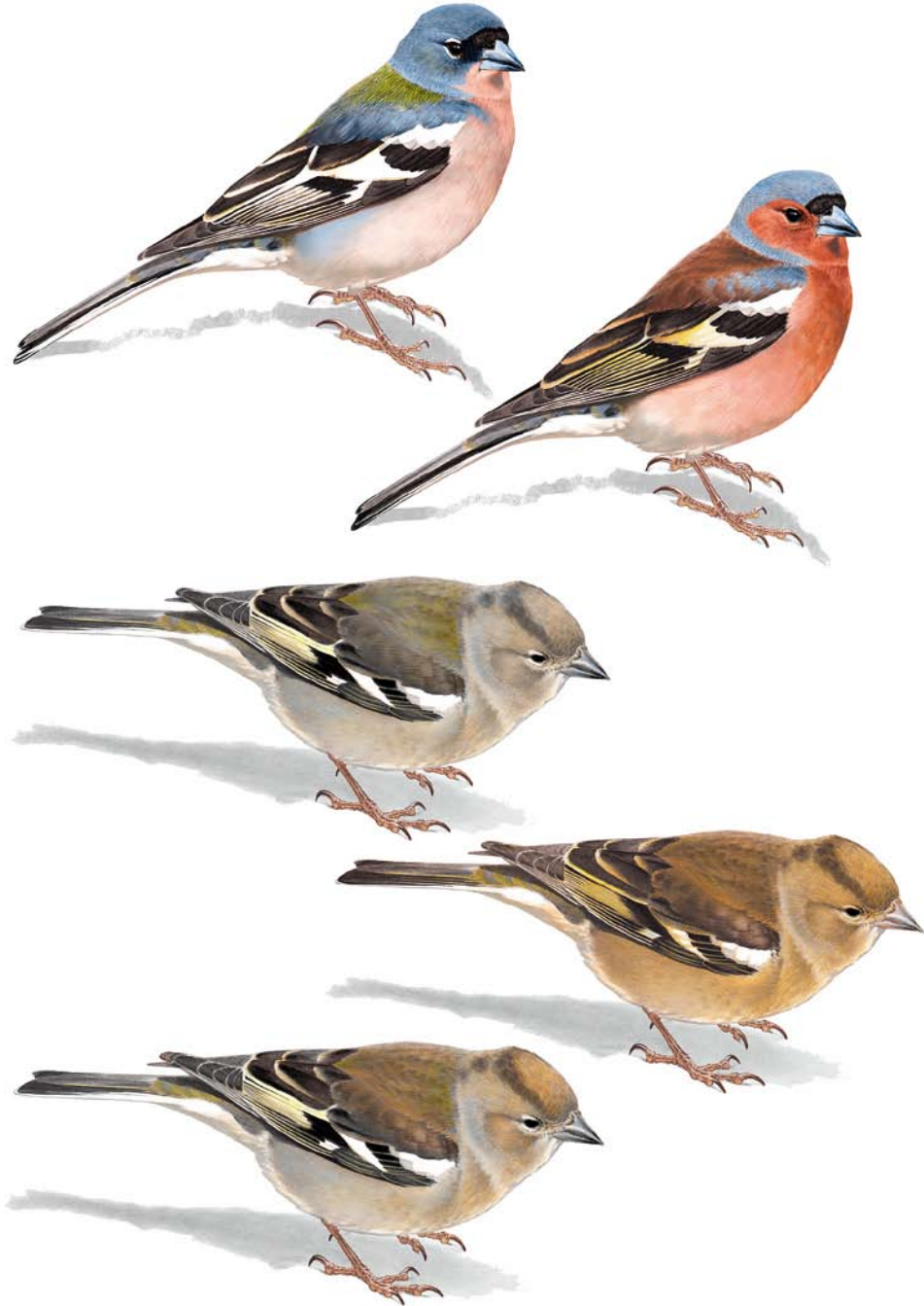
FIGURE 1 African Chaffinch / Afrikaanse Vink Fringilla coelebs spodiogenys/africana , adult male (upper left) and adult female (middle and lower left), compared with Common Chaffinch / Vink F c coelebs , adult male (upper right) and female (middle right) (Lorenzo Starnini). Lower female African is darker variant encountered in africana , which is very similar to European female (see text for differences).