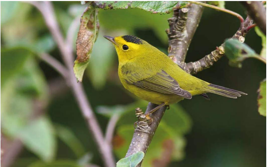
650 Wilson's Warbler / Wilsons Zanger Cardellina pusilla , male, Lewis, Outer Hebrides, Scotland, 16 October 2015