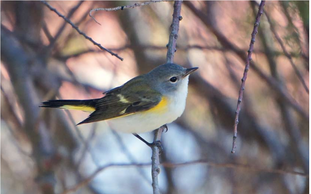
647 American Redstart / Amerikaanse Roodstaart Setophaga ruticilla , first-year, Porto Pim, Faial, Azores, 19 September 2015 ( Robin Sandham )