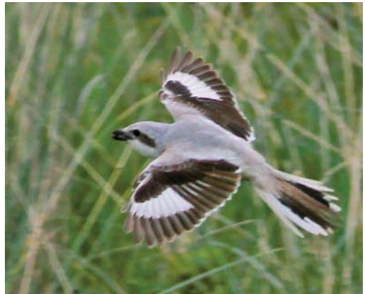
577 Arctic Warbler / Noordse Boszanger Phylloscopus borealis (found dead at Heemstede, Noord-Holland, on 14 October 2014), Heemstede, 17 November 2014 578 Blyth's Lesser Whitethroat / Siberische Braamsluiper Sylvia althaea blythi , Culemborg, Gelderland, 3 March 2014 579 Western Bonelli's Warbler / Bergfluitier Phylloscopus bonelli , Robbenjager, Texel, Noord-Holland, 25 August 2014 580 Steppe Grey Shrike / Steppeklapekster Lanius lahtora pallidirostris , second calendar-year, Slag Maasmond, Maasvlakte, Zuid-Holland, 29 April 2014

1990 # 3-5 November (was: 3-4 November), Koarnwertersân (Kornwerderzand), Súdwest-Fryslân , Friesland. The species is no longer considered since 1 January 1997 but the CDNA still welcomes reports from before this date.