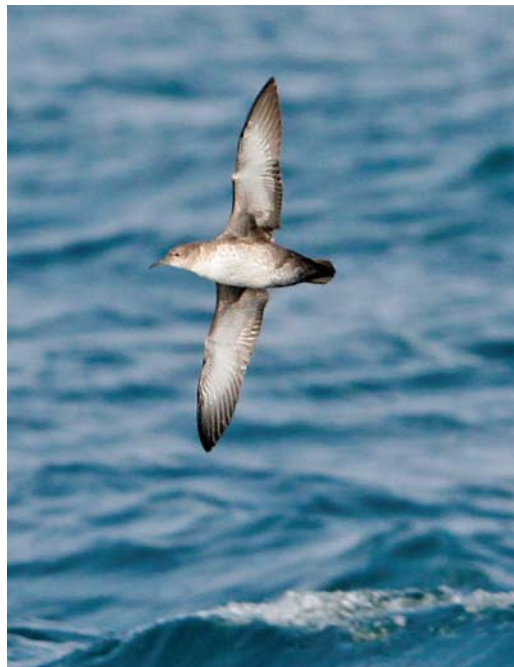
654 Aziatische Roodborsttapuit / Siberian Stonechat Saxicola maurus , Vlieland, Friesland, 5 oktober 2015 ( Leon Edelaar ) 655 Vale Pijlstormvogel / Balearic Shearwater Puffinus mauretanicus , Noordzee (ten zuidwesten van Den Helder, Noord-Holland), Continentaal Plat, 4 oktober 2015 ( Richard Pieterse ) 656 Siberische Strandloper / Sharp-tailed Sandpiper Calidris acuminata , adult, Camperduin, Noord-Holland, 9 september 2015 ( Jan den Hertog )