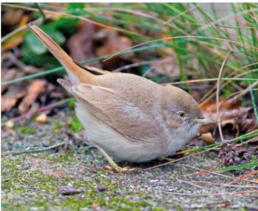
669 Woestijngrasmus / Asian Desert Warbler Sylvia nana , West-Terschelling, Terschelling, Friesland, 14 november 2015