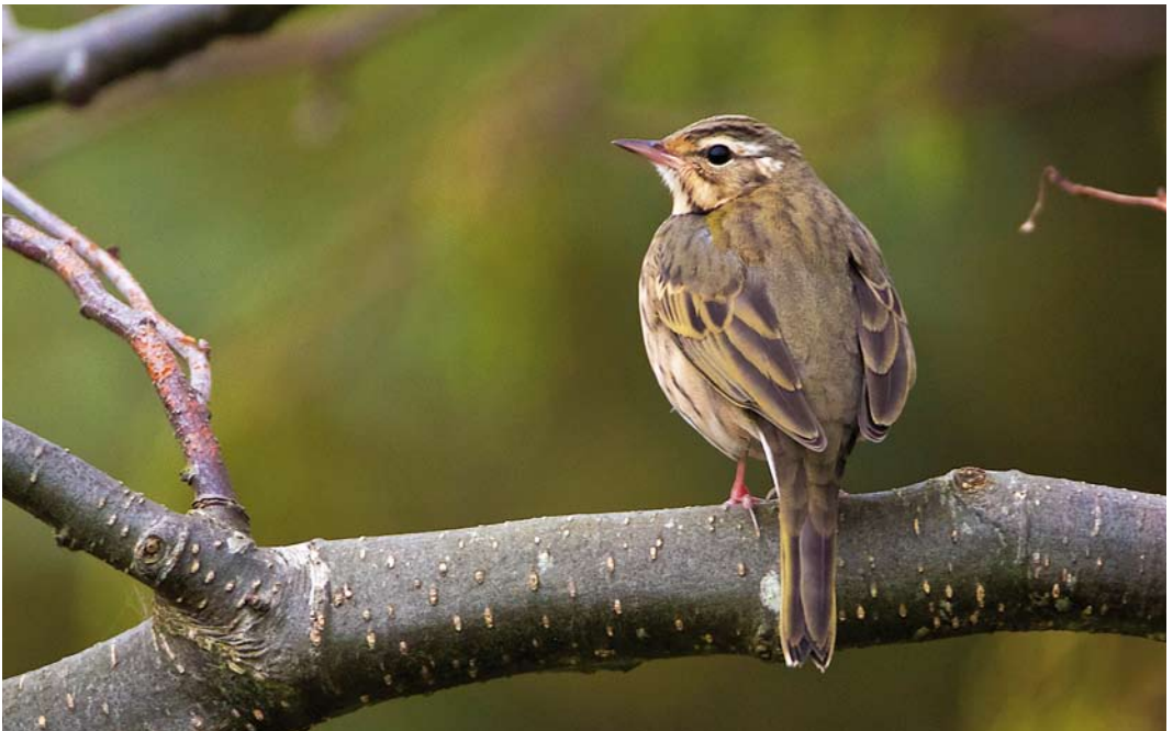
658 Siberische Boompieper / Olive-backed Pipit Anthus hodgsoni , Krimbos, Texel, Noord-Holland, 24 oktober 2015 (Martin van der Schalk)