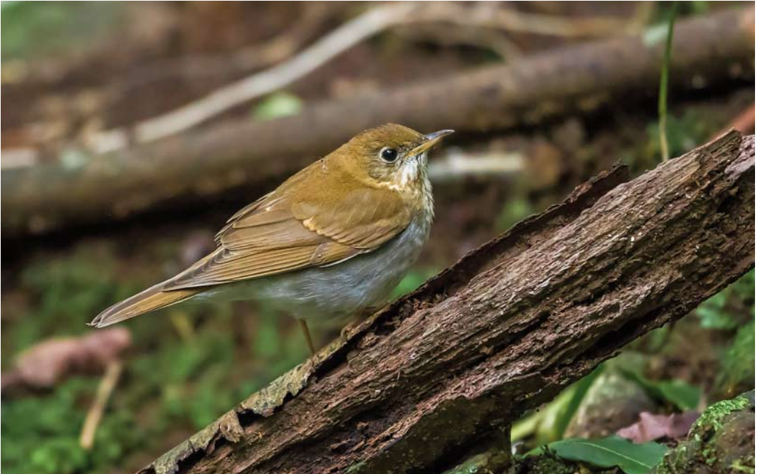
643 Veery / Veery Catharus fuscescens , first-year, Corvo, Azores, 15 October 2015 (Vincent Legrand)