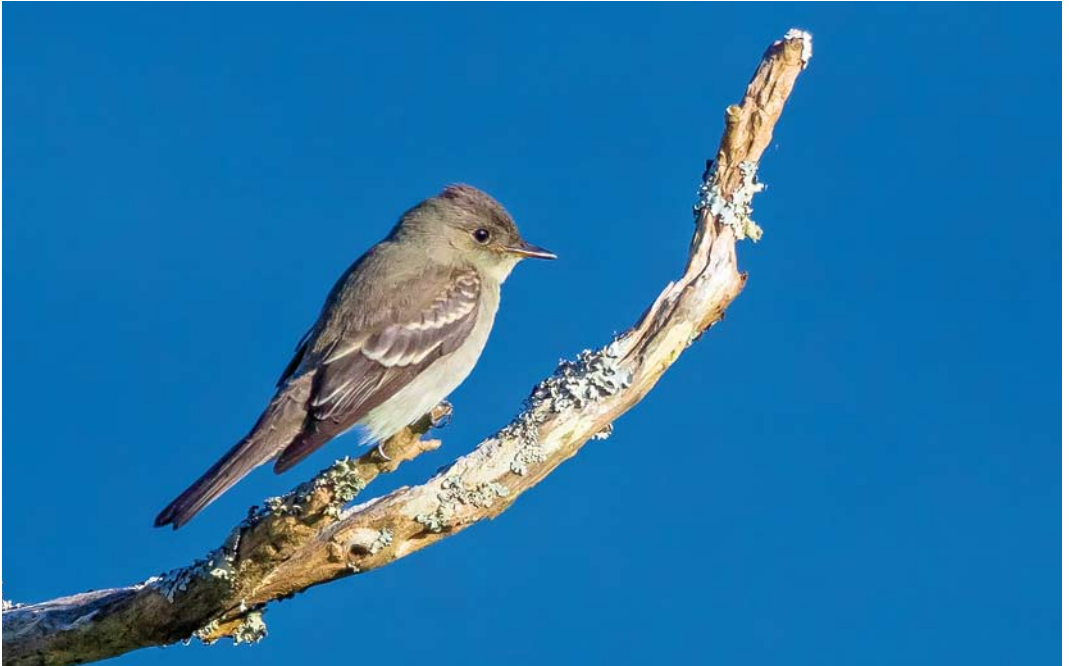
649 Eastern Wood Pewee / Oostelijke Bospiewie Contopus virens , Ribeira de Poço de Agua, Corvo, Azores, 20 October 2015 (Vincent Legrand)