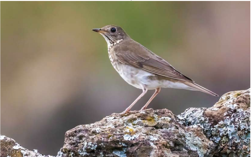
644 Grey-cheeked Thrush / Grijswangdwerlglijster Catharus minimus , first-year, Corvo, Azores, 23 October 2015 (Vincent Legrand)