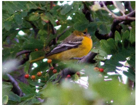
631 American Cliff Swallow / Amerikaanse Klifzwaluw Petrochelidon pyrrhonota , first-year, Corvo, Azores, 22 October 2015 632 Black-crowned Sparrow-Lark / Zwartkruinvinkleeuwerik Eremopterix nigriceps , male, Chorokhi delta, Georgia, 2 October 2015 633 Presumed Siberian Lesser Whitethroat / vermoedelijke Siberische Braamsluiper Sylvia althaea blythi , Porto de Bares, A Coruña, Spain, 5 October 2015 634 Brown Shrike / Bruine Klauwier Lanius cristatus , Ervika, Selje, Sogn og Fjordane, Norway, 13 October 2015 635 Caspian Stonechat / Kaspische Roodborsttapuit Saxicola maurus hemprichii , first-year male, Ouessant, Finistère, France, 18 October 2015 636 Baltimore Oriole / Baltimoretroepiaal Icterus galbula , first-year male, Værøy, Nordland, Norway, 3 October 2015