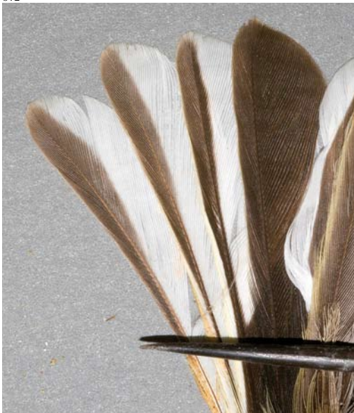
610 Cyrenaica Chaffinch / Cyrenaicavink Fringilla coelebs harterti, female (collected at Ain Mara, Cyrenaica, Libya, on 15 January 1939), Istituto Superiore per la Protezione e la Ricerca Ambientale, Bologna, Italy, 23 March 2015. Note rather long white 'wedge' on t3. 611 Cyrenaica Chaffinch / Cyrenaicavink Fringilla coelebs harterti, male (collected at Wadi el Cuf, Cyrenaica, Libya, on 20 January 1939), Istituto Superiore per la Protezione e la Ricerca Ambientale, Bologna, Italy, 23 March 2015. Note that also this subspecies shows extensively white on outer three tail-feathers. 612 Cyrenaica Chaffinch / Cyrenaicavink Fringilla coelebs harterti, female (collected at Wadi el Cuf, Cyrenaica, Libya, on 20 January 1939), Istituto Superiore per la Protezione e la Ricerca Ambientale, Bologna, Italy, 23 March 2015