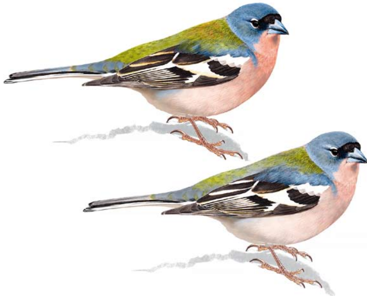
FIGURE 2 Typical Atlas Chaffinch / Atlasvink Fringilla coelebs africana (upper) and Tunisian Chaffinch / Tunesische Vink F c spodiogenys (lower) (Lorenzo Starnini). Note chiefly differences in saturation of plumage colours, with more extensive green tinge on upperparts in africana , paler area around eye in spodiogenys and whiter and wider tertial fringes in spodiogenys .

In adult female African Chaffinch, the tail pattern, although less striking than in adult male, is distinctive as well and differs from Common Chaffinch in the same way as in males. The white area on t4 is usually more restricted compared with adult males, while t5 can show also a less bright and extensive white pattern. However, the dark area on the inner web of the outer tail-feathers is always smaller than in any adult female Common. Indeed, when an adult female takes flight, it is rather easy to detect the 'half dark, half white tail' observed in males, contrary to the mostly dark, only white-sided tail of adult female