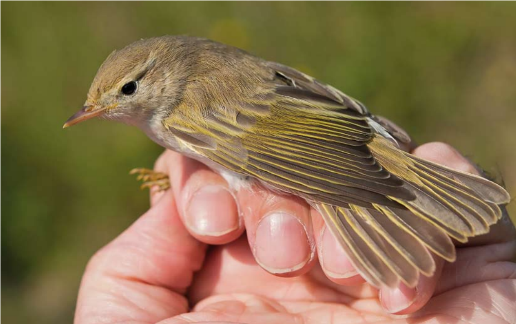
581 Western Bonelli's Warbler / Bergfluitier Phylloscopus bonelli , Bloemendaal, Noord-Holland, 4 September 2014