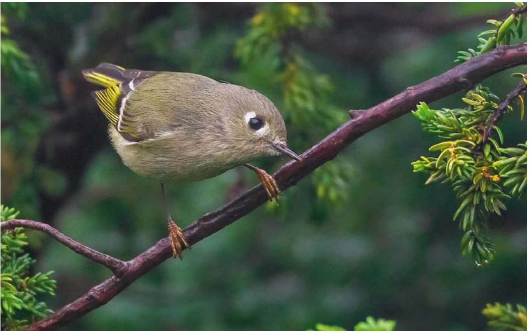
648 Ruby-crowned Kinglet / Roodkroonhaan Regulus calendula , Corvo, Azores, 1 November 2015 ( David Monticelli )