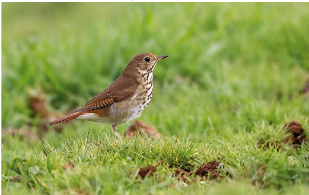
642 Hermit Thrush / Heremietlijster Catharus guttatus , first-year, Corvo, Azores, 24 October 2015