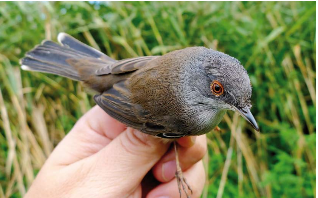
638 Sardinian Warbler / Kleine Zwartkop Sylvia melanocephala , adult female, Schlammwiss, Schuttrange, Luxembourg, 3 October 2015 (Patric Lorgé)