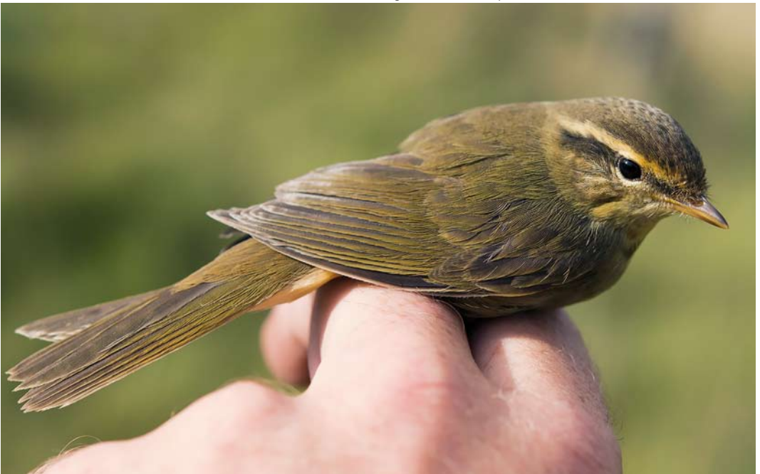
582 Radde's Warbler / Raddes Boszanger Phylloscopus schwarzi , Bloemendaal, Noord-Holland, 11 October 2014