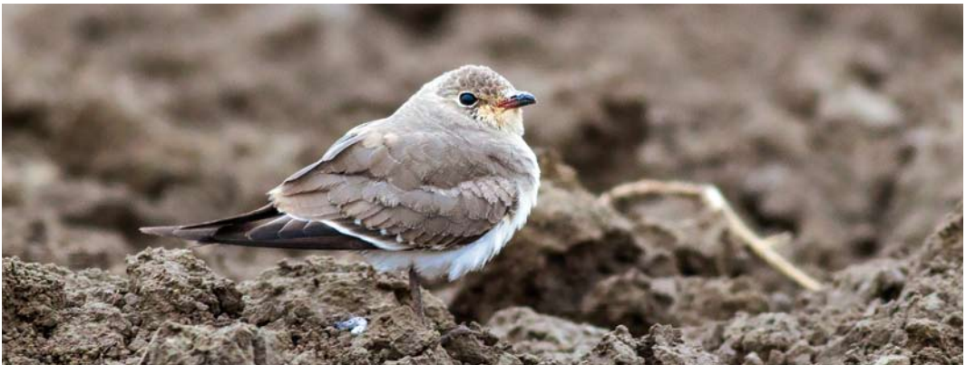
659 Zwartkeellijster / Black-throated Thrush, Turdus atrogularis , vrouwtje, Loodsmansduin, Texel, Noord-Holland, 17 oktober 2015 660 Zwartkeellijster / Black-throated Thrush, Turdus atrogularis , vrouwtje, Loodsmansduin, Texel, Noord-Holland, 17 oktober 2015 661 Ross' Gans / Ross's Goose Anser rossii , blauwe vorm, Milsbeek, Limburg, 21 oktober 2015 662 Izabeltapuit / Isabelline Wheatear Oenanthe isabellina , IJmuiden, Noord-Holland, 9 oktober 2015 663 Vorkstaartplevier / Collared Pratincole Glareola pratincola , Westdorpe, Zeeland, 18 oktober 2015