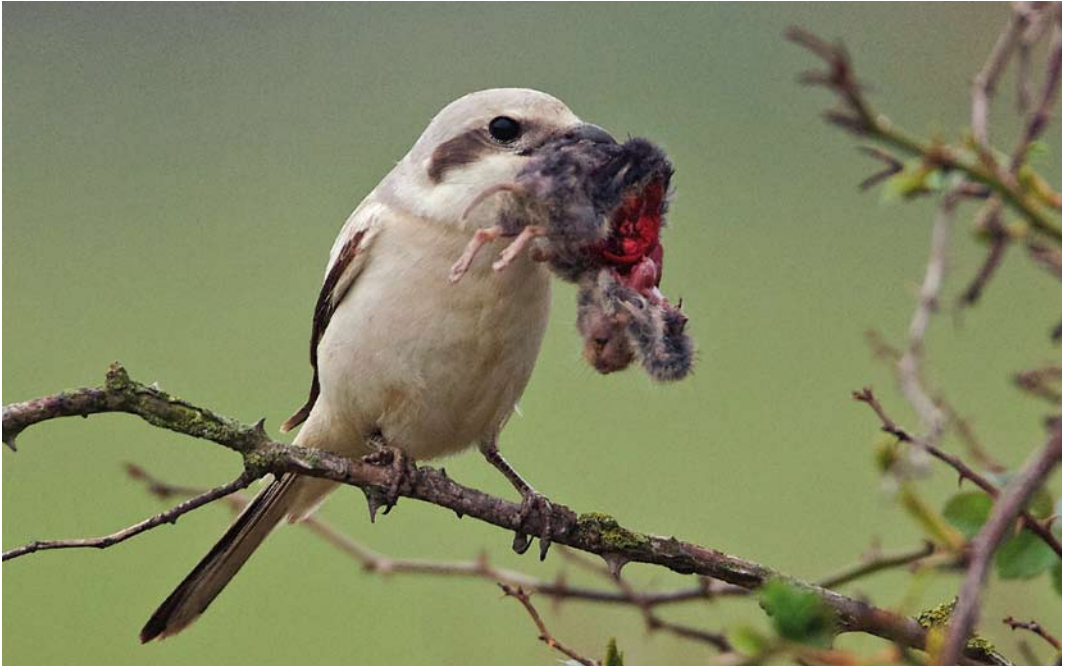
589 Steppe Grey Shrike / Steppeklapekster Lanius lahtora pallidirostris , second calendar-year, Slag Maasmond, Maasvlakte, Zuid-Holland, 30 April 2014 (Martin van der Schalk)