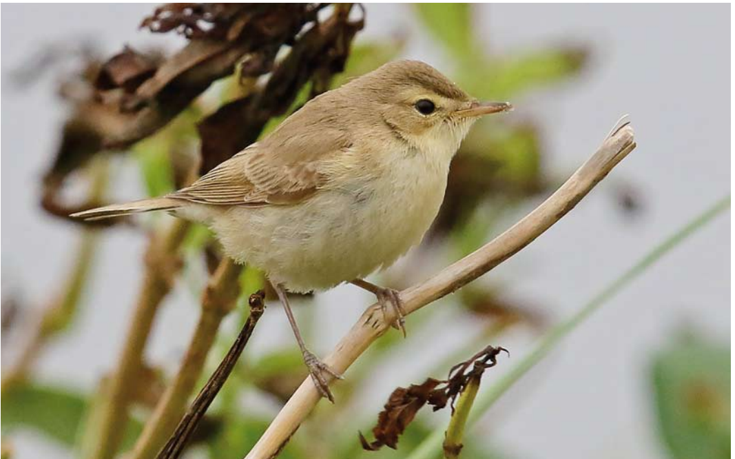
653 Kleine Spotvogel / Booted Warbler Iduna caligata , Texel, Noord-Holland, 12 september 2015