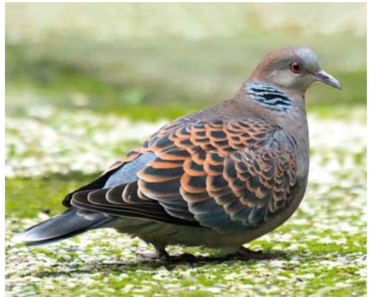
566 Green-winged Teal / Amerikaanse Wintertaling Anas carolinensis , male, Dijkmanshuizen, Texel, Noord-Holland, 10 March 2014 ( Eric Menkveld ) 567 Squacco Heron / Ralreiger Ardeola ralloides , Hilversumse Bovenmeent, Noord-Holland, 7 June 2014 ( Rob Half ) 568 Caspian Plover / Kaspische Plevier Charadrius asiaticus , first-winter, Wissenerkerke, Zeeland, 24 January 2014 ( Arnoud B van den Berg ) 569 Oriental Turtle Dove / Oosterse Tortel Streptopelia orientalis , Vlaardingen, Zuid-Holland, 5 January 2015 ( Arnoud B van den Berg )

merliede en Spaarnwoude , Noord-Holland, adult male.