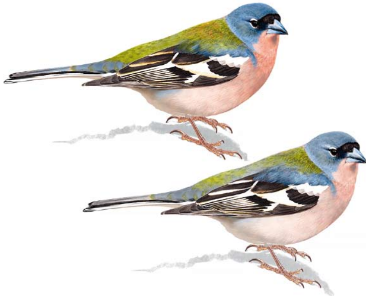
FIGURE 2 Typical Atlas Chaffinch / Atlasvink Fringilla coelebs africana (upper) and Tunisian Chaffinch / Tunesische Vink F c spodiogenys (lower) (Lorenzo Starnini). Note chiefly differences in saturation of plumage colours, with more extensive green tinge on upperparts in africana , paler area around eye in spodiogenys and whiter and wider tertial fringes in spodiogenys .

In adult female African Chaffinch, the tail pattern, although less striking than in adult male, is distinctive as well and differs from Common Chaffinch in the same way as in males. The white area on t4 is usually more restricted compared with adult males, while t5 can show also a less bright and extensive white pattern. However, the dark area on the inner web of the outer tail-feathers is always smaller than in any adult female Common. Indeed, when an adult female takes flight, it is rather easy to detect the 'half dark, half white tail' observed in males, contrary to the mostly dark, only white-sided tail of adult female