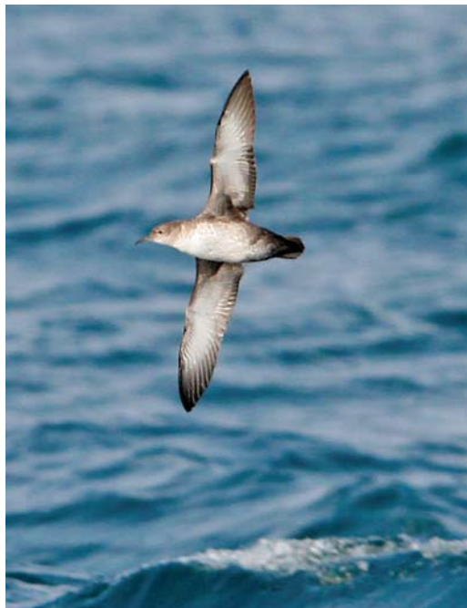
654 Aziatische Roodborsttapuit / Siberian Stonechat Saxicola maurus , Vlieland, Friesland, 5 oktober 2015 ( Leon Edelaar ) 655 Vale Pijlstormvogel / Balearic Shearwater Puffinus mauretanicus , Noordzee (ten zuidwesten van Den Helder, Noord-Holland), Continentaal Plat, 4 oktober 2015 ( Richard Pieterse ) 656 Siberische Strandloper / Sharp-tailed Sandpiper Calidris acuminata , adult, Camperduin, Noord-Holland, 9 september 2015 ( Jan den Hertog )