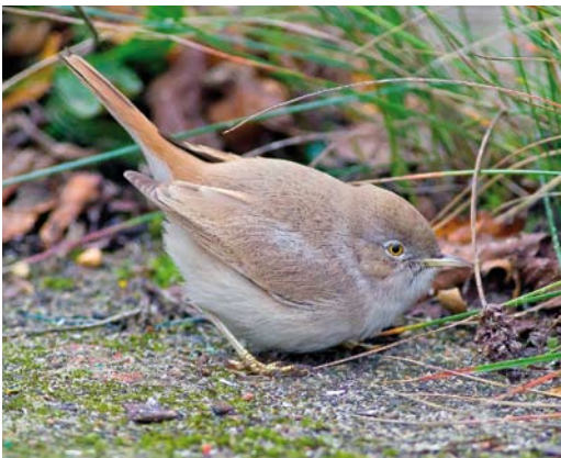
669 Woestijngrasmus / Asian Desert Warbler Sylvia nana , West-Terschelling, Terschelling, Friesland, 14 november 2015