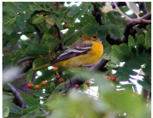
631 American Cliff Swallow / Amerikaanse Klifzwaluw Petrochelidon pyrrhonota , first-year, Corvo, Azores, 22 October 2015 632 Black-crowned Sparrow-Lark / Zwartkruinvinkleeuwerik Eremopterix nigriceps , male, Chorokhi delta, Georgia, 2 October 2015 633 Presumed Siberian Lesser Whitethroat / vermoedelijke Siberische Braamsluiper Sylvia althaea blythi , Porto de Bares, A Coruña, Spain, 5 October 2015 634 Brown Shrike / Bruine Klauwier Lanius cristatus , Ervika, Selje, Sogn og Fjordane, Norway, 13 October 2015 635 Caspian Stonechat / Kaspische Roodborsttapuit Saxicola maurus hemprichii , first-year male, Ouessant, Finistère, France, 18 October 2015 636 Baltimore Oriole / Baltimoretroepiaal Icterus galbula , first-year male, Værøy, Nordland, Norway, 3 October 2015