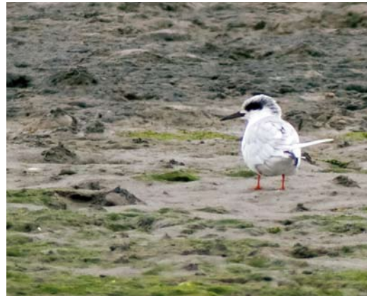
526 Dalmatian Pelican / Kroeskoppelikaan Pelecanus crispus, second calendar-year, Występ, Kujawsko-Pomorskie, Poland, 15 August 2015 527 Atlantic Great Cormorant / Grote Aalscholver Phalacrocorax carbo carbo, first-year, Artis, Amsterdam, Noord-Holland, Netherlands, 14 August 2015. Ringed as nestling in Västergötland, Sweden, on 9 June 2015. 528 Sooty Tern / Bonte Stern Onychoprion fuscatus, juvenile, Ilheu da Praia, Graciosa, Azores, 25 August 2015 529 Forster's Tern / Forsters Stern Sterna forsteri, adult, Rogerstown Estuary, Dublin, Ireland, 7 September 2015

naultii were seen at Dieksanderkoog, Schleswig-Holstein, Germany, on 19-31 July; at Clauen, Niedersachsen, Germany, on 20-22 July; and at Hyères, Var, France, on 7-8 August (second-year). An adult female Lesser Sand Plover C atrifrons was found on Lanzarote, Canary Islands, on 7 August. If accepted, a Caspian Plover C asiaticus at Ruan, Loiret, from 11 September will be the fifth for France. An Upland Sandpiper Bartramia longicauda at Banc d'Arguin on 5 September was the second for Mauritania (the first was in 1986) and the third for Africa. Adult Sharp-tailed Sandpipers Calidris acuminata stayed at Camperduin, Noord-Holland, the Netherlands, from 6 to at least 17 September, and at Langåker, Lista, Vest-Agder, Norway, on 7 September. In the Azores, no less than 40 White-rumped Sandpipers C fuscicollis were present at Ponta de Escalvado, São Miguel, on 23 August. Others were found in July-August in Britain (at least