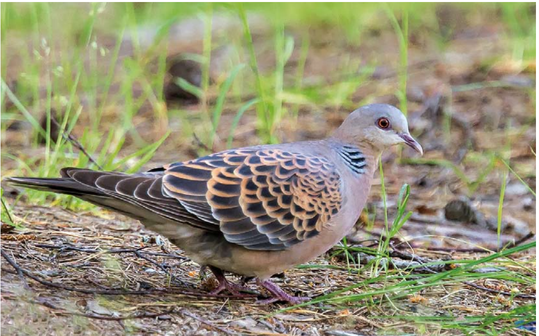
483 Rufous Turtle Dove / Meenatortel Streptopelia orientalis meena, near Nevyansk, Yekaterinburg, Russia, 17 June 2013