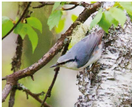
500 Asian Nuthatch / Aziatische Boomklever Sitta europaea asiatica , Ural ridge west of Severouralsk, Ural mountains, Russia, 12 June 2013

poor weather on 13 June, one of which gave occasional bursts of sub-song – their behaviour suggested that they had only recently arrived. Good weather and improved coverage in 2015 resulted in the most productive year so far, with at least six males recorded from 15 June at five different locations spread widely across the plateau.