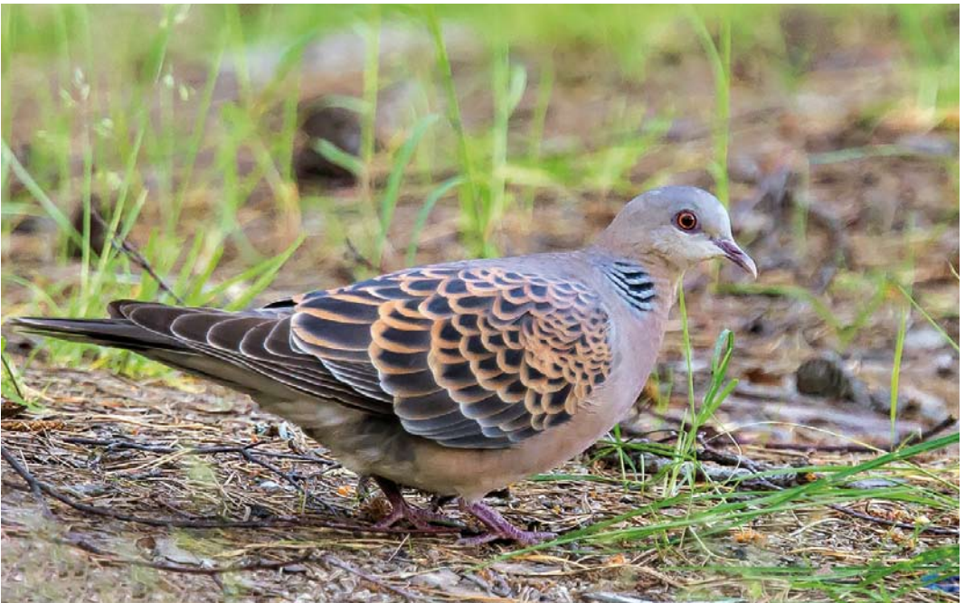
483 Rufous Turtle Dove / Meenatortel Streptopelia orientalis meena, near Nevyansk, Yekaterinburg, Russia, 17 June 2013