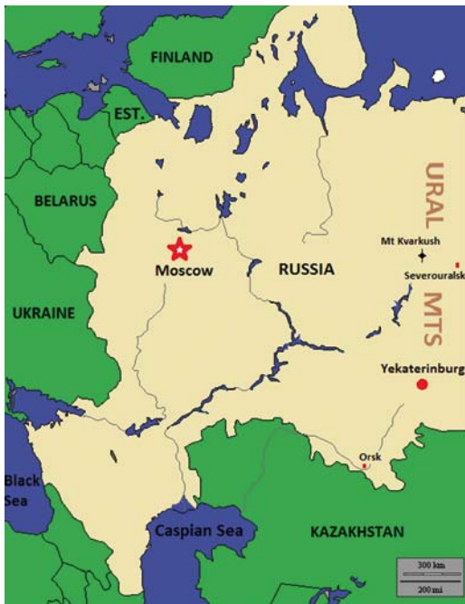
FIGURE 1 Map of European Russia and adjacent countries, with localities of interest (see text for details)

In terms of accommodation, camping is the only possibility in the North Urals. We also camped on the steppe of the Orenburg region, although there are presumably hostels/hotels in some of the local towns in the region. When around Yekaterinburg, the 2014 crew based itself at the Liner Hotel ( www.vi-hotels.com/en/liner ), situated just a few 100 m from the terminal at Koltsovo Airport. Prices here are comparatively cheap, and the food in the hotel's restaurant is of good quality and served 24 hours a day due to airline personnel using the hotel as a base (very useful when returning from a long day in the field). The French crew slept outside (in the car) for most of the nights around Yekaterinburg and experienced no problems; in fact, Russians are quite fond of outdoor activities and often camp outside themselves.