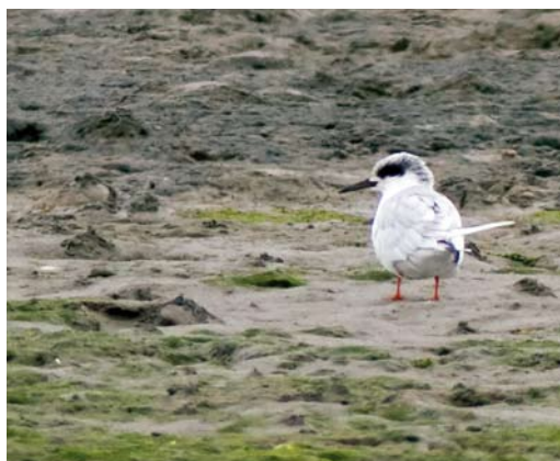
526 Dalmatian Pelican / Kroeskoppelikaan Pelecanus crispus, second calendar-year, Występ, Kujawsko-Pomorskie, Poland, 15 August 2015 527 Atlantic Great Cormorant / Grote Aalscholver Phalacrocorax carbo carbo, first-year, Artis, Amsterdam, Noord-Holland, Netherlands, 14 August 2015. Ringed as nestling in Västergötland, Sweden, on 9 June 2015. 528 Sooty Tern / Bonte Stern Onychoprion fuscatus, juvenile, Ilheu da Praia, Graciosa, Azores, 25 August 2015 529 Forster's Tern / Forsters Stern Sterna forsteri, adult, Rogerstown Estuary, Dublin, Ireland, 7 September 2015

naultii were seen at Dieksanderkoog, Schleswig-Holstein, Germany, on 19-31 July; at Clauen, Niedersachsen, Germany, on 20-22 July; and at Hyères, Var, France, on 7-8 August (second-year). An adult female Lesser Sand Plover C atrifrons was found on Lanzarote, Canary Islands, on 7 August. If accepted, a Caspian Plover C asiaticus at Ruan, Loiret, from 11 September will be the fifth for France. An Upland Sandpiper Bartramia longicauda at Banc d'Arguin on 5 September was the second for Mauritania (the first was in 1986) and the third for Africa. Adult Sharp-tailed Sandpipers Calidris acuminata stayed at Camperduin, Noord-Holland, the Netherlands, from 6 to at least 17 September, and at Langåker, Lista, Vest-Agder, Norway, on 7 September. In the Azores, no less than 40 White-rumped Sandpipers C fuscicollis were present at Ponta de Escalvado, São Miguel, on 23 August. Others were found in July-August in Britain (at least