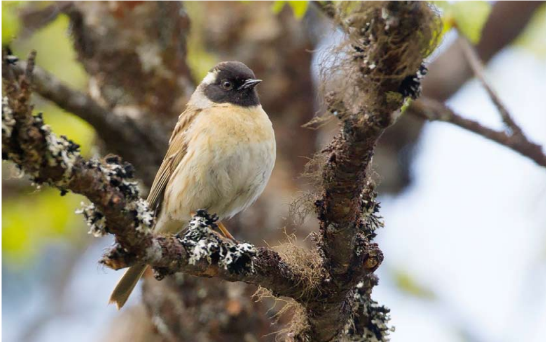
494 Black-throated Accentor / Zwartkeelheggenmus Prunella atrogularis , male, Ural ridge west of Severouralsk, Ural mountains, Russia, 11 June 2014 ( David Monticelli ) 495 Greenish Warbler / Grauwe Fitis Phylloscopus trochiloides , Ural ridge west of Severouralsk, Ural mountains, Russia, 11 June 2014 ( David Monticelli ) 496 Red-flanked Bluetail / Blauwstaart Tarsiger cyanurus , female, Ural ridge west of Severouralsk, Ural mountains, Russia, 11 June 2013 ( Eric Didner )