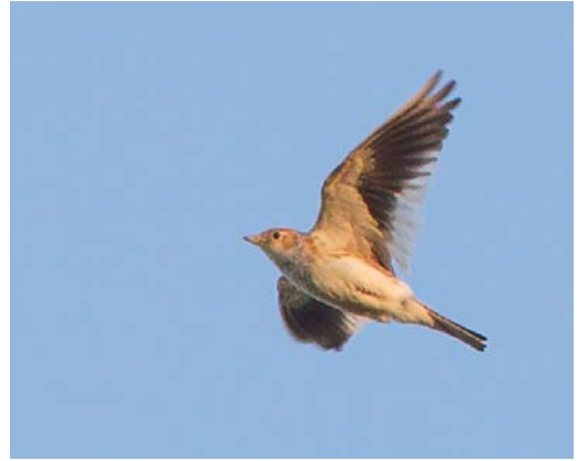
505 Demoiselle Cranes / Jufferkraanvogels Grus virgo , south-east of Podolsk, Orenburg Oblast, Russia, 19 June 2015 506 White-winged Lark / Witvleugelleeuwierik Alauda leucoptera , in display, near Gaynulino, north-west of Orsk, Orenburg Oblast, Russia, 17 June 2014

strong candidate for future split due to reduced intergradation with the western group in contact zones in the southern Ural range and in the lower basins of the Kama and Vyatka rivers (Red'kin & Konovalova 2006). This is supported by markedly different mitochondrial and nuclear genomes of the eastern and western groups (Hung et al 2012). Their voice was not audibly different from European birds but detailed analysis would be needed. Some nuthatches seen around Yekaterinburg did not look so obviously different from European birds but they were not photographed, inviting better scrutiny of the nuthatches there.