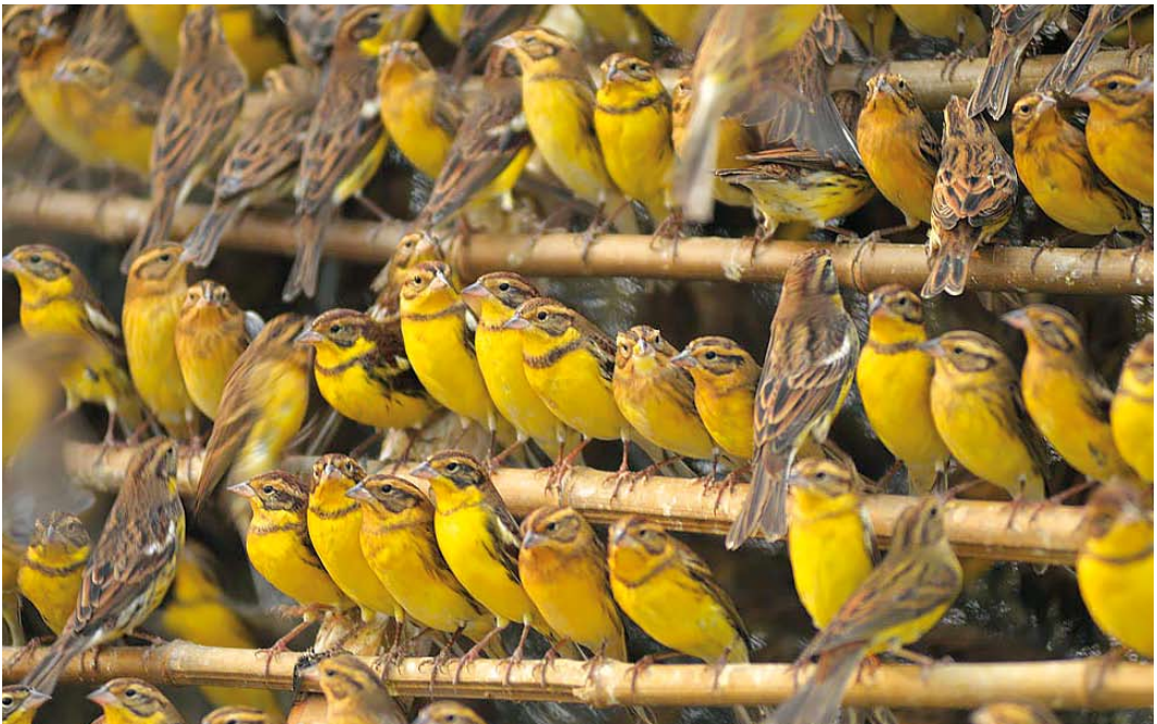
521 Yellow-breasted Buntings / Wilgengorzen Emberiza aureola , illegally trapped, China, 2 November 2012 (Huang Qiusheng)

The future for Yellow-breasted Bunting looks bleak. The species is practically extinct from Scandinavia east to Lake Baikal, and is declining rapidly in the remaining breeding areas in Mongolia and the Russian Far East. Other species might