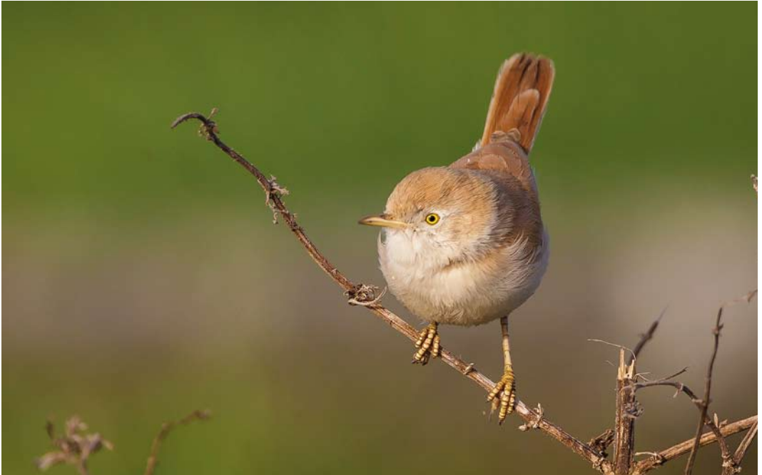
507 Afrikaanse Woestijngrasmus / African Desert Warbler Sylvia deserti , Alphen aan den Rijn, Zuid-Holland, 29 november 2014 (Johnny van der Zwaag)