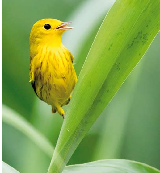
549 American Yellow Warbler / Gele Zanger Setophaga aestiva , Lugar de Baixo, Madeira, 20 August 2015

Arnoud B van den Berg, Duinlustparkweg 98, 2082 EG Santpoort-Zuid, Netherlands ( arnoud.b.vandenberg@gmail.com )