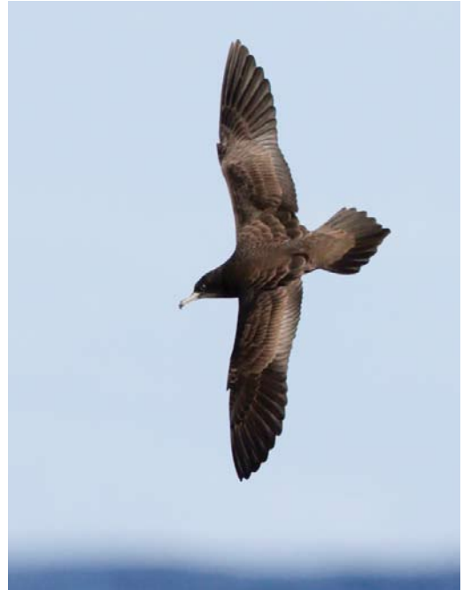
473 Wedge-tailed Shearwater / Wigstaartpijlstormvogel Puffinus pacificus , off Réunion, Indian Ocean, 11 December 2014 474 Wedge-tailed Shearwater / Wigstaartpijlstormvogel Puffinus pacificus , off Réunion, Indian Ocean, 7 December 2014

Few other tubenose species were encountered. Tubenose species most commonly observed were Wedge-tailed Shearwater and Tropical Shearwater P bailloni that both breed on Réunion. Less common were Bulwer's Petrel B bulwerii and Wilson's Storm Petrel Oceanites oceanicus . The latter species was only observed off St Gilles. Other common seabirds seen included White-tailed Tropicbird