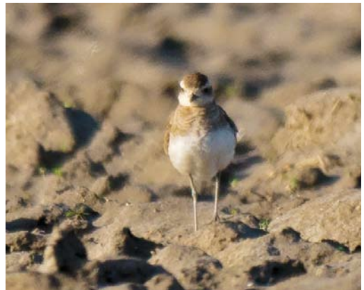
514 Kaspische Plevier / Caspian Plover Charadrius asiaticus , eerste-winter, Wissenkerke, Zeeland, 10 januari 2014 515-517 Kaspische Plevier / Caspian Plover Charadrius asiaticus , eerste-winter, met Kieviten / Northern Lapwings Vanellus vanellus , Wissenkerke, Zeeland, 10 januari 2014 518-519 Kaspische Plevier / Caspian Plover Charadrius asiaticus , eerste-winter, Wissenkerke, Zeeland, 24 januari 2014