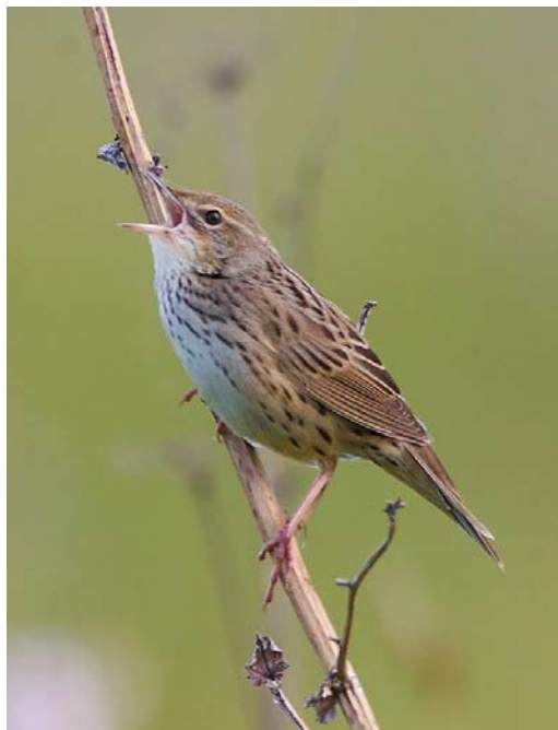
485 Lanceolated Warbler / Kleine Sprinkhaanzanger Locustella lanceolata , singing male, airport marshes near Bolshoy Istok, Yekaterinburg, Russia, 29 June 2014

mon in the area, even if localised, and further investigation of similar habitats in the area would probably produce sightings.