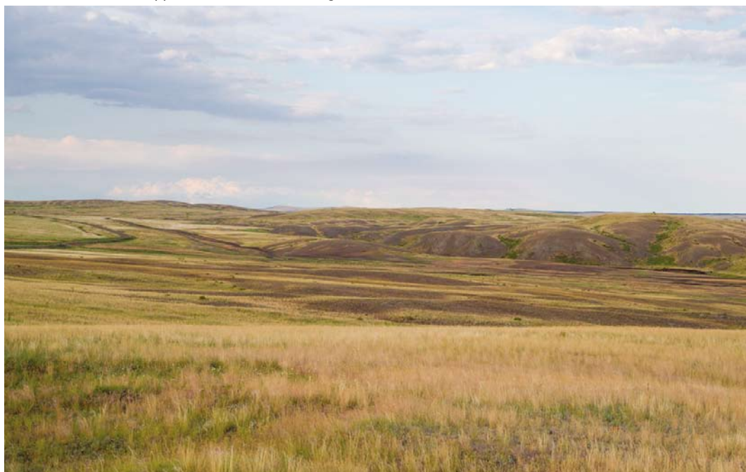
501 Steppe west of Orsk, Orenburg Oblast, Russia, 15 June 2014 ( David Monticelli )

Given that the limited information we had received before the 2014 trip suggested Demoiselle Crane was only very sparsely distributed in both the Orenburg and Chelyabinsk Oblasts and that locations varied each year, this was the species we least expected to see. Our only sighting was of a pair flying over the road near the town of Khalilovo (51°23'42"N, 58°07'10"E) during mid-afternoon on 17 June. Further coverage in 2015 produced a significant upturn in sightings, the highlight being a flock of 12 at the western end of the lake south-east of Makan, viewed west from 51°56'20"N 58°23'04"E, on 18 June (with c 50 Black-winged Pratincoles also there). Nearby, a pair was recorded south-east of Podolsk (51°59'56"N, 58°31'07"E) on 19 June. Further south, a pair was nesting along the river valley south of Gaynulino (51°19'34"N, 58°15'32"E), with another pair seen north of Novonikolaevka (51°40'20"N 58°18'20"E) on 9 June. Presumably, it is possible to come across the species anywhere in suitable habitat. Exploring the expansive, rolling steppe of the Ural valley from Orsk north to the city of Magnitogorsk in the Chelyabinsk Oblast must offer plenty of opportunities for sightings.