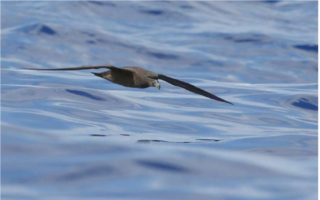
470-472 Mascarene Petrel / Réunionstormvogel Pseudobulweria aterrima , 16 km west of St Gilles, off Réunion, Indian Ocean, 9 December 2014