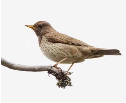
499 Black-throated Thrush / Zwartkeelijster Turdus atrogularis , Ural ridge west of Severouralsk, Ural mountains, Russia, 10 June 2014 (Josh Jones)