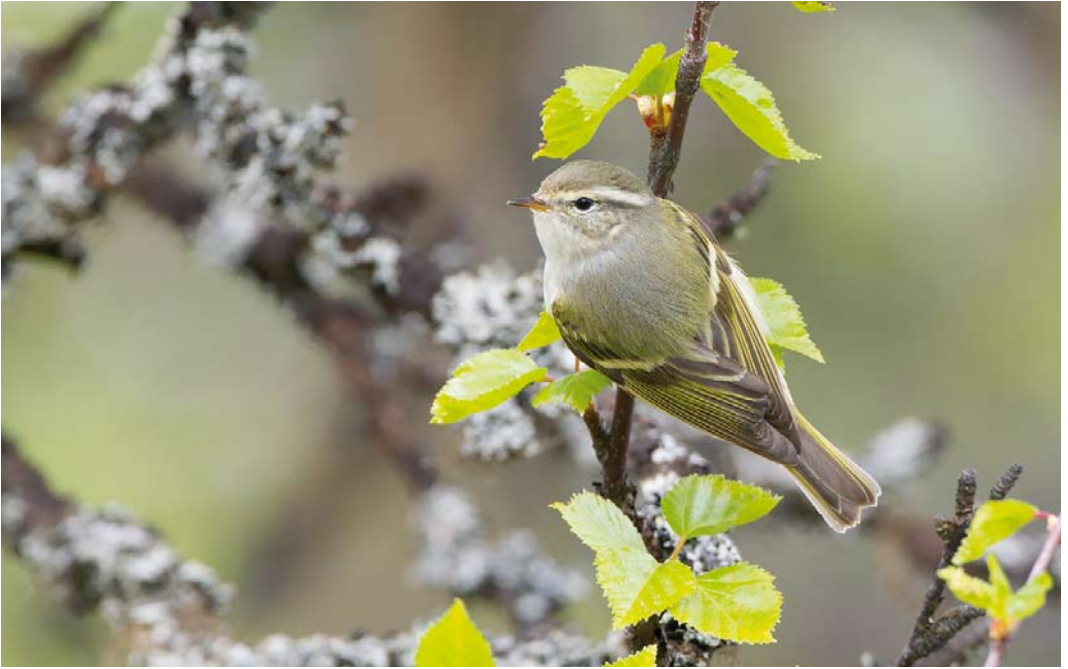
497 Yellow-browed Warbler / Bladkoning Phylloscopus inornatus , Ural ridge west of Severouralsk, Ural mountains, Russia, 11 June 2014 (David Monticelli)