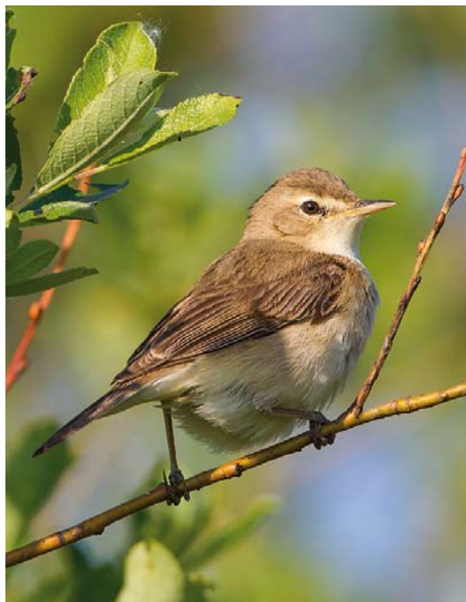
484 Booted Warbler / Kleine Spotvogel Iduna caligata , airport marshes near Bolshoy Istok, Yekaterinburg, Russia, 7 June 2014 (David Monticelli)