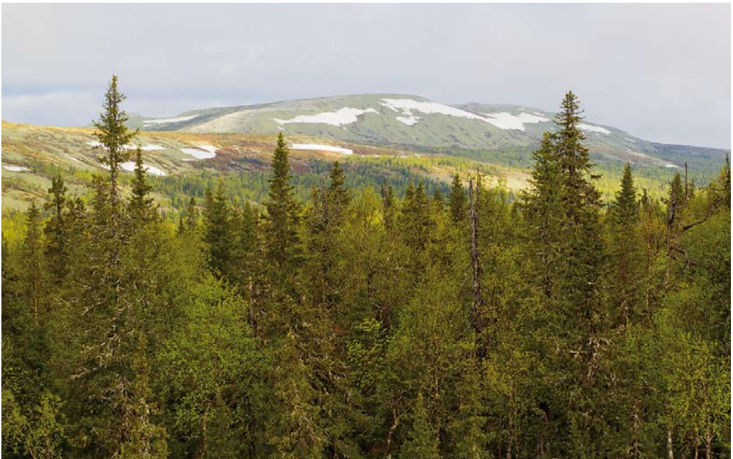
490 Ural ridge (distant view) with mixed coniferous forest, west of Severouralsk, Ural mountains, Russia, 10 June 2014

As around Yekaterinburg, this species is fairly common in the North Urals but again less numerous than Common Cuckoo. Nevertheless, their loud, softly resonating, Eurasian Hoopoe Upupa epops -like pu pu was omnipresent both along the main