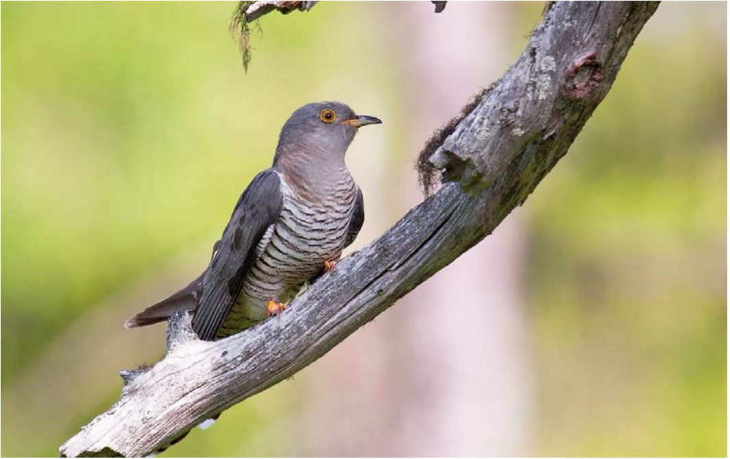
491 Oriental Cuckoo / Boskoekoek Cuculus optatus , Ural ridge west of Severouralsk, Ural mountains, Russia, 20 June 2015 (Felix Timmermann)

Ural ridge and also at Kvar Kush; males were usually audible from our campsites at both locations.