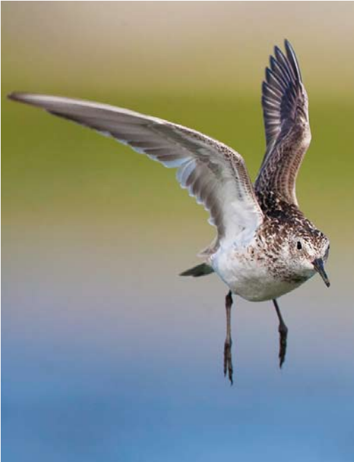
551 Bairds Strandloper / Baird's Sandpiper Calidris bairdii , adult, Mariëndal, Den Helder, Noord-Holland, 17 juli 2015 (Martijn Verdoes)