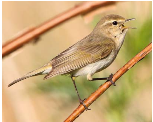
486 Steppe Gull / Barabameeuw Larus barabensis , Yekaterinburg, Russia, 20 June 2013 (Eric Didner) 487 Steppe Gull / Barabameeuw Larus barabensis , Yekaterinburg, Russia, 19 June 2013 (Eric Didner) 488 Oriental Cuckoo / Boskoekoek Cuculus optatus , marshes east of Monetnyy, Yekaterinburg, Russia, 8 June 2014 (David Monticelli) 489 Siberian Chiffchaff / Siberische Tjiftjaf Phylloscopus tristis , marshes east of Monetnyy, Yekaterinburg, Russia, 8 June 2014 (David Monticelli)