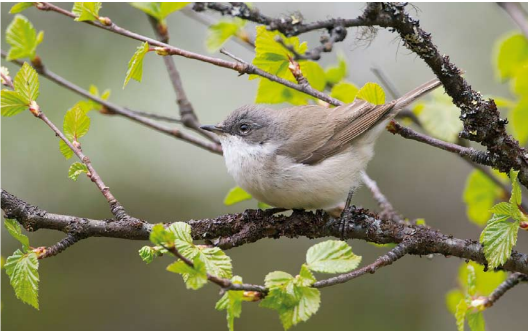
493 Siberian Lesser Whitethroat / Siberische Braamsluiper Sylvia althaea blythi , Ural ridge west of Severouralsk, Ural mountains, Russia, 11 June 2014 ( David Monticelli )