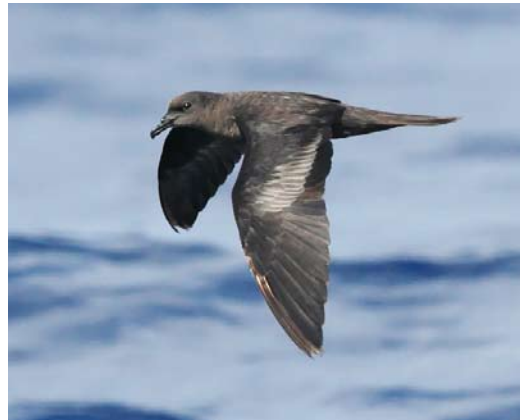
475 Tropical Shearwater / Baillons Kleine Pijlstormvogel Puffinus bailloni , off Réunion, Indian Ocean, 10 December 2014 (Mike Danzenbaker) 476 Tropical Shearwater / Baillons Kleine Pijlstormvogel Puffinus bailloni , off Réunion, Indian Ocean, 10 December 2014 (Kirk Zufelt) 477 Bulwer's Petrel / Bulwers Stormvogel Bulweria bulwerii , off Réunion, Indian Ocean, 11 December 2014 (Kirk Zufelt) 478 Bulwer's Petrel / Bulwers Stormvogel Bulweria bulwerii , off Réunion, Indian Ocean, 12 December 2014 (Mike Danzenbaker)

Phaethon lepturus , Brown Noddy Anous stolidus , Lesser Noddy A tenuirostris and Sooty Tern Onychoprion fuscatus .