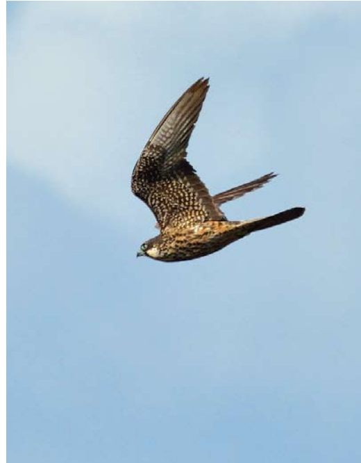
540 Eleonora's Falcon / Eleonora's Valk Falco eleonora , second calendar-year, Skagen, Nordjylland, Denmark, 15 September 2015 ( Niels Evald Jensen )

800 pairs in Slovakia and 40 pairs in Hungary (Slovak Raptor Journal 9, 2015). In the Biebrza valley, Poland, the proportion of pairs producing hybrids Greater Spotted x Lesser Spotted Eagle A clanga x pomarina increased by over 30% between 1996 and 2012. The percentage of territories occupied by pure Greater Spotted pairs had declined by 50% at the end of this period. The increasing number of mixed pairs correlated very significantly with the decreasing number of pairs of Greater Spotted, but weakly with the numbers of the more common Lesser Spotted. Mate replacement was frequently recorded, and favoured Lesser Spotted or hybrids (Acta Ornithol 50: 33-41, 2015, cf Dutch Birding 32: 384-397, 2010). In France, a subadult Spanish Imperial Eagle A adalberti was seen at Laroque-de-Fa, Aude, on 13 July and a second-year at Eyne, Pyrénées-Orientales, on 27 July. In June-July, 11 breeding pairs of Pallid Harrier Circus macrourus were found in Finland.