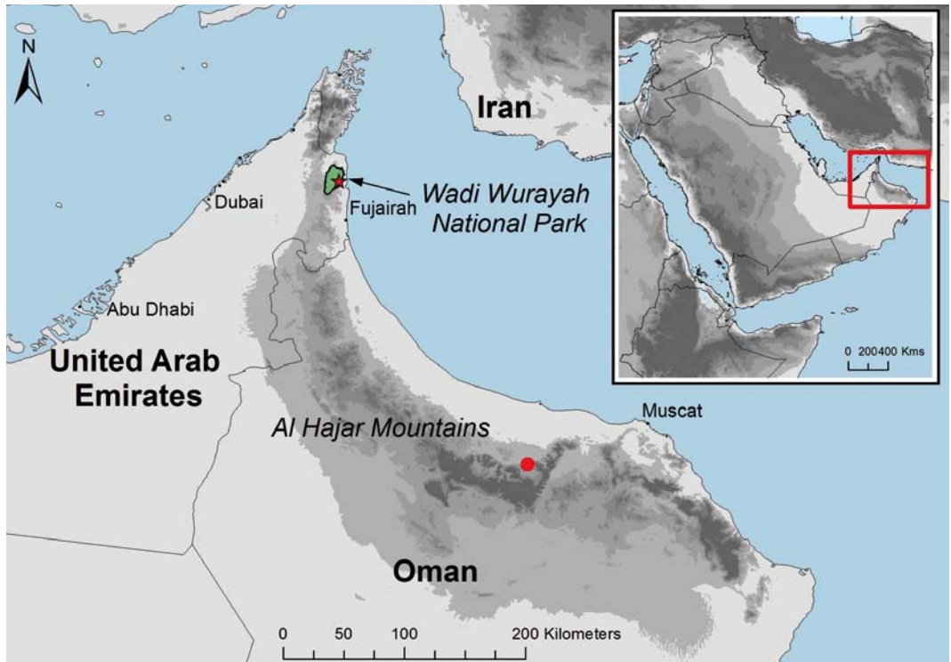
FIGURE 2 Map showing locations of Omani Owl in Al Hajar Mountains. Red star: new record from Wadi Wurayah National Park, UAE, presented in this note; red circle: location of Omani Owl in Oman (Robb et al 2013).

Robb, M & The Sound Approach 2015. Undiscovered owls: a Sound Approach guide. Poole.