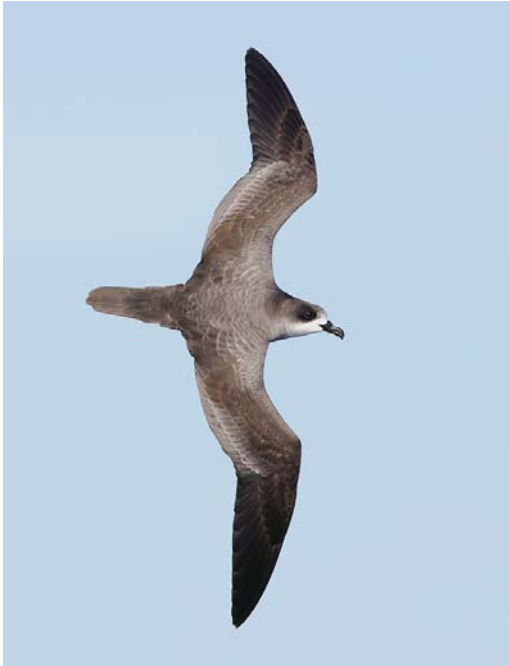
466 Barau's Petrel / Baraus Stormvogel Pterodroma barau , off Réunion, Indian Ocean, 7 December 2014