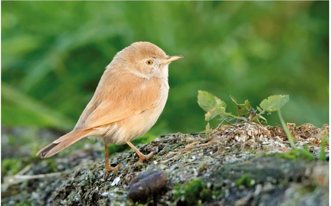
509 Afrikaanse Woestijngasmus / African Desert Warbler Sylvia deserti , Alphen aan den Rijn, Zuid-Holland, 29 november 2014 ( Michel Veldt )