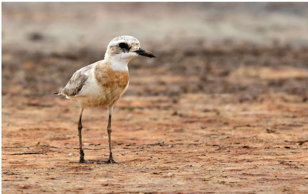
530 Greater Sand Plover / Woestijnplevier Charadrius leschenaultii , adult, Clauen, Niedersachsen, Germany, 20 July 2015 (Jens Voß)