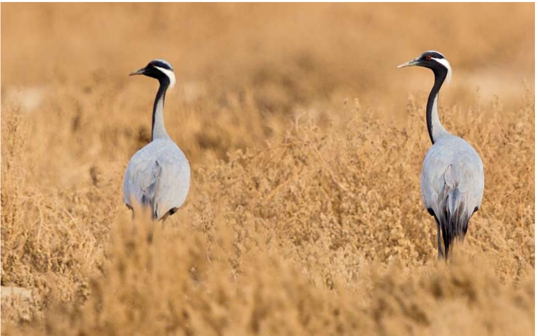
538 Demoiselle Cranes / Jufferkraanvogels Grus virgo , adult, Jahra pools reserve, Kuwait, 13 September 2015 (AbdulRahman Al-Sirhan)