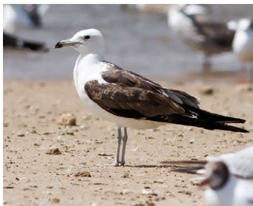
553 Vale Gier / Griffon Vulture Gyps fulvus , Harmelen, Utrecht, 7 augustus 20015 ( Michael Kars ) 554 Dwergarend / Booted Eagle Aquila pennata , lichte vorm, tweede-kalenderjaar, Veenklooster, Friesland, 2 juli 2015 ( Kees Bode ) 555 Grijsze Wouw / Black-winged Kite Elanus caeruleus , juveniel, Maashorst, Noord-Brabant, 4 augustus 2015 ( Alex Bos ) 556 Grijsze Wouw / Black-winged Kite Elanus caeruleus , adult, Marnewaard, Lauwersmeer, Groningen, 21 augustus 2015 ( Lazar Brinkhuizen ) 557 Roodpootvalk / Red-footed Falcon Falco vespertinus , juveniel, Vlieland, Friesland, 29 augustus 20015 ( Vincent Hart ) 558 Baltische Mantelmeeuw / Baltic Gull Larus fuscus fuscus , tweede-kalenderjaar, Arnhem, Gelderland, 26 juli 2015 ( Herman Bouman )