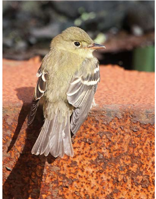
546 Acadian Flycatcher / Beukenfeetiran Empidonax virescens , first-calendar year, Dungeness, Kent, England, 22 September 2015 (Steve Nuttall) 547-548 Acadian Flycatcher / Beukenfeetiran Empidonax virescens , first-calendar year, Dungeness, Kent, England, 22 September 2015 (Martin Casemore)