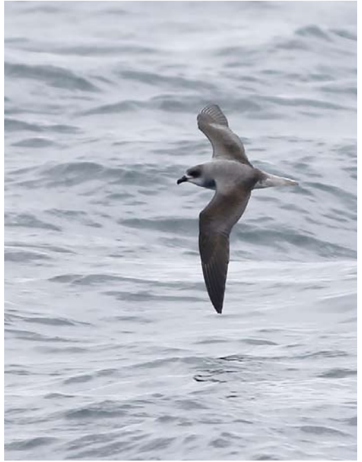
523-524 Fea's Petrel / Gon-gon Pterodroma feae , off Scilly, England, 16 August 2015