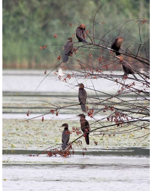
534 Black-winged Kite / Grijze Wouw Elanus caeruleus , juvenile, Maashorst, Noord-Brabant, Netherlands, 4 August 2015 535 Pygmy Cormorants / Dwergaalscholwers Phalacrocorax pygmeus , Spytkowice, Małopolska, Poland, 14 August 2015 536 Wilson's Phalarope / Grote Franjepoot Phalaropus tricolor , first-winter, with Pectoral Sandpiper / Gestreepte Strandloper Calidris melanotos , Goulven, Bretagne, France, 12 September 2015