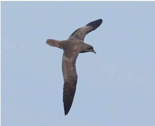
468-469 Mascarene Petrel / Réunionstormvogel Pseudobulweria aterrima , 30-32 km south-southwest of St Pierre, off Réunion, Indian Ocean, 8 December 2014

We found the field identification of Mascarene Petrel challenging because we lacked previous field experience of the species. Prior to the sighting of the first bird we had several 'false alarms' involving Wedge-tailed Shearwaters Puffinus pacificus flying away from the boat at mid-distance in