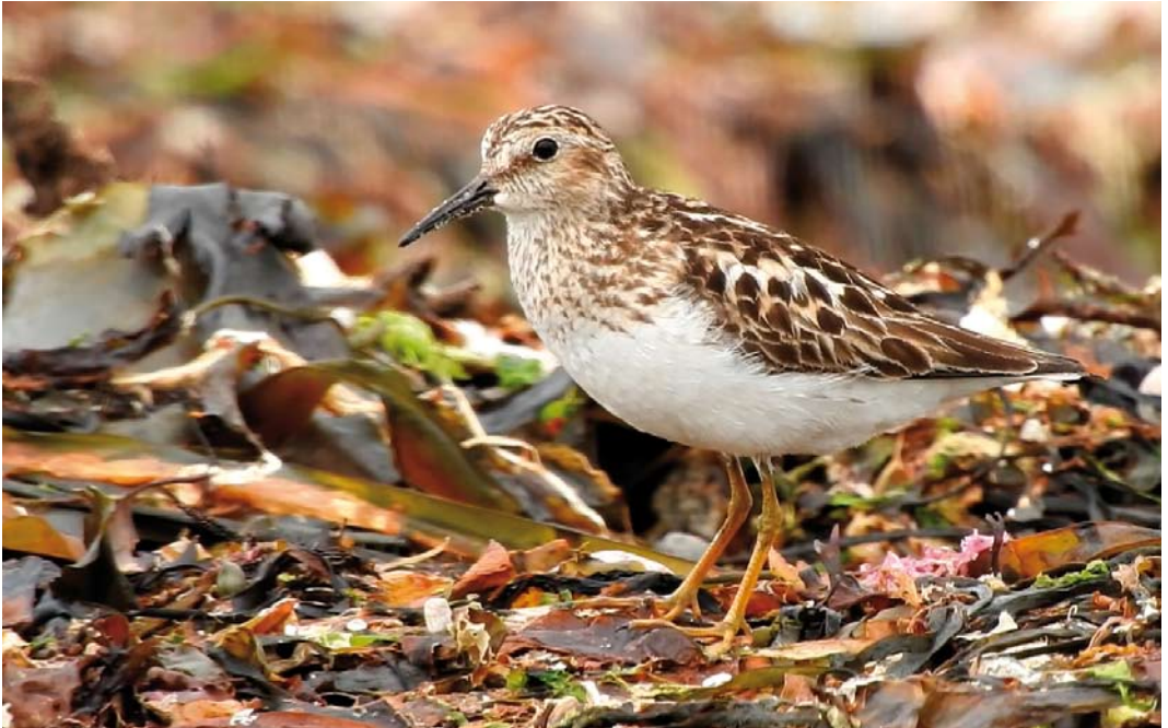
532 Least Sandpiper / Kleinste Strandloper Calidris minutilla , adult, St Agnes, Scilly, England, 17 July 2015 (Ashley Fisher) cf Dutch Birding 37: 268, 2015