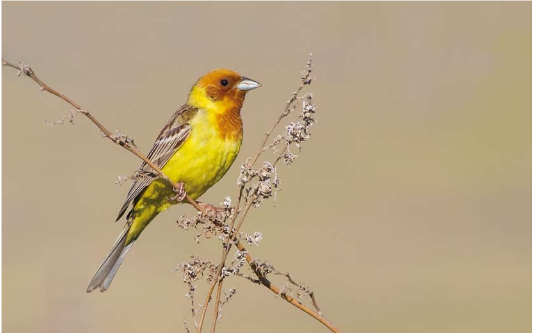
502 Red-headed Bunting / Bruinkopgors Emberiza bruniceps , male, near Malokhalilovo, north-west of Orsk, Orenburg Oblast, Russia, 17 June 2014 ( Josh Jones ) 503 Paddyfield Warbler / Veldrietzanger Acrocephalus agricola , Ural valley north of Orsk, Orenburg Oblast, Russia, 16 June 2014 ( Josh Jones ) 504 Siberian Stonechat / Aziatische Roodborsttapuit Saxicola maurus maurus , male, near Gaynulino, north-west of Orsk, Orenburg Oblast, Russia, 17 June 2014 ( Josh Jones )