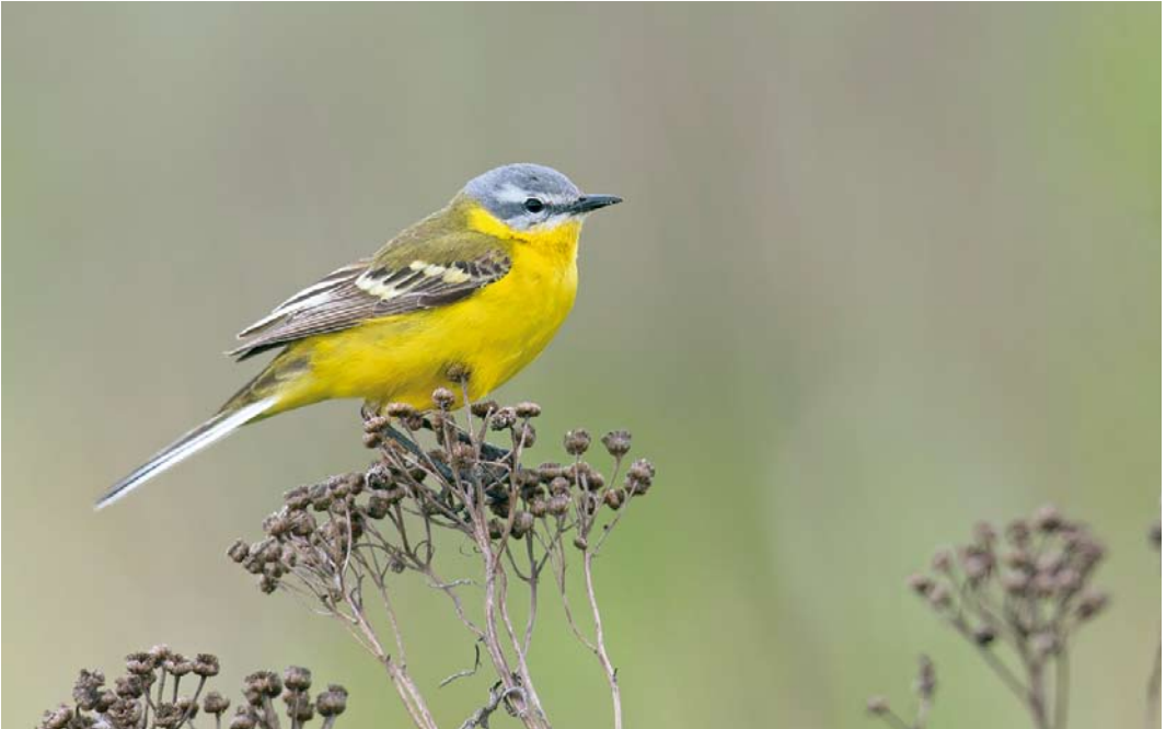
482 Sykes's Blue-headed Wagtail / Russische Gele Kwikstaart Motacilla flava beema , marshes east of Monetnyy, Yekaterinburg, Russia, 9 June 2015