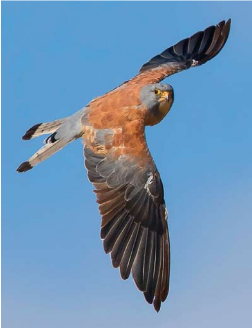
539 Lesser Kestrel / Kleine Torenvalk Falco naumanni , second calendar-year male, Bántorf, Niedersachsen, Germany, 23 August 2015 ( Jens Voß )