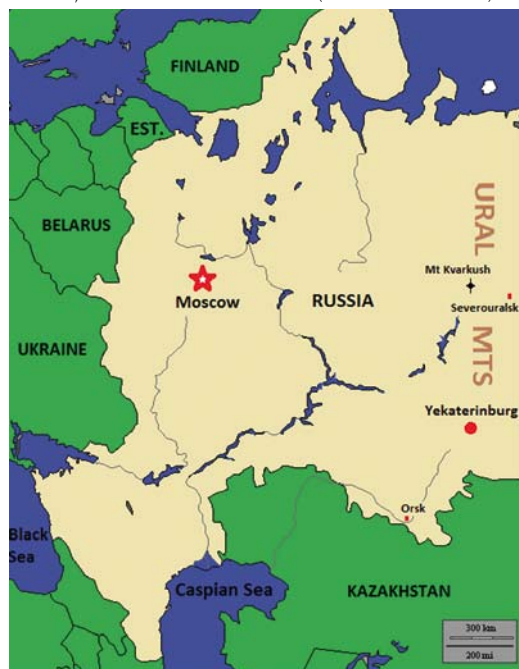
FIGURE 1 Map of European Russia and adjacent countries, with localities of interest (see text for details)

In terms of accommodation, camping is the only possibility in the North Urals. We also camped on the steppe of the Orenburg region, although there are presumably hostels/hotels in some of the local towns in the region. When around Yekaterinburg, the 2014 crew based itself at the Liner Hotel ( www.vi-hotels.com/en/liner ), situated just a few 100 m from the terminal at Koltsovo Airport. Prices here are comparatively cheap, and the food in the hotel's restaurant is of good quality and served 24 hours a day due to airline personnel using the hotel as a base (very useful when returning from a long day in the field). The French crew slept outside (in the car) for most of the nights around Yekaterinburg and experienced no problems; in fact, Russians are quite fond of outdoor activities and often camp outside themselves.