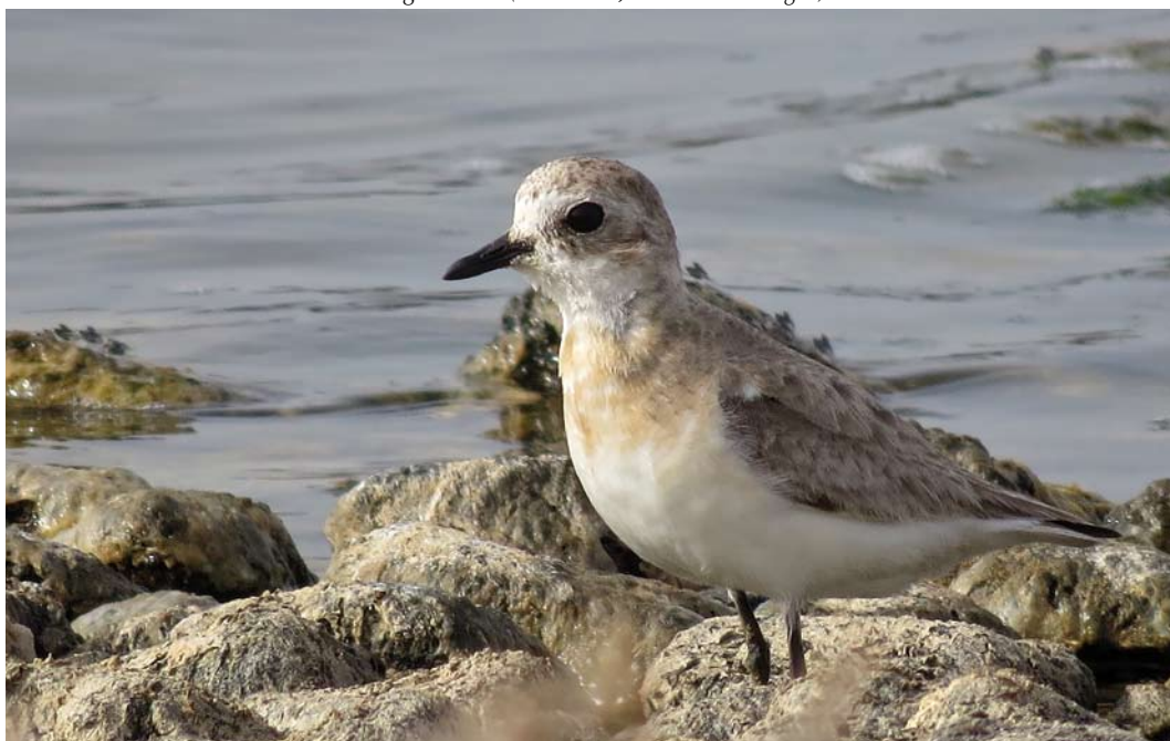
531 Lesser Sand Plover / Tibetaanse Plevier Charadrius atrifrons , adult female, Lanzarote, Canary Islands, 7 August 2015 (Francisco Javier García Vargas)