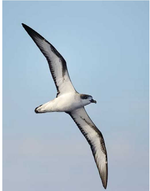
467 Barau's Petrel / Baraus Stormvogel Pterodroma barau , off Réunion, Indian Ocean, 7 December 2014 (Kirk Zufelt)

den Berg et al 1991, Stahl & Bartle 1991, Robertson 1994, Pinet et al 2011b), but this is uncertain due to problems with at-sea recognition (Shirihai et al 2014).