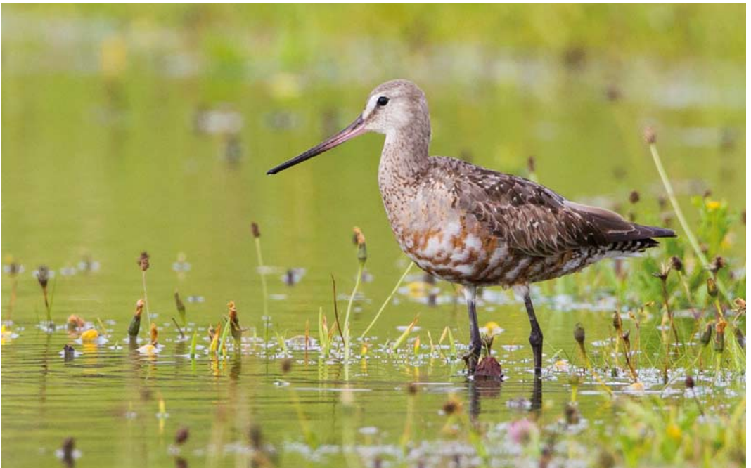
525 Hudsonian Godwit / Rode Grutto Limosa haemastica , adult, Inismor, Galway, Ireland, 17 September 2015 (David Monticelli)