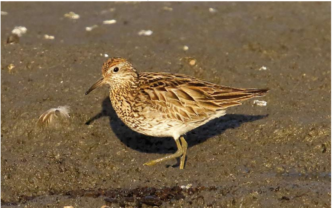
533 Sharp-tailed Sandpiper / Siberische Strandloper Calidris acuminata , adult, Camperduin, Noord-Holland, Netherlands, 7 September 2015 (Eric Menkveld)