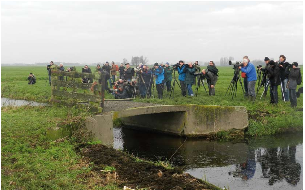
510 Vogelaars bij Afrikaanse Woestijngasmus Sylvia deserti , Alphen aan den Rijn, Zuid-Holland, 28 november 2014