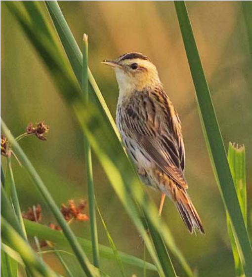
564 Waterrietzanger / Aquatic Warbler Acrocephalus paludicola , eerstejaars, Lentevreugd, Wassenaar, Zuid-Holland, 2 augustus 2015 (Martin van der Schalk)