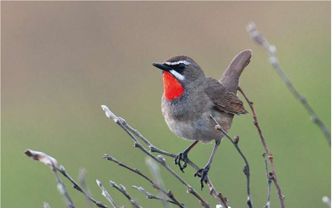
492 Siberian Rubythroat / Roodkeelnachtegaal Calliope calliope , male, mount Kvarkush, west of Severouralsk, Ural mountains, Russia, 18 June 2015