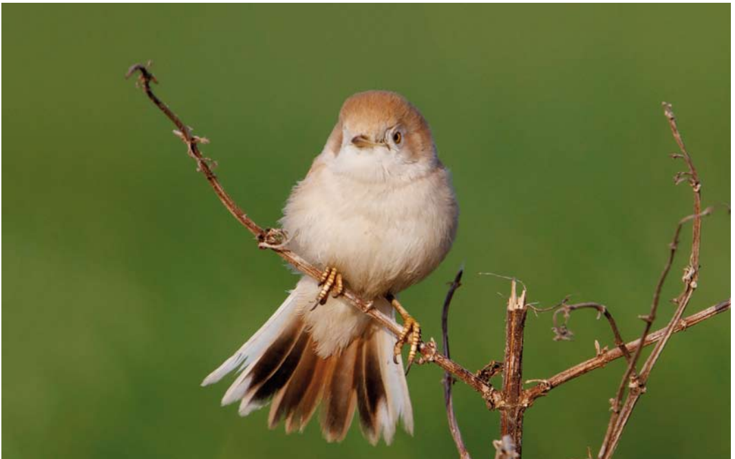
508 Afrikaanse Woestijngrasmus / African Desert Warbler Sylvia deserti , Alphen aan den Rijn, Zuid-Holland, 29 november 2014 (Oscar Balm)