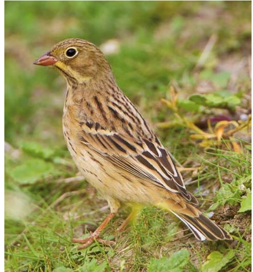
565 Ortolaan / Ortolan Bunting Emberiza hortulana , Maasvlakte, Zuid-Holland, 30 augustus 2015

een adulte Struikrietzanger Acrocephalus dumetorum op 2 augustus op Goeree, Zuid-Holland. In augustus waren er ten minste 20 veldwaarnemingen van Waterrietzanger A. paludicola . Vergeleken hiermee stelde het aantal van 10 ringvangsten enigszins teleur. In augustus werden vier Grote Karekieten A. arundinaceus geringd. Een Graszanger Cisticola juncidis werd regelmatig waargenomen in het Verdrongen Land van Saeftinghe, Zeeland.