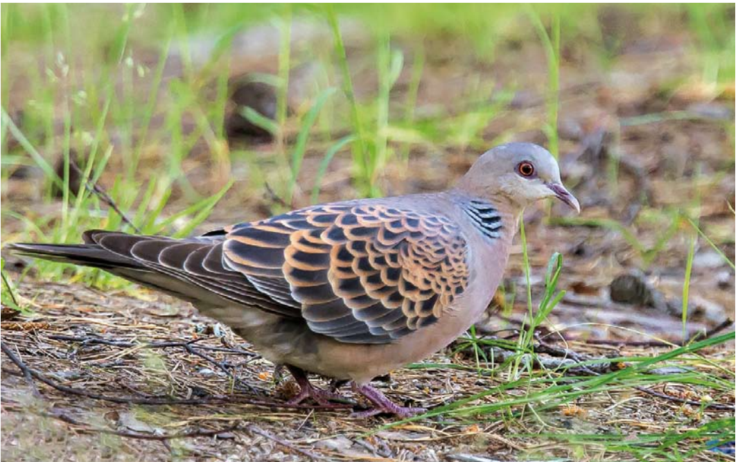
483 Rufous Turtle Dove / Meenatortel Streptopelia orientalis meena, near Nevyansk, Yekaterinburg, Russia, 17 June 2013