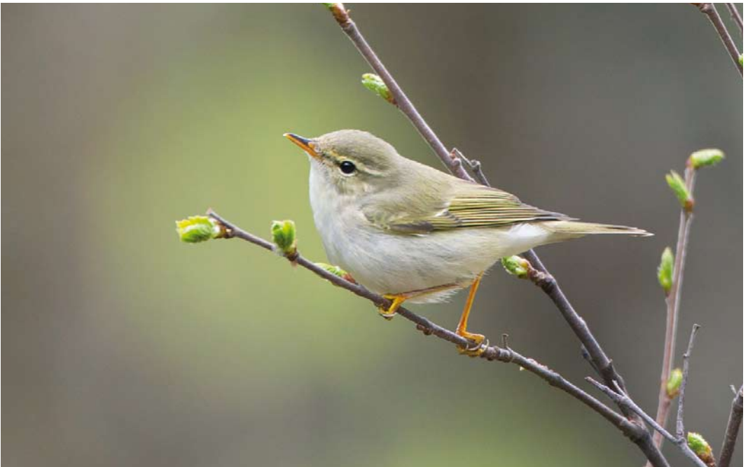
498 Arctic Warbler / Noordse Boszanger Phylloscopus borealis , Ural ridge west of Severouralsk, Ural mountains, Russia, 10 June 2014 (David Monticelli)