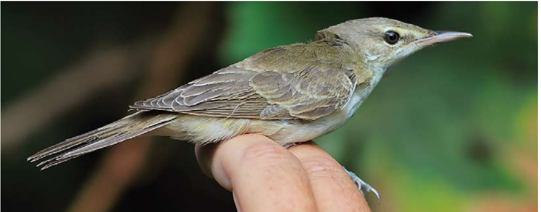
541 Eastern Olivaceous Warbler / Oostelijke Vale Spotvogel Iduna pallida , Gravelines, Nord, France, 8 September 2015 ( Quentin Dupriez ) 542 Pine Bunting / Witkopgors Emberiza leucocephalos , first-year female, Jeziorsko reservoir, Łódzkie, Poland, 13 September 2015 ( Marcin Faber ) 543 Desert Wheatear / Woestijntapuit Oenanthe deserti , adult male, Hinterhornbach, Tirol, Austria, 6 September ( Manfred Schmid ) 544 American Yellow Warbler / Gele Zanger Setophaga aestiva , Lugar de Baixo, Madeira, 20 August 2015 ( Tor Olsen ) 545 Basra Reed Warbler / Basrakarekiet Acrocephalus griseldis , adult, Agamon Hula Ringing Station, Israel, 19 August 2015 ( Natan Eidelstein/KKL-JNF Wings )