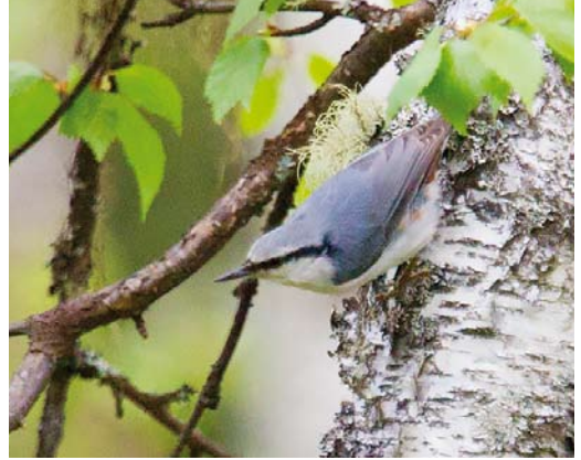
500 Asian Nuthatch / Aziatische Boomklever Sitta europaea asiatica , Ural ridge west of Severouralsk, Ural mountains, Russia, 12 June 2013

poor weather on 13 June, one of which gave occasional bursts of sub-song – their behaviour suggested that they had only recently arrived. Good weather and improved coverage in 2015 resulted in the most productive year so far, with at least six males recorded from 15 June at five different locations spread widely across the plateau.