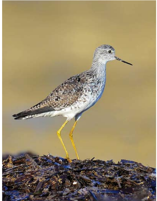
520 Lesser Yellowlegs / Kleine Geelpootruiter Tringa flavipes , Riviera Martinique, Malta, 22 May 2015

Lesser Yellowlegs breeds in northern North America and migrates to the Gulf coast of the USA and south to South America. It is a regular vagrant to western Europe (mainly in spring, summer and autumn) and has been recorded from most European countries (Perrins 1998), and also in, eg, Israel, Morocco, Oman and Turkey. The first for nearby Tunisia was on 18 March 2014 (Bradshaw 2015) and there was another report on 5 May 2015 ( www.hbw.com/report/lesser-yellowlegs-tunisia ). There was a first-winter bird in Sicily, Italy, on 30