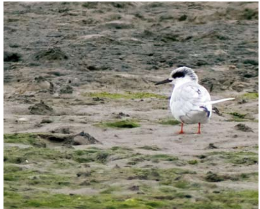
526 Dalmatian Pelican / Kroeskoppelikaan Pelecanus crispus, second calendar-year, Występ, Kujawsko-Pomorskie, Poland, 15 August 2015 527 Atlantic Great Cormorant / Grote Aalscholver Phalacrocorax carbo carbo, first-year, Artis, Amsterdam, Noord-Holland, Netherlands, 14 August 2015. Ringed as nestling in Västergötland, Sweden, on 9 June 2015. 528 Sooty Tern / Bonte Stern Onychoprion fuscatus, juvenile, Ilheu da Praia, Graciosa, Azores, 25 August 2015 529 Forster's Tern / Forsters Stern Sterna forsteri, adult, Rogerstown Estuary, Dublin, Ireland, 7 September 2015

naultii were seen at Dieksanderkoog, Schleswig-Holstein, Germany, on 19-31 July; at Clauen, Niedersachsen, Germany, on 20-22 July; and at Hyères, Var, France, on 7-8 August (second-year). An adult female Lesser Sand Plover C atrifrons was found on Lanzarote, Canary Islands, on 7 August. If accepted, a Caspian Plover C asiaticus at Ruan, Loiret, from 11 September will be the fifth for France. An Upland Sandpiper Bartramia longicauda at Banc d'Arguin on 5 September was the second for Mauritania (the first was in 1986) and the third for Africa. Adult Sharp-tailed Sandpipers Calidris acuminata stayed at Camperduin, Noord-Holland, the Netherlands, from 6 to at least 17 September, and at Langåker, Lista, Vest-Agder, Norway, on 7 September. In the Azores, no less than 40 White-rumped Sandpipers C fuscicollis were present at Ponta de Escalvado, São Miguel, on 23 August. Others were found in July-August in Britain (at least