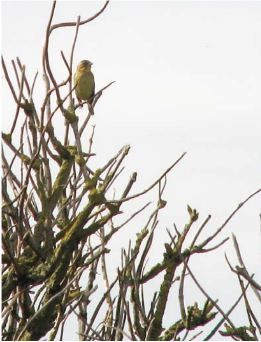
522 Yellow-breasted Bunting / Wilgengors Emberiza aureola , female or first-year, Boschplaat, Terschelling, Friesland, Netherlands, 11 September 2010. The most recent Yellow-breasted Bunting in the Netherlands.

follow the same fate: in 2011, Chinese police confiscated two million songbirds in two cities, including many buntings of various species. (Kamp et al 2015). However, with international support against these illegal trapping events, it may be possible to reverse these dramatic declines. A first step is made, as the Convention on Migratory Species has agreed to develop an international action plan for the recovery of Yellow-breasted Bunting populations and to combat illegal trapping throughout the world (CMS 2015).