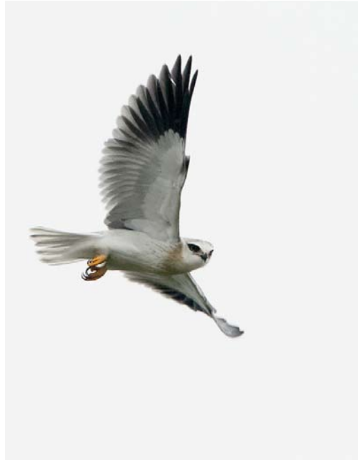
552 Grijsze Wouw / Black-winged Kite Elanus caeruleus , juveniel, Maashorst, Noord-Brabant, 4 augustus 2015

stapje naar Zwitserland verbleef de ongeringde Roze Pelikaan Pelecanus onocrotalus van 13 augustus tot 10 september langs de IJssel bij Arnhem en Westervoort in Gelderland. Vanaf 11 september deed hij België aan. Eén of meer eerste-kalenderjaar vogels, naar verluidt afkomstig uit Artis in Amsterdam, Noord-Holland, werden opgemerkt op 28 augustus boven de Haarlemmermeer, Noord-Holland, en Leiden, Zuid-Holland, en op 29 augustus vliegend van IJmuiden tot voorbij Camperduin, Noord-Holland. Er werden slechts vijf Koereigers Bubulcus ibis gemeld. De grootste groep Zwarte Ibsissen Plegadis falcinellus (maximaal vijf) verbleef ditmaal bij Koedijk, Noord-Holland. In totaal werden c 20 vogels waargenomen. Een Grote Aalscholver Phalacrocorax carbo carbo die vanaf 14 augustus in Artis in Amsterdam verbleef, bleek als nestjong te zijn geringd op 9 juni 2015 in Västergötland, Zweden (waar dit taxon niet bekend is als broedvogel).