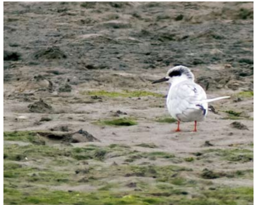
526 Dalmatian Pelican / Kroeskoppelikaan Pelecanus crispus, second calendar-year, Występ, Kujawsko-Pomorskie, Poland, 15 August 2015 527 Atlantic Great Cormorant / Grote Aalscholver Phalacrocorax carbo carbo, first-year, Artis, Amsterdam, Noord-Holland, Netherlands, 14 August 2015. Ringed as nestling in Västergötland, Sweden, on 9 June 2015. 528 Sooty Tern / Bonte Stern Onychoprion fuscatus, juvenile, Ilheu da Praia, Graciosa, Azores, 25 August 2015 529 Forster's Tern / Forsters Stern Sterna forsteri, adult, Rogerstown Estuary, Dublin, Ireland, 7 September 2015

naultii were seen at Dieksanderkoog, Schleswig-Holstein, Germany, on 19-31 July; at Clauen, Niedersachsen, Germany, on 20-22 July; and at Hyères, Var, France, on 7-8 August (second-year). An adult female Lesser Sand Plover C atrifrons was found on Lanzarote, Canary Islands, on 7 August. If accepted, a Caspian Plover C asiaticus at Ruan, Loiret, from 11 September will be the fifth for France. An Upland Sandpiper Bartramia longicauda at Banc d'Arguin on 5 September was the second for Mauritania (the first was in 1986) and the third for Africa. Adult Sharp-tailed Sandpipers Calidris acuminata stayed at Camperduin, Noord-Holland, the Netherlands, from 6 to at least 17 September, and at Langåker, Lista, Vest-Agder, Norway, on 7 September. In the Azores, no less than 40 White-rumped Sandpipers C fuscicollis were present at Ponta de Escalvado, São Miguel, on 23 August. Others were found in July-August in Britain (at least