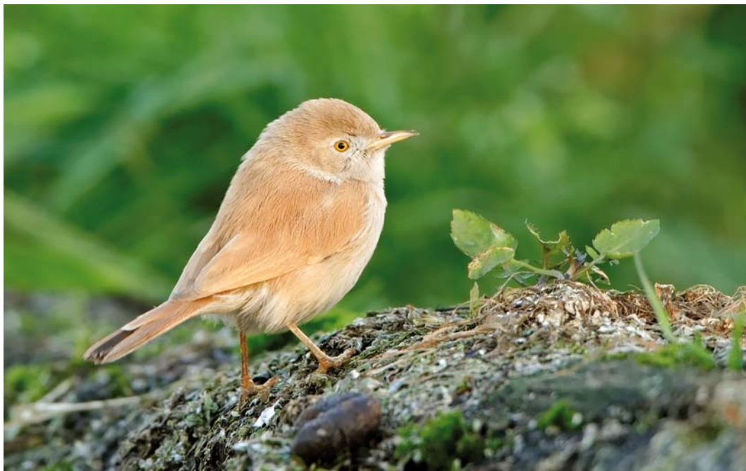
509 Afrikaanse Woestijngasmus / African Desert Warbler Sylvia deserti , Alphen aan den Rijn, Zuid-Holland, 29 november 2014