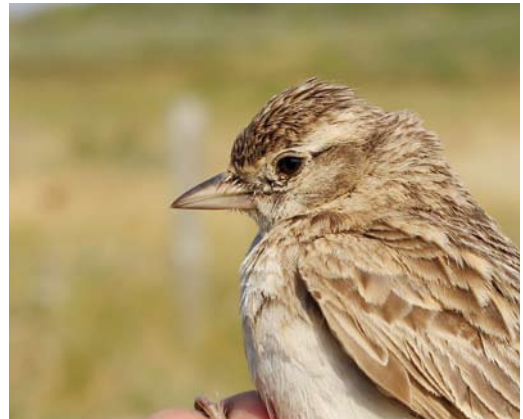
559 Kuifkoekoek / Greater Spotted Cuckoo Clamator glandarius , juveniel, Ouddorp, Zuid-Holland, 16 juli 2015 560 Bergfluitier / Western Bonelli's Warbler Phylloscopus bonelli , eerstejaars, Oost-Vlieland, Vlieland, Friesland, 29 augustus 2015 561 Citroenkwikstaart / Citrine Wagtail Motacilla citreola , eerstejaars, Robbenjager, Texel, Noord-Holland, 29 augustus 2015 562 Kortteenleeuwrik / Greater Short-toed Lark Calandrella brachydactyla , Noordhollands Duinreservaat, Castricum, Noord-Holland, 2 juli 2015

ding bij Camperduin. Een (ongeringde) tweede-kalenderjaar Baltische Mantelmeeuw Larus fuscus fuscus bevond zich van 22 tot 30 juli in Arnhem. Een andere werd gemeld op 16 augustus in Katwijk, Zuid-Holland. Bij Nieuwe Pekela, Groningen, werden op 30 juli maximaal 31 Lachsterns Gelochelidon nilotica geteld (27 adulte en vier juveniele). Het hoogste aantal op de slaapplaats op het Balgzand, Noord-Holland, was 28 op 7 augustus (19 adulte en negen juveniele). Een landelijke slaapplaatsstelling van Reuzensterns Hydroprogne caspia op 21 augustus resulteerde in een totaal van 148; het hoogste aantal tijdens eerdere tellingen betrof 153 op 30 augustus 2013. In de Kropswolderbuitenpolder, Groningen, werden nog maximaal vier Witwangsterns Chlidonias hybrida waargenomen en elders werd nog een handvol gemeld. Witvleugelsterns C leucopterus brachten in de Kropswolderbuitenpolder ten minste drie