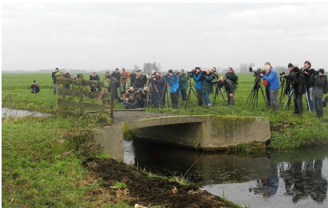
510 Vogelaars bij Afrikaanse Woestijngasmus Sylvia deserti , Alphen aan den Rijn, Zuid-Holland, 28 november 2014