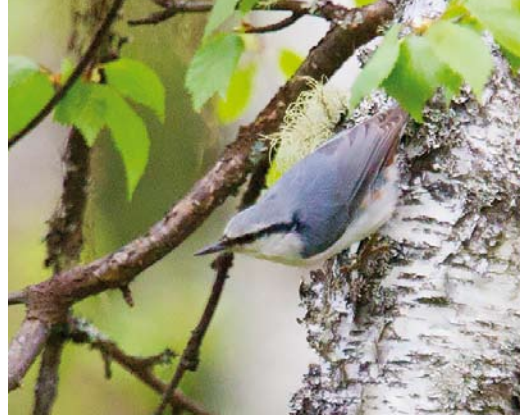
500 Asian Nuthatch / Aziatische Boomklever Sitta europaea asiatica , Ural ridge west of Severouralsk, Ural mountains, Russia, 12 June 2013 (Eric Didner)

poor weather on 13 June, one of which gave occasional bursts of sub-song – their behaviour suggested that they had only recently arrived. Good weather and improved coverage in 2015 resulted in the most productive year so far, with at least six males recorded from 15 June at five different locations spread widely across the plateau.