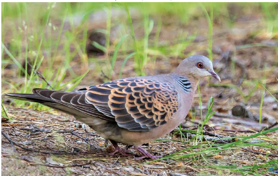
483 Rufous Turtle Dove / Meenatortel Streptopelia orientalis meena, near Nevyansk, Yekaterinburg, Russia, 17 June 2013