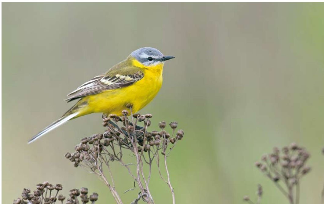
482 Sykes's Blue-headed Wagtail / Russische Gele Kwikstaart Motacilla flava beema , marshes east of Monetnyy, Yekaterinburg, Russia, 9 June 2015 ( Felix Timmermann )