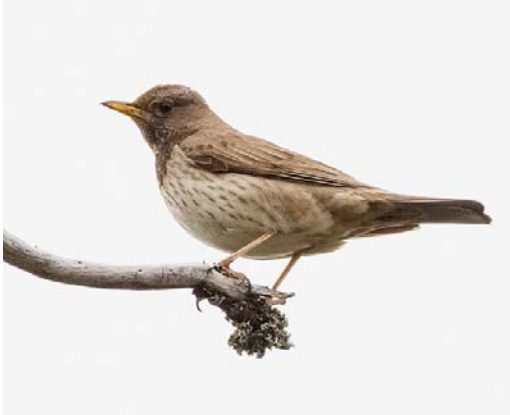
499 Black-throated Thrush / Zwartkeelijster Turdus atrogularis , Ural ridge west of Severouralsk, Ural mountains, Russia, 10 June 2014