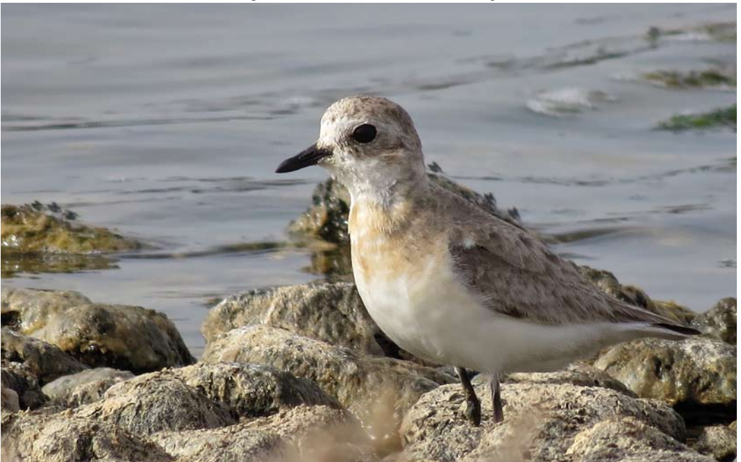
531 Lesser Sand Plover / Tibetaanse Plevier Charadrius atrifrons , adult female, Lanzarote, Canary Islands, 7 August 2015 (Francisco Javier García Vargas)