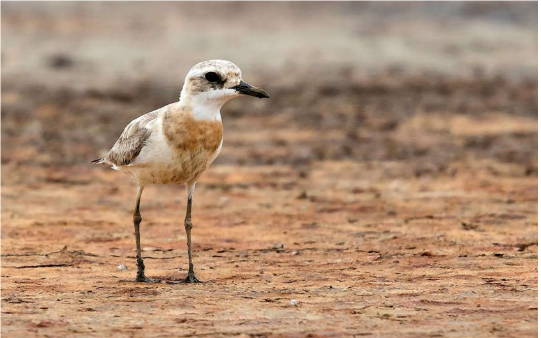
530 Greater Sand Plover / Woestijnplevier Charadrius leschenaultii , adult, Clauen, Niedersachsen, Germany, 20 July 2015 (Jens Voß)