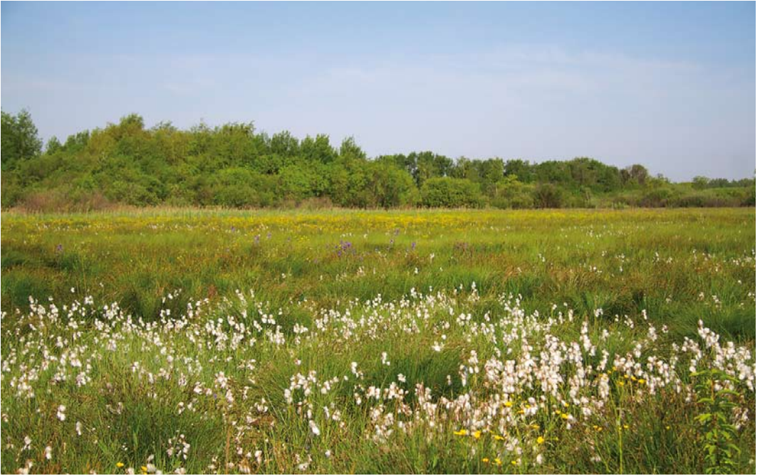
479 Airport marshes near Bolshoy Istok, Yekaterinburg, Russia, 19 June 2013 ( Eric Didner ) 480 Azure Tit / Azuurmeees Cyanistes cyanus , marshes east of Monetnyy, Yekaterinburg, Russia, 8 June 2014 ( David Monticelli ) 481 Long-tailed Rosefinch / Langstaartroodmus Carpodacus sibiricus , marshes east of Monetnyy, Yekaterinburg, Russia, 8 June 2014 ( David Monticelli )