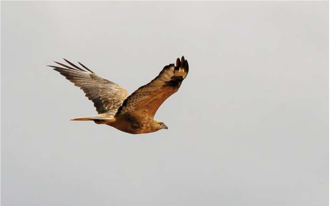
537 Long-legged Buzzard / Arendbuijzard Buteo rufinus , second calendar-year, Goddelsheimer Hochfläche, Hessen, Germany, 19 September 2015 (Martin Gottschling)