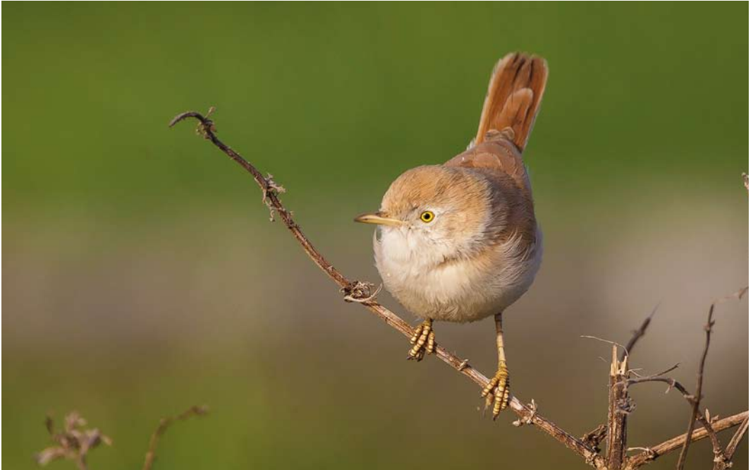
507 Afrikaanse Woestijngrasmus / African Desert Warbler Sylvia deserti, Alphen aan den Rijn, Zuid-Holland, 29 november 2014 2014