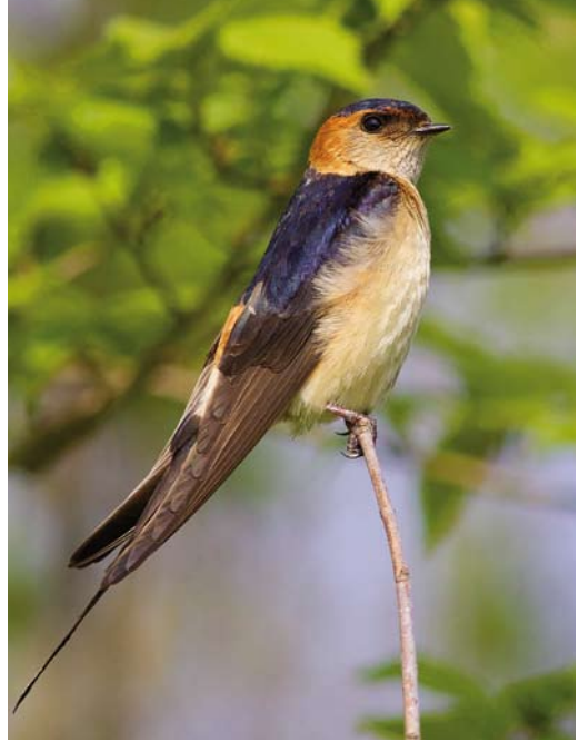
447 Roze Spreeuw / Rosy Starling Pastor roseus , Barneveld, Gelderland, 9 juni 2015 448 Roodstuitzwaluw / Red-rumped Swallow Cecropis daurica , Den Hoorn, Texel, Noord-Holland, 17 mei 2015 449 Vermoedelijke Witbandkruisbek / presumed Two-barred Crossbill Loxia leucoptera , vrouwtje, met Kruisbek / Red Crossbill L. curvirostra , Uden, Noord-Brabant, 17 juni 2015