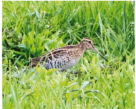
432 Franklins Meeuw / Franklin's Gull Larus pipixcan , eerste-zomer, Grote Brekken, Lemmer, Friesland, 23 mei 2015 433 Amerikaanse Goudplevier / American Golden Plover Pluvialis dominica , Breebaartpolder, Groningen, 16 mei 2015 434 Poelsnip / Great Snipe Gallinago media , Velp, Gelderland, 24 mei 2015 435 Poelsnip / Great Snipe Gallinago media , Velp, Gelderland, 23 mei 2015

Weerribben, Overijssel. Meldingen van Kleinste Waterhoenders P pusilla kwamen alleen uit het noordoosten: van 17 mei tot 19 juni in De Onlanden, Drenthe (ten minste vier); van 22 tot 27 mei in de Weerribben (drie); en vanaf 13 juni een paar dat tot broeden kwam in de Onnerpolder, Groningen. De twee Ijsduikers Gavia immer in (grotendeels) zomerkleed bleven tot 16 mei op het Volkerak, Zuid-Holland. De ongeringde Roze Pelikaan Pelecanus onocrotalus bleef tot ten minste 6 juni in Callantsoog, Noord-Holland, en werd nadien nog opgemerkt op 8 juni bij Westzaan, Noord-Holland; van 8 tot 11 juni bij Castricum; op 11 juni langs Berkel en Rodenrijs, Zuid-Holland; en later in de maand juni in Zwitserland. Het aantal waarnemingen van Koereigers Bubulcus ibis bleef steken op zeven. In het Lauwersmeergebied, Friesland, werd voor het eerst een broedgeval van Kleine Zilverreiger Egretta garzetta vastgesteld. In totaal werden c 20 Zwarte Ibsissen Plegadis falcinellus waargenomen, waaronder maximaal vijf bij