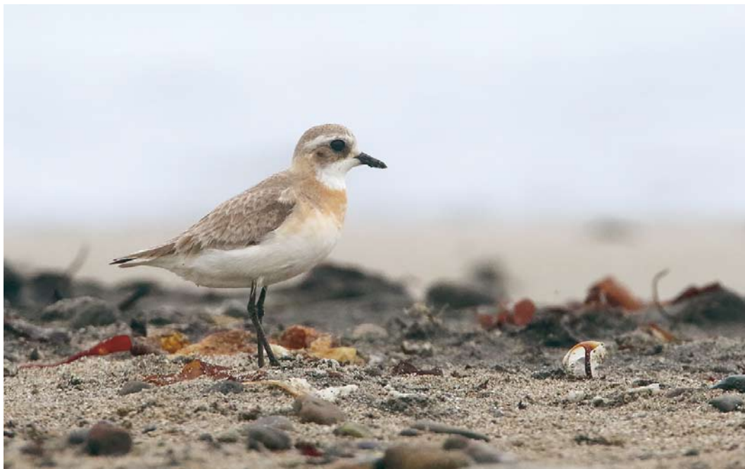
411 Mongolian/Lesser Sand Plover / Mongoolse/Tibetaanse Plevier Charadrius mongolus/atrifrons , adult, Farsund, Vest-Agder, Norway, 27 June 2015 (Jonas Langbråten)