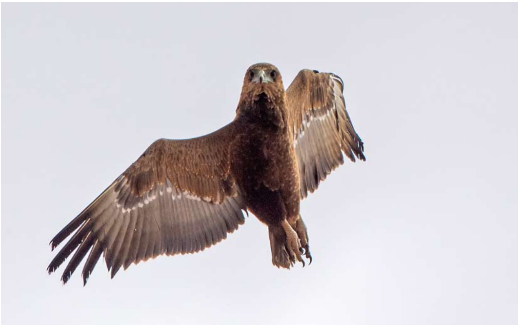
405 Bateleur / Bateleur Terathopius ecaudatus , second calendar-year, Gal'on, Judean Plains, Israel, 10 June 2015