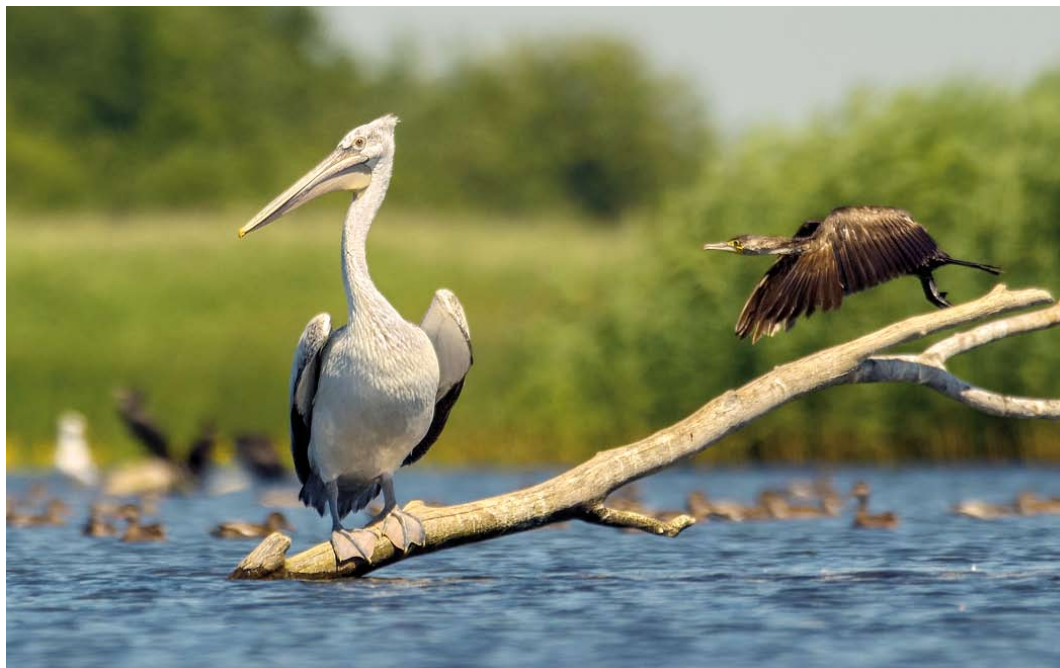
413 Dalmatian Pelican / Kroeskoppelikaan Pelecanus crispus , second calendar-year, Nemunas delta, Lithuania, 3 July 2015