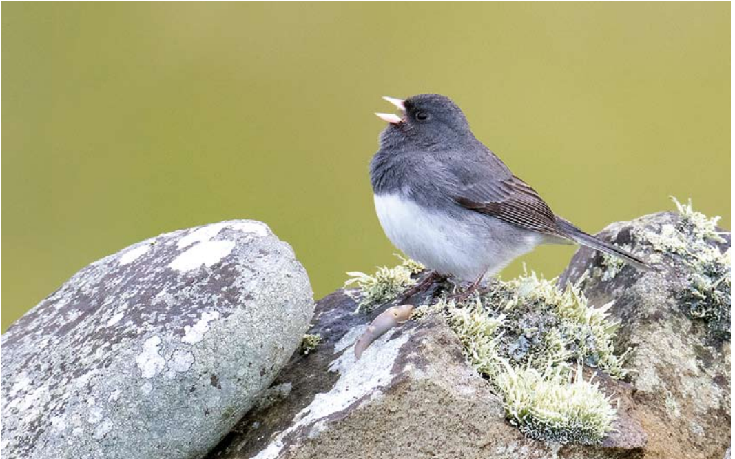
426 Dark-eyed Junco / Grijze Junco Junco hyemalis , Toab, Mainland, Shetland, 11 May 2015