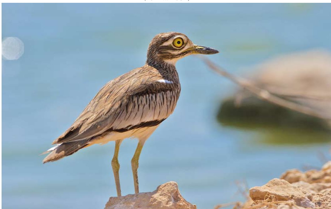
412 Senegal Thick-knee / Senegalese Griel Burhinus senegalensis , Ma'agan Michael, Israel, 8 July 2015 (Rami Mizrahi)