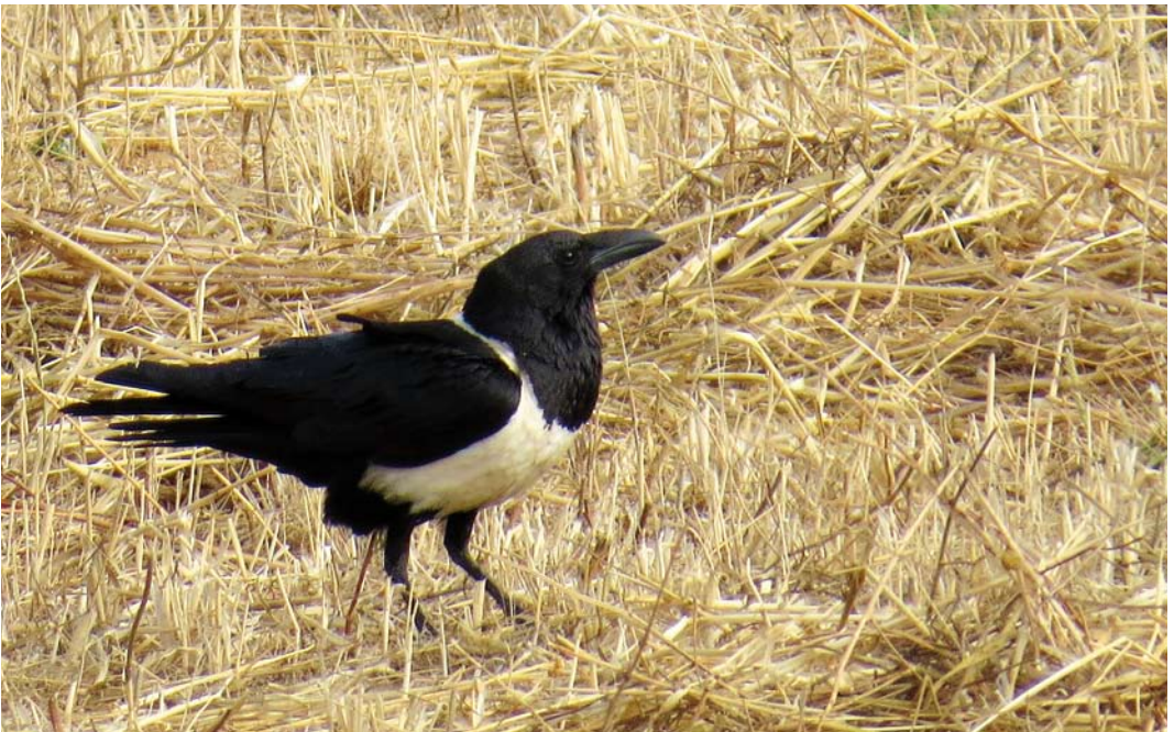
427 Pied Crow / Schildraaf Corvus albus , adult, Sesimbra, Setúbal, Portugal, 30 June 2015 (Luís Gordinho)