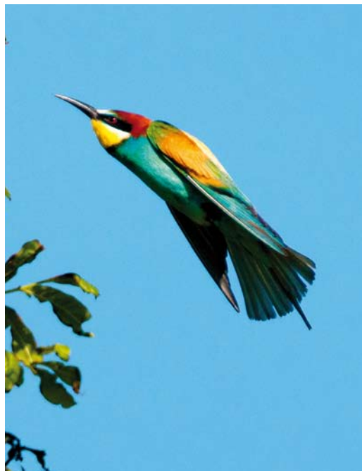
444 Roodsterblauwborst / Red-spotted Bluethroat Luscinia svecica svecica , mannetje, Blijham, Groningen, 24 juni 2015 445 Bijeneter / European Bee-eater Merops apiaster , De Cocksdoorp, Texel, Noord-Holland, 10 juni 2015 446 Citroenkwikstaart / Citrine Wagtail Motacilla citreola , eerste-zomer mannetje, Noordervroon, Westkapelle, Zeeland, 7 mei 2015