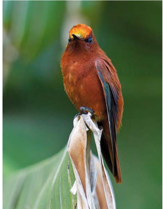
4 Juan Fernández Firecrown / Juan-Fernándezkolibri Sephanooides fernandensis, male, Robinson Crusoe Island, Chile, 7 March 2013.

Masafuera is one of the most important sites for breeding petrels in the eastern Pacific and, despite being a World Heritage Site, we have little hope for the two endemic petrels without eradication of the introduced fauna (rats, mice, cats and goats) from the island. Furthermore, permanent or regular monitoring of the populations is lacking.