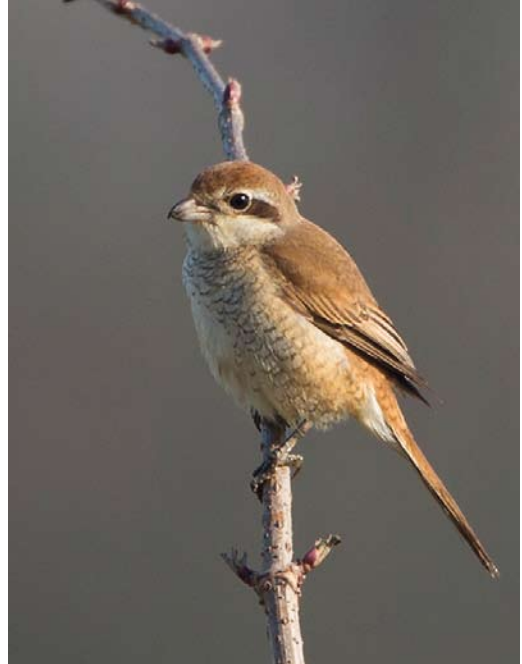
355 Bruine Klauwier / Brown Shrike Lanius cristatus , eerste-winter, Azewijnsche Broek, Gelderland, 4 maart 2014 (Co van der Wardt)

haakvormige punt en beide helften sterk gekromd, vrij lange staart en naar verhouding grote kop. Handpenprojectie vrij kort, geschat 60-65%. Staart smal en getrap met afgeronde staartpunt. Buitenste pennen (in vlucht) zichtbaar korter dan rest (20-25%).