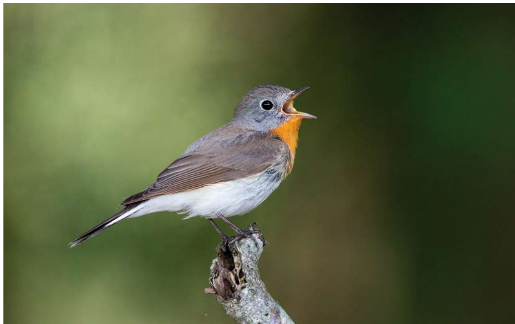
450 Kleine Vliegenvanger / Red-breasted Flycatcher Ficedula parva , adult mannetje, Schoonloo, Drenthe, 10 juni 2015 (Co van der Wardt)