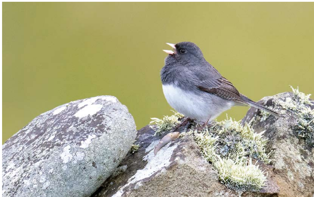
426 Dark-eyed Junco / Grijze Junco Junco hyemalis , Toab, Mainland, Shetland, 11 May 2015 (Hugh Harrop)