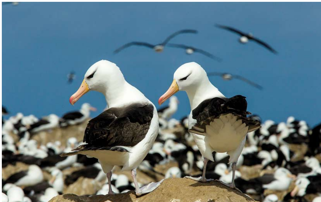
398 Black-browed Albatrosses / Wenkbrouwalbatrossen Thalassarche melanophris , Steeple Jason, Falkland Islands, 13 December 2014 ( Otto Plantema )