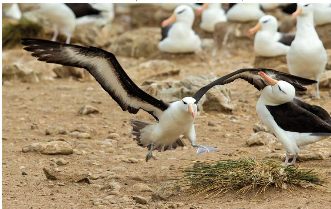
395 Black-browed Albatrosses / Wenkbrauwalbatrossen Thalassarche melanophris , Steeple Jason, Falkland Islands, 15 December 2014