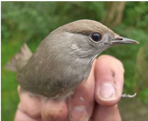
390 Eurasian Blackcap / Zwartkop Sylvia atricapilla , first-year, Bloemendaal, Kennemerduinen, Noord-Holland, Netherlands, 18 September 2014 ( Arnoud B van den Berg/Vrs Van Lennep ). Upperside and shape of rectrices. 391 Eurasian Blackcap / Zwartkop Sylvia atricapilla , first-year, Bloemendaal, Kennemerduinen, Noord-Holland, Netherlands, 18 September 2014 ( Arnoud B van den Berg/Vrs Van Lennep ). Wing showing emarginations and relative length of p2. 392 Eurasian Blackcap / Zwartkop Sylvia atricapilla , first-year, Bloemendaal, Kennemerduinen, Noord-Holland, Netherlands, 18 September 2014 ( Arnoud B van den Berg/Vrs Van Lennep ). In certain angle of sunlight revealing contours of cap. 393 Eurasian Blackcap / Zwartkop Sylvia atricapilla , Schiermonnikoog, Friesland, Netherlands, 28 September 2010 ( Kees van Kleef )