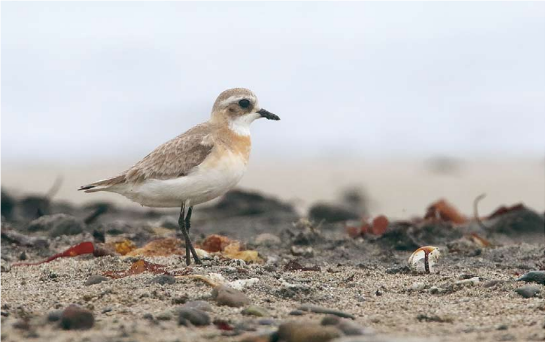
411 Mongolian/Lesser Sand Plover / Mongoolse/Tibetaanse Plevier Charadrius mongolus/atrifrons , adult, Farsund, Vest-Agder, Norway, 27 June 2015 (Jonas Langbråten)