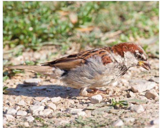
370 Hybrid House x Italian Sparrow / hybride Huismus x Italiaanse Mus Passer domesticus x italiae , adult male, Levico, Trentino, Italy, 5 August 2011 ( Edwin Winkel ). Typical and obvious hybrid. Remnants of grey crown clearly visible but small and not sharply defined. Grey also holds chestnut coloured spots, indicating italiae influence. Cheek still slightly darker than the white half-collar underneath, indicating domesticus ancestry. 371 Hybrid House x Italian Sparrow / hybride Huismus x Italiaanse Mus Passer domesticus x italiae , adult male, Levico, Trentino, Italy, 15 August 2011 ( Edwin Winkel ). Another evident hybrid with rather strong domesticus characteristics. Note darkish cheek and absence of any beige on back. Rudimentary grey crown, however, too narrow and irregular for pure domesticus . 372 Hybrid House x Italian Sparrow / hybride Huismus x Italiaanse Mus Passer domesticus x italiae , adult male, Levico, Trentino, Italy, 12 August 2011 ( Edwin Winkel ). Hybrid with dominating italiae features: strong anchor-shaped breast-patch and white cheek. Grey crown very narrow and grey, not beige. See also plate 373. 373 Hybrid House x Italian Sparrow / hybride Huismus x Italiaanse Mus Passer domesticus x italiae , adult male, Levico, Trentino, Italy, 12 August 2011 ( Edwin Winkel ). Same bird as in plate 372. Grey of crown better visible.

distinct feature is the breast-patch. In general, it is smaller than in italiae and, in domesticus , it rarely reaches the shoulder. The shape is again arrow-like but less pronounced than in italiae , caused by the white fringes which get broader as they reach the outline. The bill of domesticus is, on average, visibly smaller than in italiae .