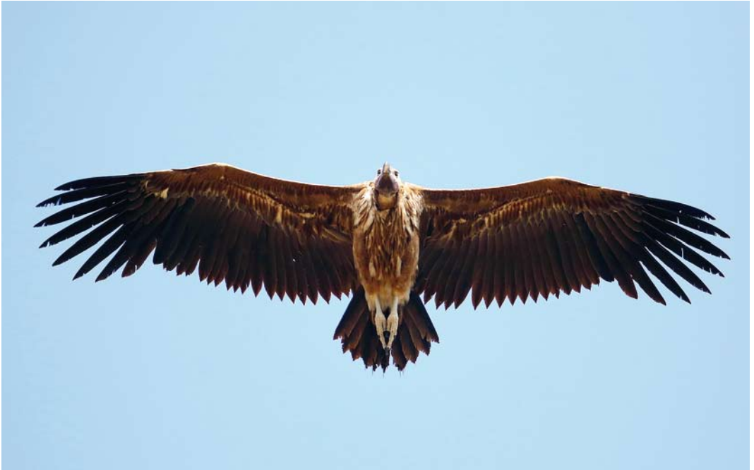
404 Lappet-faced Vulture / Oorgier Torgos tracheliotos , second calendar-year, Haibar Carmel, Haifa, Israel, 14 June 2015 (Ezra Hadad)