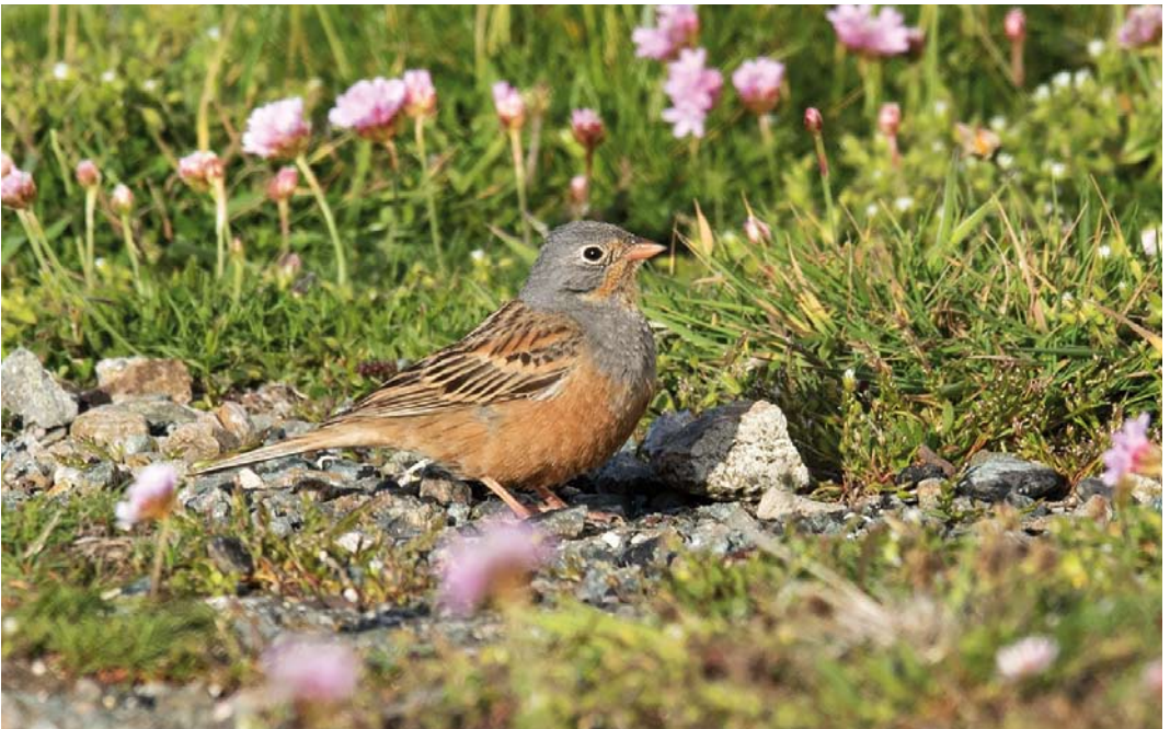
425 Cretzschmar's Bunting / Bruinkeelortolaan Emberiza caesia , male, Bardsey, Gwynedd, Wales, 14 June 2015 (Ben Porter)