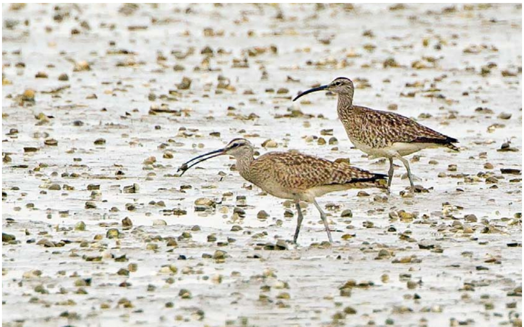
415 Hudsonian Whimbrel / Amerikaanse Regenwulp Numenius hudsonicus (left), with Eurasian Whimbrel / Regenwulp N phaeopus , Pagham Harbour, Sussex, England, 12 June 2015 (John Richardson)

SKUAS TO TERNS An exceptional skua Stercorarius passage in the Outer Hebrides, Scotland, involved a May total of 4640 Long-tailed Jaegers S longicaudus and 3004 Pomarine Skuas S pomarinus for the headland of Aird an Rùnair, North Uist, alone. A second-year Ivory Gull Pagophila eburnea at Knopper, Jylland, on 10 July was the ninth for Denmark. A census of Slender-billed Gulls Chroicocephalus genei in Sardinia resulted in 2200 breeding pairs, all in the Gulf of Cagliari and Oristano. The Grey-headed Gull C cirrocephalus first staying in June-July 2013 and back at Biceglie, Puglia, Italy, from 28 November 2014 was still present in July 2015 (cf Dutch Birding 37: 126, 2015). Satellite and geolocator telemetry used on three Ross's Gulls Rhodostethia rosea breeding in the Canadian Arctic revealed that they wintered in a restricted area of the northern Labrador Sea; up to now, this species' winter range was a mystery (Ibis 157: 642-647, 2015). A Laughing Gull Larus atricilla