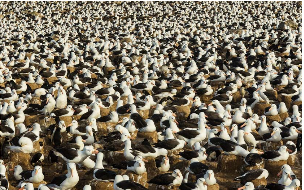
401 Black-browed Albatrosses / Wenkbrauwalbatrossen Thalassarche melanophris , Steeple Jason, Falkland Islands, 15 December 2014