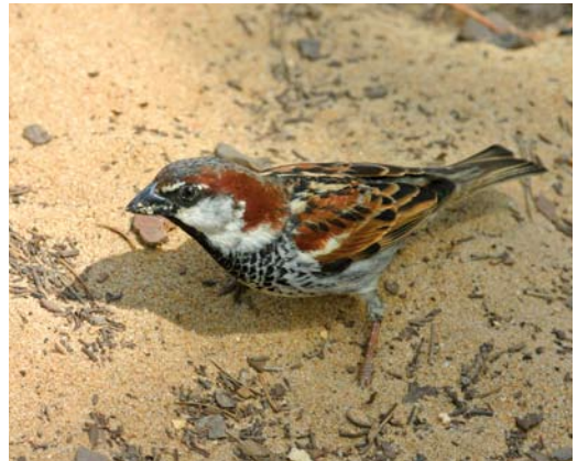
382 Italian Sparrow / Italiaanse Mus Passer italiae , adult male, rufous-breasted morph, Levico, Trentino, Italy, 5 August 2011 ( Edwin Winkel ). Moulting individual but outline and exposure of rufous-chestnut on breast obvious. 383 Italian Sparrow / Italiaanse Mus Passer italiae , adult male, rufous-breasted morph, Levico, Trentino, Italy, 13 August 2011 ( Edwin Winkel ). Adult moulting to 'winter' plumage. Fresh feather-tips covering rufous-brownish breast-patch. 384 Italian Sparrow / Italiaanse Mus Passer italiae , adult male, rufous-breasted morph, Viareggio, Toscana, Italy, 8 November 2008 ( Daniele Occhiato ). In fresh ('winter') plumage but wind revealing ground colour of breast-patch. 385 Hybrid House x Spanish Sparrow / Huismus x Spaanse Mus Passer domesticus x hispaniolensis , adult male, El Acebuche, Huelva, Spain, 6 May 2005 ( Edwin Winkel ). This crossing does not necessarily produce outcome looking like Italian Sparrow P italiae . Black strings on belly and flank indicating hispaniolensis parenthood and grey on crown indicating domesticus influence.

strated more than a rufous touch, even under bad light conditions. They actually had rufous-brown breast-patch feathers, about the same colour as the head. One bird (plate 380) was still in breeding plumage and its complete 'black' patch showed a solid rufous base with only a sparsely black coating. Other birds (plate 382-383) were heavily moulting but their incomplete bibs still displayed the same pattern of coloration.