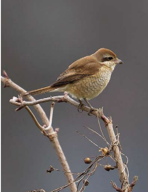
354 Bruine Klauwier / Brown Shrike Lanius cristatus , eerste-winter, Azewijnsche Broek, Gelderland, 22 februari 2014