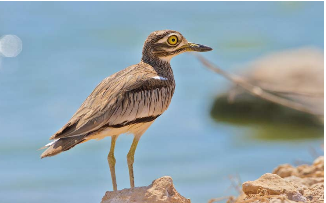
412 Senegal Thick-knee / Senegalese Griel Burhinus senegalensis , Ma'agan Michael, Israel, 8 July 2015