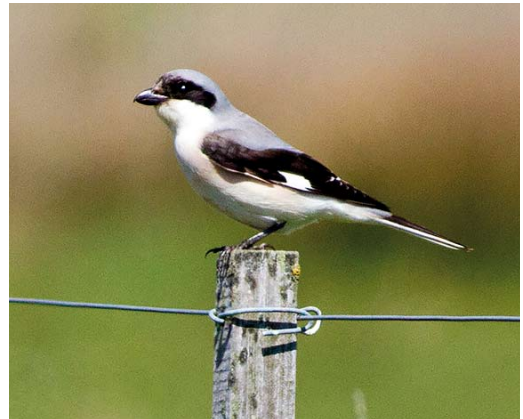
436 Middelste Jagers / Pomarine Skuas Stercorarius pomarinus , Vlissingen, Zeeland, 8 mei 2015 (Thomas Luiten) 437 Oostelijke Blonde Tapuit / Eastern Black-eared Wheatear Oenanthe melanoleuca , adult mannetje, Coepelduynen, Noordwijk, 10 juni 2015 (René van Rossum) 438 Scharrelaar / European Roller Coracias garrulus , Amsterdamse Waterleidingduinen, Noord-Holland, 14 juni 2015 (Marten Miske) 439 Kleine Klapekster / Lesser Grey Shrike Lanius minor , Oosterend, Terschelling, Friesland, 13 mei 2015 (Albert de Jong)

getrouw op Texel, Noord-Holland (maximaal 14 op 15 en 16 mei), en bij Anjum, Friesland (maximaal 29 op 5 mei). Langs telpost Noordkaap, Groningen, werden op 3 mei 12 exemplaren geteld. Breedbekstrandlopers Calidris falcinellus werden vaak opgemerkt; de teller kwam uit op zeker 34, waaronder een groep van vijf op 21 mei bij Aerd. Een adulte Blonde Ruiter C subruficollis verbleef op 2 en 3 mei bij Waddinxveen, Zuid-Holland. Gestreepte Strandlopers C melanotos bleven schaars, met waarnemingen op 10 mei in de Ezumakeeg, Friesland; van 23 tot 25 mei bij Lemmer; en op 7 juni bij Oostburg, Zeeland. Tussen 7 mei en 15 juni werden c 16 Grauwe Franjepoten Phalaropus lobatus doorgegeven. Van 17 tot 19 mei zwom een naar zomerkleed ruiende Rosse Franjepoot P fulicarius bij Hardenberg, Overijssel. Terekruiters Xenus cinereus deden het goed, met waarnemingen op 20 mei en 7 en 8 juni op exact dezelfde plaats in de Brabantse Biesbosch; op 22 mei bij