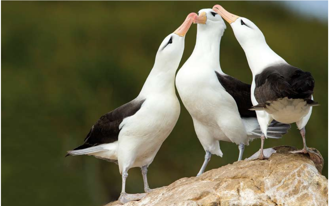
396 Black-browed Albatrosses / Wenkbrauwalbatrossen Thalassarche melanophris , Steeple Jason, Falkland Islands, 13 December 2014