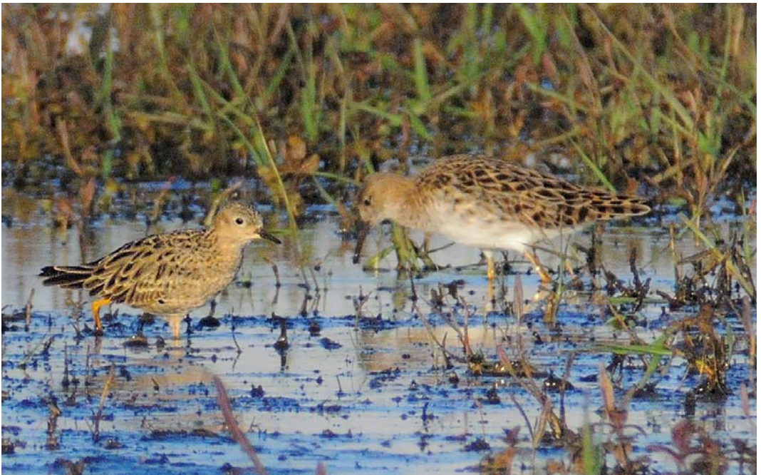
431 Blonde Ruiters / Buff-breasted Sandpiper Calidris subruficollis , met Kemphaan / Ruff C. pugnax , Waddinxveen, Zuid-Holland, 3 mei 2015