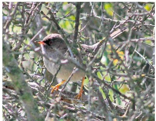
416 Pacific Loon / Pacifische Parelduiker Gavia pacifica , first-summer, Farsund, Vest-Agder, Norway, 12 July 2015 (Tor Olsen) 417 Namaqua Dove / Maskerduif Oena capensis , female, Safia, Oued Dahab, Morocco, 22 May 2015 (Abdeljebbar Qninba) 418 Cedar Waxwing / Cederpestvogel Bombycilla cedrorum , Tیره, Argyll & Bute, Scotland, 10 June 2015 (Keith Gillon) 419 Swainson's Thrush / Dverglijster Catharus ustulatus , Skokholm, Pembrokeshire, Wales, 4 June 2015 (David Aitken) 420 Black-headed Bunting / Zwartkopgors Emberiza melanocephala , female, Krynica Morska, Pomerania, Poland, 4 June 2015 (Andrzej Kośmicki) 421 Marmora's Warbler / Sardijnse Grasmus Sylvia sarda , male, Grenen, Nordjylland, Denmark, 4 June 2015 (Rune S Neergard)