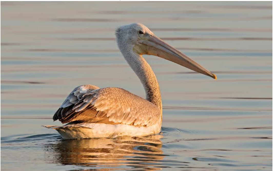
414 Pink-backed Pelican / Kleine Pelikaan Pelecanus rufescens , second calendar-year, Harod valley, Israel, 22 July 2015