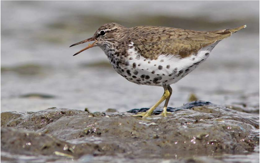
430 Amerikaanse Oeverloper / Spotted Sandpiper Actitis macularius , eerste-zomer, Medemblik, Noord-Holland, 28 april 2015 (Rob Half) )