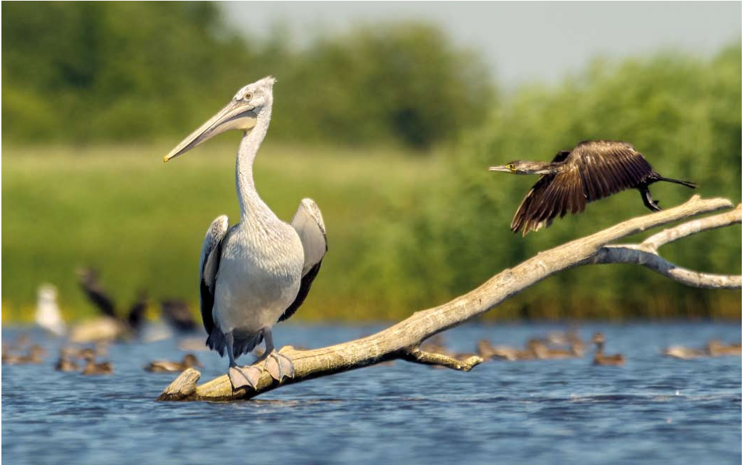
413 Dalmatian Pelican / Kroeskoppelikaan Pelecanus crispus , second calendar-year, Nemunas delta, Lithuania, 3 July 2015 ( Vilius Paškevičius )