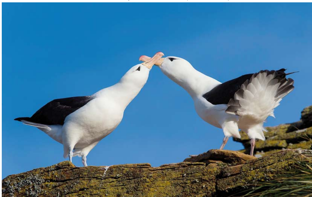
399 Black-browed Albatrosses / Wenkbrouwalbatrossen Thalassarche melanophris , Saunders Island, Falkland Islands, 21 December 2014 ( Otto Plantema )