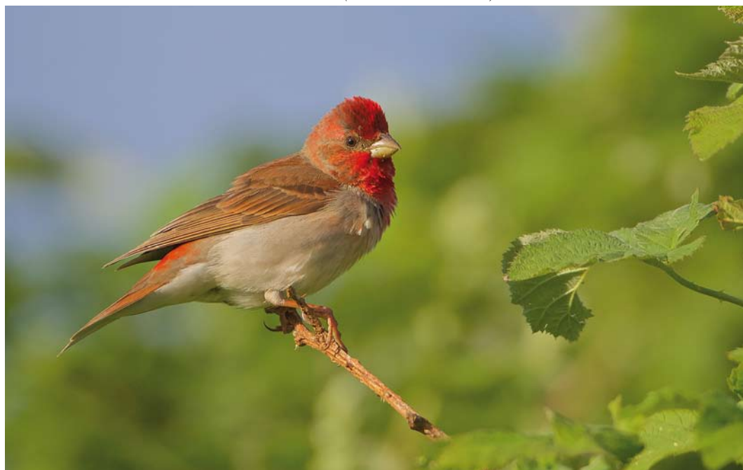
451 Roodmus / Scarlet Rosefinch Erythrina erythrina , adult mannetje, Katwijk aan den Rijn, Zuid-Holland, 30 mei 2015 (Martin van der Schalk)