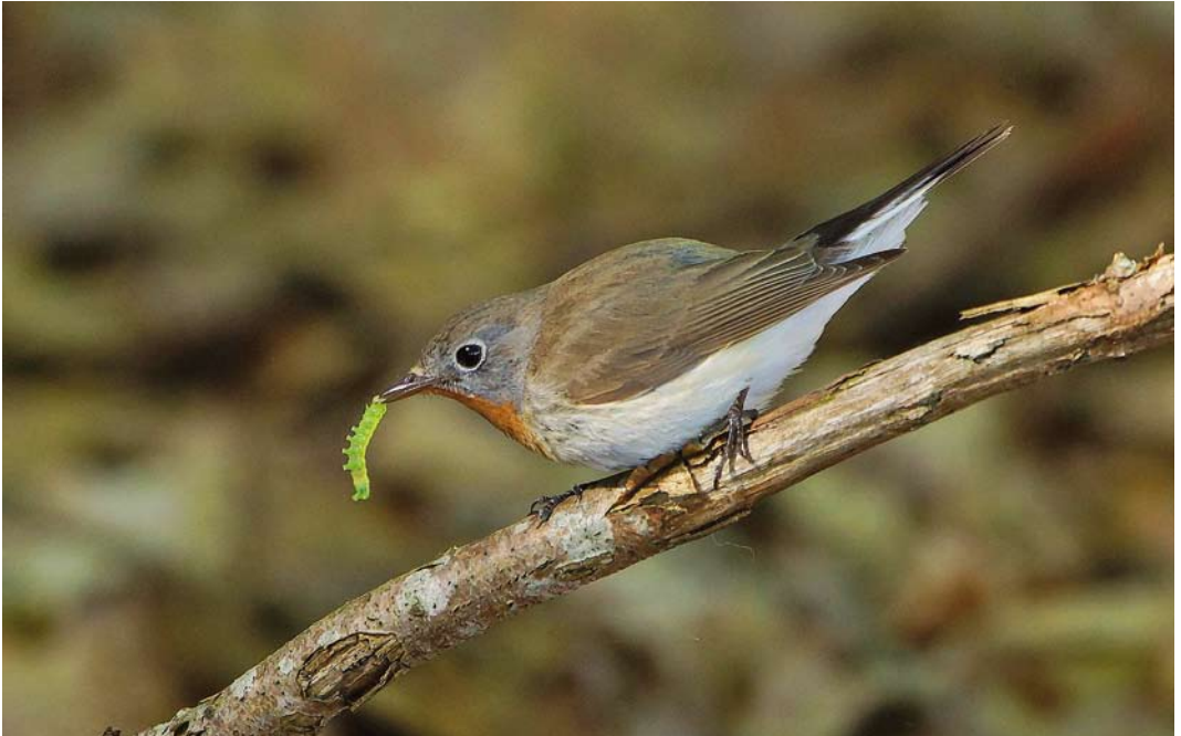
452 Kleine Vliegenvanger / Red-breasted Flycatcher Ficedula parva , adult mannetje, Schoonloo, Drenthe, 24 mei 2015