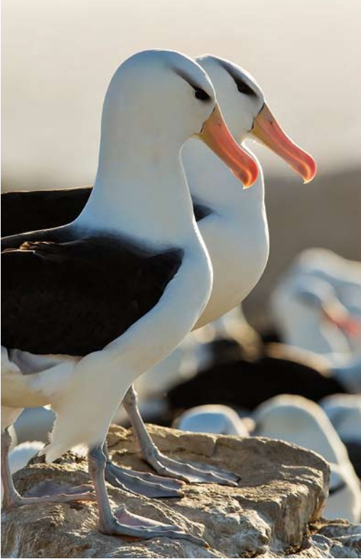
402 Black-browed Albatrosses / Wenkbrauwalbatrossen Thalassarche melanophris , Steeple Jason, Falkland Islands, 14 December 2014

Island (representing c 5% of the albatross population of the islands), where IS has carried out surveys since 1977. I met IS in 1979 on New Island; he is a keen birder and eager conversationalist, and landowner at that time. Figures clearly show that, between 1977 and 2007, the Black-browed population had increased by c 100% at a main breeding site on New Island known as Settlement Rookery. The same basic methodology of aerial photography surveys has continued up to 2010 for many sites in the Falkland Islands. These surveys thus show a very substantial increase of 43% for the eight most important breeding sites between 1986 and 2007, in contrast with reports of a decline in other studies. Steeple Jason's colony was