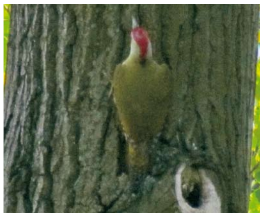
346-348 Hybrid Grey-headed x European Green Woodpecker / hybride Grijskopspecht x Groene Specht Picus canus x viridis , Bytom Miechowice, Poland, 31 March 2012 (Szymon Beuch). Same bird as in plate 349-351.