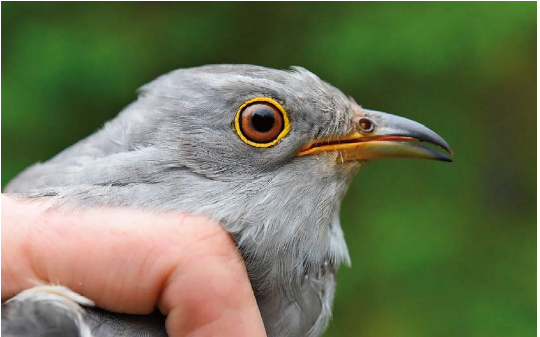
422-423 Presumed Oriental Cuckoo / vermoedelijke Boskoekoek Cuculus optatus , male, Sotkamo, Finland, 22 June 2015 (Pepe Lehikoinen)