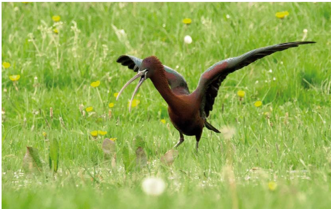
428 Zwarte Ibis / Glossy Ibis Plegadis falcinellus , Bedum, Groningen, 14 mei 2015 (Martin Visser)