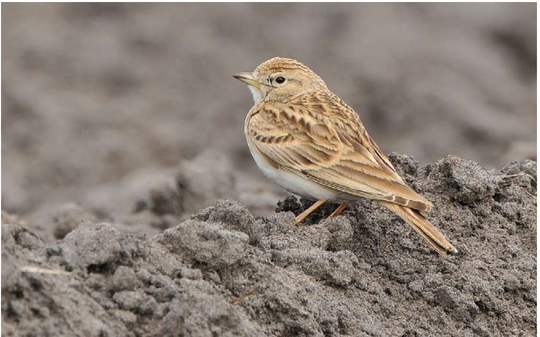
453 Kortteenleeuwerik / Greater Short-toed Lark Calandrella brachydactyla , De Wieden, Overijssel, 4 mei 2015 (Ronald Messemaker)