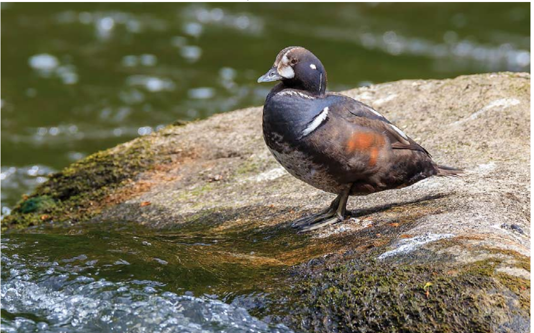
410 Harlequin Duck / Harlekijneend Histrionicus histrionicus , first-summer male, River Don, Aberdeenshire, Scotland, 20 May 2015