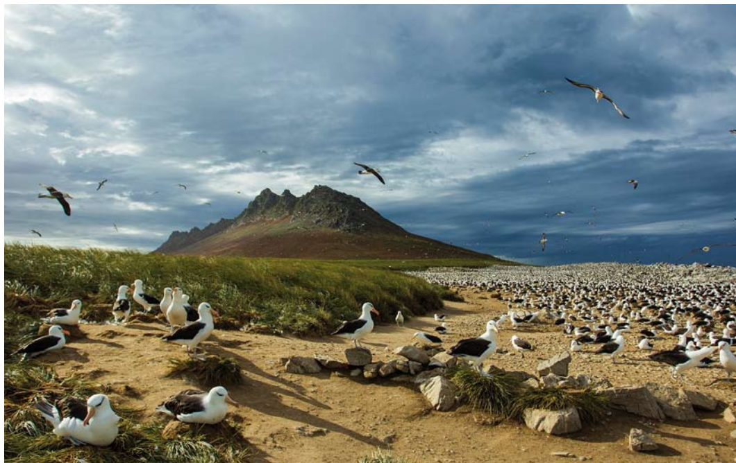
394 Black-browed Albatrosses / Wenkbrauwalbatrossen Thalassarche melanophris , Steeple Jason, Falkland Islands, 16 December 2014 ( Otto Plantema )