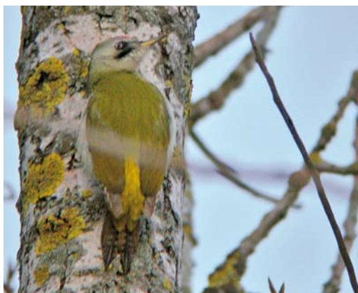
341-345 Hybrid Grey-headed x European Green Woodpecker / hybride Grijskopspecht x Groene Specht Picus canus x viridis , Lublin, Poland, 22 January 2010