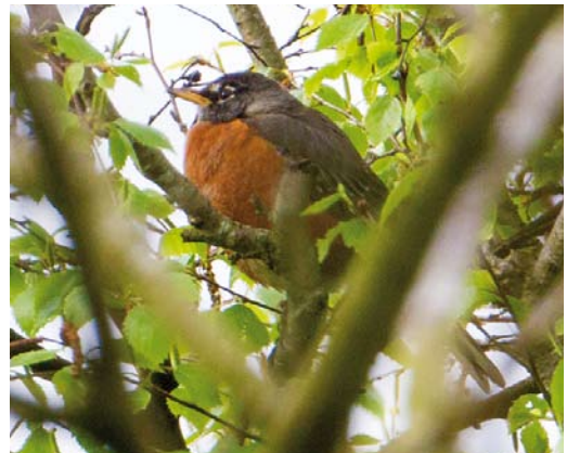
356-357 Roodborstlijster / American Robin Turdus migratorius , eerste-zomer mannetje, Heemskerk, Noord-Holland, 27 april 2014 (Lonnie Bregman) 358-359 Roodborstlijster / American Robin Turdus migratorius , eerste-zomer mannetje, Heemskerk, Noord-Holland, 27 april 2014 (Hans Brinks) 360-361 Roodborstlijster / American Robin Turdus migratorius , eerste-zomer mannetje, Heemskerk, Noord-Holland, 27 april 2014 (Jaap Denee)