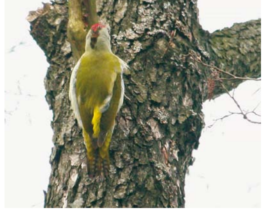
339-340 Hybrid Grey-headed x European Green Woodpecker / hybride Grijskopspecht x Groene Specht Picus canus x viridis , Biebrza National Park, Poland, 16 April 2008

tention as a potential hybrid. Nonetheless, one has to bear in mind that individual variability and specific circumstances can cause similar deviations in birds that are not hybrids. It is worth remembering that a female of both canus and viridis sings as well as the male, only more quietly, for a shorter time, not so vibrantly and at a lower pitch.