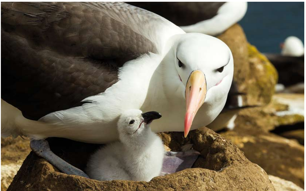
397 Black-browed Albatrosses / Wenkbrauwalbatrossen Thalassarche melanophris , Saunders Island, Falkland Islands, 23 December 2014