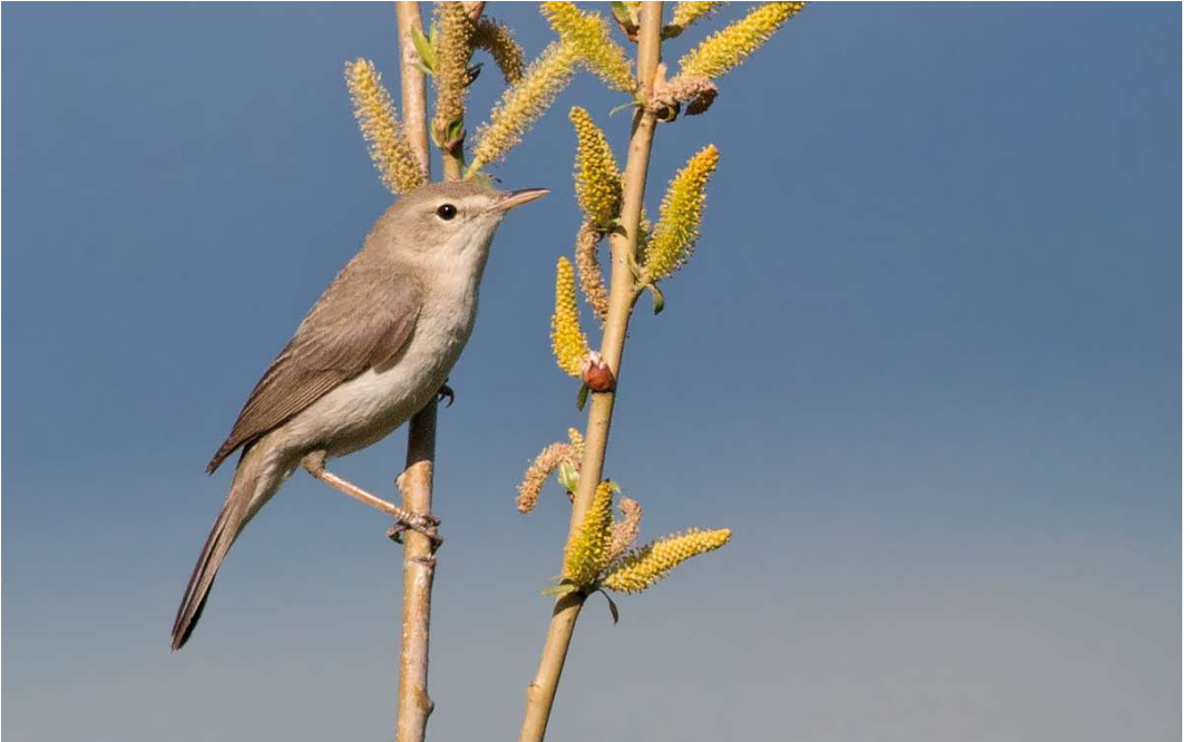
424 Sykes's Warbler / Sykes' Spotvogel Iduna rama , Karlı, Yüksekova, Hakkari, Turkey, 18 May 2015 (Emin Yoğurtcuoğlu)