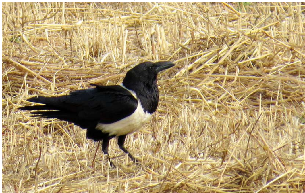
427 Pied Crow / Schildraaf Corvus albus , adult, Sesimbra, Setúbal, Portugal, 30 June 2015 (Luís Gordinho)