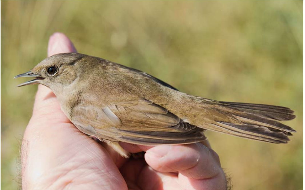
388-389 Eurasian Blackcap / Zwartkop Sylvia atricapilla , first-year, Bloemendaal, Kennemerduinen, Noord-Holland, Netherlands, 18 September 2014