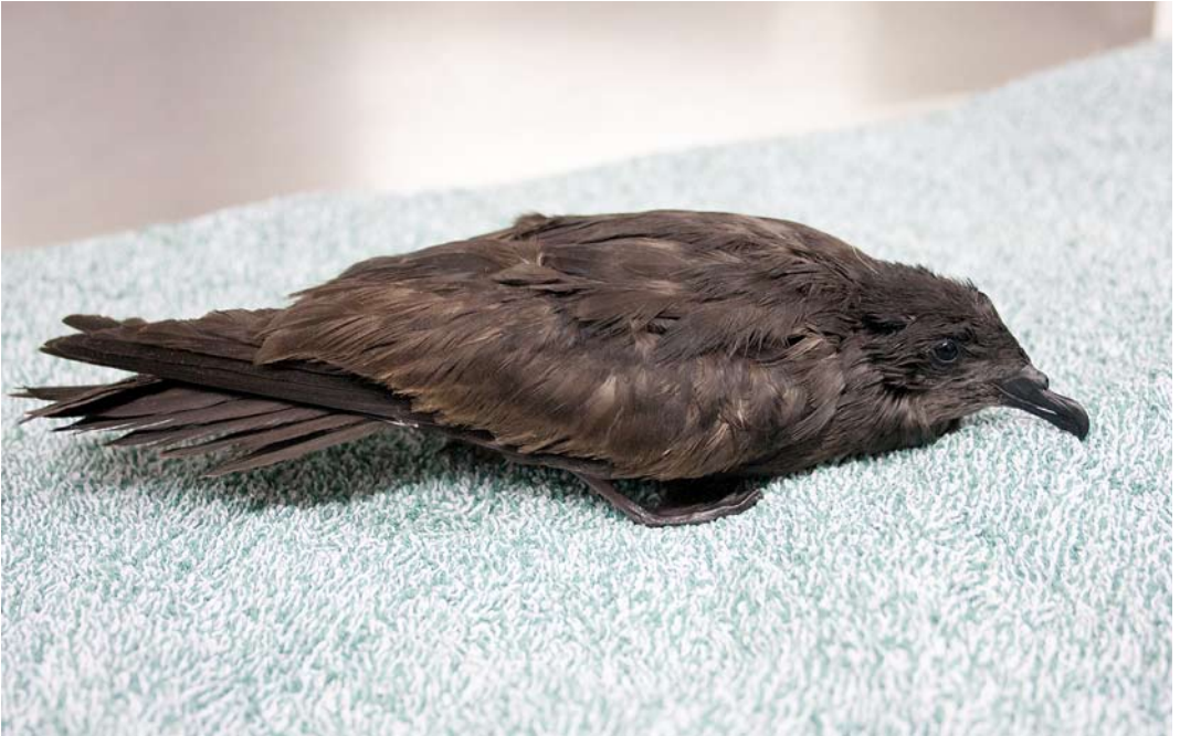
409 Bulwer's Petrel / Bulwers Stormvogel Bulweria bulwerii , picked up on 21 July 2015 at Kressbachsee, Eilwangen, Baden-Württemberg, Germany, 22 July 2015 ( Andreas Hachenberg )