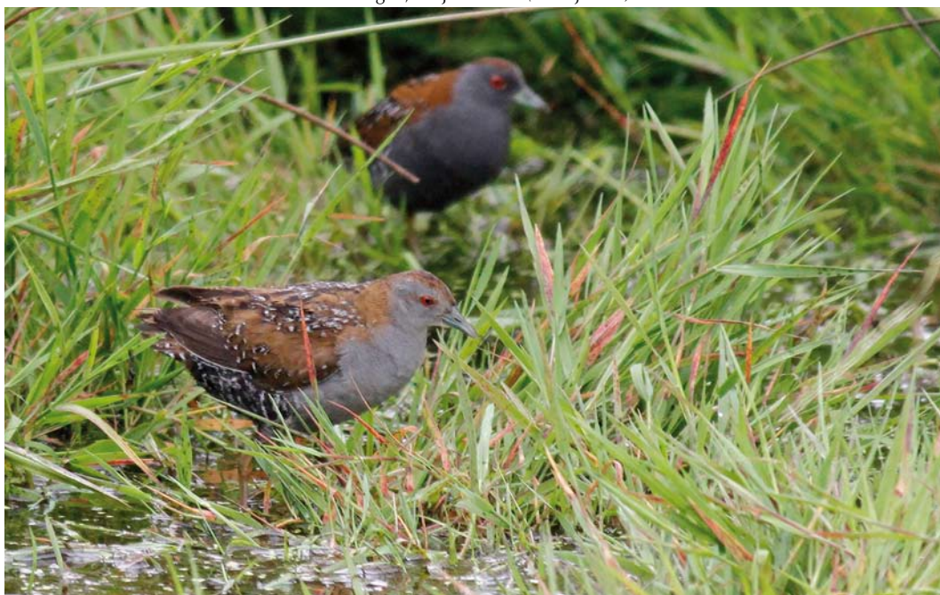
429 Kleinste Waterhoenders / Baillon's Crakes Porzana pusilla , mannetje (achter) en vrouwtje, Onnerpolder, Groningen, 19 juni 2015