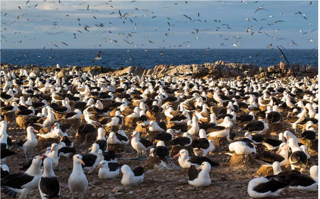
400 Black-browed Albatrosses / Wenkbrauwalbatrossen Thalassarche melanophris , Steeple Jason, Falkland Islands, 16 December 2014