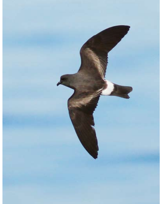
406 Eleonora's Falcon / Eleonora's Valk Falco eleonora , second calendar-year, Jarziz Farm, Salalah, Oman, 12 June 2015 407 Monteiro's Storm Petrel / Monteiro's Stormvogeltje Oceanodroma monteiroi , Bank of Fortune, Graciosa, Azores, 2 June 2015 408 Elegant Tern / Sierlijke Stern Sterna elegans , adult, with Sandwich Terns / Grote Sterns S. sandvicensis and Mediterranean Gull / Zwartkopmeeuw Larus melanocephalus , Île de Noirmoutier, Vendée, France, 25 May 2015