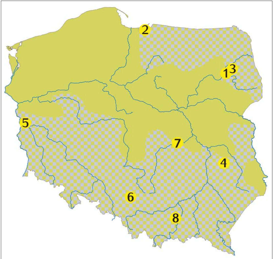
FIGURE 1 Distribution of hybrids Grey-headed x European Green Woodpecker Picus canus x viridis in Poland compared with breeding ranges of both parent species. Yellow dot: record of hybrid; plain green: range of European Green Woodpecker; chequered grey/green: sympatric range of European Green and Grey-headed Woodpecker. Numbers in yellow dots as in table 1 / Verspreiding van hybriden Grijskopspecht x Groene Specht Picus canus x viridis in Polen in vergelijking met broedgebieden van beide oudersoorten. Gele stip: geval van hybride; egaalgroen: verspreiding van Groene Specht; grijs-groen geblokt: sympatrische verspreiding van Groene Specht en Grijskopspecht. Getallen in gele stippen als in tabel 1.

(Chodkiewicz et al 2015). It had a frequency of occurrence of 15.2% in Poland as a whole (471 of 3105 5'N x 10'E survey plots), being least common in the north-western and north-eastern parts of the country (figure 2).