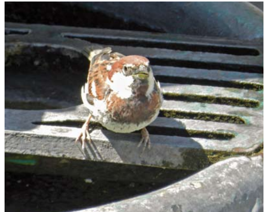
378 Italian Sparrow / Italiaanse Mus Passer italiae , adult male, Levico, Trentino, Italy, 3 August 2013 ( Edwin Winkel ). Confusing individual at first sight, which could be mistaken for hybrid because of less contrast (due to bad light), small supercilium and richly coloured head. Close looks reveal, however, normal moult pattern. White cheek also strong pro italiae feature. 379 Italian Sparrow / Italiaanse Mus Passer italiae , adult male, Levico, Trentino, Italy, 14 August 2011 ( Edwin Winkel ). Another male with rather messy head and strong supercilium but also undergoing normal moult. 380 Italian Sparrow / Italiaanse Mus Passer italiae , adult male, rufous-breasted morph, Levico, Trentino, Italy, 5 August 2011 ( Edwin Winkel ). Breeding plumage still present and complete breast-patch reveals solid rufous-chestnut undertone. 381 Italian Sparrow / Italiaanse Mus Passer italiae , adult male, rufous-breasted morph, Aosta, Valle d'Aosta, Italy, 22 July 2011 ( Enno B Ebels ). Another rufous-breasted morph in breeding plumage but this male also shows rufous on bib. Anchor-shaped patch typical for italiae .

starts to renew its complete plumage. On the head of italiae males, yellowish or beige 'tassels' are formed. This is most evident on the front and at the sides. The grey cap of domesticus , in contrast, never changes to beige. In fresh plumage, the tips have a little brown wash but the cap stays grey overall. The dispersed and scarce spots on top of the head of an italiae -type hybrid follow the same routine. So, these feathers stay rather dull, either brown or grey. Plate 375 demonstrates this pattern and also the place – on the centre of the head – is