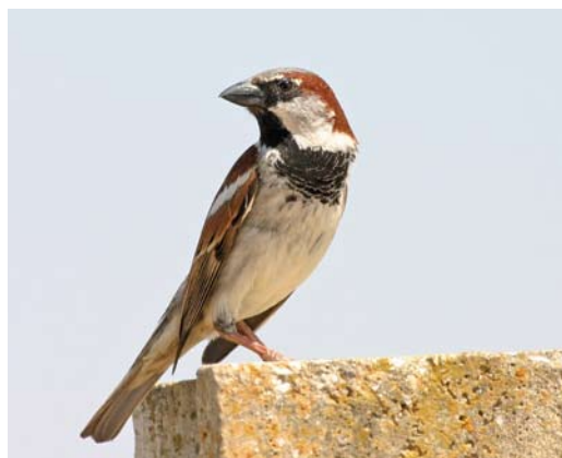
366 Italian Sparrow / Italiaanse Mus Passer italiae , adult male, Levico, Trentino, Italy, 10 August 2013 ( Edwin Winkel ). Typical male, just after breeding season (note largely pale bill). Note rufous edges of breast-patch close to shoulder, present on nearly all males. 367 House Sparrow / Huismus Passer domesticus , adult male, Ronda, Málaga, Spain, 4 May 2005 ( Edwin Winkel ). Note differences with Italian Sparrow P italiae : grey, well demarcated crown, greyish cheek with narrow whitish semi-collar, rudimentary white supercilium behind eye and rather small and loose breast patch all typical for domesticus . Also, note absence of beige on mantle, as well as clearly smaller bill than in most italiae . 368 House Sparrow / Huismus Passer domesticus , adult male, De Glind, Gelderland, Netherlands, 17 April 2008 ( Edwin Winkel ). Fresh feather tips still hiding some of breeding plumage but breast-patch is visibly limited and not solid. Grey crown distinctive and rather small bill typical for domesticus . 369 House Sparrow / Huismus Passer domesticus , adult male, El Rocío, Huelva, Spain, 10 May 2005 ( Edwin Winkel ). Bird showing much contrast like male Italian Sparrow P italiae . Grey crown unmistakable but large bill, well developed supercilium, whitish cheek, relatively large and compact bib and neat appearance reminiscent of italiae .

are not necessarily connected to the patch and never form long strings as in hispaniolensis . The upperparts of italiae show a similar brown-and-black pattern as domesticus . Italiae male has, however, on average, more beige or off-white tones on the mantle, a feature that is mostly absent in domesticus . Hispaniolensis demonstrates the same amount of beige, creating more contrasting upperparts than in domesticus . The underparts of males italiae are greyish as in domesticus but