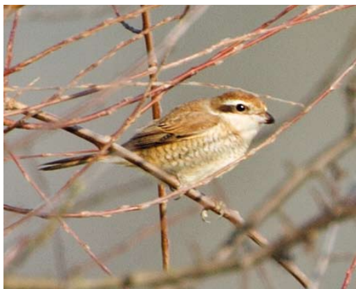
352-353 Bruine Klauwier / Brown Shrike Lanius cristatus , eerste-winter, Azewijnsche Broek, Gelderland, 19 januari 2014

GROOTTE & BOUW Typische klauwier in voorkomen en gedrag. Middelgrote zangvogel met stevige snavel met