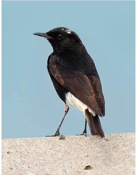
312 Caspian Penduline Tit / Kaspische Buidelmees Remiz pendulinus caspius , Wondelgem, Oost-Vlaanderen, Belgium, 3 April 2015 ( Garry Bakker ) 313 White-crowned Wheatear / Witkruintapuit Oenanthe leucopyga , second calendar-year, Palavas-les-Flots, Montpellier, Hérault, France, 5 May 2015 ( Antoine Joris ) 314 White-crowned Wheatear / Witkruintapuit Oenanthe leucopyga , second calendar-year, Winduga, Kujawsko-Pomorskie, Poland, 16 May 2015 ( Mateusz Matysiak )