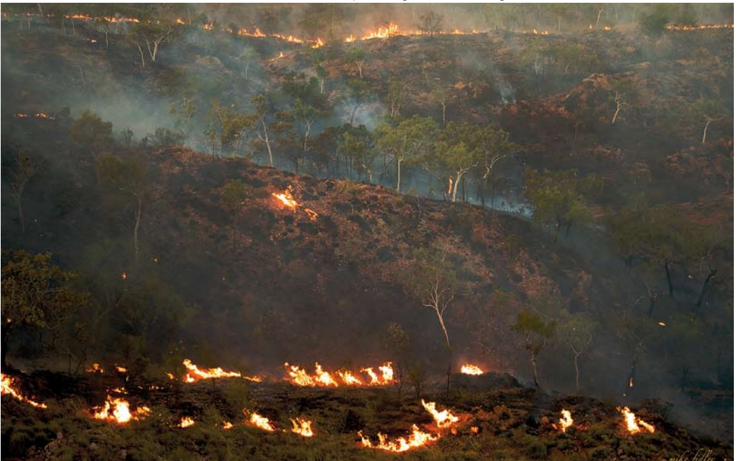
292 Forest fire, Kimberley region, Western Australia, Australia, 15 August 2008. Forest fires are a great threat for Gouldian Finch Erythrura gouldiae nesting habitat.