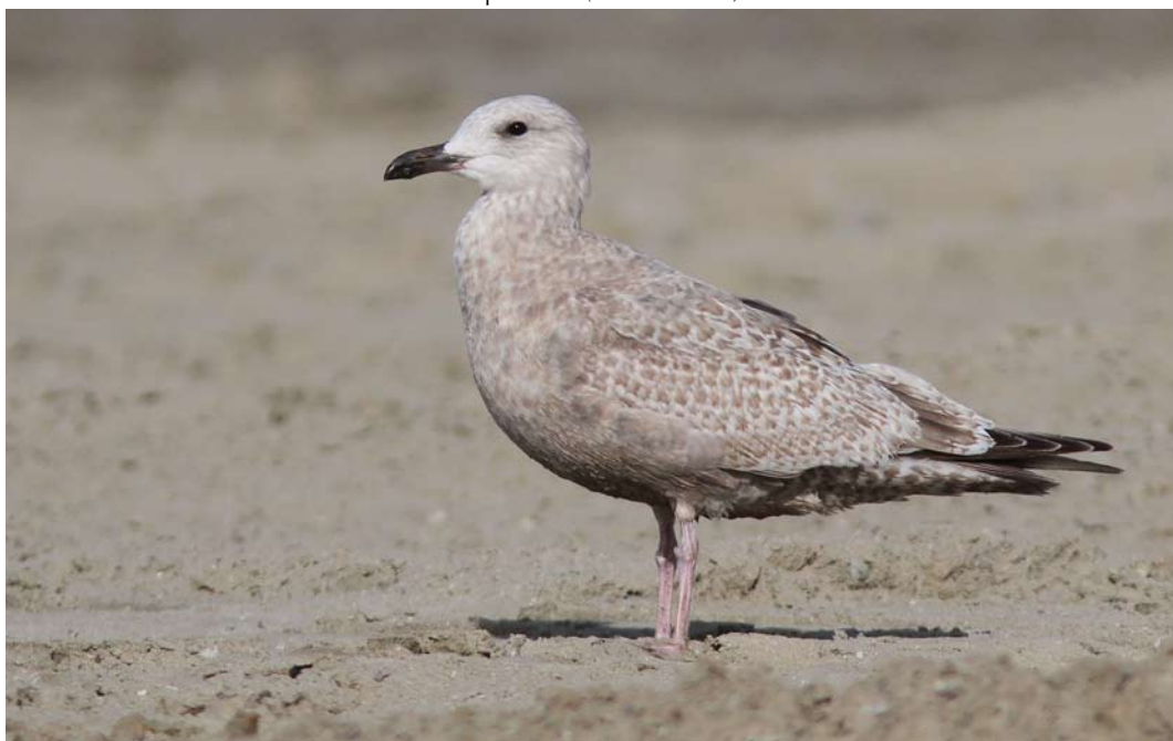
336 Thayers Meeuw / Thayer's Gull Larus thayeri , tweede-kalenderjaar, Egmond aan Zee, Noord-Holland, 12 april 2015 ( Marten Miske )