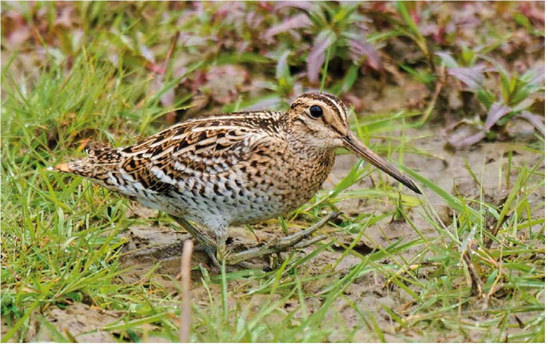
281-282 Poelsnip / Great Snipe Gallinago media , Broekhuizen, Limburg, 28 april 2015