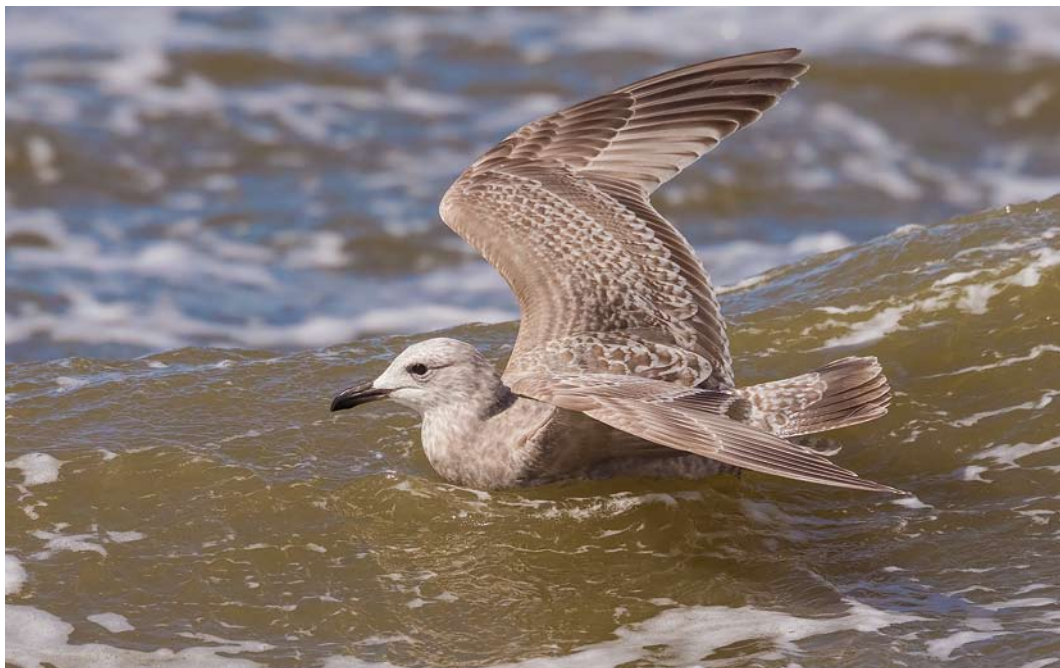
335 Thayers Meeuw / Thayer's Gull Larus thayeri , tweede-kalenderjaar, Egmond aan Zee, Noord-Holland, 12 april 2015