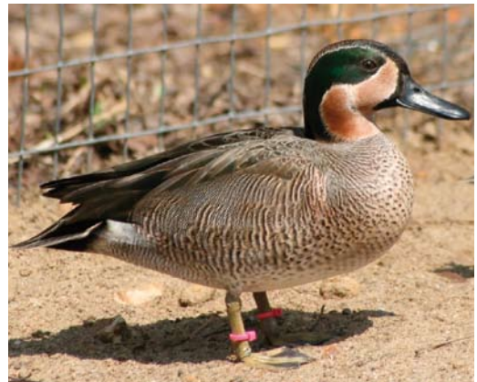
270 Presumed hybrid Eurasian Teal x Garganey / vermoedelijke hybride Wintertaling x Zomertaling Anas crecca x querquedula with Eurasian Teal / Wintertaling, L'Albufera de Valencia, Valencia, Spain, 27 January 2014 (José Ignacio Dies). In hybrid, note coarser pattern of flank, mantle and rump feathers and undertail-coverts. 271 Presumed hybrid Eurasian Teal x Garganey / vermoedelijke hybride Wintertaling x Zomertaling Anas crecca x querquedula , L'Albufera de Valencia, Valencia, Spain, 27 January 2014 (José Ignacio Dies). Note upper scapulars showing washed-out pattern that is nevertheless still similar to Garganey, and partly obscured lower scapulars with creamy white coloration, pale-edged tertials and patterned undertail-coverts. 272 Presumed hybrid Eurasian Teal x Garganey / vermoedelijke hybride Wintertaling x Zomertaling Anas crecca x querquedula , L'Albufera de Valencia, Valencia, Spain, 27 January 2014 (José Ignacio Dies). Note breast pattern and slight greenish iridescence behind eye. 273 Hybrid Blue-winged Teal / hybride Blauwvleugeltaling x Amerikaanse Wintertaling Anas discors x carolinensis , male, Huntsville, Alabama, USA, 2011 (Mark Hall). Captive bird of known parentage.

haved similar to the Eurasian Teals it was associating with. The legs have been seen only briefly during preening but were without any obvious rings.