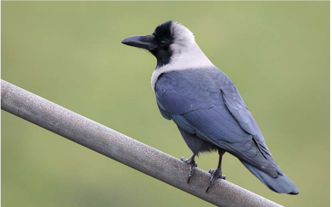
30 Huiskraai / House Crow Corvus splendens , adult, Hoek van Holland, Zuid-Holland, 5 april 2013 ( Chris van Rijswijk/birdshooting.nl ). Licht verenkleed indicatief voor ondersoort C s zugmayeri / pale plumage indicative of subspecies C s zugmayeri . 31 Huiskraai / House Crow Corvus splendens , adult, Hoek van Holland, Zuid-Holland, 5 april 2013 ( Chris van Rijswijk/birdshooting.nl ). Donker verenkleed typisch voor exemplaren van populatie in Hoek van Holland / dark plumage typical for birds of population at Hoek van Holland.