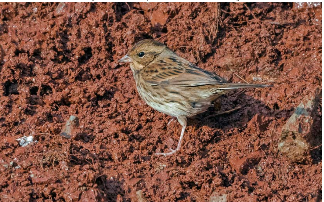
76 Black-faced Bunting / Maskergors Emberiza spodocephala , first-year or female, Kringel, Helgoland, Schleswig-Holstein, Germany, 8 December 2014