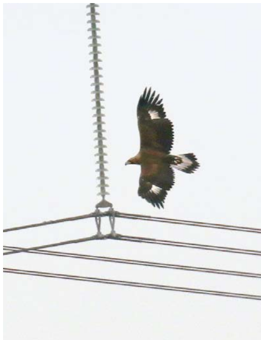
318 Kleine Geelpootruiter / Lesser Yellowlegs Tringa flavipes , adult-winter, Haamstede, Zeeland, 11 maart 2015 319 Steenarend / Golden Eagle Aquila chrysaetos , eerste-winter, Veenhuizerstukken, Groningen, 15 maart 2015 320 Amerikaanse Oeverloper / Spotted Sandpiper Actitis macularius , Medemblik, Noord-Holland, 17 april 2015