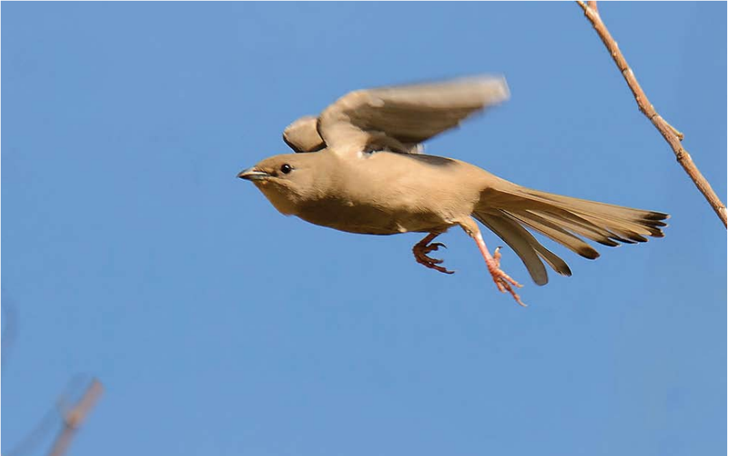
310 Grey Hypocolius / Zijdestaart Hypocolius ampelinus , female, Ashkelon, Israel, 2 April, 2015