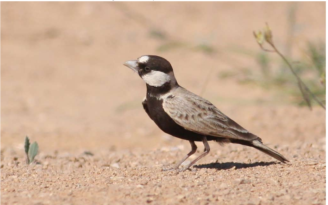
311 Black-crowned Sparrow-Lark / Zwartkruinvinkleeuwerik Eremopterix nigriceps , male, Meisbar Sei'Fim, Negev, Israel, 5 April 2015 (Frank Moffatt)