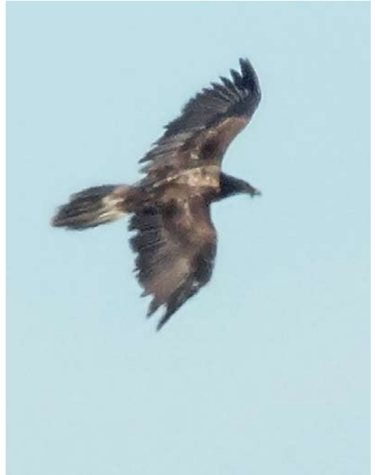
303 Great Blue Heron / Amerikaanse Blauwe Reiger Ardea herodias , Bryher, Scilly, England, 17 April 2015 304 Bearded Vulture / Lammergier Gypaetus barbatus , immature, Sallandse Heuvelrug, Overijssel, Netherlands, 5 May 2015 305 Demoiselle Crane / Jufferkraanvogel Grus virgo , adult, with Hooded Crows / Bonte Kraaien Corvus cornix , Lesvos, Greece, 28 April 2015