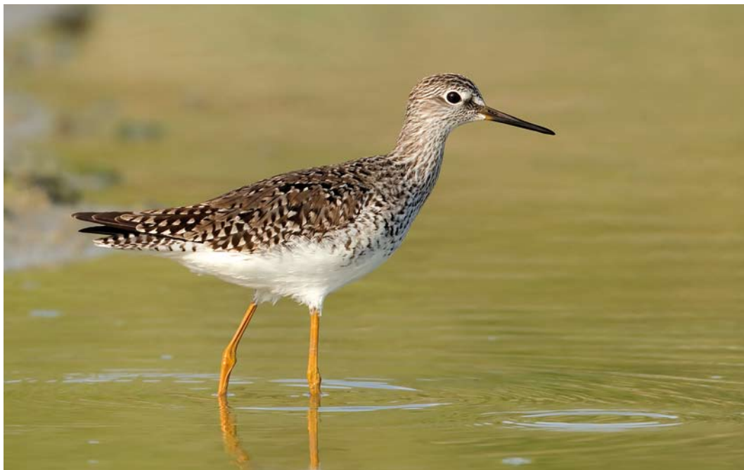
299 Lesser Yellowlegs / Kleine Geelpootruiter Tringa flavipes , IJzermonding, Nieuwpoort, West-Vlaanderen, Belgium, 10 May 2015