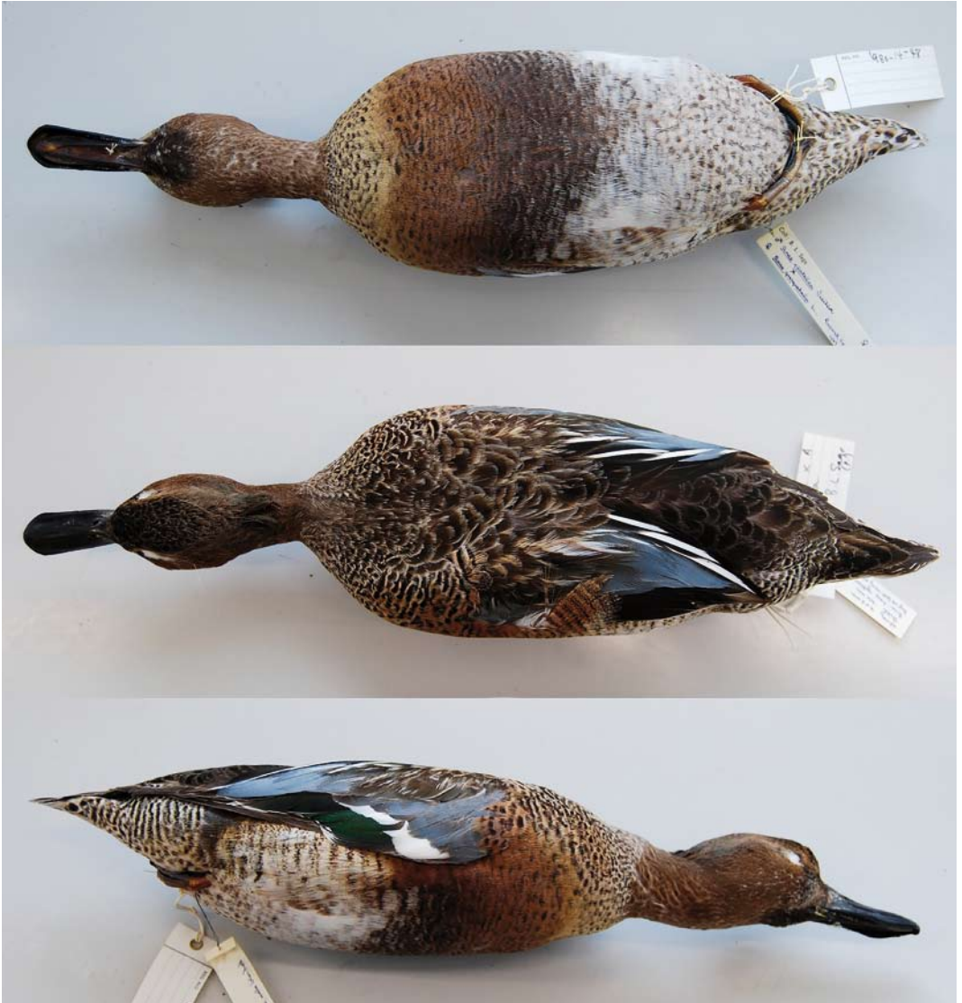
FIGURE 4 Hybrid Garganey x Red Shoveler / hybride Zomertaling x Argentijnse Slobeend Anas querquedula x platalea , probably male, incorrectly labeled as female (captive bird of known parentage, Collection B L Sage, 1964), Natural History Museum, Tring, England, 2 September 2011 (Hein van Grouw)

the slightly wider distances between the thin black vermiculation lines.