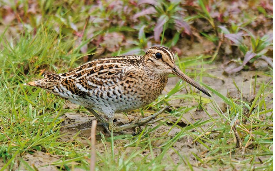
281-282 Poelsnip / Great Snipe Gallinago media , Broekhuizen, Limburg, 28 april 2015