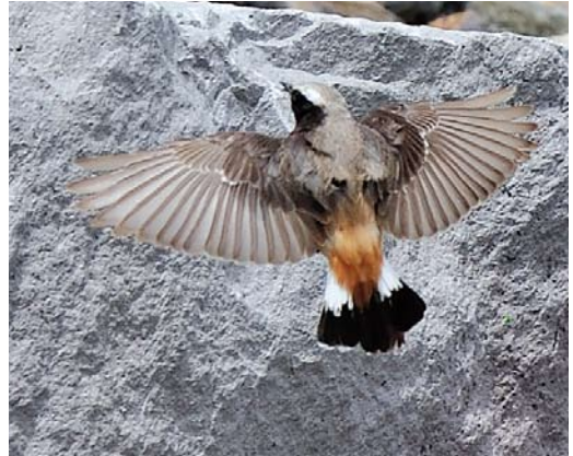
315-316 Kurdish Wheatear / Westelijke Roodstaartpauit Oenanthe xanthopyrna , Puy de Dôme, Puy-de-Dôme, France, 19 May 2015 (Antoine Joris)

for the Netherlands, of which three were females. If accepted, a Hooded Wheatear O monacha at Karadayı, Antalya, on 14 April will be the second for Turkey (the first for Greece was in May 2012; cf Dutch Birding 35: 384, 2013). A Western Black-eared Wheatear O hispanica photographed at Xrobb l-Ghagi on 1 May was a very rare find for Malta. A male Eastern Black-eared Wheatear O melanoleuca was photographed near Völpke between Braunschweig and Magdeburg, Sachsen-Anhalt, Germany, on 30 April. In France, a second calendar-year White-crowned Wheatear O leucopyga was singing at Palavas-les-Flots, Hérault, from 1 to at least 5 May. A second calendar-year at Winduga, Kujawsko-Pomorskie, from 12 to at least 18 May was the first for Poland. A Kurdish Wheatear O xanthopyrna photographed at the top of Puy de Dôme, Puy-de-Dôme, Auvergne, on 18-19 May was the first for France and Europe.