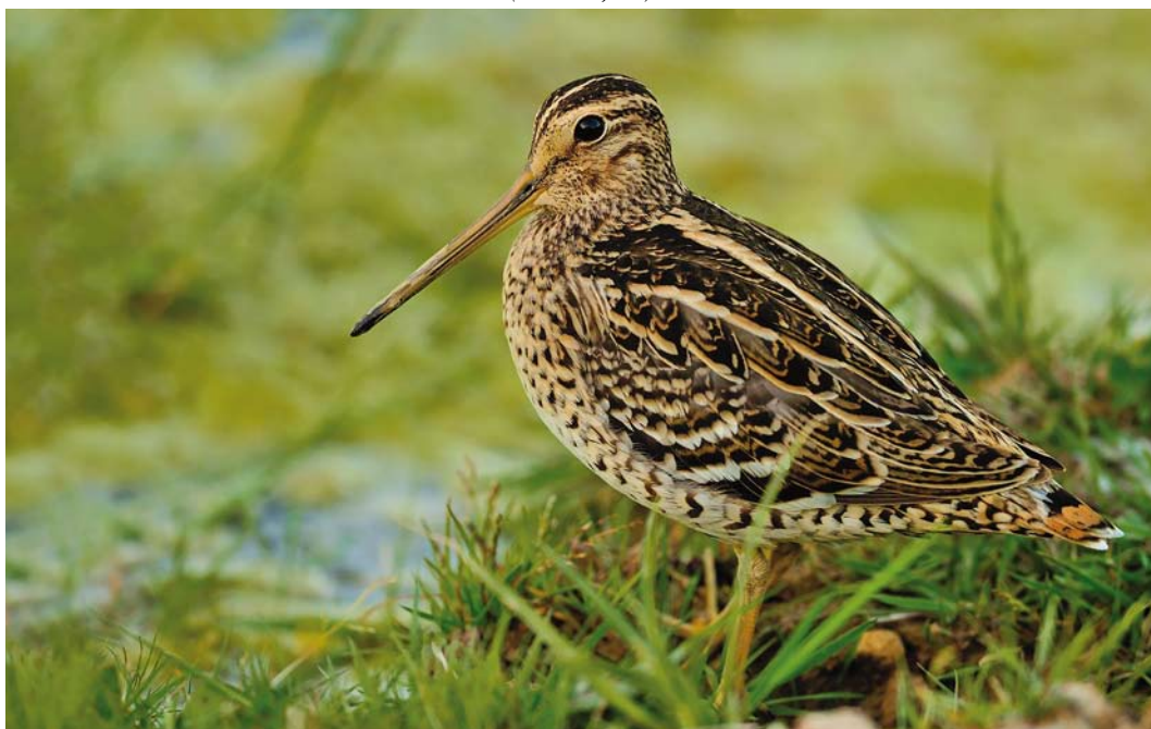
300 Great Snipe / Poelsnip Gallinago media , Sigean, Aude, France, 13 April 2015