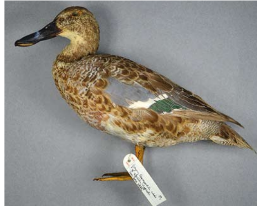
274 Hybrid Garganey x Northern Shoveler / hybride Zomertaling x Slobeend Anas querquedula x clypeata , male (Zoological Society London, 1855, most likely bred London Zoo), Natural History Museum, Tring, England, 22 April 2014 (Hein van Grouw). Eclipse plumage but with some breeding plumage feathers.

The mentioned typical Garganey head pattern seems to be suppressed in Garganey hybrids in general. Neither of the two breeding plumage Garganey hybrids from the Museum of Natural History (MNH) at Tring, England, examined by us shows any trace of this pattern (figure 3-4).