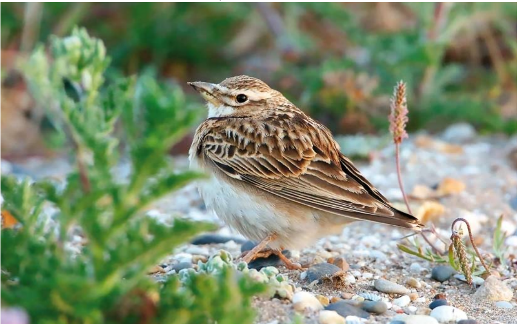
309 Bimaculated Lark / Bergkalanderleeuwerik Melanocorypha bimaculata , Salins des Pesquiers, Hyères, Var, France, 11 April 2015