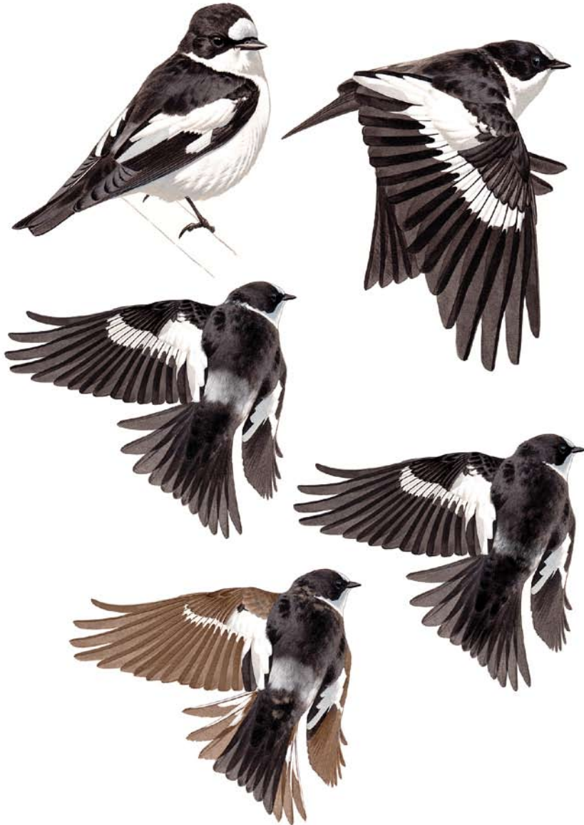
FIGURE 1 Atlas Pied Flycatchers / Atlasvliegenvangers Ficedula speculigera (Lorenzo Starnini). Images from birds on breeding grounds in Morocco and Tunisia in May. Perched bird shows typical adult male in fresh plumage with large white forehead patch, semi-collared appearance, square white wing patch on greater covers, all-black tail and pale greyish rump. Same bird with stretched wing shows wholly black outermost greater coverts, with black base to gc4-5 now visible on open wing. Note also that central median coverts are two thirds white. On some birds, white patch at base of primaries is as large as on well-marked Collared Flycatcher F. albicollis . In flight, two adult males showing variability in wing pattern, extent of pale on rump and semi-collared appearance. Note that upper bird approaches albicollis in rump pattern while lower bird approaches European Pied Flycatcher F. hypoleuca . Note extensive white patch on primary bases, reaching inner web of p2, as well as broad white base of all secondaries. Lowest bird is second calendar-year male showing retained outer tail-feathers edged white and smaller white primary patch, similar to that of hypoleuca .