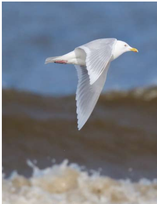
327 Kleine Burgemeester / Iceland Gull Larus glaucooides , derde-winter, Utrecht, Utrecht, 6 januari 2015