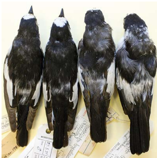
255 Atlas Pied Flycatchers / Atlasvliegenvangers Ficedula speculigera , adult males (collected in North Africa), NHM, Tring, England, 29 January 2009. Note variability in neck and rump pattern.

male semitorquata (but some have no collar), while a minority of albicollis in Italy can show a broken collar (Bonnet et al 2001; Andrea Corso pers obs). Therefore, a partial collar can be found in any of the four species but in different percentages. Bonnet et al (2011) suggested that a partial collar can be an ancestral character, shared by the four species. Hence, the trait may also occasionally be expressed in populations that normally lack it (atavism). It should be noted that adult male speculigera with a nearly full collar are strikingly similar to albicollis . In such birds, the pattern of median and inner greater coverts (presence of dark bases and presence of white tips on median) and the extent of white on the inner web of the median and outermost secondaries need to be carefully checked (see below).