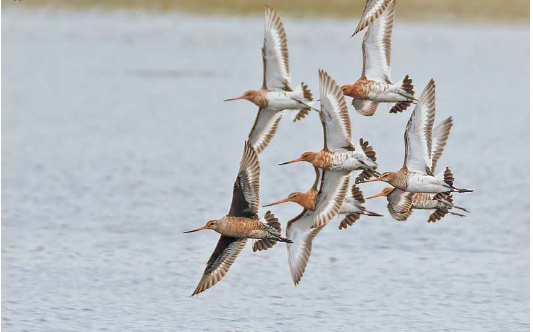
301 Hudsonian Godwit / Rode Grutto Limosa haemastica , adult, with Black-tailed Godwits / Grutto's L. limosa , Meare Heath, Somerset, England, 2 May 2015