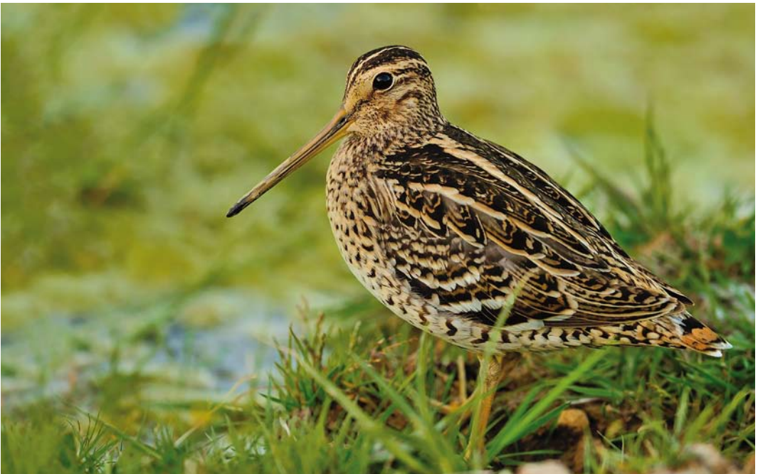
300 Great Snipe / Poelsnip Gallinago media , Sigean, Aude, France, 13 April 2015