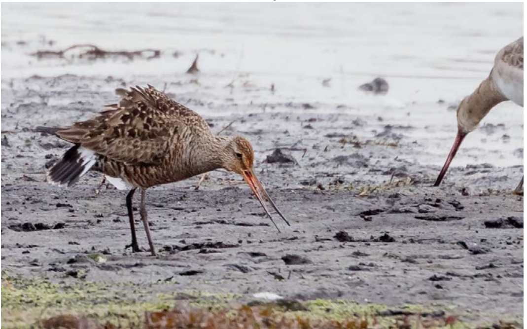
302 Hudsonian Godwit / Rode Grutto Limosa haemastica , adult, Meare Heath, Somerset, England, 1 May 2015