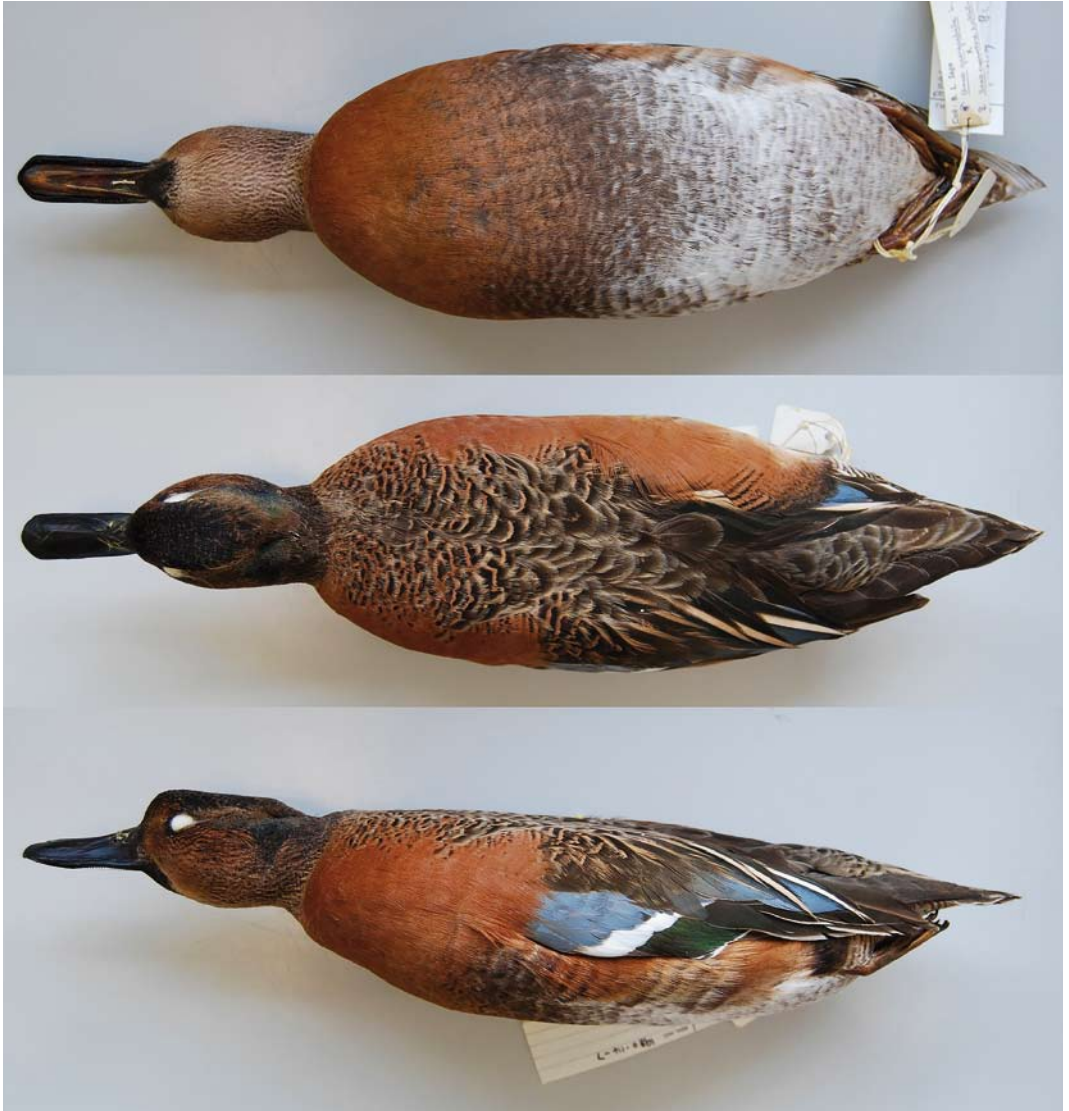
FIGURE 3 Hybrid Garganey x Cinnamon Teal / hybride Zomertaling x Kaneeltaling Anas querquedula x cyanoptera , male (captive bird of known parentage, Collection B L Sage, 1964), Natural History Museum, Tring, England, 2 September 2011 (Hein van Grouw)

eclipse-plumaged Garganey x Northern Shoveler A. clypeata hybrids (figure 3-4, plate 274). The breast colour of the Valencia bird, being darker and browner than in Eurasian Teal, was also a good fit for a hybrid with Garganey.