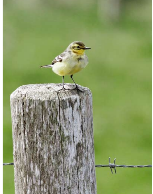
332 Grijsze Junco / Dark-eyed Junco Junco hyemalis , eerste-winter, Beijum, Groningen, Groningen, 9 april 2015 (Martijn Bot) 333 Citroenkwikstaart / Citrine Wagtail Motacilla citreola , vrouwtje, Noordervroon, Westkapelle, Zeeland, 19 april 2015 (Tobi Koppejan) 334 Blauwstaart / Red-flanked Bluetail Tarsiger cyanurus , Coepelduynen, Noordwijk, Zuid-Holland, 10 april 2015 (René van Rossum)