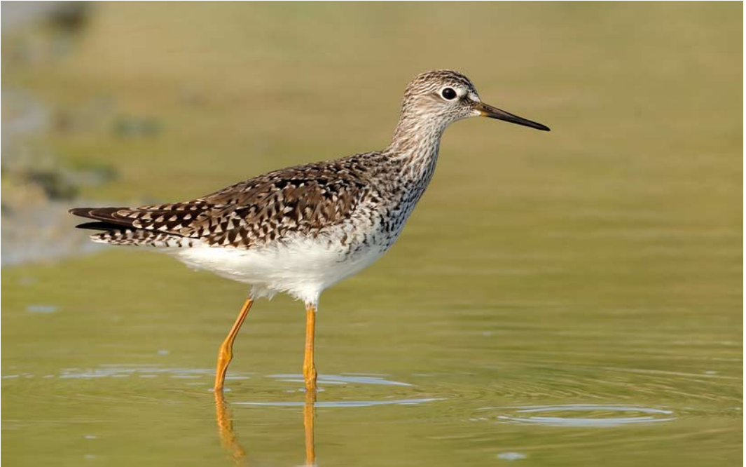
299 Lesser Yellowlegs / Kleine Geelpootruiter Tringa flavipes , IJzermonding, Nieuwpoort, West-Vlaanderen, Belgium, 10 May 2015