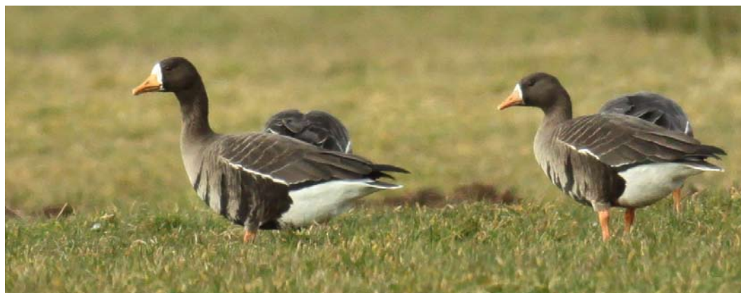
321 Ringsnaveleend / Ring-necked Duck Aythya collaris , mannetje, Flevoweg, Opperdoes, Noord-Holland, 14 april 2015 ( Fred Visscher ) 322 Groenlandse Kolganzen / Greenland White-fronted Geese Anser albifrons flavirostris , Hippolytushoef, Noord-Holland, 6 maart 2015 ( Fred Visscher )

flammeus . Een tweede-kalenderjaar Steenarend Aquila chrysaetos werd op 15 maart gefotografeerd bij Stadskanaal, Groningen (de laatste twitchbare was in 2002). Een vierde-kalenderjaar mannetje Steppekiekendief C macrourus werd op 24 april gefotografeerd vanaf telpost Noordkaap, Groningen. Van een 10-tal andere locaties kwamen ook meldingen, voornamelijk van langsvliegende vogels. Opvallend waren meldingen van Zeearenden uit de duinstreek van Noord- en Zuid-Holland, met daarbij zeker drie verschillende vierde-kalenderjaar vogels.