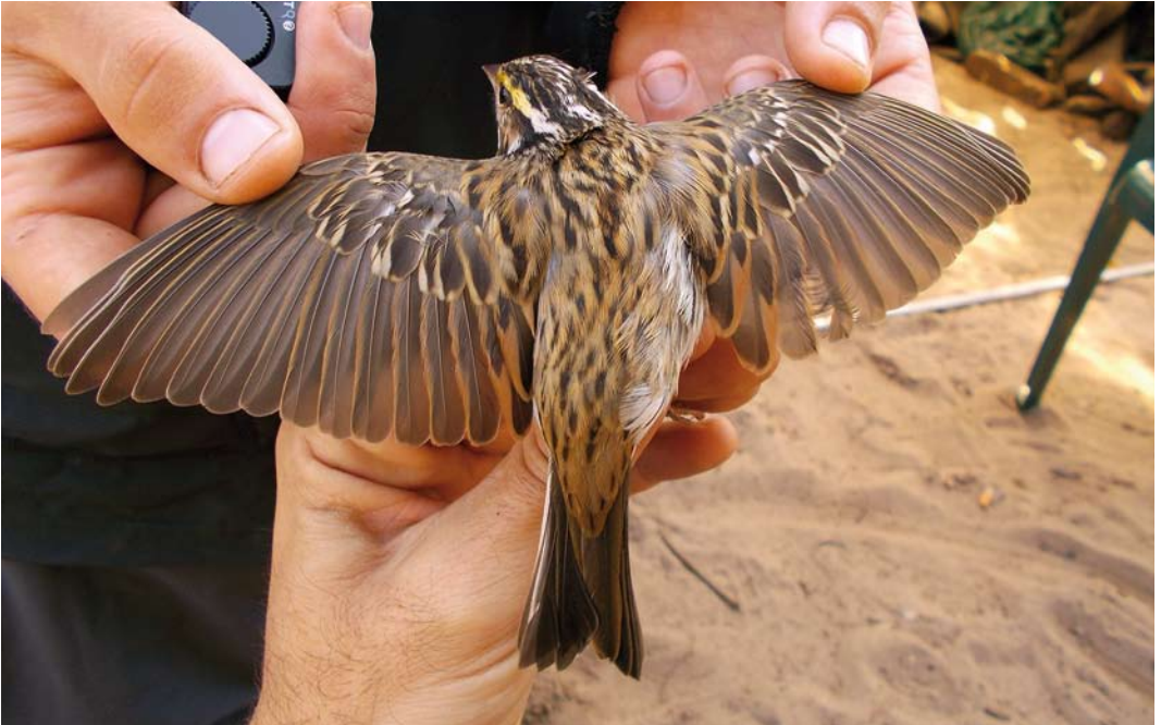
287-288 Yellow-browed Bunting / Geelbrauwgors Emberiza chrysophrys , first-year female, Dąbkowice, West Pomerania, Poland, 5 October 2014 (Michał Polakowski)