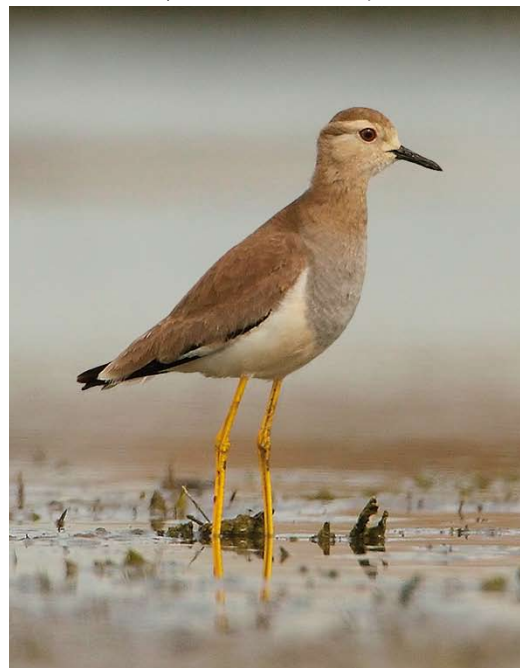
298 White-tailed Lapwing / Witstaartkievit Vanellus leucurus , adult, Żukowo, Wielkopolska, Poland, 9 May 2015

RAPTORSTO OWLS In north-western Europe, Black-winged Kites Elanus caeruleus flew over Hennef-Stadt Blankenberg, Nordrhein-Westfalen, Germany, on 27 March; Rheinland-Pfalz, Germany, on 13 April; Bødkermosen, Møn, on 23 April (seventh for Denmark); Elst, Utrecht, the Netherlands, on 4 May; and Thommen, Liège, Belgium, on 5 May. In Israel, three Crested Honey Buzzards