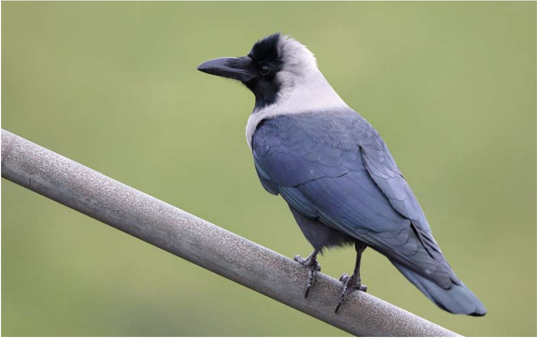
30 Huiskraai / House Crow Corvus splendens , adult, Hoek van Holland, Zuid-Holland, 5 april 2013 ( Chris van Rijswijk/birdshooting.nl ). Licht verenkleed indicatief voor ondersoort C s zugmayeri / pale plumage indicative of subspecies C s zugmayeri . 31 Huiskraai / House Crow Corvus splendens , adult, Hoek van Holland, Zuid-Holland, 5 april 2013 ( Chris van Rijswijk/birdshooting.nl ). Donker verenkleed typisch voor exemplaren van populatie in Hoek van Holland / dark plumage typical for birds of population at Hoek van Holland.