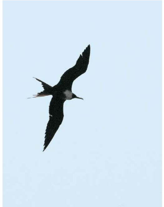
70 Pied Kingfisher / Bonte IJsvogel Ceryle rudis , Parco Naturale Regionale Litorale di Ugento, Puglia, Italy, 31 December 2014 ( Roberto Gennaio ) 71 Magnificent Frigatebird / Amerikaanse Fregatvogel Fregata magnificens , female, Boavista, Cape Verde Islands, 16 January 2015 ( René Pop/The Sound Approach ) 72 Black-tailed Godwit / Grutto Limosa limosa , Sal, Cape Verde Islands, 19 January 2015 ( René Pop/The Sound Approach )