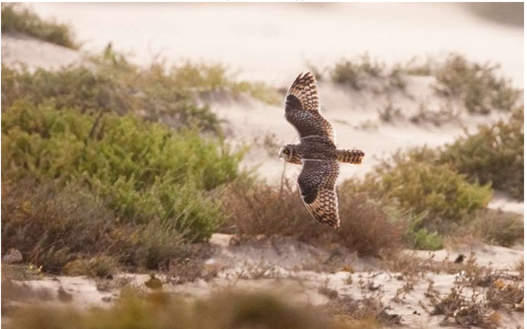
74 Short-eared Owl / Velduil Asio flammeus , Sal, Cape Verde Islands, 14 January 2015