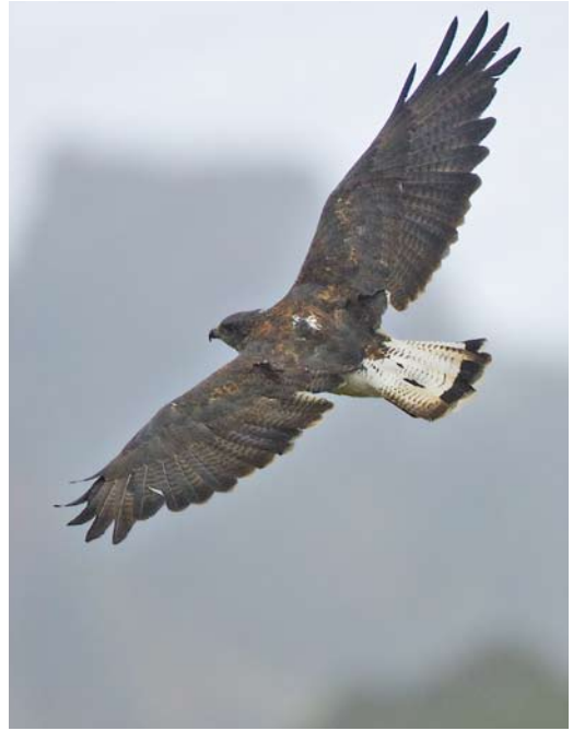
11 Masafuera Rayadito / Masafuerarayadito Aphrastura masafuerae , Masafuera, Chile, 11 March 2013 ( Hadoram Shirihai/©Tubenoses Project ) 12 Red-backed Hawk / Roodrugbuiserd Buteo polyosoma exsul , Masafuera, Chile, 11 March 2013 ( Hadoram Shirihai/©Tubenoses Project ) 13 Habitat of Red-backed Hawk Buteo polyosoma exsul , Masafuera, Chile, March 2013 ( Hadoram Shirihai/©Tubenoses Project ) 14 Red-backed Hawk / Roodrugbuiserd Buteo polyosoma exsul , Masafuera, Chile, 11 March 2013 ( Hadoram Shirihai/©Tubenoses Project )