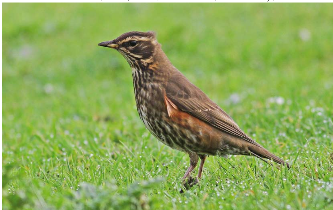
93 Vermoedelijke IJslandse Koperwiek / presumed Icelandic Redwing Turdus iliacus coburni , eerstejaars, Westerse Veld, Vlieland, Friesland, 2 november 2014 ( Nils van Duivendijk )