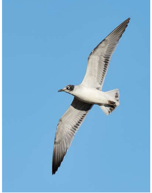
57 Laughing Gull / Lachmeeuw Larus atricilla , first-winter, Genova, Liguria, Italy, 30 December 2014 58 Franklin's Gull / Franklins Meeuw Larus pipixcan , first-winter, Sigean, Aude, France, 21 December 2014 59 Spotted Sandpiper / Amerikaanse Oeverloper Actitis macularius , Medemblik, Noord-Holland, Netherlands, 23 January 2015