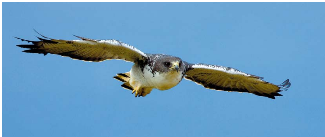
15 Red-backed Hawk / Roodrugbuizerd Buteo polyosoma exsul, Masafuera, Chile, 11 March 2013