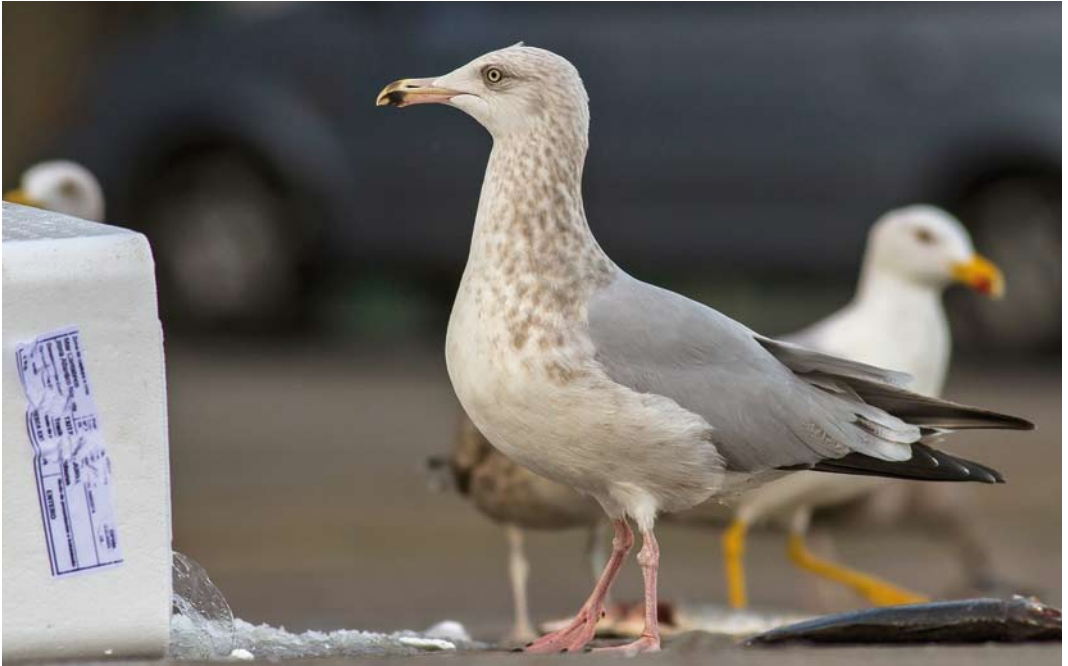
53 Smithsonian Gull / Amerikaanse Zilvermeeuw Larus smithsonianus , third-winter, Ondarroa, Bizcaia, Spain, 21 December 2014 54 Ivory Gull / Ivoormeeuw Pagophila eburnea , first-winter, feeding on dead Cuvier's Beaked Whale / Dolfijn van Cuvier Ziphius cavirostris , Benbecula, Outer Hebrides, Scotland, 18 December 2014