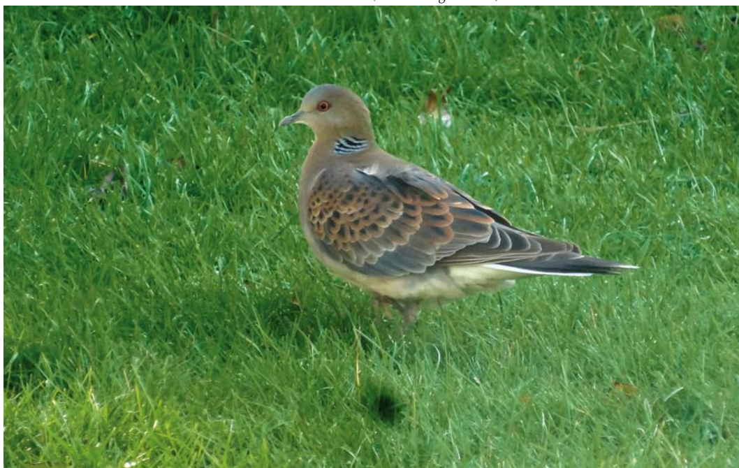
80 Oosterse Tortel / Oriental Turtle Dove Streptopelia orientalis , eerste-winter, Zoutelande, Zeeland, 14 december 2014