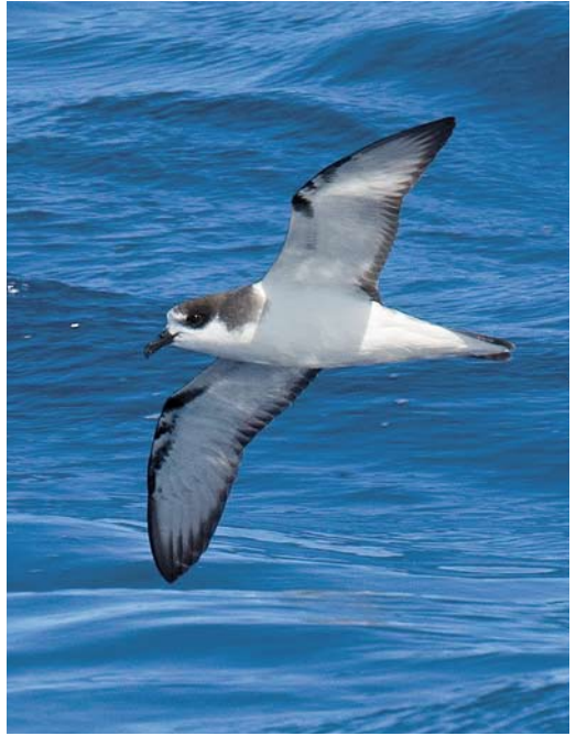
22-23 Stejneger's Petrel / Stejnegers Stormvogel Pterodroma longirostris , off Masafuera, Chile, 12 March 2013 (Hadoram Shirihai/©Tubenoses Project) 24 Stejneger's Petrel / Stejnegers Stormvogel Pterodroma longirostris , off Masafuera, Chile, 8 March 2013 (Hadoram Shirihai/©Tubenoses Project) 25 Stejneger's Petrel / Stejnegers Stormvogel Pterodroma longirostris , off Masafuera, Chile, 10 March 2013 (Hadoram Shirihai/©Tubenoses Project)