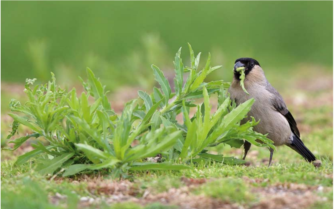
43 Azores Bulfinch / Azorengoudvink Pyrrhula murina , São Miguel, Azores, 19 June 2014