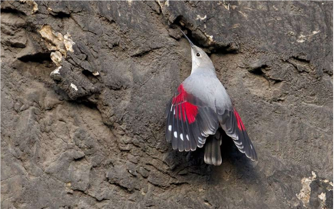
75 Wallcreeper / Rotskruiper Tichodroma muraria , Dinant, Namur, Belgium, 4 January 2015