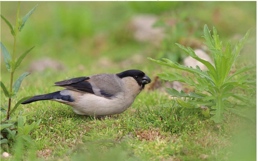
46 Azores Bulfinch / Azorengoudvink Pyrrhula murina , São Miguel, Azores, 15 June 2014