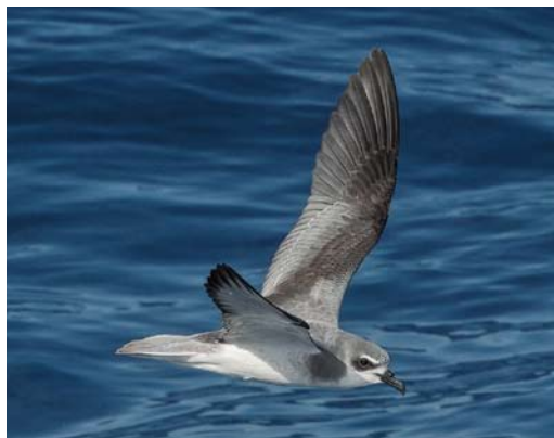
27 De Filippi's Petrel / Juan-Fernándezstormvogel Pterodroma defilippiana, 'en route' to Juan Fernández Archipelago, Chile, 15 March 2013. Winter breeder that we did not expect to see in such large numbers as we did in March, raising questions about their origin. 28 De Filippi's Petrel / Juan-Fernándezstormvogel Pterodroma defilippiana, between Robinson Crusoe Island and Masafuera, Chile, 8 March 2013

direction of position CH-9, 10 and 11 (see figure 1), where there was the impression of a corridor flight-path.