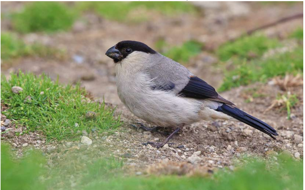
48 Azores Bulfinch / Azorengoudvink Pyrrhula murina , São Miguel, Azores, 17 June 2014