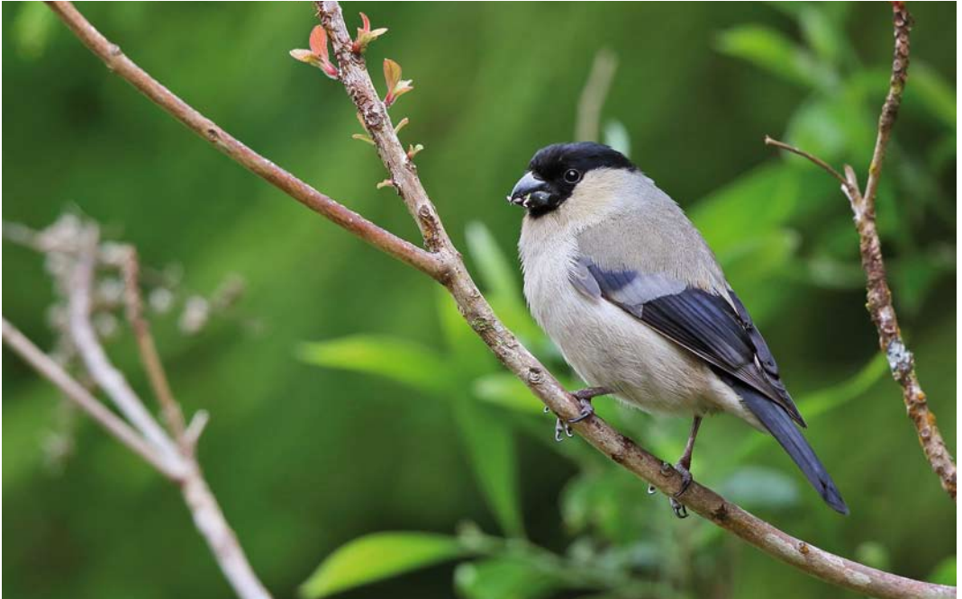
47 Azores Bulfinch / Azorengoudvink Pyrrhula murina , São Miguel, Azores, 18 June 2014