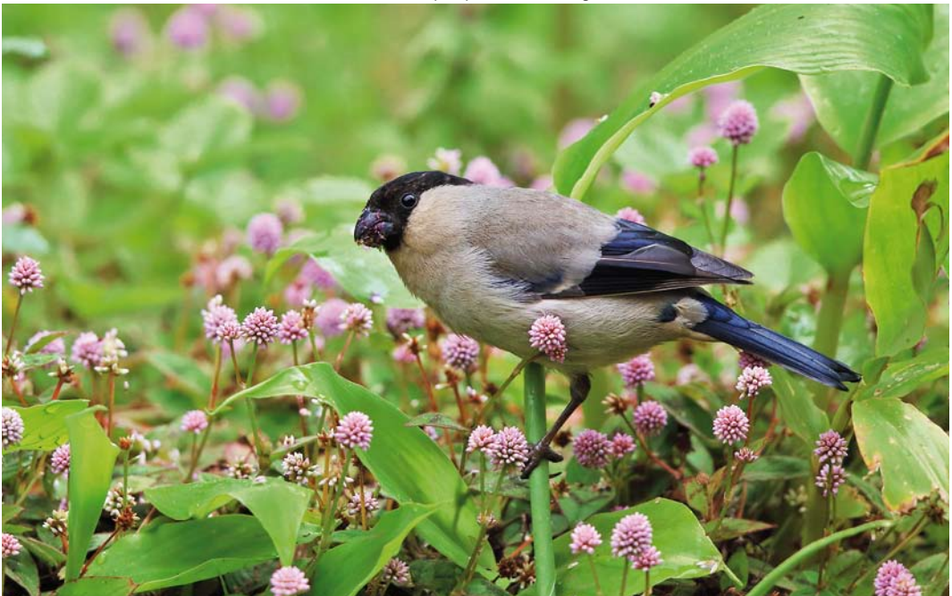
44 Azores Bulfinch / Azorengoudvink Pyrrhula murina , São Miguel, Azores, 14 June 2014