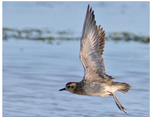
60 American White-winged Scoter / Amerikaanse Grote Zee-eend Melanitta deglandi deglandi , adult male, Helluvatn, Reykjavik, Iceland, 19 December 2014 61 Lesser White-fronted Goose / Dwerggans Anser erythropus , adult, Kfar Baruch, Israel, 11 November 2014 62 Harlequin Duck / Harlekijneend Histrionicus histrionicus , second calendar-year male, Aberdeen, Aberdeenshire, Scotland, 6 January 2015 63 Pacific Golden Plover / Aziatische Goudplevier Pluvialis fulva , Houmet Souk, Djerba, Tunisia, 5 January 2015

at Hamrarna, Fårabäck, Skåne, from 25 November into January. The fourth for the Netherlands was present at Medemblik, Noord-Holland, from 19 January onwards. A Greater Yellowlegs Tringa melanoleuca was seen at Titchfield, Hampshire, England, on 11 January. The Western Willet T semipalmata inornata at Ponta Delgado, São Miguel, Azores, from 23 September was still present in late January. A first-year Black-winged Pratincole Glareola nordmanni at Overijse, Vlaams-Brabant, Belgium, from 29 November was found dead on 3 December. In Tunisia, four Great Skuas Stercorarius skua were found on Djerba on 5 January.