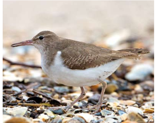
100 Amerikaanse Oeverloper / Spotted Sandpiper Actitis macularius , Medemblik, Noord-Holland, 22 januari 2015

(juveniel) en op 30-31 juli 2011 in de Hoogerwaardpolder, Noord-Brabant/Zeeland (adult zomerkleed). Dat er relatief snel na de vogel van 2011 een herkansing kwam is niet verwonderlijk gezien de aantallen van de soort in onder meer Brittannië (c 170 gevallen) en redelijk wat recente waarnemingen in bijvoorbeeld Scandinavië. Op dit moment overwintert bijvoorbeeld ook een vogel in Schotland en in Zuid-Zweden verbleef een exemplaar van eind november 2014 tot ten minste 10 januari 2015. ROB HALFF