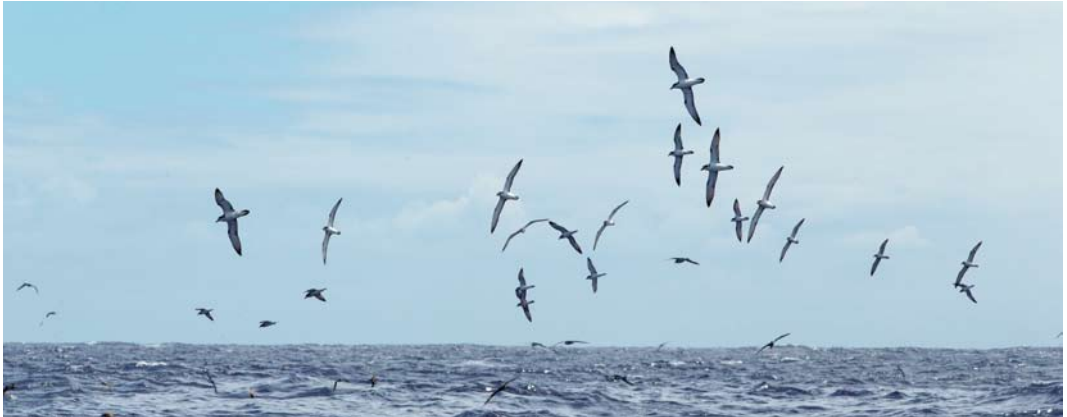
16 Juan Fernández Petrels / Witnekstormvogels Pterodroma externa , off Masafuera, Chile, 12 March 2013. Feeding flock during chumming session.

composed of large pieces, they often rest on the surface for a few seconds (at most 50) with open wings and peck at it. They often formed feeding frenzies and dropped down to the frozen chum blocks to eat from them, or to collect small pieces while in flight, mainly when a shark was scavenging from the chum block and breaking it into small pieces. Again, Juan Fernández Petrel feeding behaviour is thus in association with larger predator fish. Diving or other means of collecting food below the surface was not recorded.