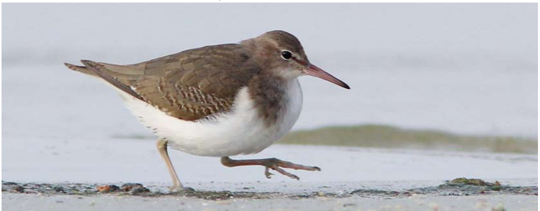
98 Amerikaanse Oeverloper / Spotted Sandpiper Actitis macularius , Medemblik, Noord-Holland, 21 januari 2015

Het betrof de vierde waarneming van deze Nearctische steltloper in Nederland en de tweede twitchbare. De soort overwintert van Midden- tot Zuid-Amerika. In Europa is het een regelmatige dwaalgast in alle maanden van het jaar, met relatief (voor een steltloper) veel winterwaarnemingen. Eerdere gevallen in Nederland waren op 18 juli 1976 in de Eerste Kroonspolder op Vlieland, Friesland (adult zomerkleed, verzameld), op 23 (vermoedelijk tot 28) augustus 1980 bij Diemen, Noord-Holland