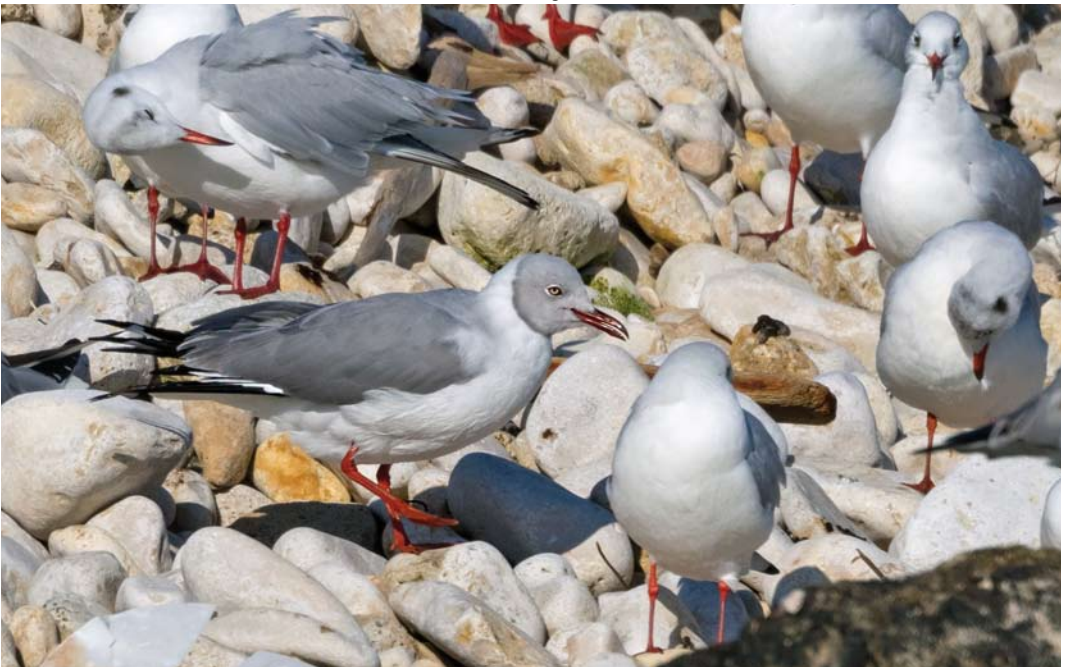
52 Grey-headed Gull / Grijskopmeeuw Chroicocephalus cirrocephalus , adult, Bari, Apulia, Italy, 3 January 2015