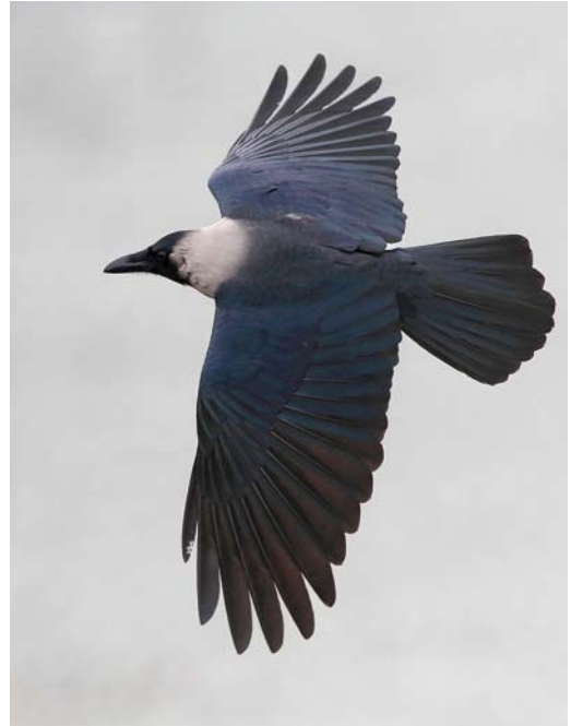
33 Huiskraai / House Crow Corvus splendens , adult, Hoek van Holland, Zuid-Holland, 5 april 2013. Licht verkleed indicatief voor ondersoort C s zugmayeri / pale plumage indicative of subspecies C s zugmayeri .

HOUSE CROW AT HOEK VAN HOLLAND SHOWING CHARACTERS OF SUBSPECIES ZUGMAYERI IN MAY 2012-JULY 2013 Since 1994, a small population of House Crows Corvus splendens in the Netherlands exists, centered in Hoek van Holland, Zuid-Holland (in 2014, most of the population was eradicated, commissioned by the Dutch national government). Like most populations of this species outside of their original range, these birds are possibly of mixed subspecific identity. Most of the birds at Hoek van Holland are likely related to the original breeding pair (which was first noted in April 1994 and first bred in 1997). However, new arrivals since then cannot be excluded, especially since House Crows presumably not originating from Hoek van Holland have been observed in other parts of the country and Europe. From May 2012 until July 2013 (possibly into October 2013), a strikingly pale House Crow was observed in Hoek van Holland, showing characters of the palest subspecies C s zugmayeri from Iran, Pakistan and Jammu and Kashmir, India. Given that the Hoek van Holland