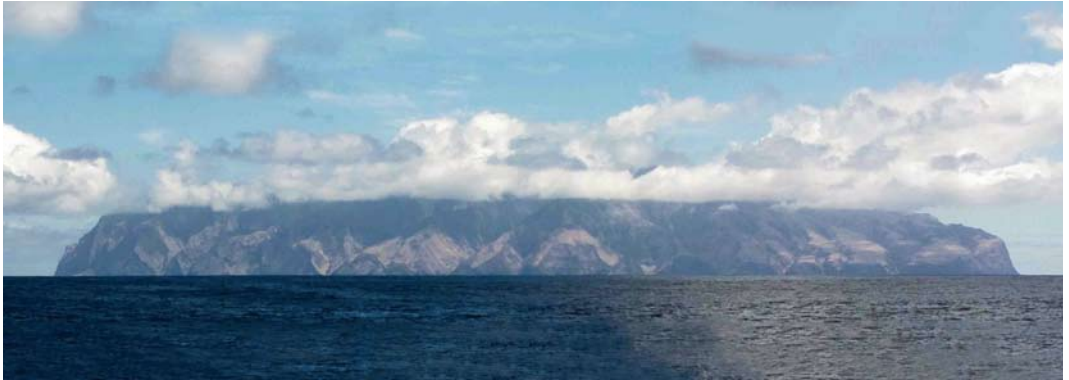
2 Masafuera, Juan Fernández archipelago, Chile, 10 March 2013. Bizarre impression of melting ragged huge chocolate cake in middle of ocean, with summit nearly always to some degree covered by thick cloud.

freezers at -20^{\circ}\text{C} . With frozen blocks, the bait floats longer permitting petrels to take food before it sinks. Gadfly petrels are more easily attracted to floating material of a certain size, permitting prolonged and closer views.