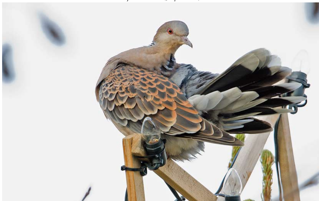
82 Oosterse Tortel / Oriental Turtle Dove Streptopelia orientalis , eerste-winter, Vlaardingen, Zuid-Holland, 6 januari 2015