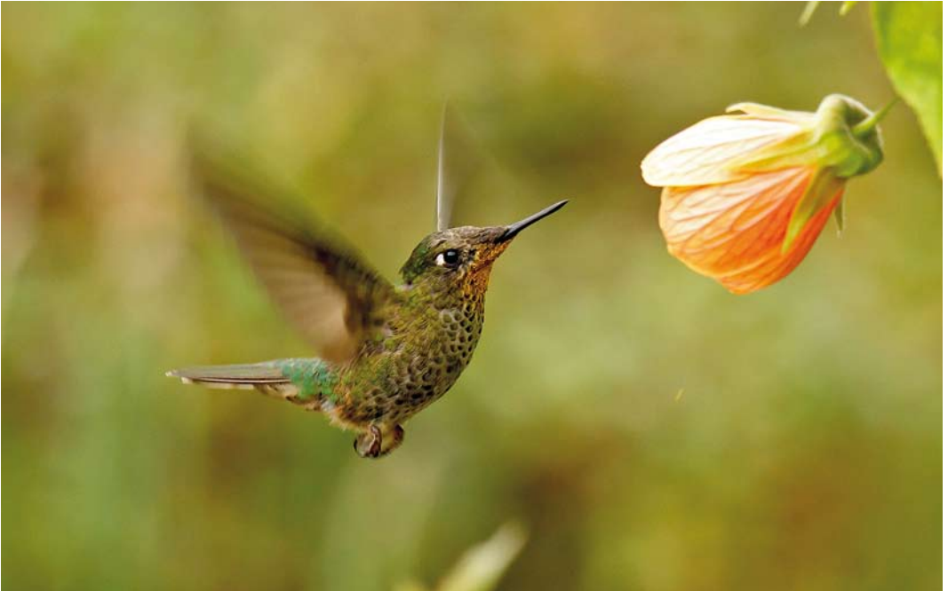
7 Green-backed Firecrown / Vuurkroonkolibrie Sephanoides sephaniodes , female, Robinson Crusoe Island, Chile, 7 March 2013 (Hadoram Shirihai/©Tubenoses Project) 8 Green-backed Firecrown / Vuurkroonkolibrie Sephanoides sephaniodes , male, Robinson Crusoe Island, Chile, 7 March 2013 (Hadoram Shirihai/©Tubenoses Project). Other hummingbird species on Robinson Crusoe. 9 Juan Fernández Tit-Tyrant / Juan-Fernándezmeestiran Anairetes fernandezianus , Robinson Crusoe Island, Chile, 7 March 2013 (Hadoram Shirihai/©Tubenoses Project)