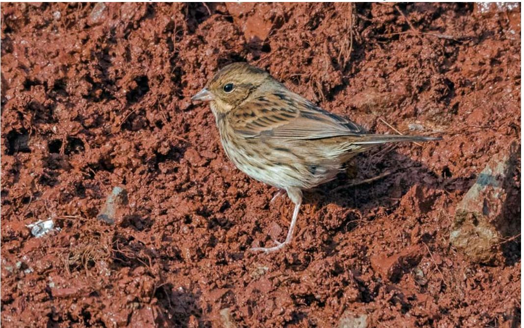
76 Black-faced Bunting / Maskergors Emberiza spodocephala , first-year or female, Kringel, Helgoland, Schleswig-Holstein, Germany, 8 December 2014 (Vincent Legrand)