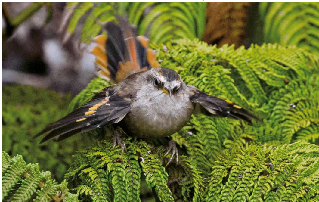
10 Masafuera Rayadito / Masafuerarayadito Aphrastura masafuerae, Masafuera, Chile, 11 March 2013