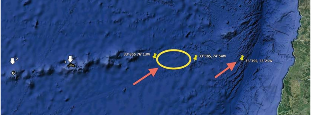
FIGURE 4 Juan Fernández archipelago, with Robinson Crusoe Island (1) and Masafuera (2). Main feeding grounds of petrels (yellow circle) stretch for almost 100 km (at roughly 400-500 km east from Masafuera); another one was located around western edge of Continental Shelf (right red arrow; see main text)

We were surprised to see this species feeding far east over the Humboldt Current. The crossings over the Humboldt waters produced in total 531 birds, with most around the Continental Shelf (110-165 km off the coast; see figure 4). This total includes 31 birds recorded as far east as 63 and 80 km off the coast on 3 March.