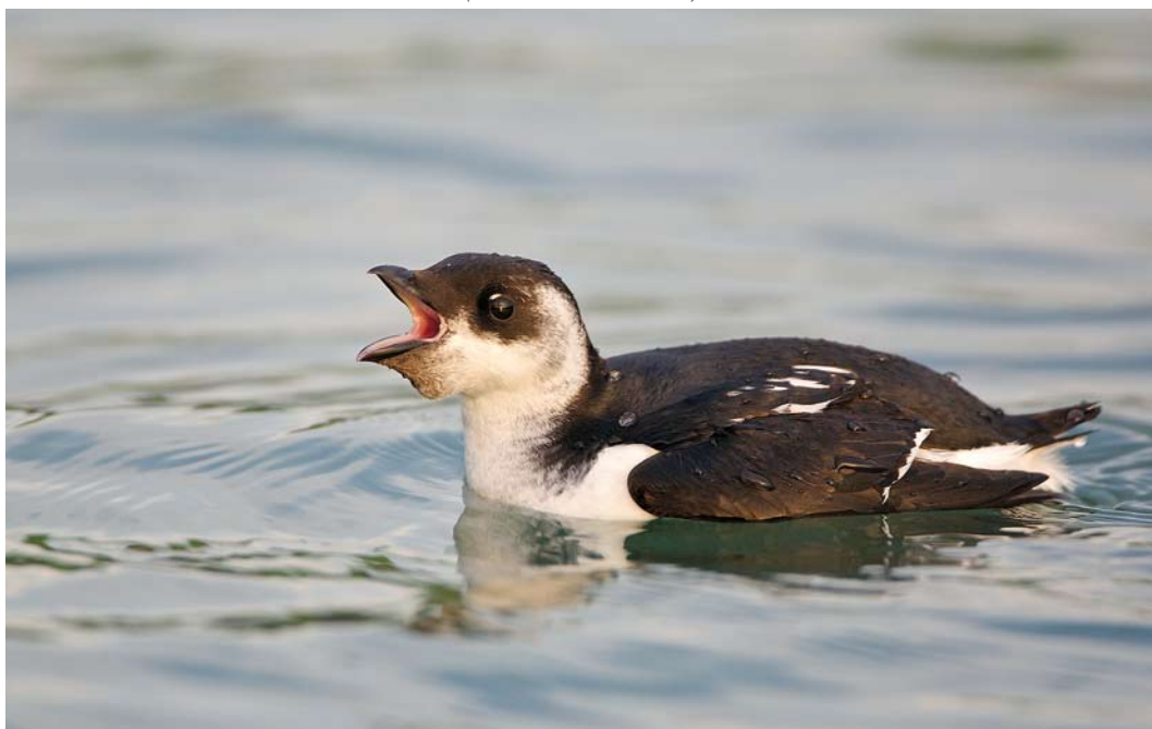
85 Kleine Alk / Little Auk Alle alle , Burghsluis, Zeeland, 28 november 2014 (Martin van der Schalk)