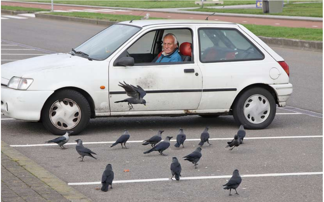
32 Huiskraaien / House Crows Corvus splendens , adult, met Kauwen / Western Jackdaws C monedula , Hoek van Holland, Zuid-Holland, 26 oktober 2012. Licht verkleed (links) indicatief voor ondersoort C s zugmayeri / pale plumage (left) indicative of subspecies C s zugmayeri .

gemengd zijn en de subspecifieke identiteit niet altijd te benoemen is (Cramp et al 1994).