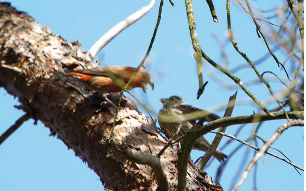
36 Grote Kruisbekken / Parrot Crossbills Loxia pytyopsittacus , mannetje en juveniel, Otterlosche Zand, Gelderland, 17 april 2014