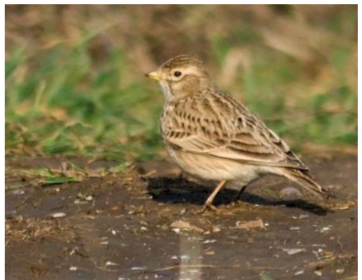
64 Ashy Drongo / Grijsze Drongo Dicrurus leucophaeus , Gan Shmuel, Hefer valley, Israel, 15 December 2014 ( Rony Livne ) 65 Asian Nuthatch / Aziatische Boomklever Sitta europaea asiatica , Marjaniemi, Hailuoto, Finland, 19 December 2014 ( Martin Gottschling ) 66 Black-throated Accentor / Zwartkeelheggenmus Prunella atrogularis , Marjaniemi, Hailuoto, Finland, 19 December 2014 ( Martin Gottschling ) 67 Eastern Black Redstart / Oosterse Zwarte Roodstaart Phoenicurus ochruros semirufus/phoenicuroides , first-year male, Scalby, North Yorkshire, England, 2 December 2014 ( David Aitken ) 68 North African Reed Warbler / Kortvleugelkarekiet Acrocephalus baeticatus , Douz, Tunisia, 8 January 2015 ( Michele Viganò ) 69 Lesser Short-toed Lark / Kleine Kortteenleeuwerik Alaudala rufescens , Costinesti, Constanta, Romania, 12 December 2014 ( Zoltán Baczó )