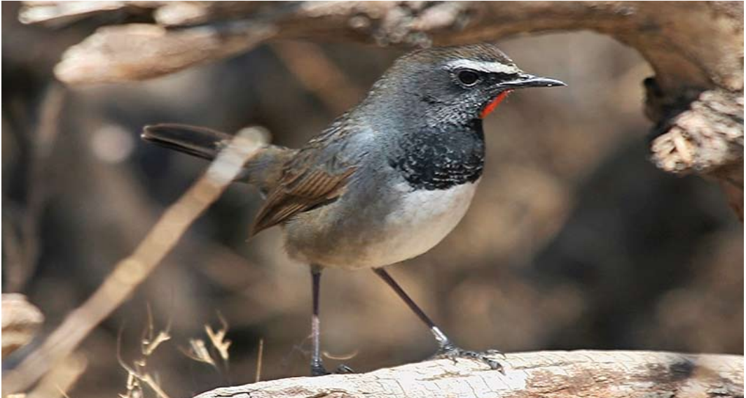
40 White-tailed Rubythroat / Zwartborstnachttegaal Calliope pectoralis, second calendar-year male, Bozoy, Almaty province, Kazakhstan, 8 May 2014