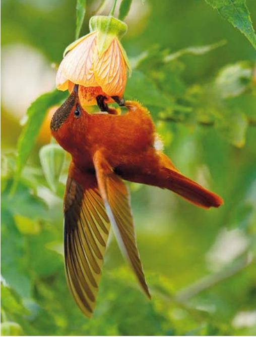
3 Juan Fernández Firecrown / Juan-Fernándezkolibri Sephanooides fernandensis , male, Robinson Crusoe Island, Chile, 7 March 2013. Typical hanging upside-down feeding behaviour.