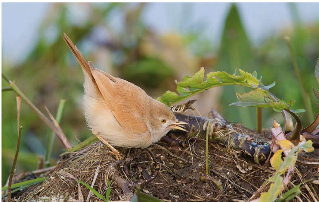
88 Afrikaanse Woestijngasmus / African Desert Warbler Sylvia deserti , Polder Gnephoek, Alphen aan den Rijn, Zuid-Holland, 29 november 2014 (René van Rossum)