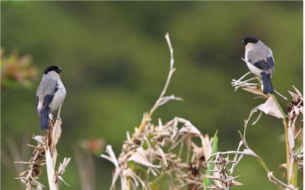
45 Azores Bulfinches / Azorengoudvinken Pyrrhula murina , São Miguel, Azores, 15 June 2014