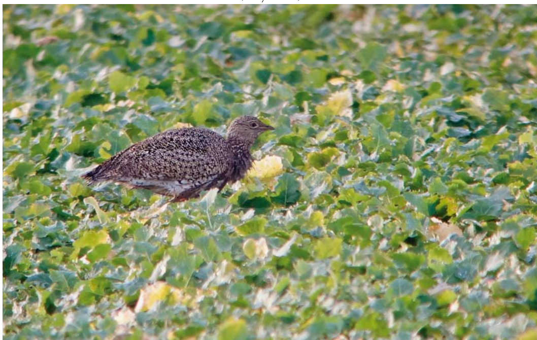
56 Little Bustard / Kleine Trap Tetrax tetrax , Fraisthorpe, East Yorkshire, England, 31 December 2014