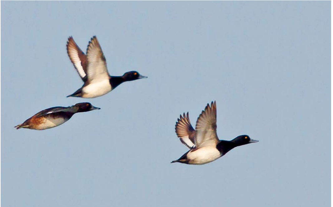
77 Kleine Topper / Lesser Scaup Aythya affinis , mannetje (rechts), met Kuifeenden / Tufted Ducks A fuligula , Pampushaven, Flevoland, 22 november 2014 (Maurits Martens)