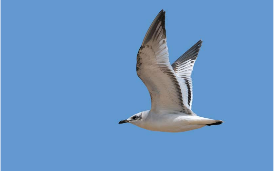
73 Mediterranean Gull / Zwartkopmeeuw Larus melanocephalus , first-winter, Sal, Cape Verde Islands, 13 January 2015