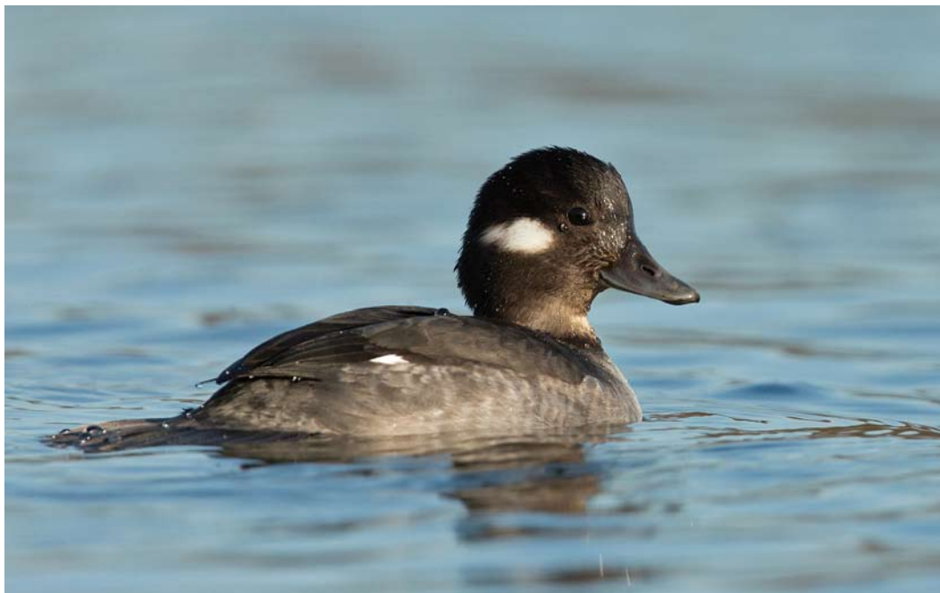
79 Buffelkopeend / Bufflehead Bucephala albeola , eerstejaars vrouwtje, WML-plas, Heel, Limburg, 1 januari 2015