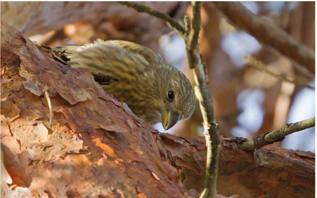
37 Grote Kruisbek / Parrot Crossbill Loxia pytyopsittacus , juveniel, Otterlosche Zand, Gelderland, 18 april 2014 (Alex Bos)