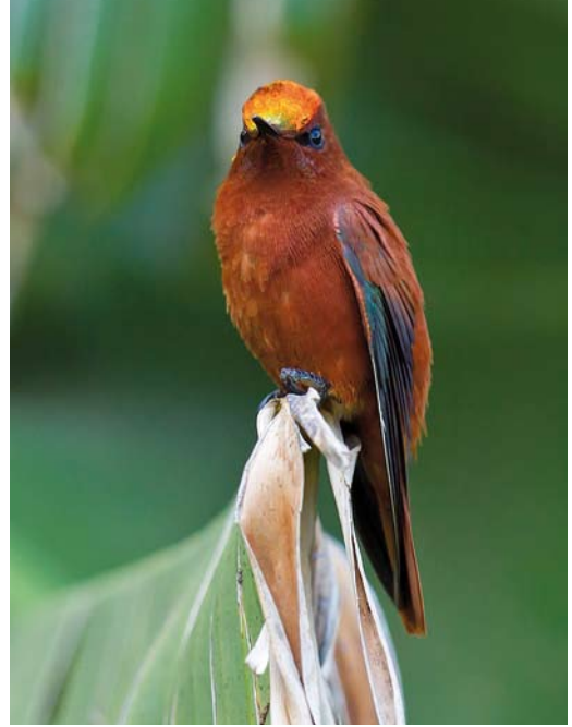
4 Juan Fernández Firecrown / Juan-Fernándezkolibri Sephanooides fernandensis, male, Robinson Crusoe Island, Chile, 7 March 2013.

Masafuera is one of the most important sites for breeding petrels in the eastern Pacific and, despite being a World Heritage Site, we have little hope for the two endemic petrels without eradication of the introduced fauna (rats, mice, cats and goats) from the island. Furthermore, permanent or regular monitoring of the populations is lacking.