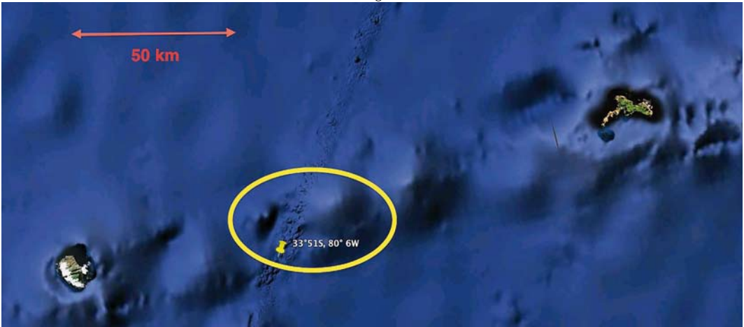
FIGURE 5 Location of oceanic ridge between Robinson Crusoe Island (right) and Masafuera (left) where major feeding concentration was located (yellow circle; mostly Juan Fernández Petrels Pterodroma externa , see main text)

tions, including tight group arching (plate 16). The main natural prey is flying fish and squid, and other small fish that jump above the surface. They follow shoals of larger predator fish (like tuna) that chase and panic these small creatures into leaping above the surface in huge numbers – the petrels collect them in the air, and are able to do this due to their incredibly fast flight. We do not exaggerate with our estimate that the speed of flight is 200 km/h in strong wind conditions, similar to Peregrine Falcon Falco peregrinus . Under artificial feeding conditions (ie, chumming), Juan Fernández Petrel collects small floating food items from the surface while flying (before the item sinks). If the food is