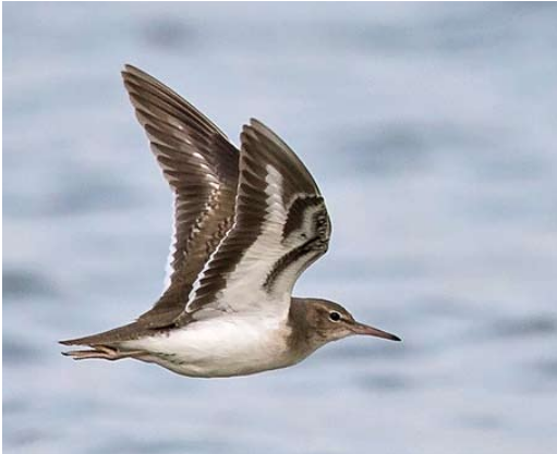
99 Amerikaanse Oeverloper / Spotted Sandpiper Actitis macularius , Medemblik, Noord-Holland, 21 januari 2015