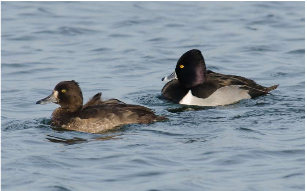
78 Ringsnaveleend / Ring-necked Duck Aythya collaris , adult mannetje, met Kuifeend / Tufted Duck A fuligula , vrouwtje, Pampushaven, Flevoland, 29 november 2014