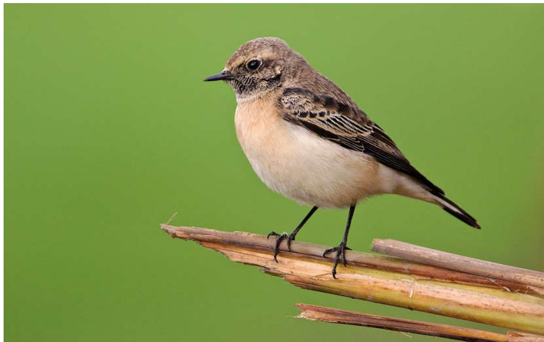
92 Bonte Tapuit / Pied Wheatear Oenanthe pleschanka , eerstejaars mannetje, Zoeterwoude, Zuid-Holland, 12 november 2014 ( Martin van der Schalk )