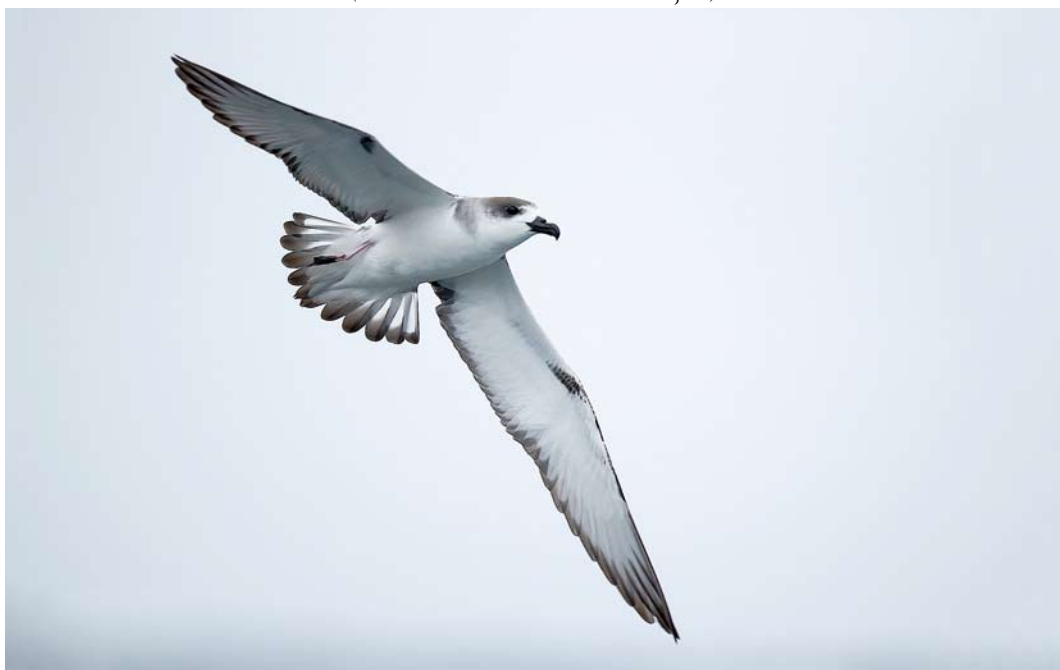
21 Juan Fernández Petrel / Witnekstormvogel Pterodroma externa , off Masafuera, Chile, 4 March 2013