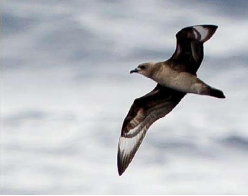
29 Kermadec Petrel / Kermadecstormvogel Pterodroma neglecta juana , between Robinson Crusoe Island and Masafuera, Chile, 14 March 2013 (Hadoram Shirihai/©Tubenoses Project)

movements and its seasonality. De Filippi's disperses from the breeding islands northward into the Humboldt and Peruvian Currents. Indeed, good numbers were found in the latter waters in September 2003 (see www.oceanwanderers.com/PetrelCocktail.html ). Carboneras (1992) also mentions it being 'absent from sea around breeding grounds, March-January' as well as its northward dispersal up to the Peruvian Current. With current knowledge, it is thus impossible to relate our observations to any particular known colony. Our birds were rather pale, regardless of age. They involved mostly evenly fresh juveniles but some were adult/immature at the end of primary moult. We noted the following characters: relatively limited black wing tip area (with extensive white inner web thongs penetrating the black wing tip); narrower/shorter and often broken dark diagonal bar of the underwing-coverts; seemingly whiter face (with extensive and cleaner white forehead connecting to the white supercilium, thus leaving rather narrow and more pointed black eye-mask); and with whiter and cleaner outer tail-feathers. The bill seemed also rather narrow but longish.