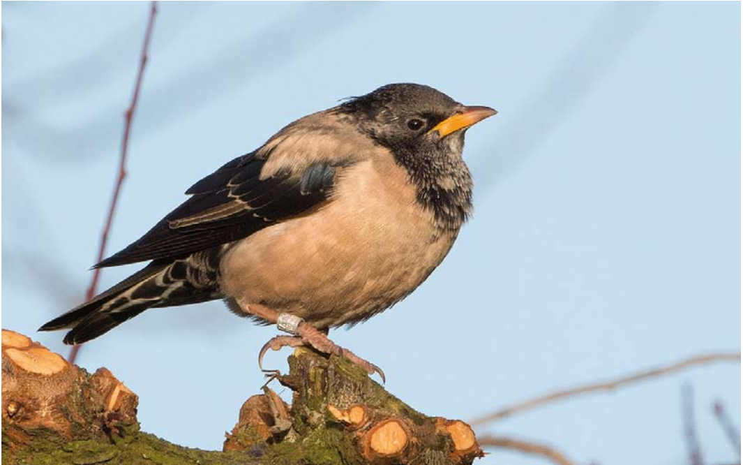
83 Roze Spreeuw / Rosy Starling Pastor roseus , eerste-winter, Vlaardingen, Zuid-Holland, 24 januari 2015 (Co van der Wardt)

late Boomvalk F subbuteo werd op 7 november waargenomen bij Castricum, Noord-Holland. De Arendbuizerd B rufinus van de Tweede Maasvlakte, Zuid-Holland, bleef de gehele periode.