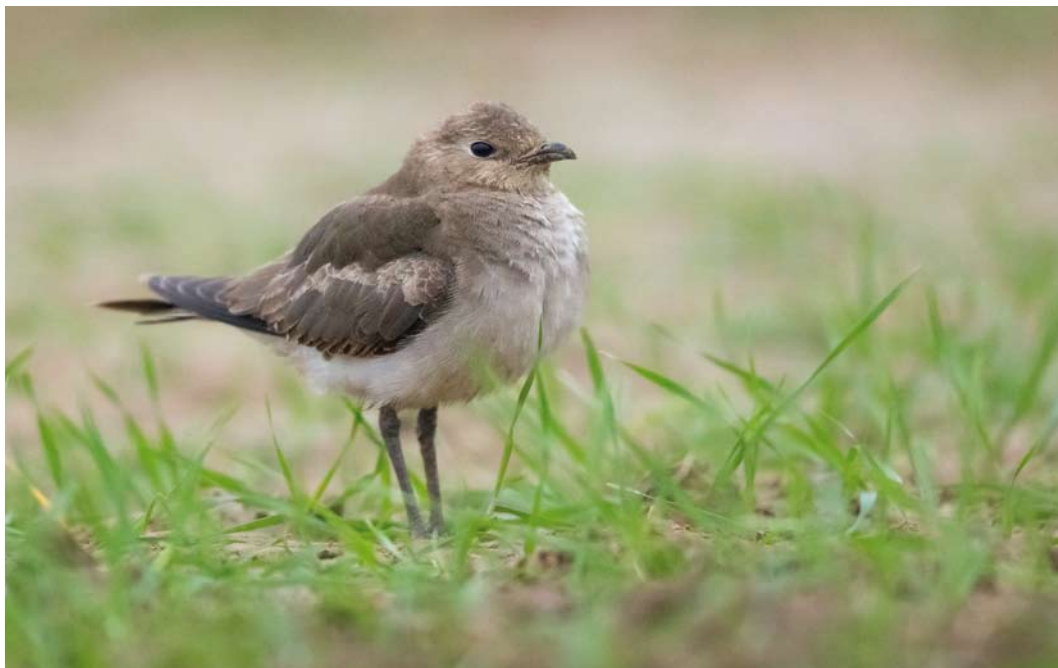
55 Black-winged Pratincole / Steppevoorkstaartplevier Glareola nordmanni , first-year, Overijse, Vlaams-Brabant, Belgium, 1 December 2014