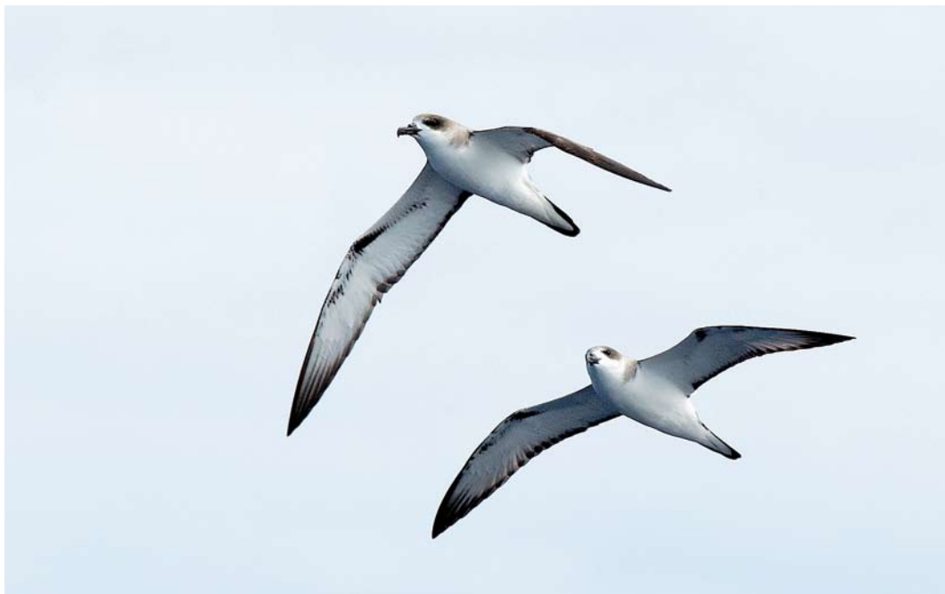
20 Juan Fernández Petrels / Witnekstormvogels Pterodroma externa , off Masafuera, Chile, 12 March 2013