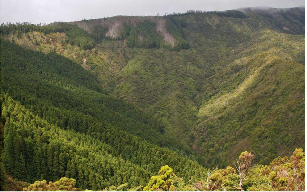
42 Habitat of Azores Bullfinch Pyrrhula murina , São Miguel, Azores, 14 June 2014

but ion is restricted to the remaining patches of native laurel forest in the Special Protection Area of Pico da Vara/Ribeira do Guilherme (highest point 1103 m above sea level) in the eastern part of São Miguel, Azores (c 1400 km from mainland Portugal). São Miguel is the only island in the Azores archipelago where it occurs and has occurred in the past. Being one of Europe's rarest and most localized breeding species, it is remarkable that it is not illustrated nor even mentioned in Svensson et al (2009).