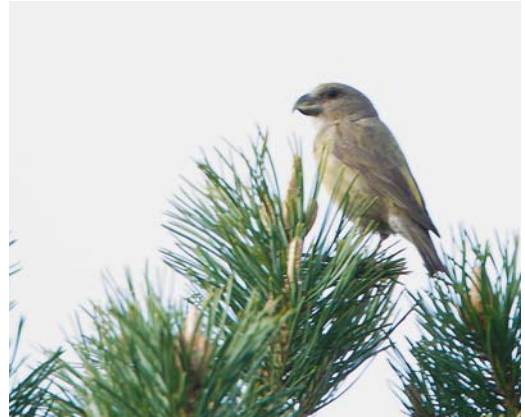
39 Grote Kruisbek / Parrot Crossbill Loxia pytyopsittacus , vrouwtje, Otterlosche Zand, Gelderland, 18 april 2014 (Alex Bos)

Op 26 februari 2014 vond PieterGeert Gelderblom echter tijdens een van zijn kruisbekkentochten over de Hoge Veluwe in een perceel Grove Den Pinus sylvestris aan de noordzijde van het Otterlosche Zand (52.118 N, 05.821 O) twee paartjes Grote Kruisbek. Op 15 maart kwam PGG niet verder dan één overvliegend exemplaar in hetzelfde perceel en HvO telde op 16 en 23 maart ook slechts één exemplaar. Omdat Grote Kruisbekken al vroeg in het voorjaar beginnen met broeden was er hoop dat er sprake kon zijn van een broedgeval; bij Grote Kruisbek komen nestbouw en broeden geheel voor rekening van het vrouwtje, terwijl het mannetje voedsel aanvoert (Cramp & Perrins 1994). Op 2 april zag PGG drie exemplaren, waarvan hij alleen het mannetje goed in beeld kreeg; op 16 april zag hij ze weer en kon ze ditmaal alle drie goed bekijken en het mannetje fotograferen. Het betrof een mannetje, een vrouwtje en een juveniele vogel. Op beide dagen maakte PGG geluidsopnamen om de determinatie te bevestigen. Tijdens het observeren viel het PGG op hoe stil de vogels waren bij het foerageren; alleen het mannetje maakte regelmatig zachte, 'binnensmondse' geluidjes. Pas toen er een Buizerd Buteo buteo laag overkwam klonk er een korte serie 'excitement calls' en vlak voor de vogels dieper het bos invloog ook enkele luide vluchtroepen. Analyse van de geluidsopnamen bevestigde de determinatie. PGG gaf zijn ontdekking aan een aantal mensen door (Gelderblom 2014).