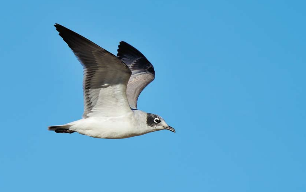
51 Franklin's Gull / Franklins Meeuw Larus pipixcan , first-winter, Sigean, Aude, France, 22 December 2014