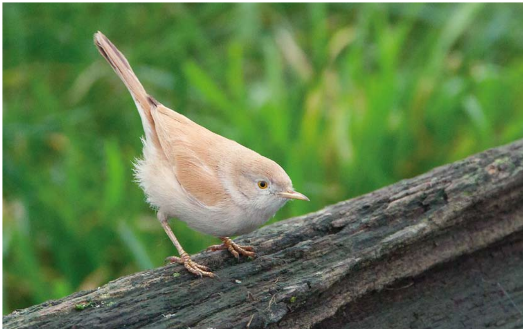
87 Afrikaanse Woestijngasmus / African Desert Warbler Sylvia deserti , Polder Gnephoek, Alphen aan den Rijn, Zuid-Holland, 26 november 2014