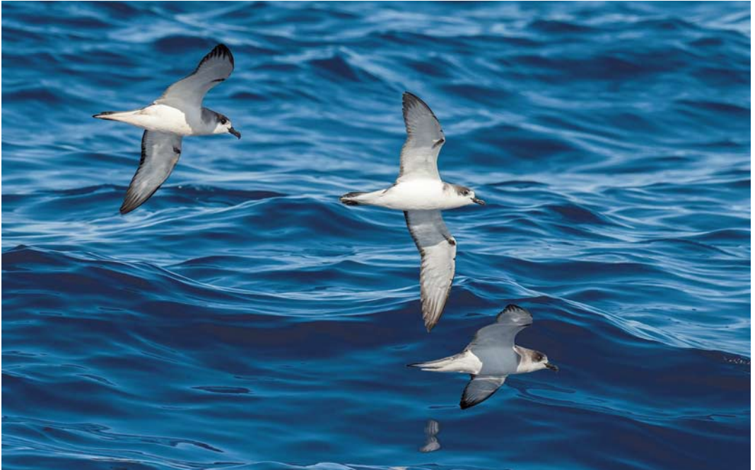
17 Juan Fernández Petrels / Witnekstormvogels Pterodroma externa, off Masafuera, Chile, 8 March 2013 18 Juan Fernández Petrel / Witnekstormvogel Pterodroma externa, off Masafuera, Chile, 12 March 2013 19 Stejneger's Petrel / Stejnegers Stormvogel Pterodroma longirostris (above) and Juan Fernández Petrel / Witnekstormvogel P externa (below), off Masafuera, Chile, 12 March 2013. The two gadfly petrels endemic to Juan Fernández archipelago.