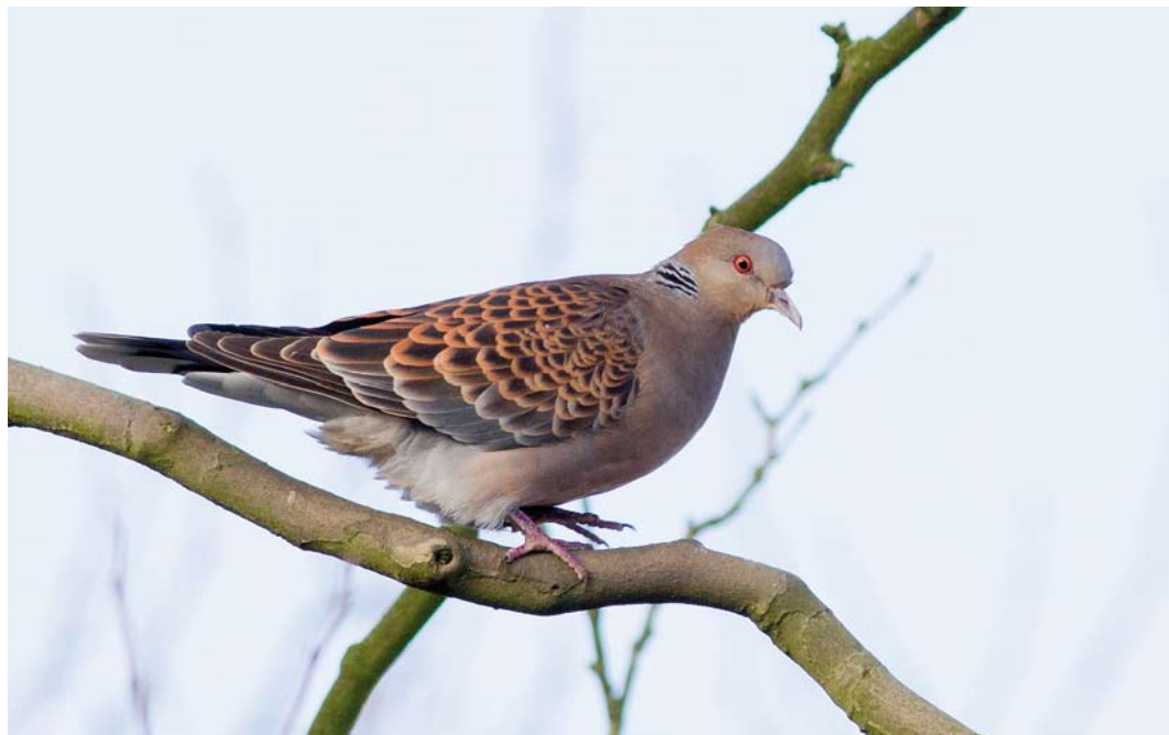
81 Oosterse Tortel / Oriental Turtle Dove Streptopelia orientalis , eerste-winter, Vlaardingen, Zuid-Holland, 4 januari 2015 ( Herman Bouman )