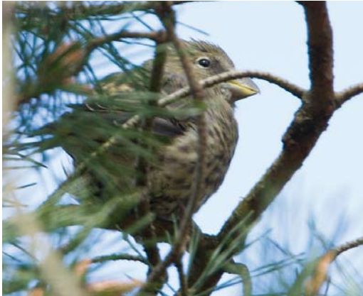
38 Grote Kruisbek / Parrot Crossbill Loxia pytyopsittacus , juveniel, Otterlosche Zand, Gelderland, 17 april 2014 (Alex Bos)