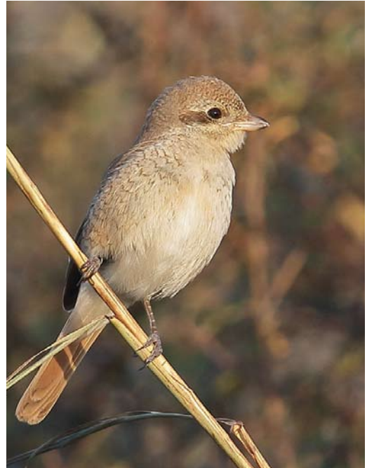
89 Afrikaanse Woestijngrasmus / African Desert Warbler Sylvia deserti , Polder Gnephoek, Alphen aan den Rijn, Zuid-Holland, 28 november 2014 ( Martin van der Schalk ) 90 Vermoedelijke Turkestaanse Klauwier / presumed Red-tailed Shrike Lanius phoenicuroides , eerstejaars, Noordhollands Duinreservaat, Castricum, Noord-Holland, 21 november 2014 ( Eric Menkveld ) 91 Vermoedelijke Turkestaanse Klauwier / presumed Red-tailed Shrike Lanius phoenicuroides , eerstejaars, Noordhollands Duinreservaat, Castricum, Noord-Holland, 13 november 2014 ( Luc Knijnsberg )