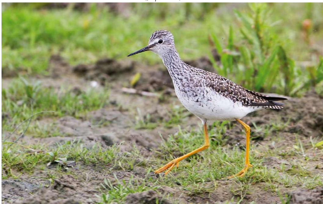
369 Kleine Geelpootruiter / Lesser Yellowlegs Tringa flavipes , zomerkleed, Ezumakeeg, Friesland, 9 juni 2014