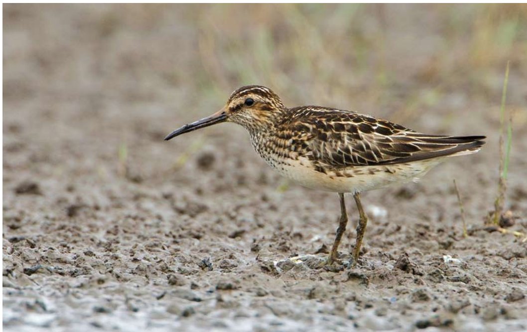
368 Breedbekstrandloper / Broad-billed Sandpiper Calidris falcinellus , zomerkleed, Terschellinger Polder, Terschelling, Friesland, 22 juni 2014 (Arie Ouwerkerk)