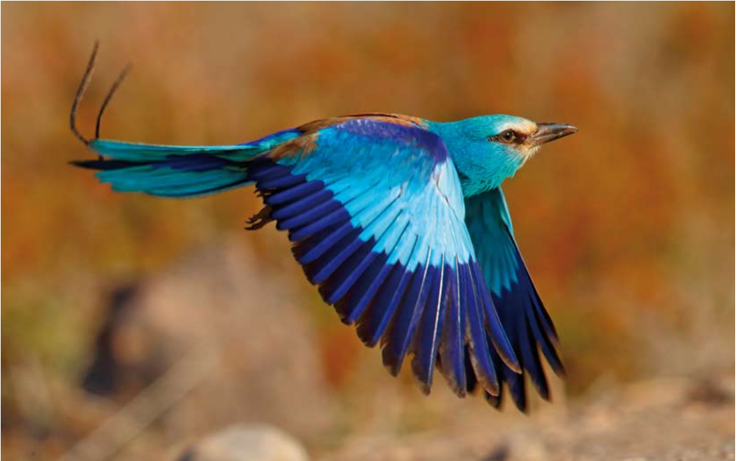
350 Abyssinian Roller / Sahelscharrelaar Coracias abyssinica , adult, Barranco de la Torre, Antigua, Fuerteventura, Canary Islands, 14 June 2014 ( Juan Sagardía )