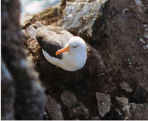
306 Black-browed Albatross / Wenkbrauwalbatros Thalassarche melanophris , adult, Hermaness, Unst, Shetland, Scotland, 8 April 1985

regularly recorded so there must be a steady influx of new birds. It is unknown if any of the birds have successfully found their way back to the Southern Hemisphere.