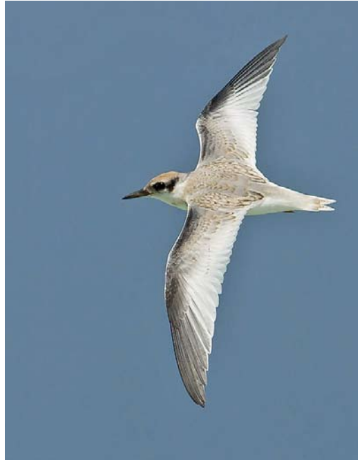
344 Saunders's Tern / Saunders' Dwergstern Sternula saundersi , adult, Ras Sudr, Sinai, Egypt, 5 July 2014 ( Kris De Rouck ) 345 Saunders's Tern / Saunders' Dwergstern Sternula saundersi , juvenile, Ras Sudr, Sinai, Egypt, 6 July 2014 ( Kris De Rouck ) 346 White-backed Vulture / Witruggier Gyps africanus (left), Rüppell's Vulture / Rüppells Gier G. rueppelli (centre) and Griffon Vulture / Vale Gier G. fulvus , Tétouan, High Rif, Morocco, 25 May 2014 ( Rachid El Khamlichi ) cf Dutch Birding 36: 200, 2014