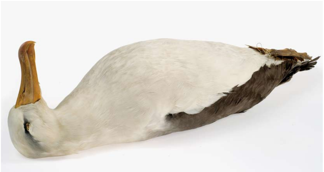
307 Black-browed Albatross / Wenkbrauwalbatros Thalassarche melanophris , adult female (collected on Mykines-hólmi, Mykines, Faeroes, on 11 May 1894), Zoological Museum, København, Denmark, 21 May 2008

Apart from Black-browed Albatross, three other albatross species have been recorded in the WP, but in much smaller numbers (cf Haas 2012). Atlantic Yellow-nosed Albatross T chlororhynchos has been recorded in England (June-July 2007), Faeroes (July 2012), Norway (April 1994 and June-July 2007) and Sweden (July 2007, considered same individual as in England; Gantlett & Pym 2007). Shy Albatross T cauta has been recorded once, in February-March 1981 (bird staying off the coast of Sinai,