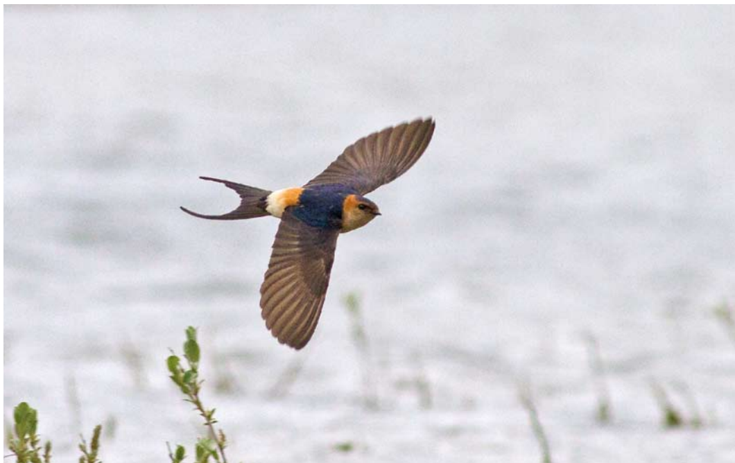
377 Roodstuitzwaluw / Red-rumped Swallow Cecropis daurica , Vogelmeer, Bloemendaal, Noord-Holland, 8 mei 2014 ( Herman Bouman ) 378 Roodstuitzwaluw / Red-rumped Swallow Cecropis daurica , met Boerenzwaluw / Barn Swallow Hirundo rustica en Huiszwaluw / Eurasian House Martin Delichon urbicum , Vogelmeer, Bloemendaal, Noord-Holland, 8 mei 2014 ( Arnoud B van den Berg )