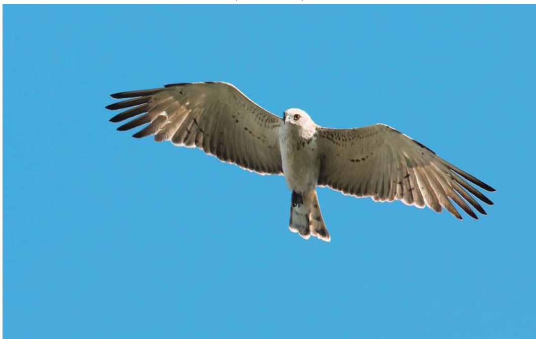
364 Slangenarend / Short-toed Snake Eagle Circaetus gallicus , Holterberg, Overijssel, 8 juni 2014 ( Edwin Winkel )