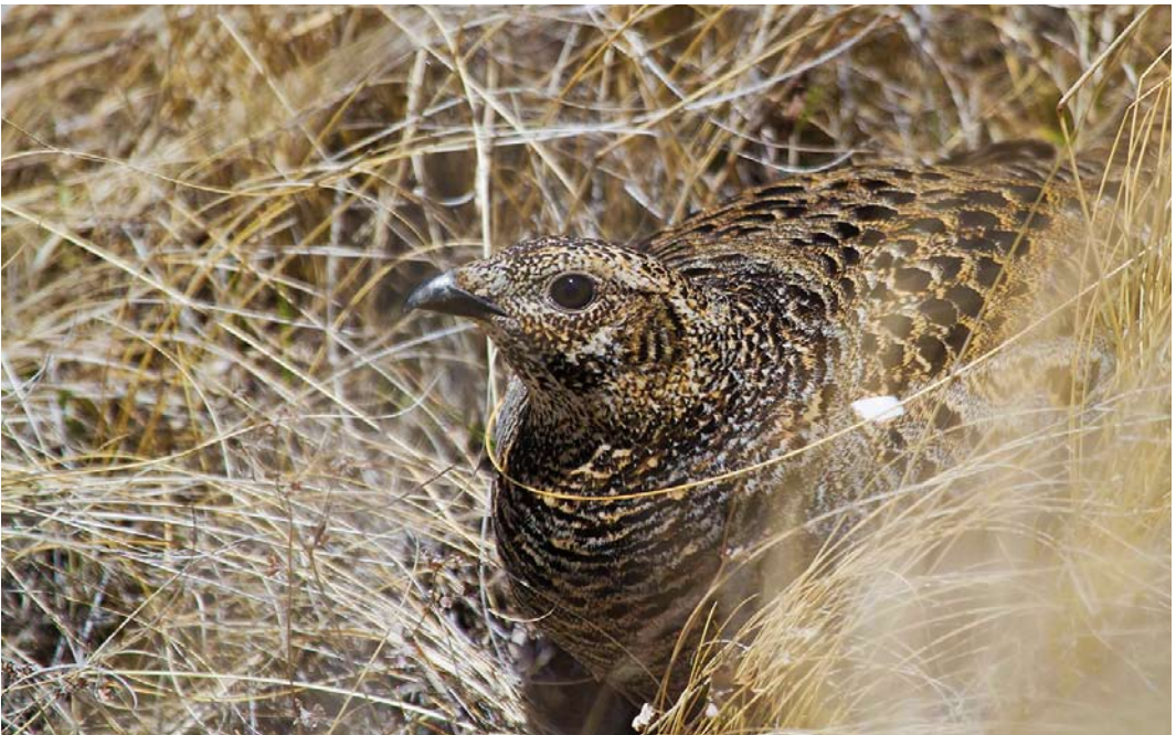
343 Caucasian Grouse / Kaukasisch Korhoen Tetrao mlokosiewiczzi, female, Kazbegi, Georgia, 30 April 2014