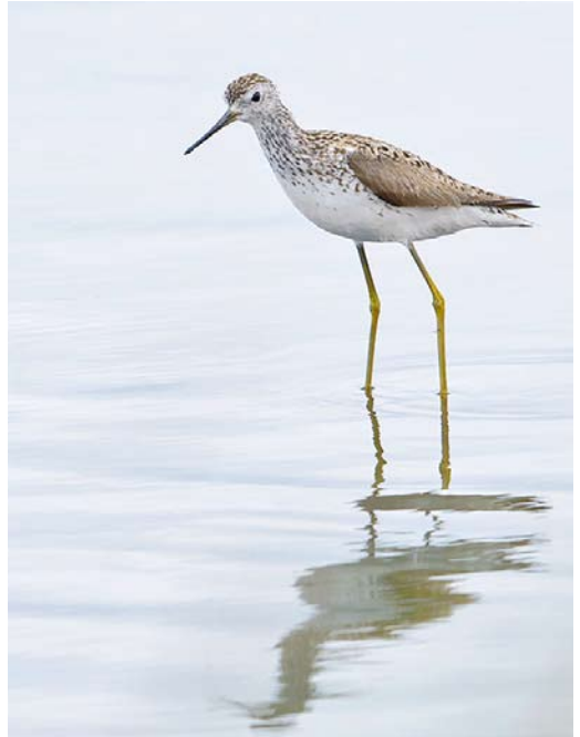
365 Kwartelkoning / Corn Crake Crex crex , Buggenum, Limburg, 9 juni 2014 366 Poelruiter / Marsh Sandpiper Tringa stagnatilis , zomerkleed, Stinkgat, Tholen, Zeeland, 20 juni 2014 367 Ralreiger / Squacco Heron Ardeola ralloides , adult zomerkleed, Bovenmeent, Hilversum, Noord-Holland, 7 juni 2014