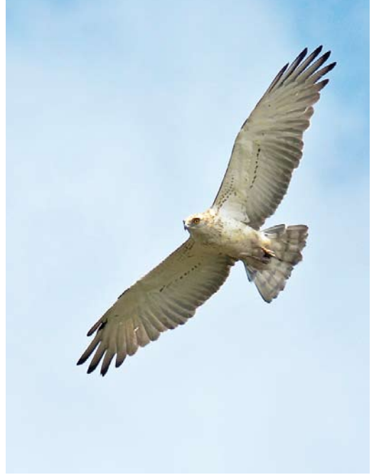
347 Short-toed Snake Eagle / Slangenarend Circaetus gallicus , Kalkense Meersen, Oost-Vlaanderen, Belgium, 19 July 2014 348 Short-toed Snake Eagle / Slangenarend Circaetus gallicus , third calendar-year, Ashdown Forest, East Sussex, England, 18 June 2014 349 Short-toed Snake Eagle / Slangenarend Circaetus gallicus , third calendar-year, Pig Bush area, Hampshire, England, 1 July 2014