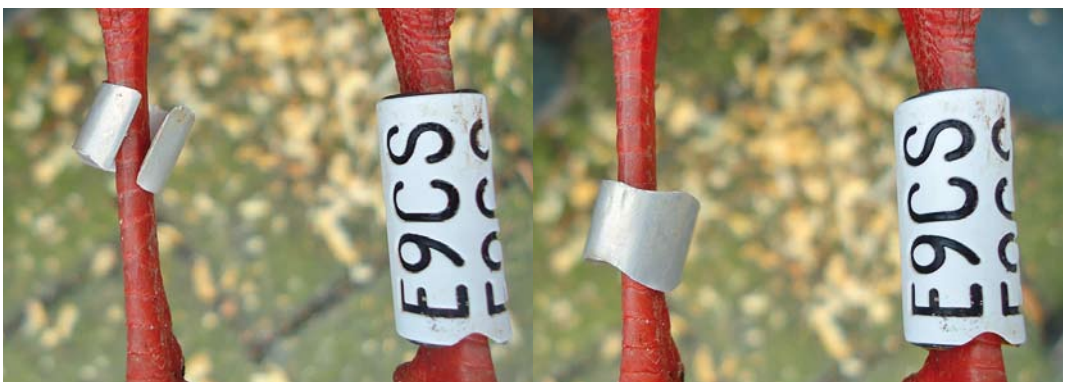
FIGURE 2 Aluminium ring Helgoland 5308939 of Black-headed Gull Larus ridibundus , 7 years, 11 months and 26 days after ringing on right tarsus (Henri Zomer). Photographs taken during retrap in Groningen, Groningen, Netherlands, on 17 January 2014; bird had been ringed as second calendar-year in Hamburg, Hamburg, Germany, on 22 January 2006.

On 9 February 1985, the late Klaas Visser ringed an adult (older than second calendar-year) Black-headed Gull with ring Arnhem 3.398.919 along Hilversumsch Kanaal east of Kortenhoef, Noord-Holland, the Netherlands (52°13'N, 05°07'E). The bird was not reported for the next 23 years. On 27 March 2008, KvD observed the bird in the city of Groningen, where he saw it again on 24-27 June 2010, and it was trapped there by Rob Voesten on 28 June 2010. The ring was gaping and the second digit of the ring number was difficult to read (figure 3). Based on biometrics, he identified it as a male (cf Palomares et al 1997). The ring was replaced by a stainless steel ring Arnhem 3.693.294 on the tarsus and a colour-ring white E6EM was