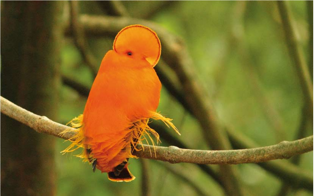
328-329 Guianan Cock-of-the-rock / Oranje Rotshaan Rupicola rupicola , male, Raleigh Falls, Central Suriname Nature Reserve, Suriname, 19 November 2011 (Roland Wantia) 330 Guianan Cock-of-the-rock / Oranje Rotshaan Rupicola rupicola , female, Raleigh Falls, Central Suriname Nature Reserve, Suriname, 19 November 2011 (Roland Wantia)