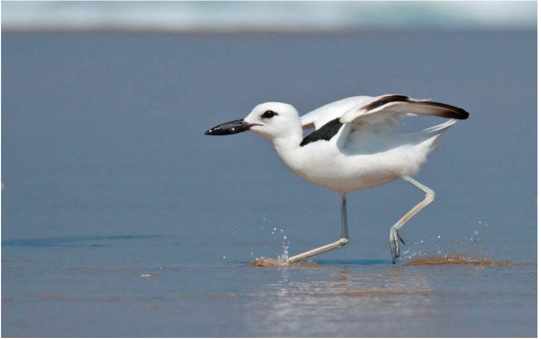
337-338 Crab Plover / Krabplevier Dromas ardeola , adult, Ma'agan Michael, Israel, 26 June 2014