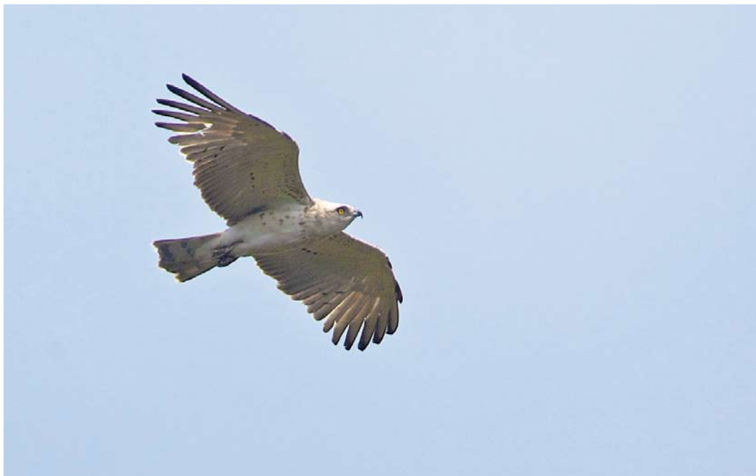
363 Slangenarend / Short-toed Snake Eagle Circaetus gallicus , Holterberg, Overijssel, 9 juni 2014 ( Martin van der Schalk )