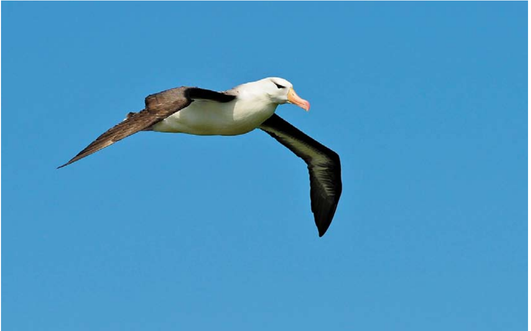
298 Black-browed Albatross / Wenkbrauwalbatros Thalassarche melanophris , adult, Helgoland, Schleswig-Holstein, Germany, 29 May 2014 (Roef Mulder)