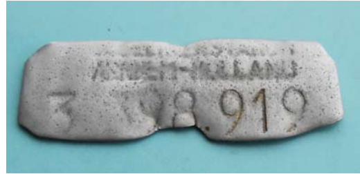
FIGURE 3 Aluminium ring Arnhem 3.398.919 of Black-headed Gull Larus ridibundus, 25 years, 4 months and 19 days after ringing on right tibia. Ring replaced on 28 June 2010, last observation of bird on 15 March 2014. Ringed as adult (after second calendar-year) near Kortenhoeft, Noord-Holland, Netherlands, on 9 February 1985.

We thank Vogeltrekstation Arnhem for the ringing permits and Natuurmonumenten for their support to do research on Griend. We also thank all those