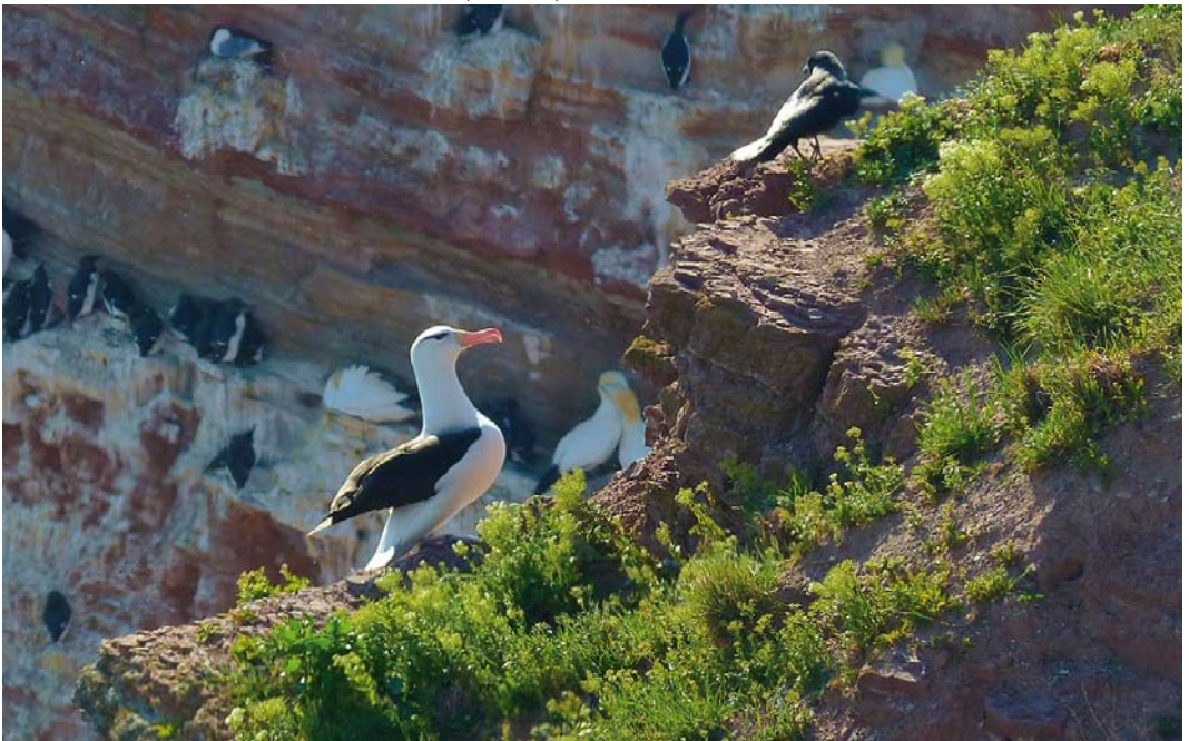
299 Black-browed Albatross / Wenkbrauwalbatros Thalassarche melanophris , adult, Helgoland, Schleswig-Holstein, Germany, 29 May 2014 (Felix Jachmann)