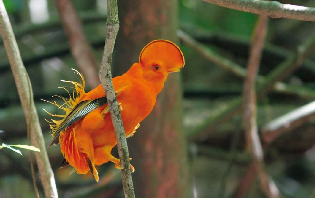
325-327 Guianan Cock-of-the-rock / Oranje Rotshaan Rupicola rupicola , male, Raleigh Falls, Central Suriname Nature Reserve, Suriname, 19 November 2011