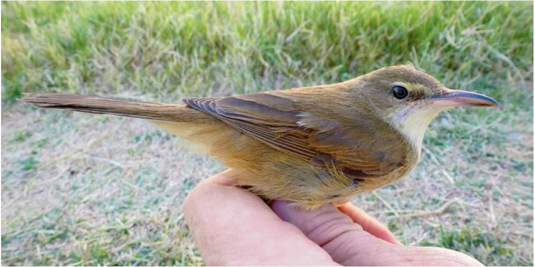
324 Clamorous Reed Warbler / Indische Karekiet Acrocephalus stentoreus stentoreus , Wawa, Sudan, 18 April 2013

as a deliberate search for this species in Sudan has not been conducted before.