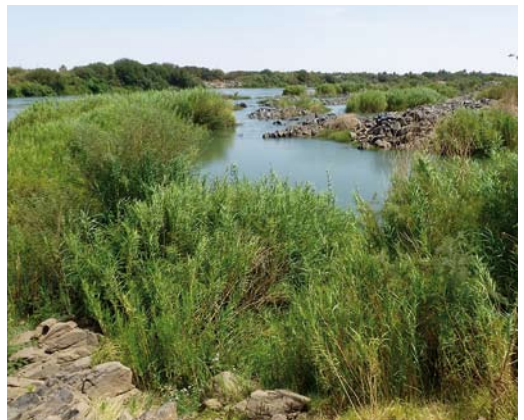
318 Phragmites islands at Third Cataract near Sabu, Sudan, 17 April 2013 ( Jens Hering ) 319 Phragmites islands at Third Cataract near Sabu, Sudan, 17 April 2013 ( Jens Hering ) 320-321 Clamorous Reed Warbler / Indische Karekiet Acrocephalus stentoreus stentoreus , Third Cataract near Sabu, Sudan, 17 April 2013 ( Jens Hering ) 322 Phragmites islands at Merowe dam, Sudan, 22 April 2013 ( Jens Hering )