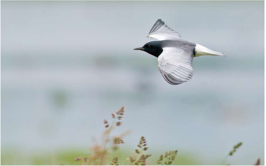
379 Witvleugelstern / White-winged Tern Chlidonias leucopterus , adult, Zuidlaardermeer-Oostpolder, Groningen, 1 juni 2014 ( Sander Bot ) 380 Zwarte Ooievaar / Black Stork Ciconia nigra , tweede-kalenderjaar, De Cocksdorp, Texel, Noord-Holland, 17 mei 2014 ( René Pop ) 381 Witvleugelsterns / White-winged Terns Chlidonias leucopterus , adult en twee jongen, Zuidlaardermeer-Oostpolder, Groningen, 12 juli 2014 ( Jan den Hertog )