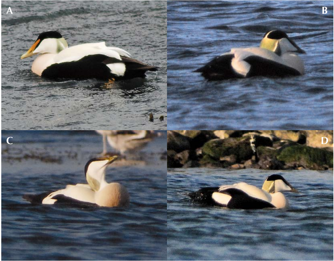
FIGURE 4 Common Eiders / Eiders Somateria mollissima , males. A S m borealis , Iceland, 29 April 2007 (Alexander Hellquist); B-D three different displaying S m mollissima , Gotland, Sweden, 17 April 2012 ( B ) and 28 April 2012 ( C-D ), respectively (Alexander Hellquist). As birds in 4B and 4C show, sails of mollissima may be similar to those of borealis . However, normally they appear as subtle rounded protrusions, as in 4D. Note differences in head shape and straight demarcation between cap and face in borealis .

figure 4). Among Baltic birds, this mostly happens during display but sometimes also in other times of the year, perhaps with a slightly higher frequency in early autumn when the scapulars are newly moulted. Borealis normally show prominent sails throughout the whole year.