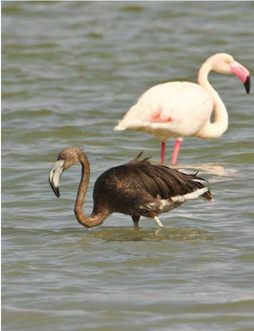
309 Melanistic Greater Flamingo / melanistische Flamingo Phoenicopterus roseus , with normally coloured individual, Eilat, Israel, 26 March 2013 (Steve Arlow)