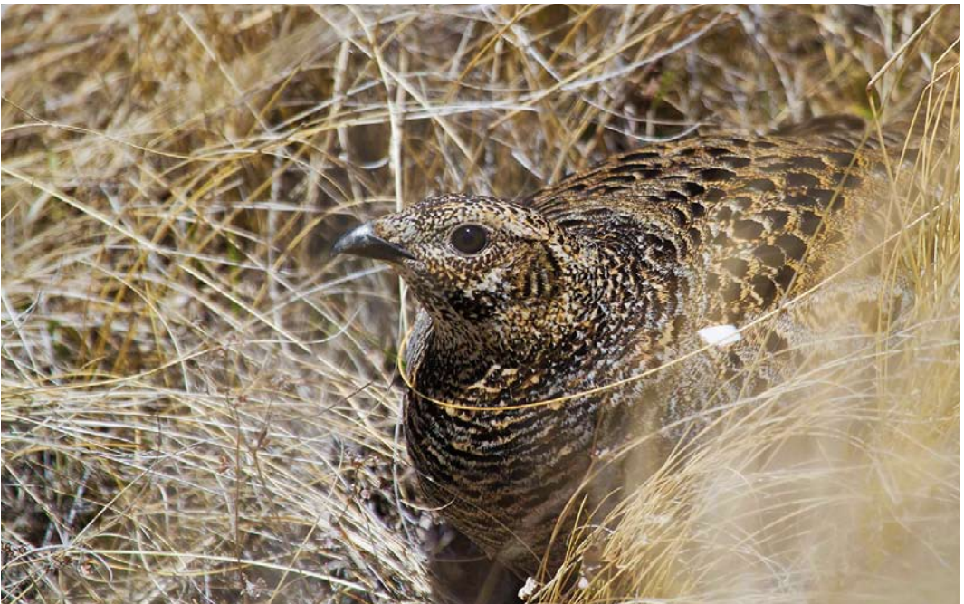
343 Caucasian Grouse / Kaukasisch Korhoen Tetrao mlokosiewiczi, female, Kazbegi, Georgia, 30 April 2014