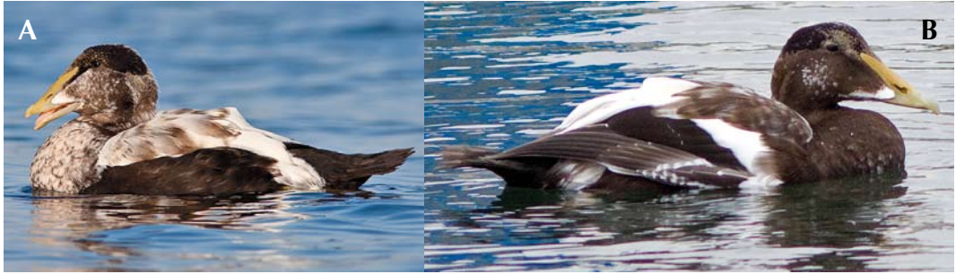
FIGURE 6 Common Eiders / Eiders Somateria mollissima . A presumed S m mollissima , second calendar-year male, east coast, Sweden, 20 October 2009; B presumed mollissima , adult male, west coast, Sweden, 12 September 2013. Sails and to some extent bill colour bring borealis to mind but are within variation of mollissima . Position of nostril fits mollissima better, as does forehead shape. Bird in 6A is in eclipse plumage, not uncommon in males that linger along Swedish coasts in late October. Bird in 6B illustrates how challenging identification can be. It held its sails erect most of the time over period of several weeks. Furthermore, in some photographs, outer webs appear to have pointed tips.

when looking at forehead shape, with birds from the Baltic/Wadden Sea flyway population being most distinct from borealis in this respect. Depending on which features are more important as isolating factors, the definition of the subspecies might deserve further exploration, given also that the genetic relationships need clarification.