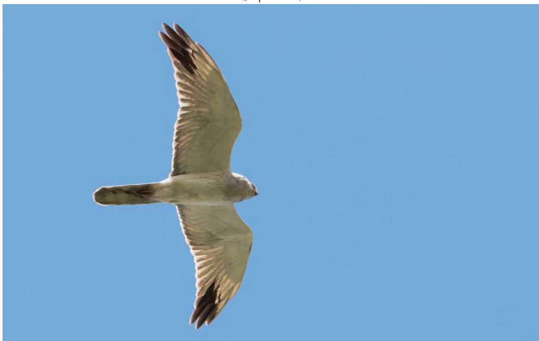
360 Steppekiekendief / Pallid Harrier Circus macrourus , subadult mannetje, Finsterwolde, Groningen, 16 mei 2014 (Jaap Denee)