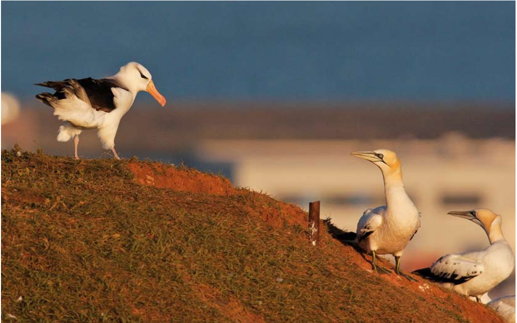
341 Black-browed Albatross / Wenkbrauwalbatros Thalassarche melanophris , adult, with Northern Gannets / Jan-van-rogenen Morus bassanus , Helgoland, Schleswig-Holstein, Germany, 12 June 2014

there was also a rapid increase to 21-24 pairs, raising 15 young in 2013 (Dansk Ornithol Foren Tidsskr 108: 157-163, 2014). The first nesting of the species for England was in 1979 in Norfolk, where the numbers gradually increased since, while recent nesting in western England relates to (re)introductions. In the Netherlands, where the species bred for the first time in 2001, 44 wild-origin individuals were present since March at Fochteloërveen, Drenthe/Friesland, including nine pairs of which six successfully raised young.