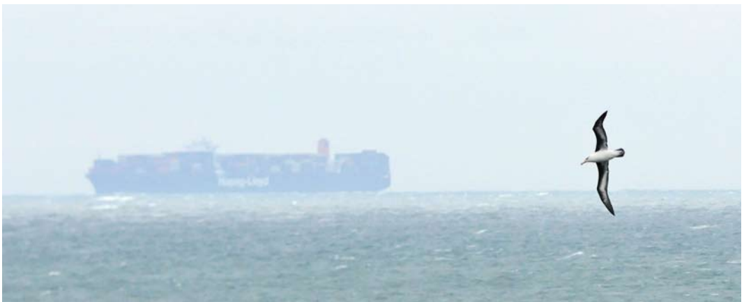
305 Black-browed Albatross / Wenkbrauwalbatros Thalassarche melanophris , adult, Helgoland, Schleswig-Holstein, Germany, 28 May 2014

Figure 1 shows all WP records and reports per year. A steady increase since c 1980 is clearly vis-