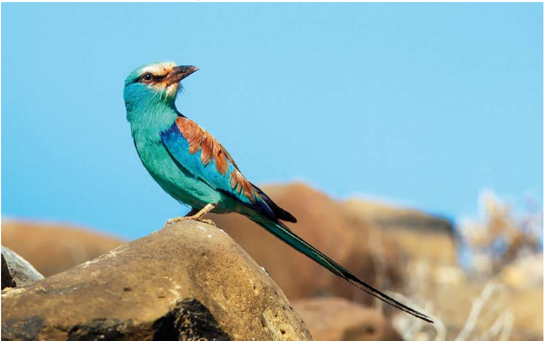
351 Abyssinian Roller / Sahelscharrelaar Coracias abyssinica , adult, Barranco de la Torre, Antigua, Fuerteventura, Canary Islands, 16 June 2014 ( David Pérez )