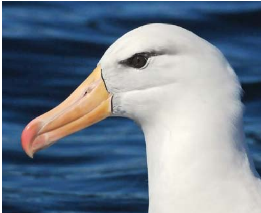
303 Black-browed Albatross / Wenkbrauwalbatros Thalassarche melanophris , adult, off Wollongong, New South Wales, Australia, 25 August 2013 (Roef Mulder)