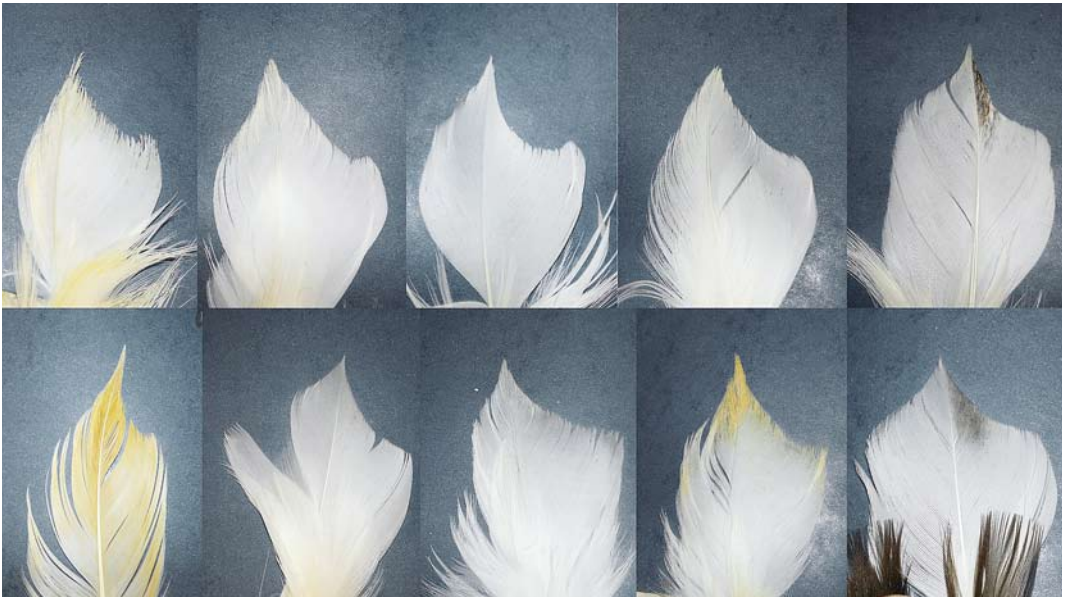
FIGURE 3 Lower scapulars that form sails in males Common Eider / Eider Somateria mollissima . Above: four adult (fourth calendar-year or older) and one third calendar-year (right) S m mollissima , Sweden, spring. Below from left to right: two adult S m borealis from Greenland, spring, two adult borealis from Svalbard, spring, and one second calendar-year from Iceland, September. In borealis , it is more common for tip of outer webs to be pointed, and webs are slightly broader on average but differences between subspecies are very small. Second generation of lower scapulars (in second calendar-year autumn to third calendar-year spring birds) have dark markings (if attained early they can be mostly dark).

The major difference between borealis and mollissima lies in behaviour rather than in appearance. Borealis is much more prone to erect its sails. In mollissima , the lower scapulars are regularly lifted slightly along the shafts but the outer webs are drooping, creating gently bulging humps on the lower back rather than sails. However, mollissima occasionally erects the outer webs and may then match the appearance of borealis (see