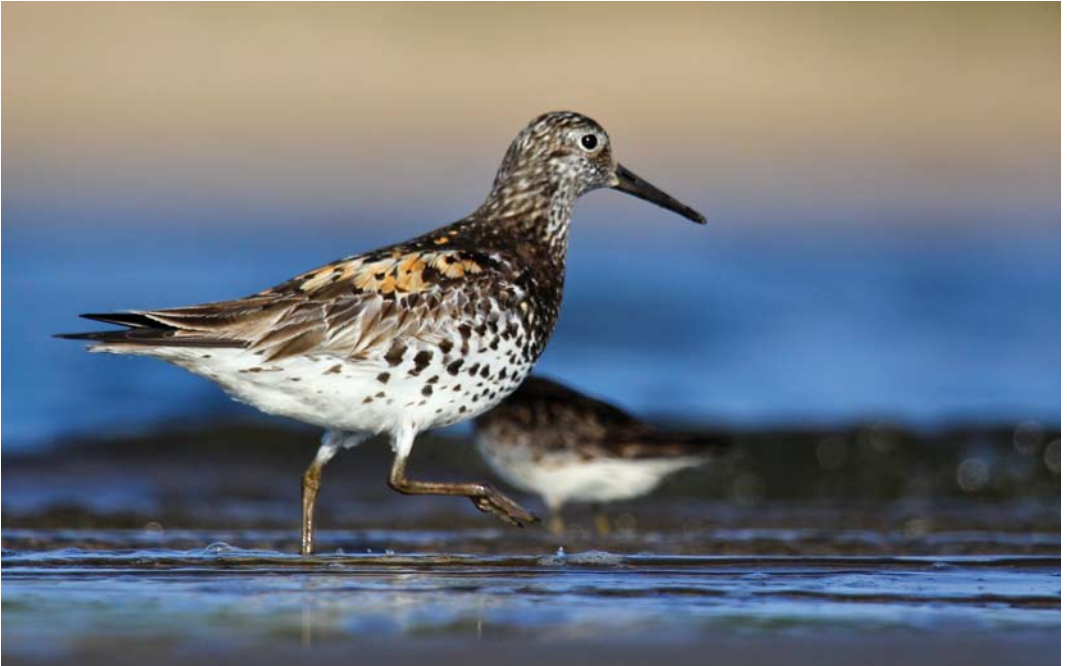
339 Great Knot / Grote Kanoet Calidris tenuirostris , adult summer, Vistula mouth, Pomerania, Poland, 17 July 2014