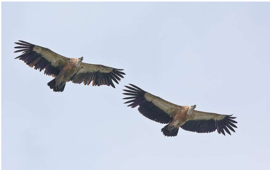
359 Vale Gieren / Griffon Vultures Gyps fulvus , Korendijkse Slikken, Zuid-Holland, 7 juni 2014