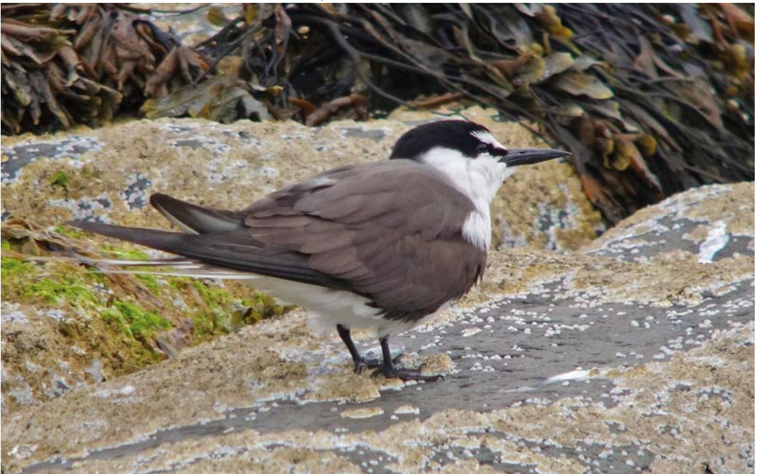
340 Bridled Tern / Brilstern Onychoprion anaethetus , adult summer, Inner Farne, Northumberland, England, 6 July 2014 (Paul Hackett)