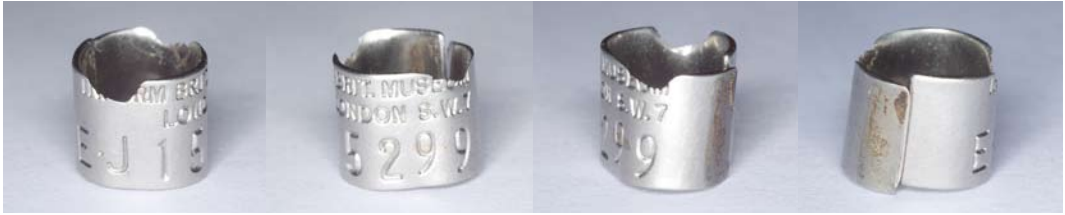
FIGURE 1 Incoloy ring London EJ15299 of Black-headed Gull Larus ridibundus , 32 years, 4 months and 9 days after ringing on tarsus (Date Lutterlo). Found dead on Griend, Friesland, Netherlands, on 21 May 2012.

1980. It was thus born in 1979 but the place of birth and the precise date of birth are unknown. The bird had reached an age of 33 years when it died. Currently, this individual is the oldest known Black-headed Gull (cf van Dijk et al 2012).