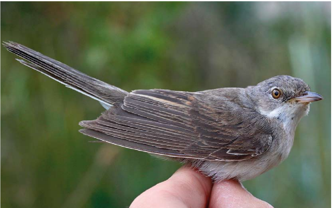
353 Asian Common Whitethroat / Oostelijke Grasmus Sylvia communis icterops/rubicola , Blåvand, Vestjylland, Denmark, 4 June 2014