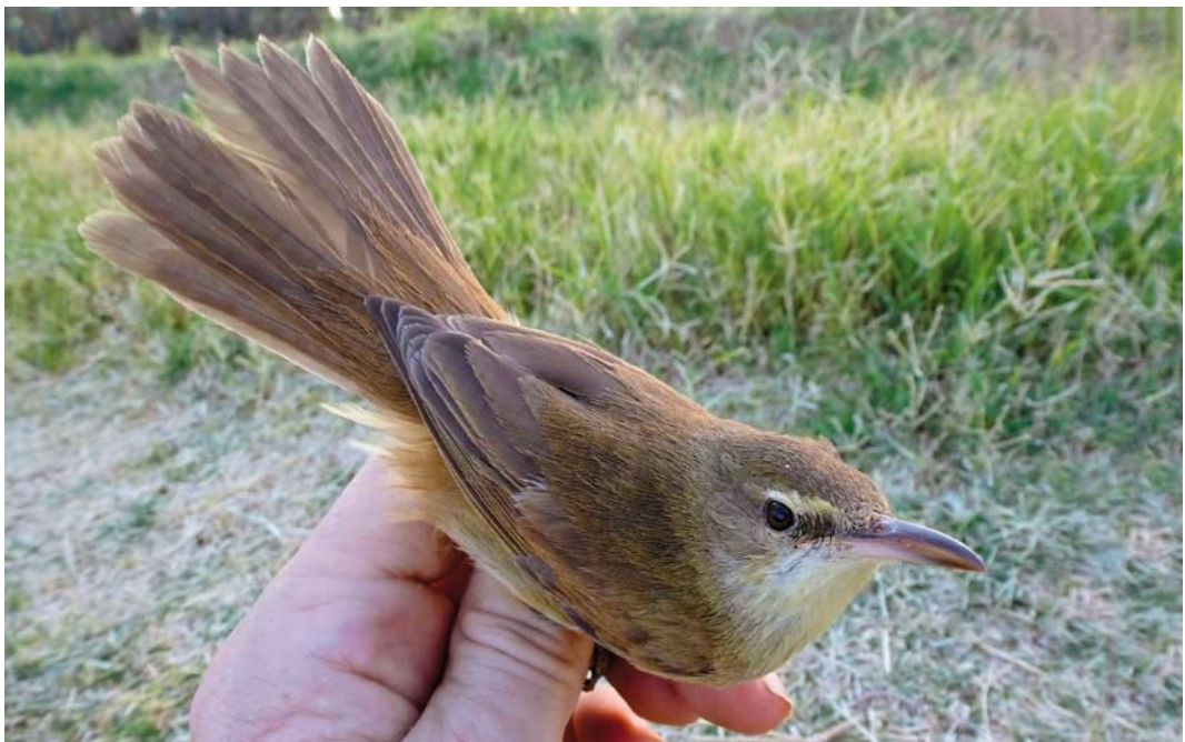
323 Clamorous Reed Warbler / Indische Karekiet Acrocephalus stentoreus stentoreus , Wawa, Sudan, 18 April 2013 (Jens Hering)

Nile in Abu Gussi near Debba in Sudan in mid-September 1986. The now available breeding records from Sudan show that the nominate subspecies also occurs several 100s of kilometres upstream along the Nile and it is consequently also an Afrotropical (Ethiopian) breeding species. The distance between the previous most southerly find at Wadi Halfa and the Merowe dam is c 700 km measured along the course of the river (c 370 km linear distance). The species very probably also occurs further upstream. The question whether the new occurrences represent a southward expansion or 'old' breeding grounds must remain open,