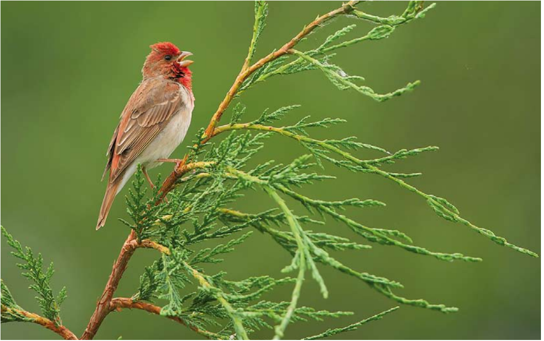
385 Roodmus / Common Rosefinch Erythrina erythrina , adult mannetje, Katwijk, Zuid-Holland, 26 mei 2014 386 Kleine Vliegenvanger / Red-breasted Flycatcher Ficedula parva , adult mannetje, Castricum, Noord-Holland, 2 juni 2014 387 Roodmus / Common Rosefinch Erythrina erythrina , adult mannetje, Dishoek, Zeeland, 30 mei 2014