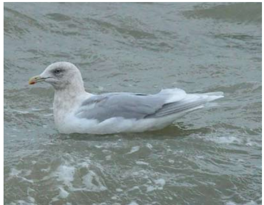
314-317 Kumliens Meeuw / Kumlien's Gull Larus glaucooides kumlieni , adult, Scheveningen, Den Haag, Zuid-Holland, 24 december 2013 (Vincent van der Spek)