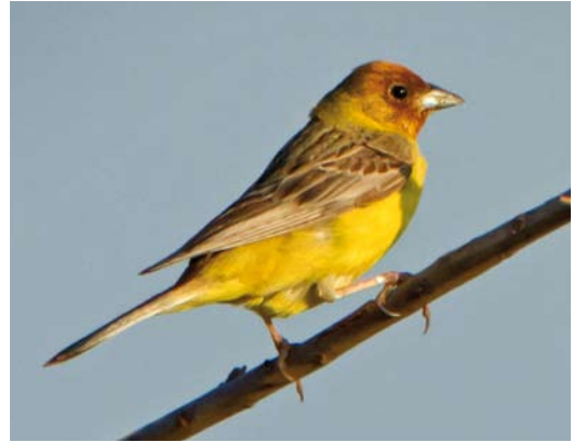
356 Red-headed Bunting / Bruinkopgors Emberiza bruniceps , male, Westkapelle, Zeeland, Netherlands, 24 July 2014

354, plate 454, 2013). A Sardinian Warbler S melanocephala turned up on Rott, Rogaland, Norway, on 11 July. An Asian Common Whitethroat S communis icterops/rubicola was trapped on Blåvand, Ribe, Denmark, on 4 June. Between 28 June and 21 July, at least 10 Lanceolated Warblers Locustella lanceolata were singing in Finland. A Saharan Olivaceous Warbler Iduna pallida reiseri photographed at Barranco de la Torre on 14 June was the first for the Canary Islands. From mid-May, an influx of Blyth's Reed Warbler A dumetorum occurred in north-western Europe, with record numbers of singing males in, eg, Britain (c 20), Denmark (16), Germany and the Netherlands (five; the earliest ever) and also one in France (in Meurthe-et-Moselle on 8-15 June). The first for Romania was trapped at Sfântu Gheorghe, Danube delta, on 23 May. DNA analyses of 348 Eurasian Reed Warblers A scirpaceus trapped for ringing in Germany showed that one was a Caspian Reed Warbler A s fuscus , the first evidence of this Asian subspecies in Central Europe (see Arabi et al 2014, Ibis Early Online: http://tinyurl.com/not5np9 ); moreover, DNA sequences demonstrated that no less than 6.8% of Eurasian Reed were misidentified at the species level, Marsh Warbler A palustris accounting for most of the misidentified birds.