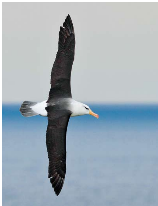
295 Black-browed Albatross / Wenkbrauwalbatros Thalassarche melanophris , adult, Helgoland, Schleswig-Holstein, Germany, 28 May 2014 296 Black-browed Albatross / Wenkbrauwalbatros Thalassarche melanophris , adult, Helgoland, Schleswig-Holstein, Germany, 5 June 2014 297 Black-browed Albatross / Wenkbrauwalbatros Thalassarche melanophris , adult, Helgoland, Schleswig-Holstein, Germany, 12 June 2014