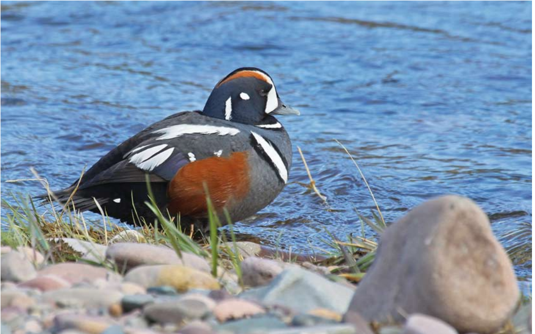
342 Harlequin Duck / Harlekijneend Histrionicus histrionicus , adult male, Sandfjord, Varanger, Finnmark, Norway, 16 June 2014 (Ton Eggenhuizen)