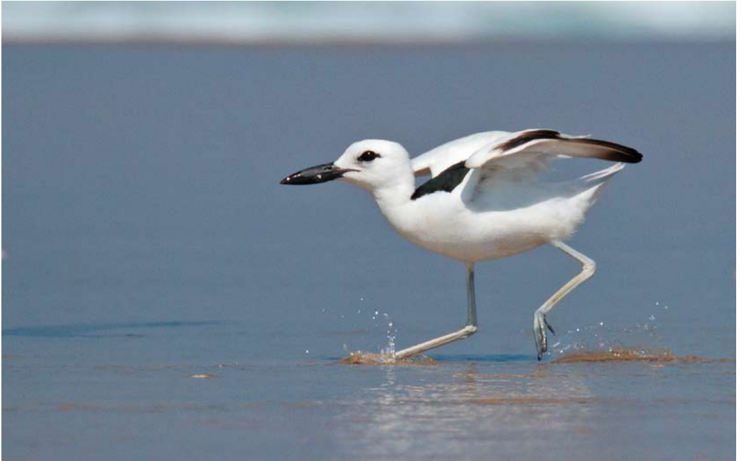
337-338 Crab Plover / Krabplevier Dromas ardeola , adult, Ma'agan Michael, Israel, 26 June 2014