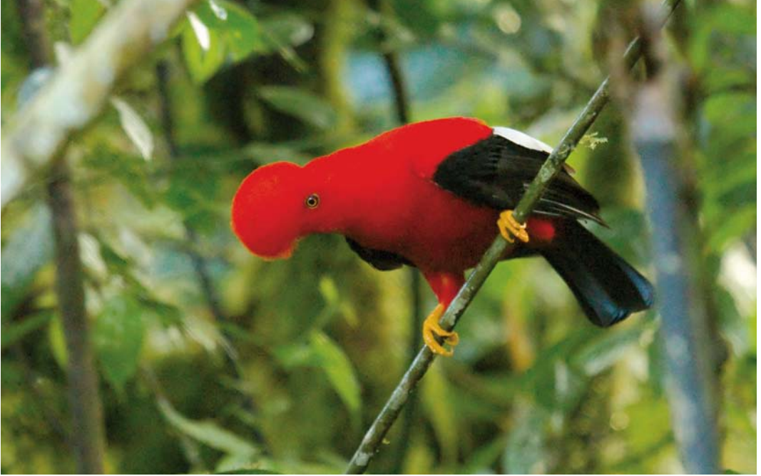
331-332 Andean Cock-of-the-rock / Rode Rotshaan Rupicola peruviana sanguinolentus male, Refugio Paz de las Aves, Pichincha, Ecuador, 13 July 2013 (Dušan M Brinkhuizen) 333 Andean Cock-of-the-rock / Rode Rotshaan Rupicola peruviana aequatorialis , female, Paquisha, Zamora-Chinchipe, Ecuador, 2 August 2013 (Dušan M Brinkhuizen)