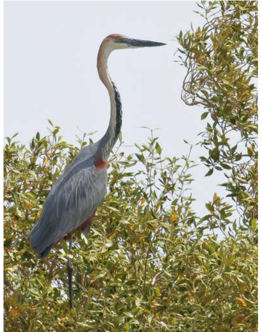
245 Pacific Eider / Pacifische Eider Somateria mollissima v-nigrum , adult male, with Common Eiders / Eiders S. mollissima and King Eiders / Koningseiders S. spectabilis , Vardø, Finnmark, Norway, 21 March 2014 (Tormod Amundsen) 246 Goliath Heron / Reuzenreiger Ardea goliath , adult, Hamata, Egypt, 16 April 2014 (Kris De Rouck) 247 Green Heron / Groene Reiger Butorides virescens , second calendar-year, São Miguel, Azores, 16 April 2014 (Gerbrand Michielsen)