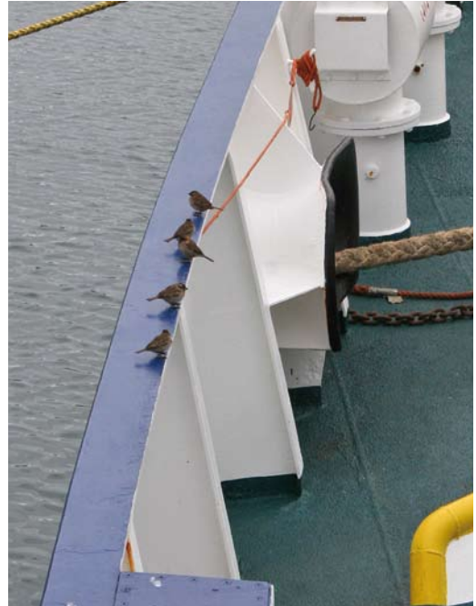
200 Iago Sparrows / Kaapverdische Mussen Passer iagoensis, on board of MV Plancius, Funchal harbour, Madeira, 13 May 2013