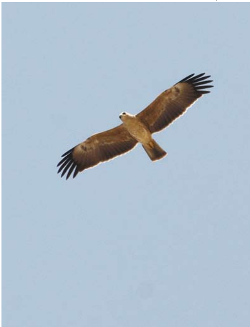
240-241 Wahlberg's Eagle / Wahlbergs Arend Aquila wahlbergi , juvenile, Ras Shuqeir, Eastern Desert, Egypt, 3 May 2013 ( Ahmed Waheed )