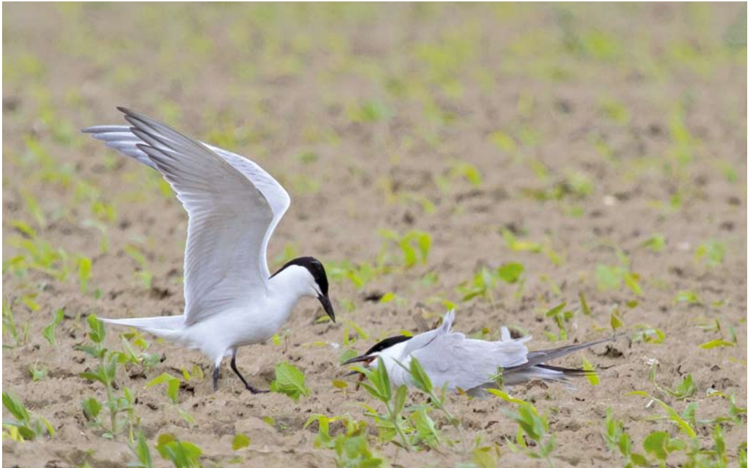
182 Gull-billed Terns / Lachsterns Gelochelidon nilotica , male (left) and female during courtship, Nordkehdingen, Niedersachsen, Germany, 2 June 2013

To improve and develop the conservation plan each year, data on diet and feeding areas are very important. Gull-billed Terns, contrary to other tern species, need inland feeding grounds such as moors and wet meadows with fresh and brackish water. Prey from the sea or salt marshes is normally not taken, especially when they raise their chicks, as the young birds do not tolerate salt. The adults forage in the vicinity of the colony for worms and insects. This is what the young chicks need in their first days. Later, the adults feed their young with mice, frogs and also various young birds. These are collected at up to 5-10 km distance from the colony. A speciality of the Neufelder Gull-billed Terns is catching (introduced) Chinese Mitten Crabs Eriocheir sinensis in the river and the Neufelder harbour, where the birds can be observed extremely well. Because the hinterland of Dithmarschen has less ecological value, the birds fly also to the other side of the Elbe in Niedersachsen, where they can find plenty of lizards.