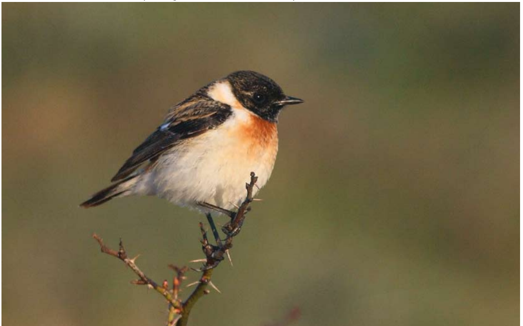
263 Caspian Stonechat / Kaspische Roodborsttapuit Saxicola maurus hemprichii , second calendar-year male, Morups Tånge, Halland, Sweden, 16 April 2014 ( Lasse Olsson )