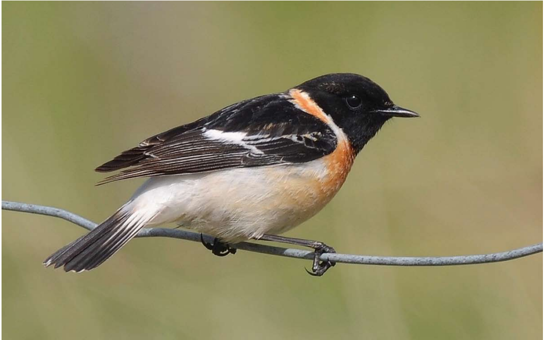
262 Caspian Stonechat / Kaspische Roodborsttapuit Saxicola maurus hemprichii , adult male, Fair Isle, Shetland, Scotland, 30 April 2014