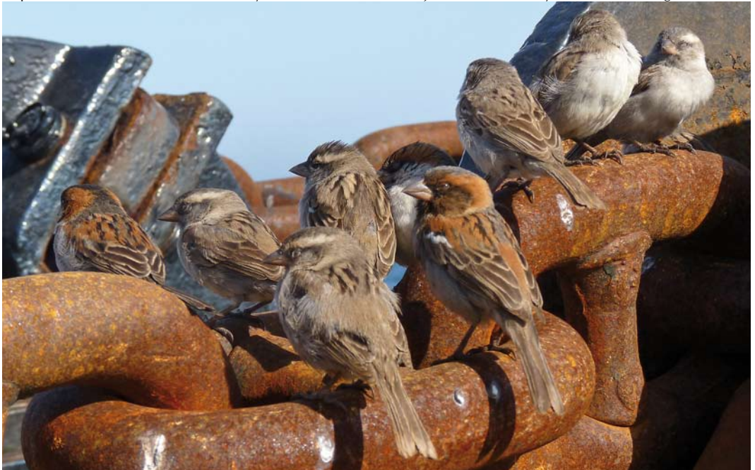
199 Iago Sparrows / Kaapverdische Mussen Passer iagoensis , on board of MV Plancius , Atlantic Ocean between Cape Verde Islands and Desertas, 8 May 2013 ( Nils van Duivendijk ). Note aberrantly coloured male right of centre.